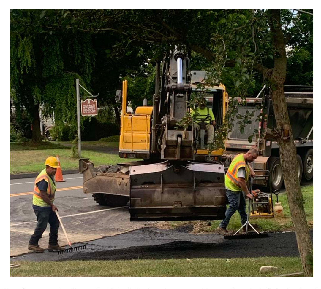
Picture 6: Ludlow Construction is at 253 Main St laying the second layer of asphalt (1 inch of 0.35-inch asphalt aggregate).

Contractor: Ludlow Construction Page: 8 of 8