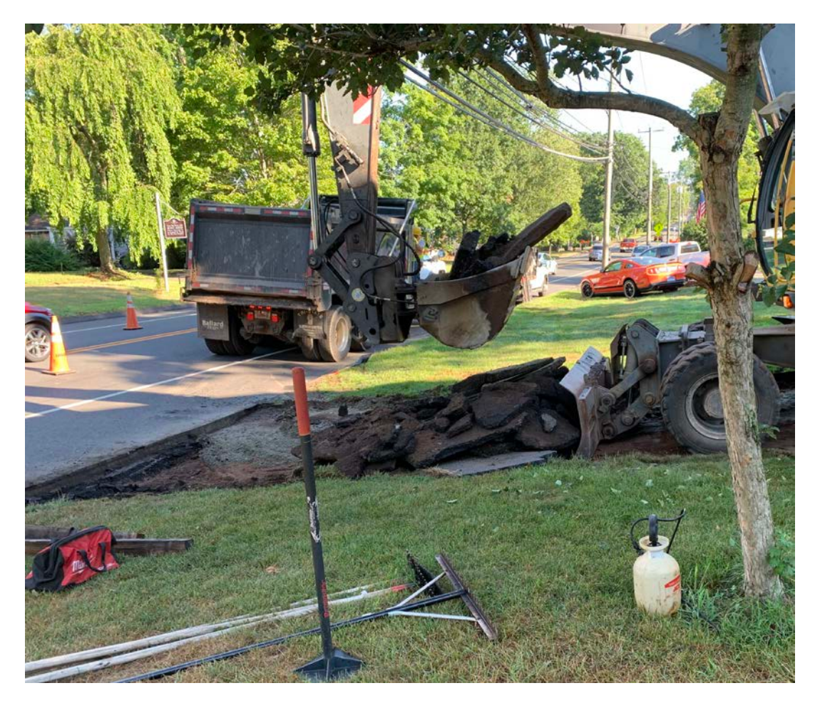
Picture 2: Ludlow Construction is at 253 Main St continuing to remove the blacktop with an excavator and dumping the chunks of blacktop into a dump truck.

Res. Representative: A. Mora Date: 8/3/22