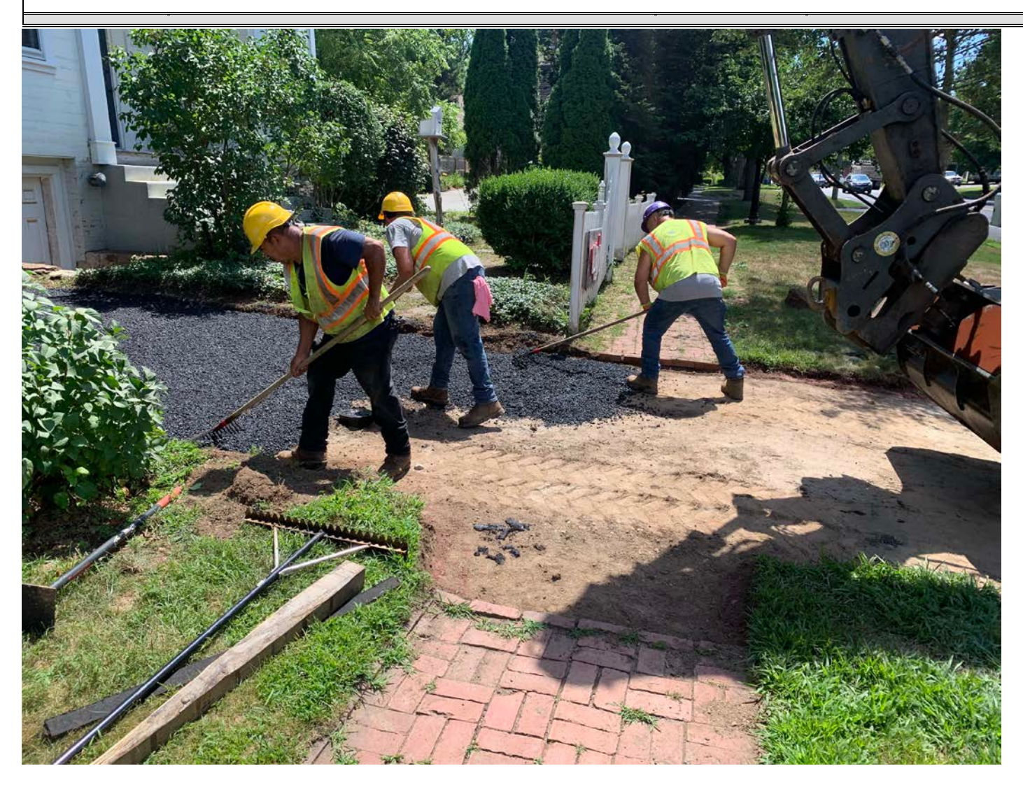
Picture 5: Ludlow Construction is laying the first layer asphalt at 253 Main St. (2 inches of 0.5 inch of aggregate of asphalt).

Contractor: Ludlow Construction Page: 7 of 8