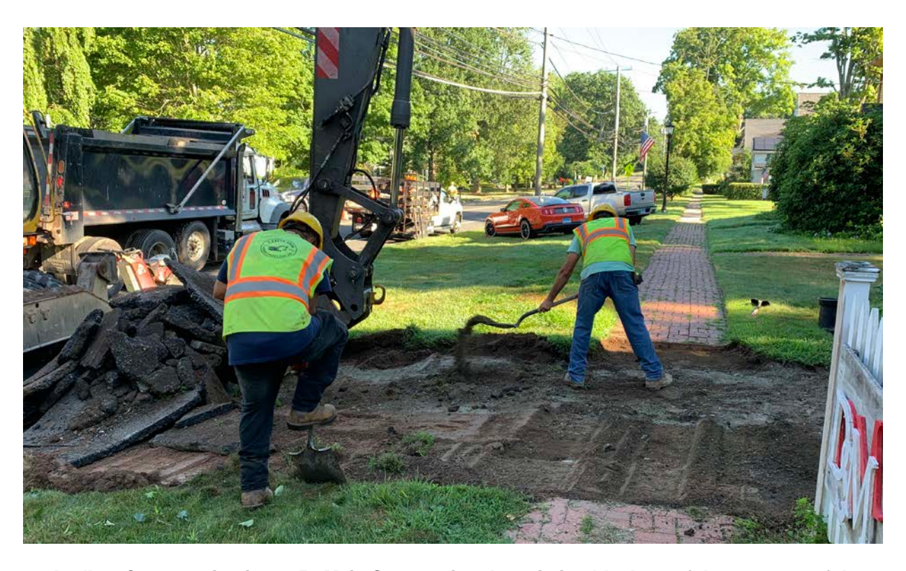
Picture 1: Ludlow Construction is at 253 Main St removing the existing blacktop of the entrance of the driveway using excavator and Ludlow Construction personnel.

Contractor: Ludlow Construction Page: 3 of 8