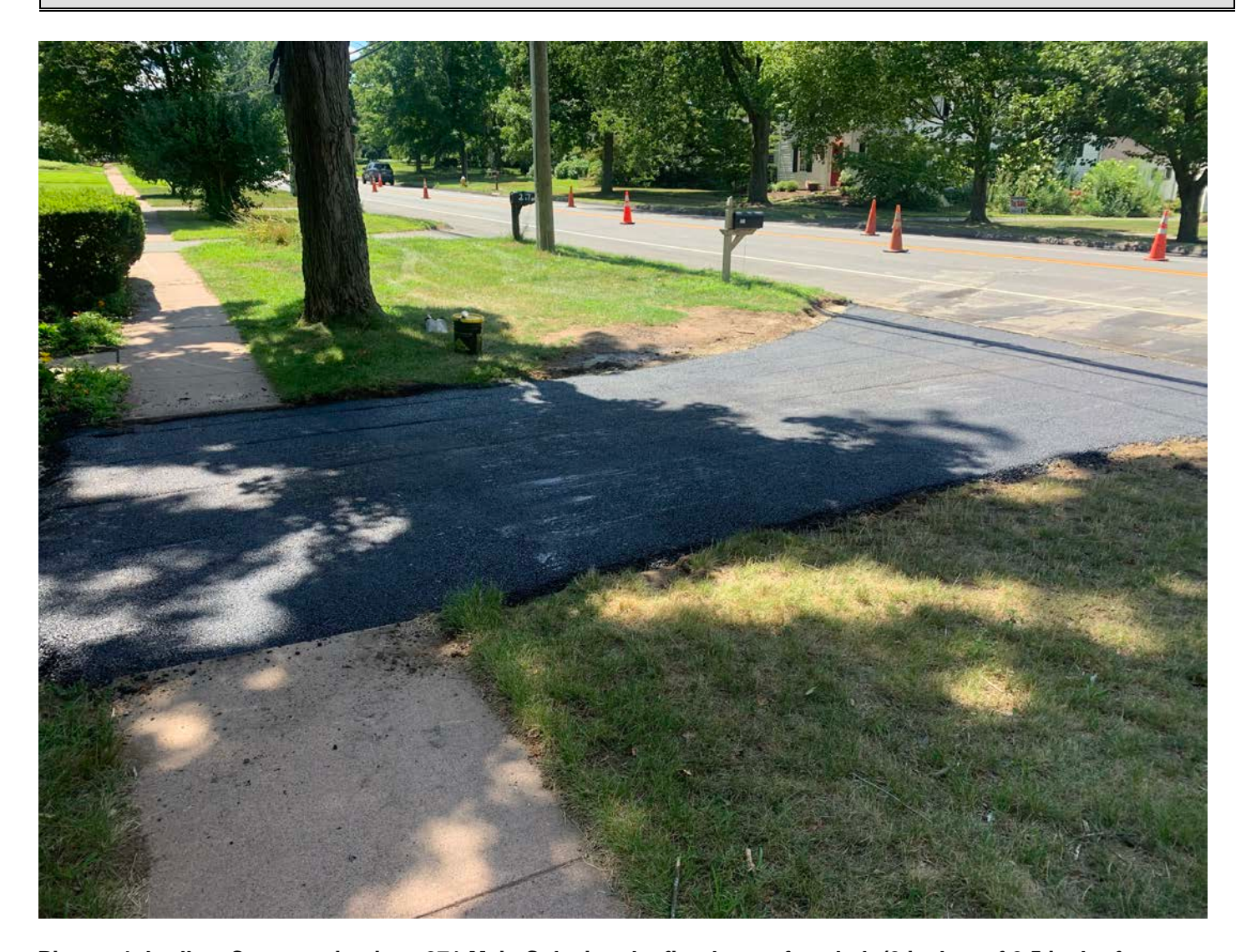
Picture 4: Ludlow Construction is at 271 Main St laying the first layer of asphalt (2 inches of 0.5 inch of aggregate of asphalt).