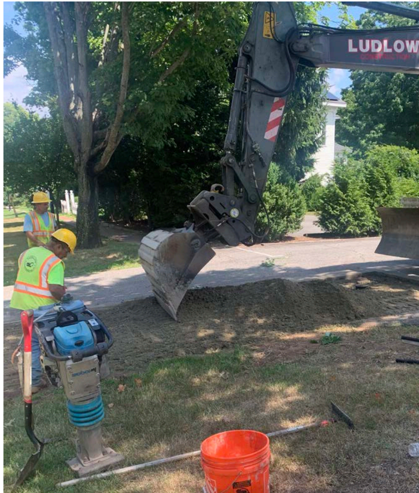
Picture 4: Ludlow Construction is at 243 Main St continuing to add a combination of soil and gravel using an excavator to prepare for asphalt paving.