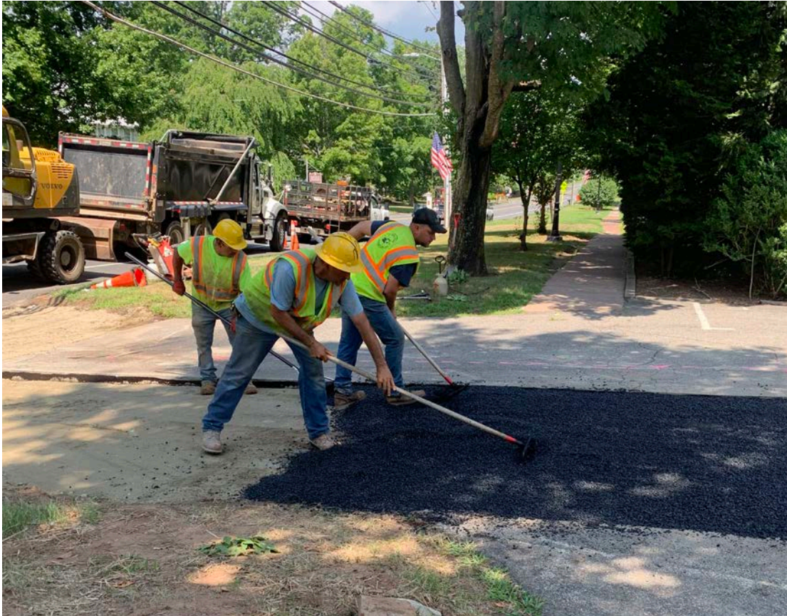
Picture 5: Ludlow Construction is at 243 Main St laying asphalt on the section of blacktop that was previously removed.