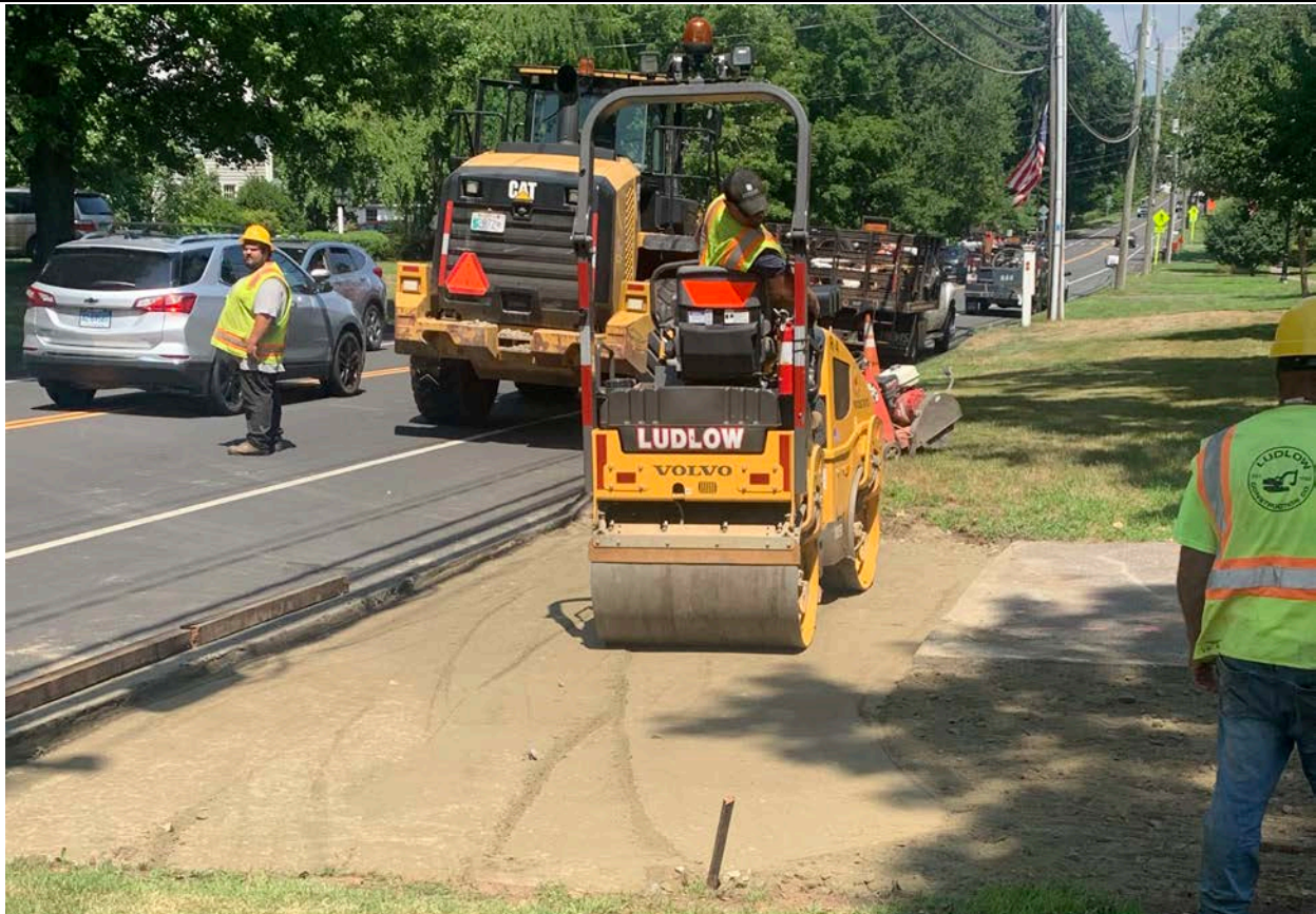
Picture 3: Ludlow Construction is at 243 Main St using a roller to compact the driveway base course in preparation for paving.