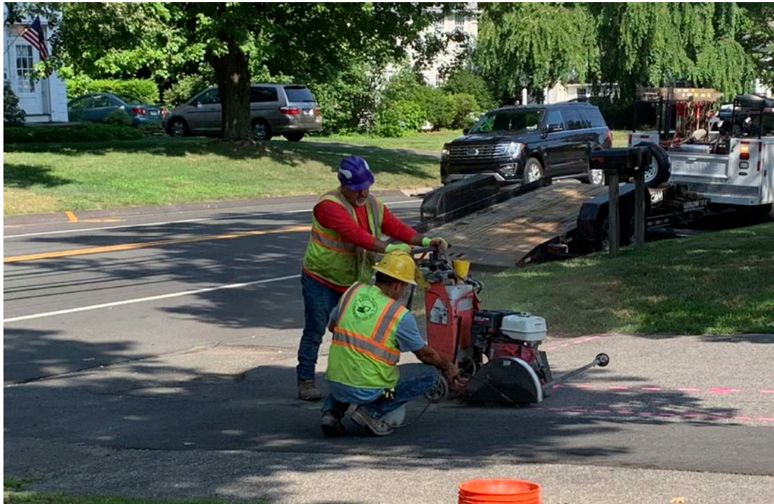
Picture 2: Ludlow Construction is at 243 Main St saw cutting the pavement for permanent driveway pavement repair.