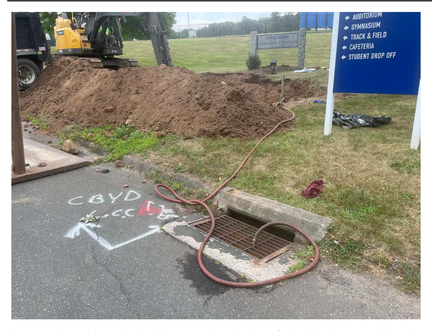
Picture 3: Ludlow draining the 50' of 4" DIP they previously installed at Station 525+75 through a 1" blowoff that they are directing to a catch basin located at Station ~525+49.

Contractor: Ludlow Construction Page: 5 of 8