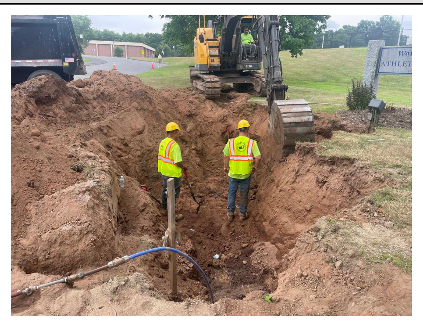
Picture 2: Ludlow excavating the footprint of the vault they are installing at Station 525+75 on Pickett Lane, Durham. View to the east.