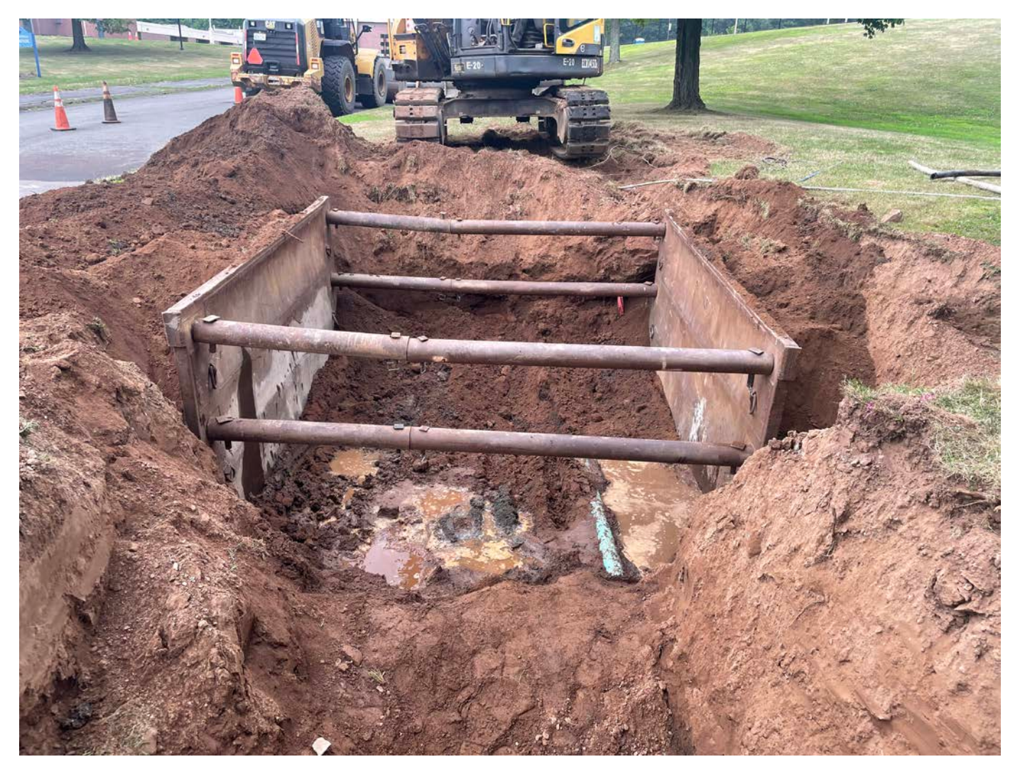
Picture 6: Trench box that Ludlow has set in the excavation they made for the installation of a vault at Station 525+75.