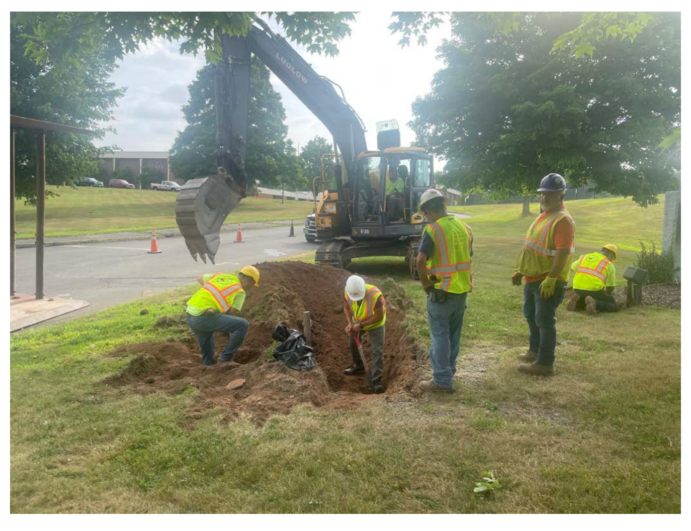
Picture 1: Ludlow using an excavator and hand tools to locate subsurface utilities located within the footprint of where they are working to install a vault at Station 525+75. View to the east.

Contractor: Ludlow Construction Page: 3 of 8