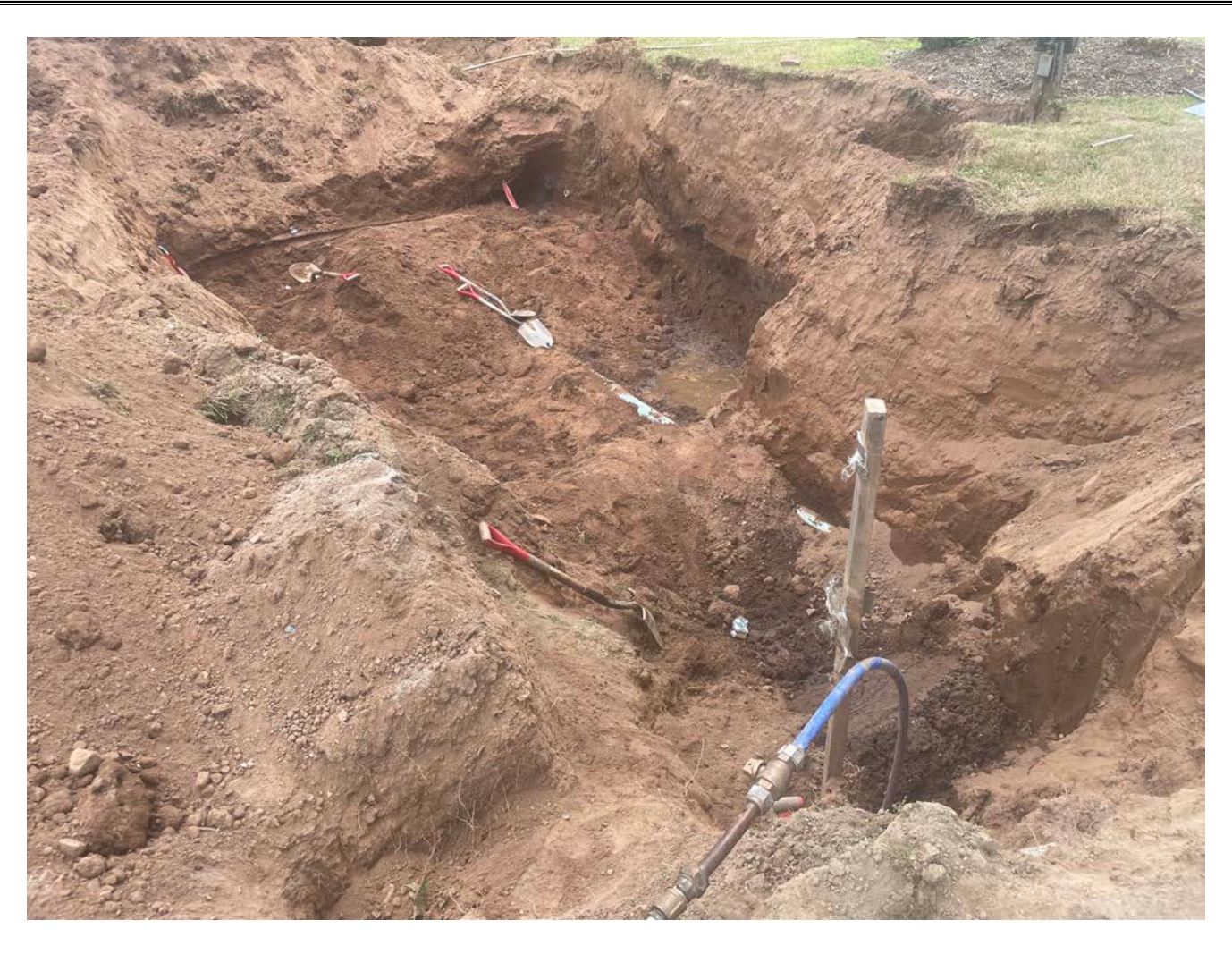
Picture 4: View of the excavation that Ludlow has made for the installation of a vault at Station 525+75. Note the 4" PVC water line that Ludlow has daylighted. View to the southeast.

Contractor: Ludlow Construction Page: 6 of 8