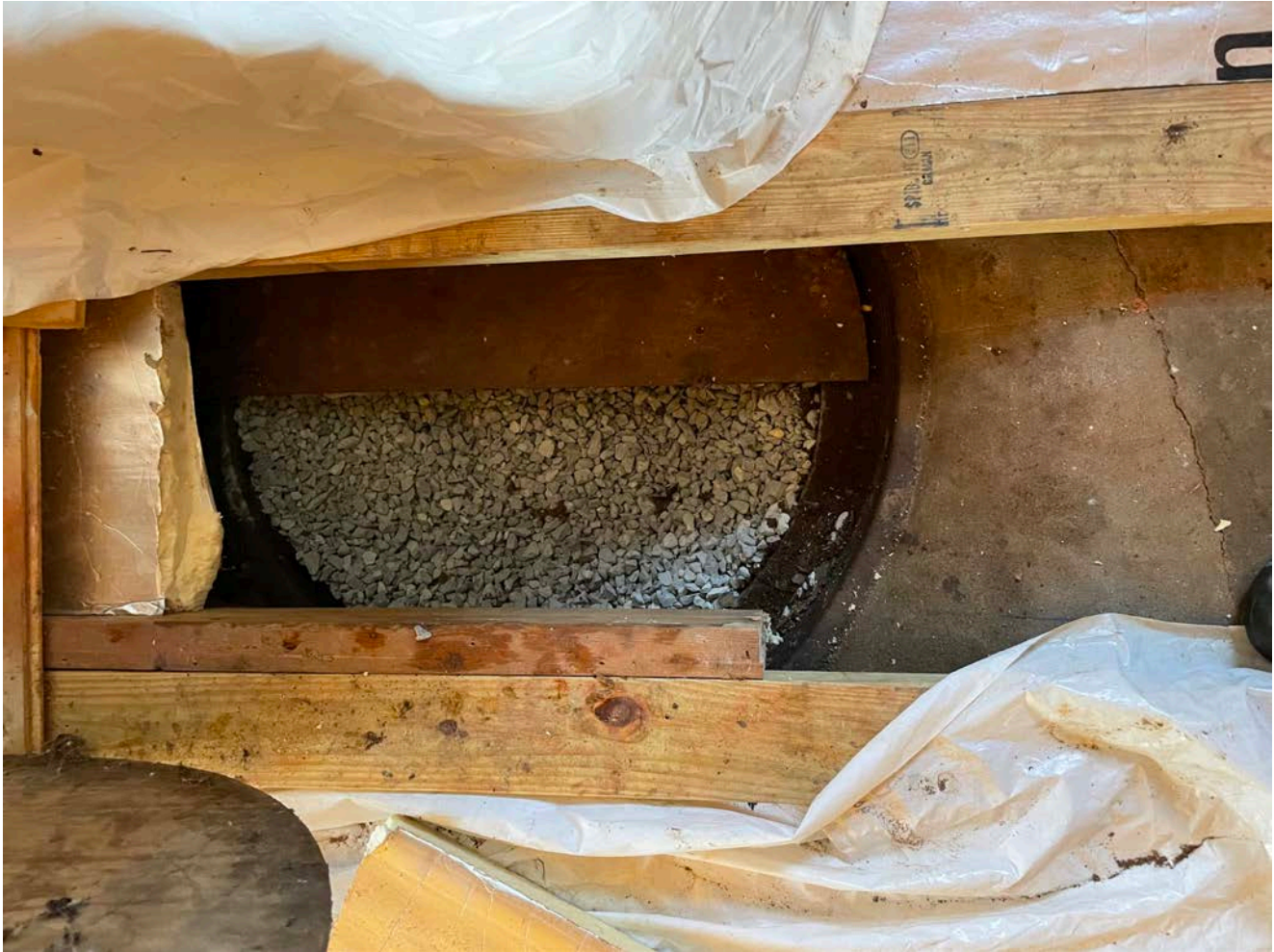
Picture 4: View of the well tile located below the floor of the 289 Main Street residence. Grela has filled the tile with bentonite chips as part of well decommissioning activities.

Project: Durham Meadows Pipeline Installation Date: July 21, 2022 Location: Pickett Lane, Main Street, and Maple Avenue, Durham Day of Week: Thursday Project #: AECOM: 6061487 Report No: 472 Contractor: Ludlow Construction Page: 7 of 13