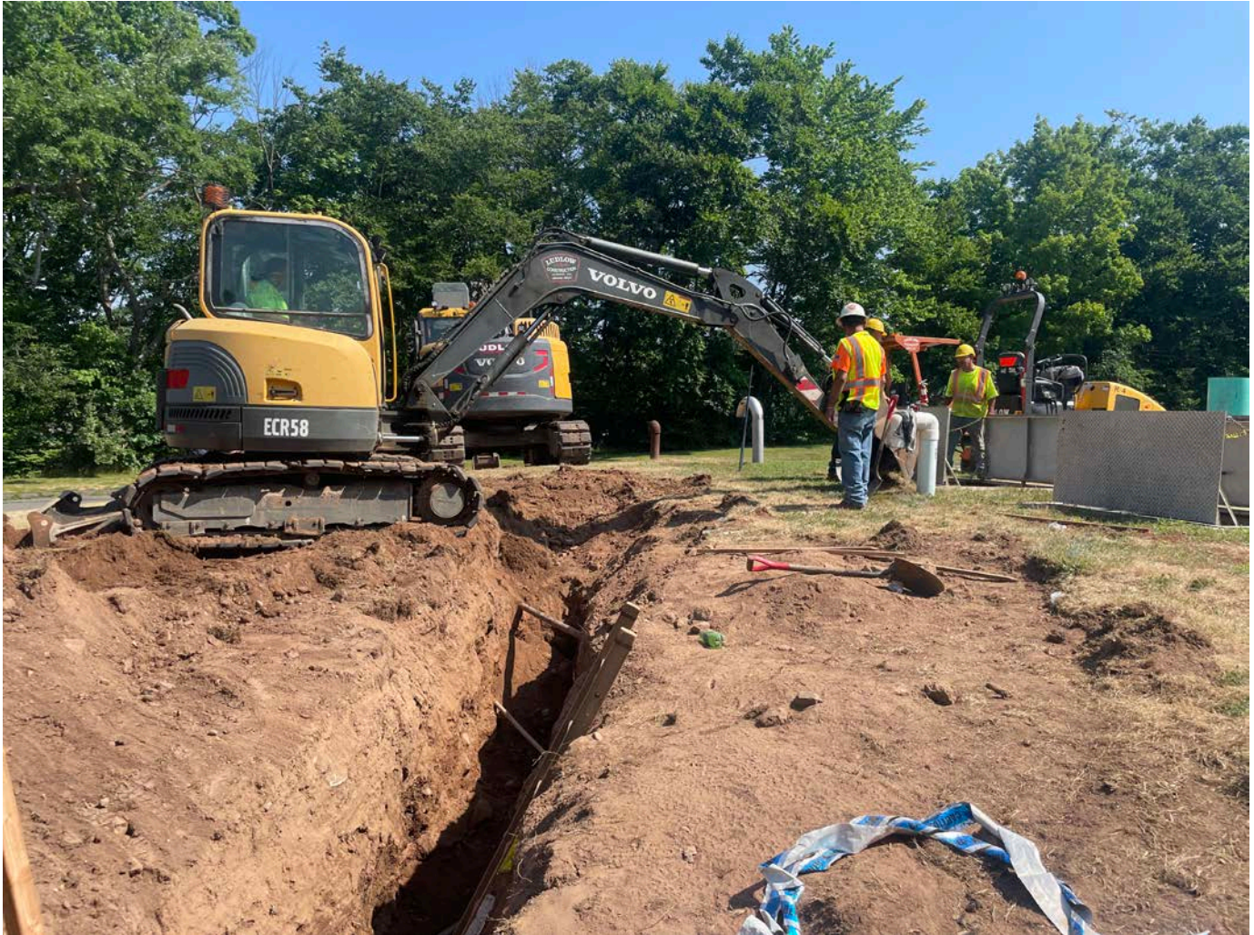
Picture 3: Ludlow excavating to the southwest of the existing water line vaults at the CRHS as they continue to install 8" DIP. View to the northeast.