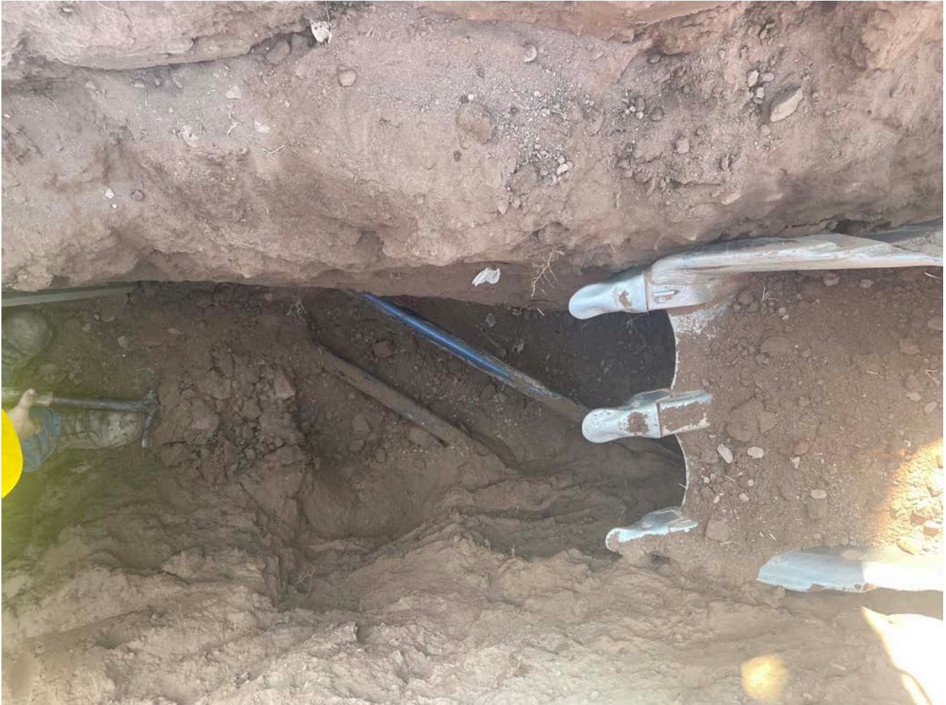
Picture 1: Two 2" HDPE well lines that Ludlow daylighted on the west side of the northernmost water line vault located at the CRHS property.

Project: Durham Meadows Pipeline Installation Date: July 21, 2022 Location: Pickett Lane, Main Street, and Maple Avenue, Durham Day of Week: Thursday Project #: AECOM: 6061487 Report No: 472 Contractor: Ludlow Construction Page: 4 of 13