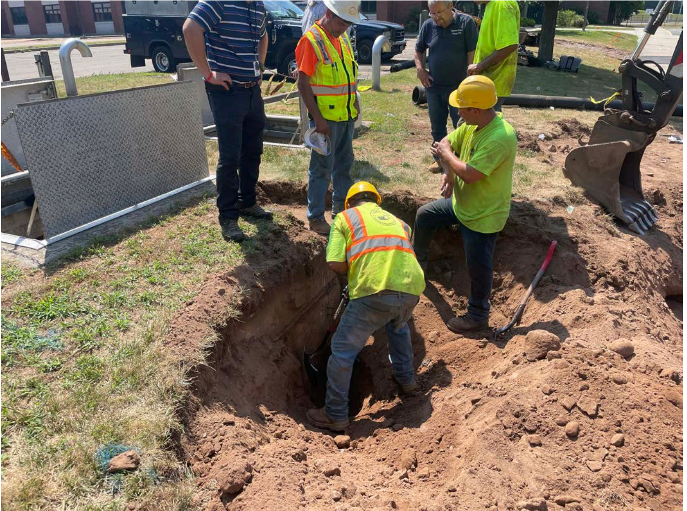
Picture 6: Ludlow using hand tools to daylight the two HDPE well lines that enter the west side of the northernmost well line vaults at the CRHS property. View to the southwest.

Project: Durham Meadows Pipeline Installation Date: July 21, 2022 Location: Pickett Lane, Main Street, and Maple Avenue, Durham Day of Week: Thursday Project #: AECOM: 6061487 Report No: 472 Contractor: Ludlow Construction Page: 9 of 13