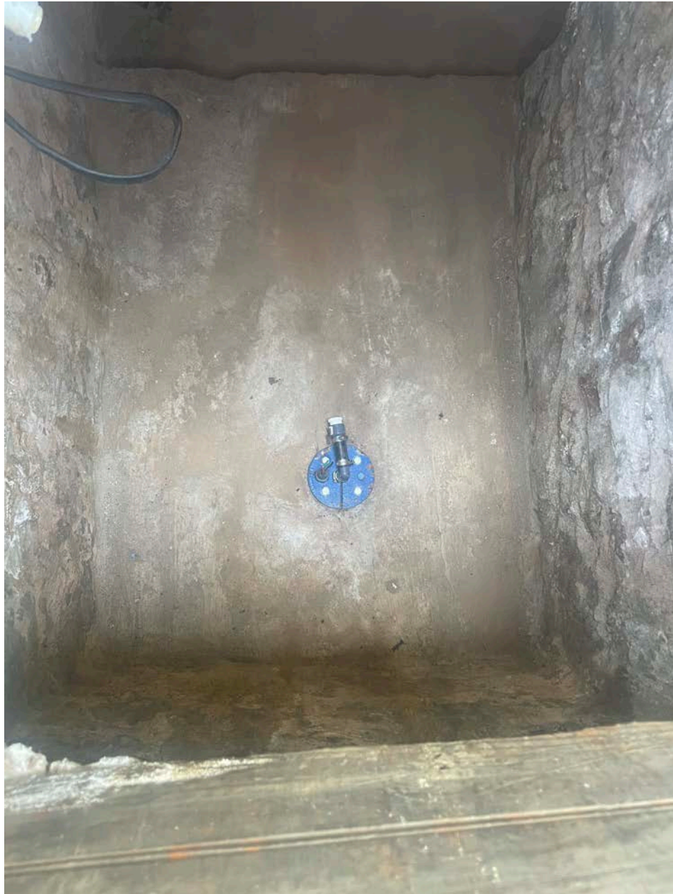
Picture 8: The well head of the well located on the north side of the basement of the 173 Maple Avenue residence.