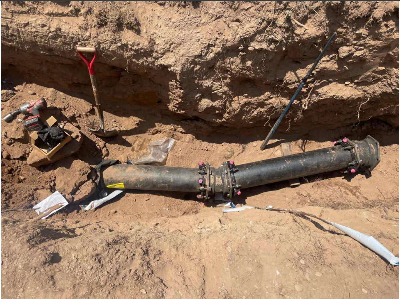
Picture 10: Several 8", 22° DIP bends that Ludlow secured in place with mechanical joint restraints.