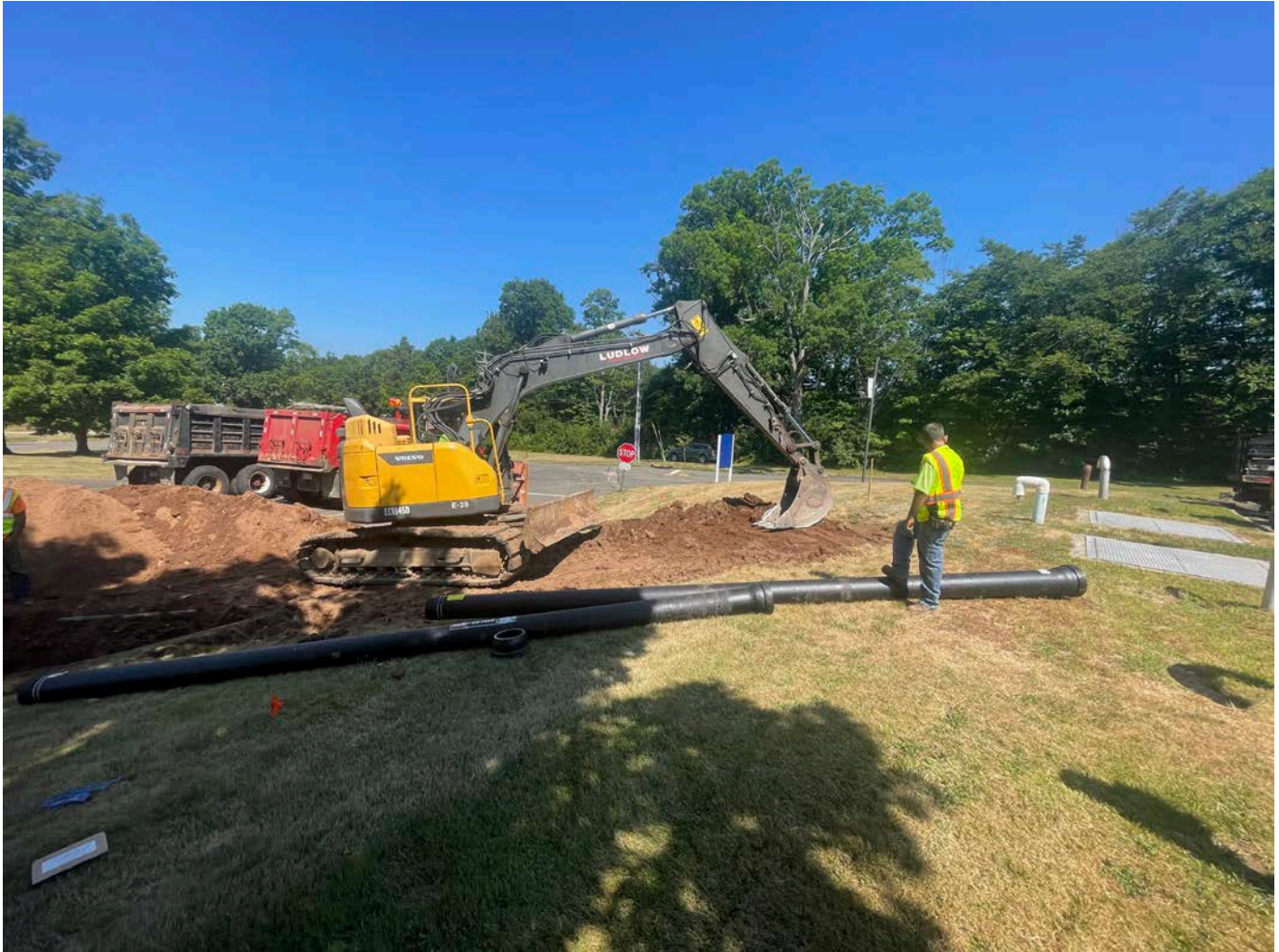
Picture 3: Ludlow excavating to the southwest of the existing water line vaults at the CRHS as they continue to install 8" DIP. View to the northwest.