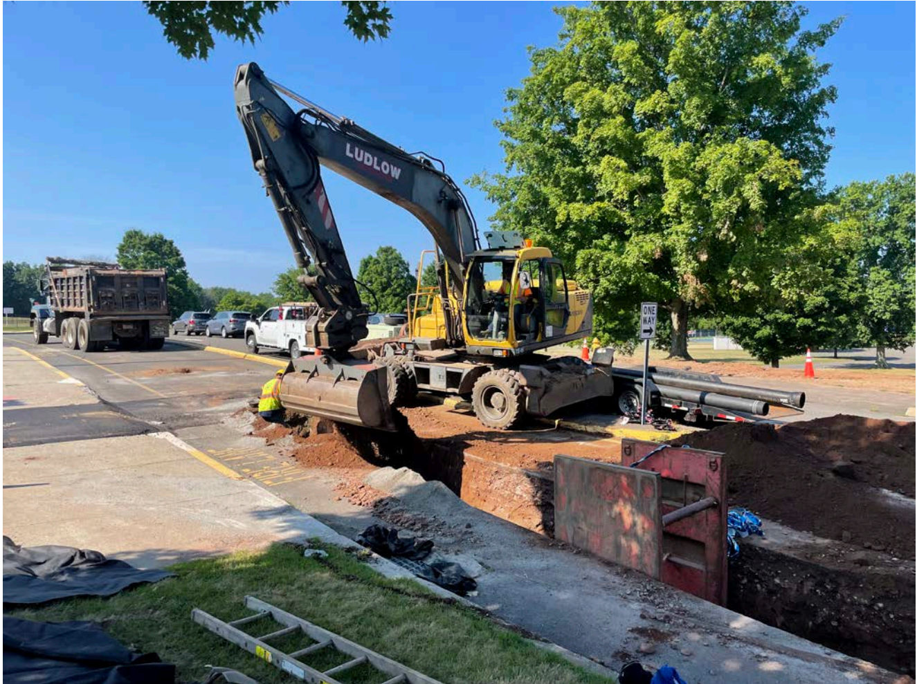
Picture 2: Ludlow backfilling over 8" DIP with native fill on the northbound lane of the access road located on the west side of the CRHS in Durham. View to the southwest.