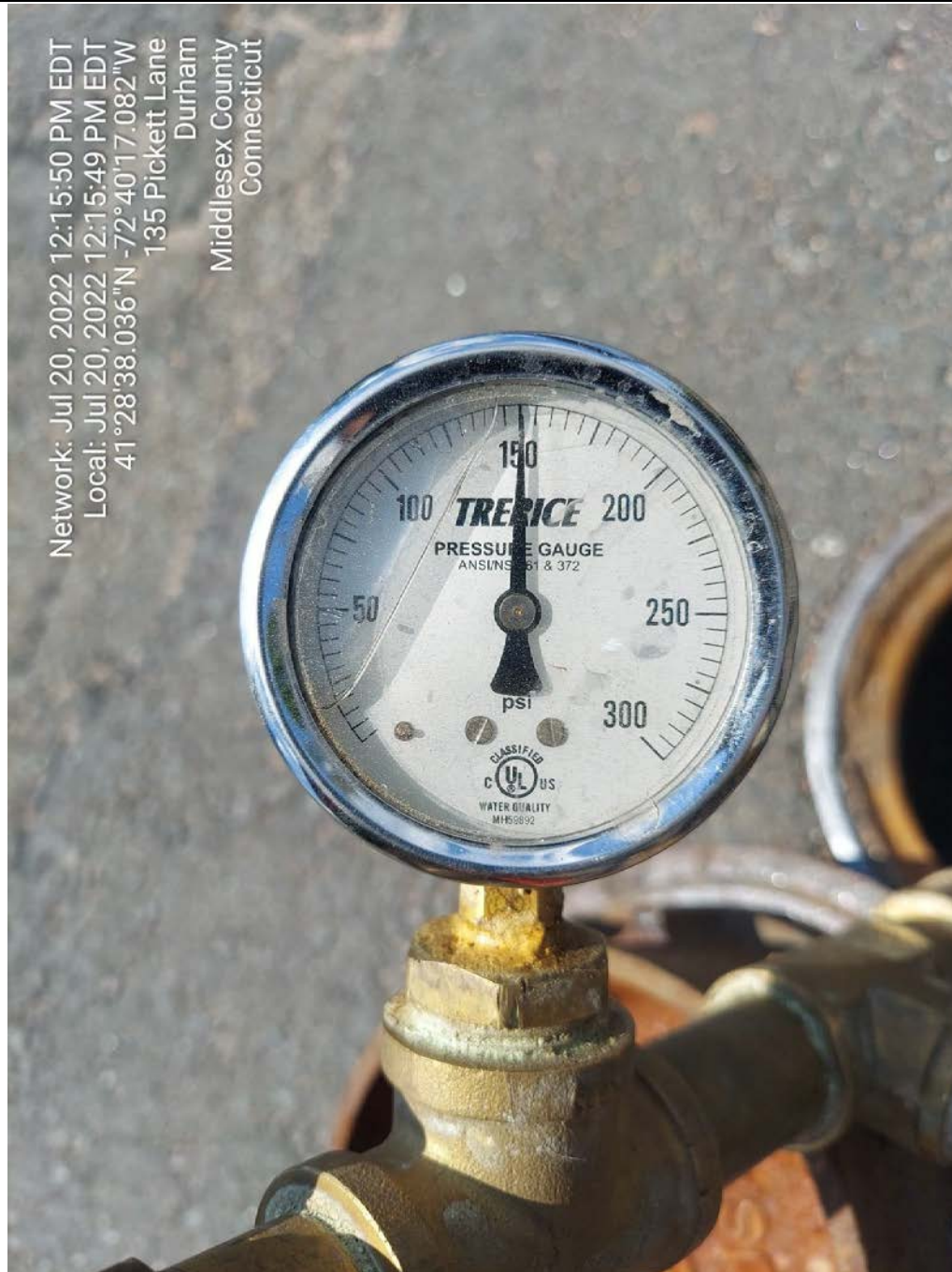
Picture 10: End pressure on the 4" DIP water line that Ludlow pressure tested today at Station 529+64.