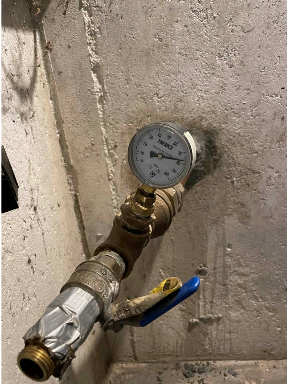
Picture 1: Pressure gauge showing a static pressure of 76 PSI that Ludlow applied to the copper water service line they installed at the 114 Maiden Lane, Durham, property.