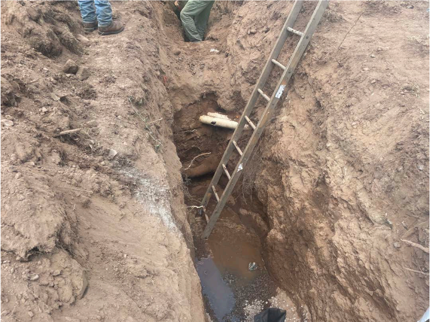
Picture 6: Two PVC conduits and 4" DIP that Ludlow daylighted as they install 8" DIP at the CRHS, about 25' southwest of the existing water line vaults. Ludlow accidentally poked a hole in the 4" DIP, which is where the water in the bottom of the trench came from.