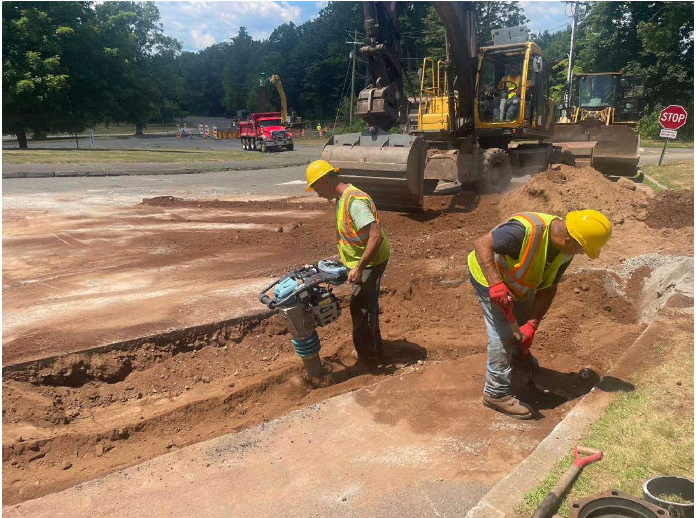
Picture 5: Ludlow compacting fill that they backfilled over the 8" DIP water line they are installing on the northbound lane of the access road located on the west side of the CRHS. View to the northwest.

Project: Durham Meadows Pipeline Installation Date: July 20, 2022 Location: Pickett Lane and Maiden Lane, Durham Day of Week: Wednesday Project #: AECOM: 6061487 Report No: 471 Contractor: Ludlow Construction Page: 8 of 13