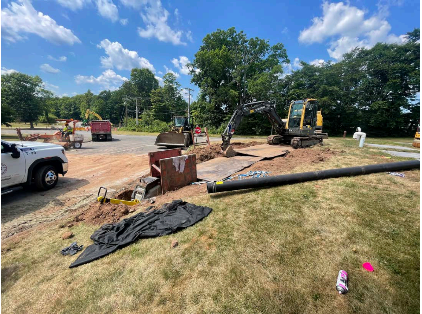
Picture 8: Ludlow's work zone at the CRHS after they secured the trench with steel plates and several pieces of equipment. View to the northwest.