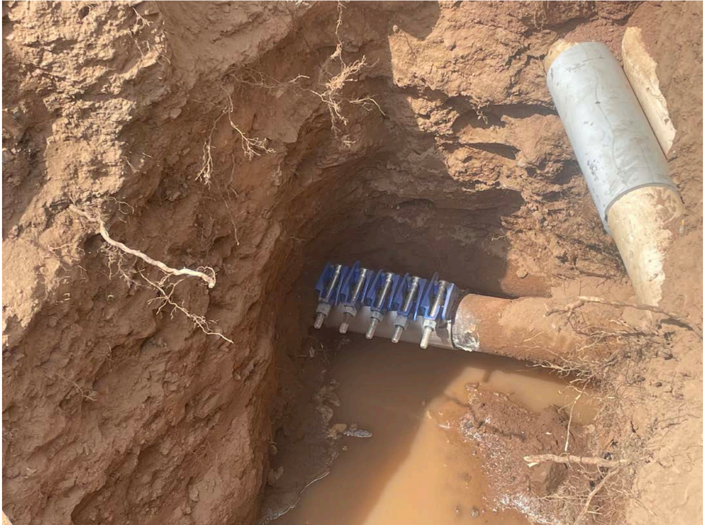
Picture 7: The repair that Ludlow made to the 4" DIP that they accidentally poked a hole into while excavating for the installation of 8" DIP. View to the east.