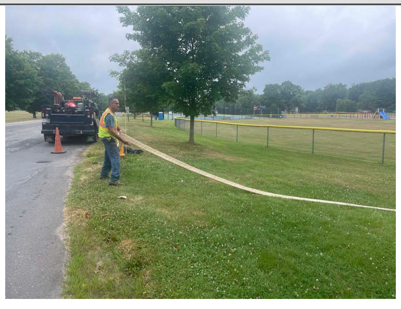
Picture 5: Ludlow setting up on a hydrant located at ~Station 525+00 to flush the water line on Pickett Lane, Durham. View to the west.

Contractor: Ludlow Construction Page: 7 of 14