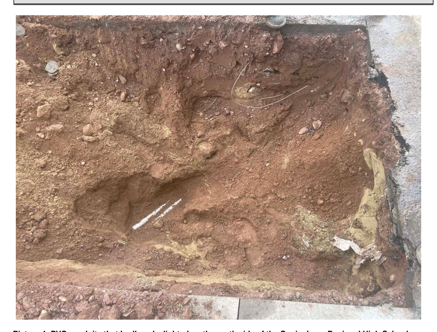
Picture 4: PVC conduits that Ludlow daylighted on the north side of the Coginchaug Regional High School while installing 4" at Station 529+64. The severed wire at the top right of the photo is believed to be an inactive line.