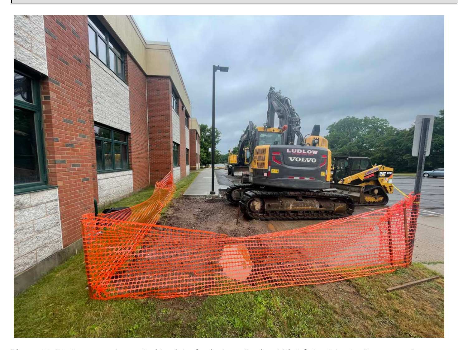
Picture 12: Work zone on the north side of the Coginchaug Regional High School that Ludlow secured once they finished work for the day. View to the west.