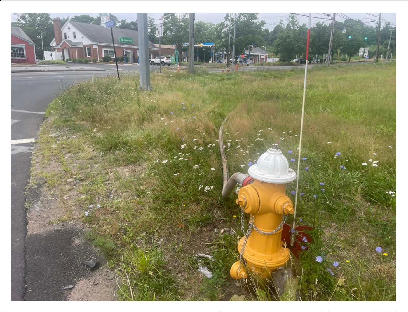
Picture 2: Ludlow set up on a hydrant located on Haddam Quarter Road next to where it intersects with Main Street to flush the water line on Main Street. View to the northwest.