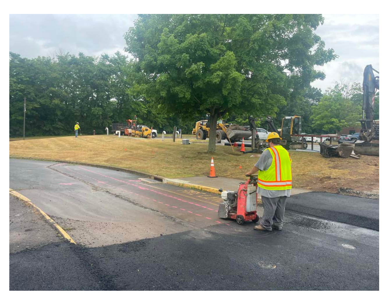
Picture 9: Ludlow saw-cutting on the northbound lane of the access road located on the west side of the CRHS as they prepare to install 8" DIP that will connect to the vault located further north. View to the north.

Contractor: Ludlow Construction Page: 11 of 14