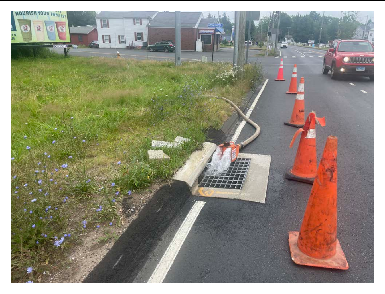
Picture 3: Ludlow discharging water into a catch basin located on the east side of Main Street that they are flushing from a hydrant located on Haddam Quarter Road. View to the south.