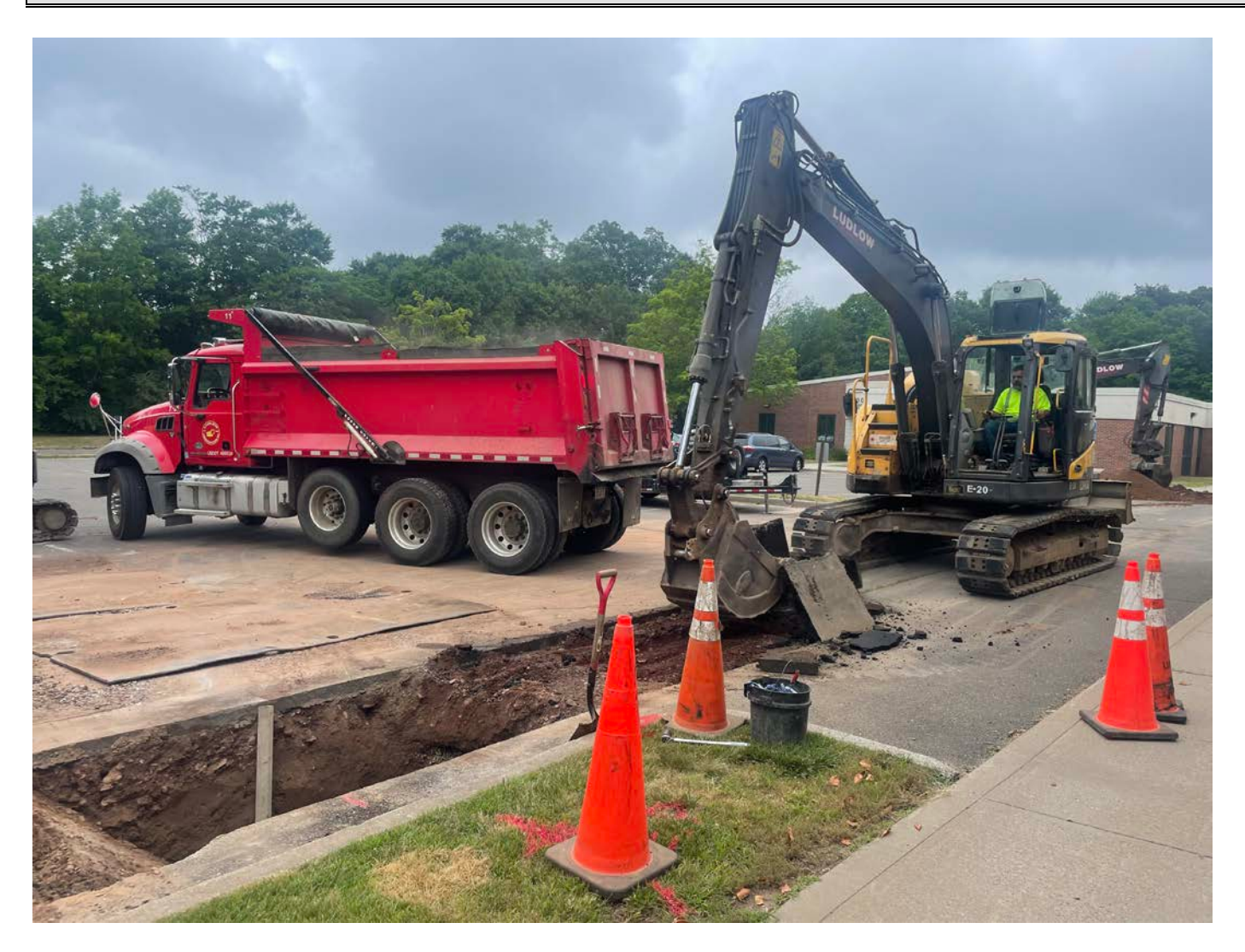
Picture 6: Ludlow removing pavement from the footprint of the trench they are excavating at Station 529+64 in the parking lot located on the north side of the CRHS for the installation of a 4" DIP water line. View to the northeast.