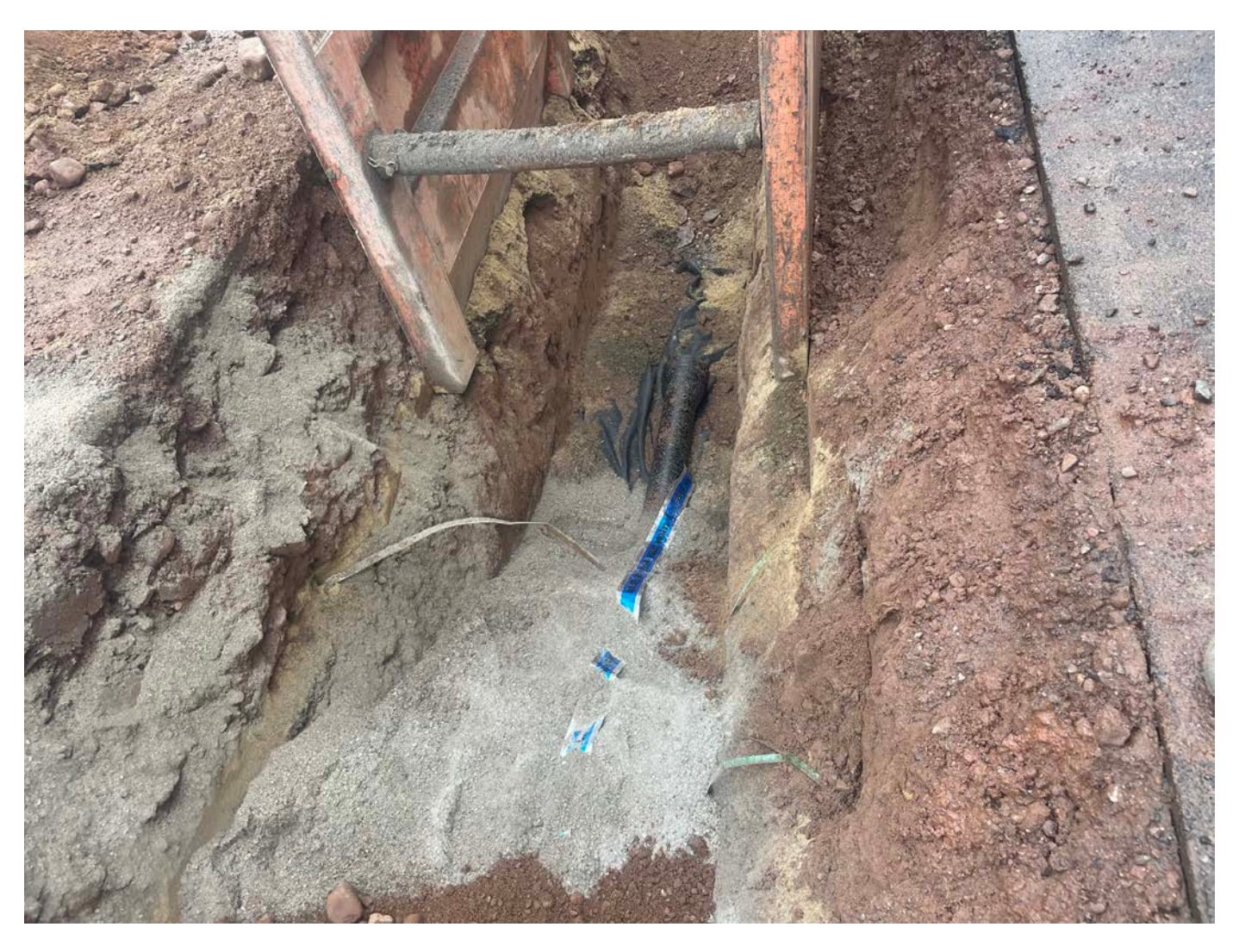
Picture 10: Sand and caution tape that Ludlow placed over 4" DIP that they installed on the north side of the CRHS at Station 529+64. View to the east.

Contractor: Ludlow Construction Page: 12 of 14