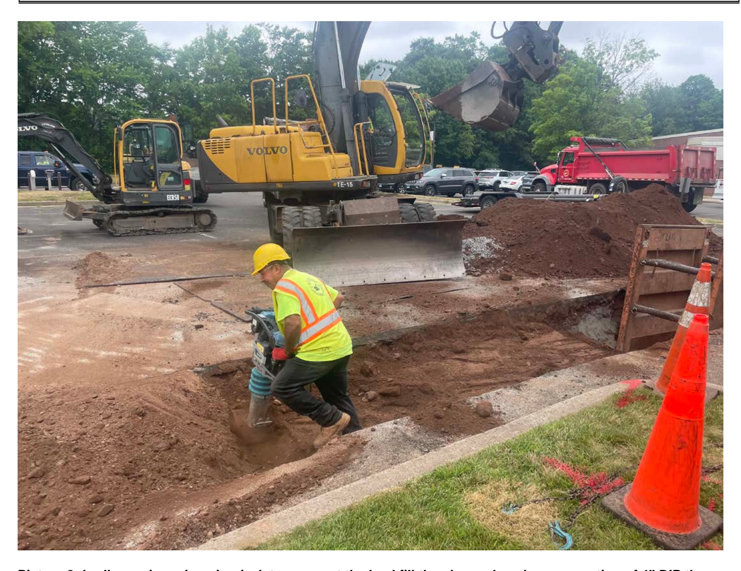
Picture 8: Ludlow using a jumping jack to compact the backfill they have placed over a section of 4" DIP they just installed at Station 529+64. View to the northeast.

Contractor: Ludlow Construction Page: 10 of 14