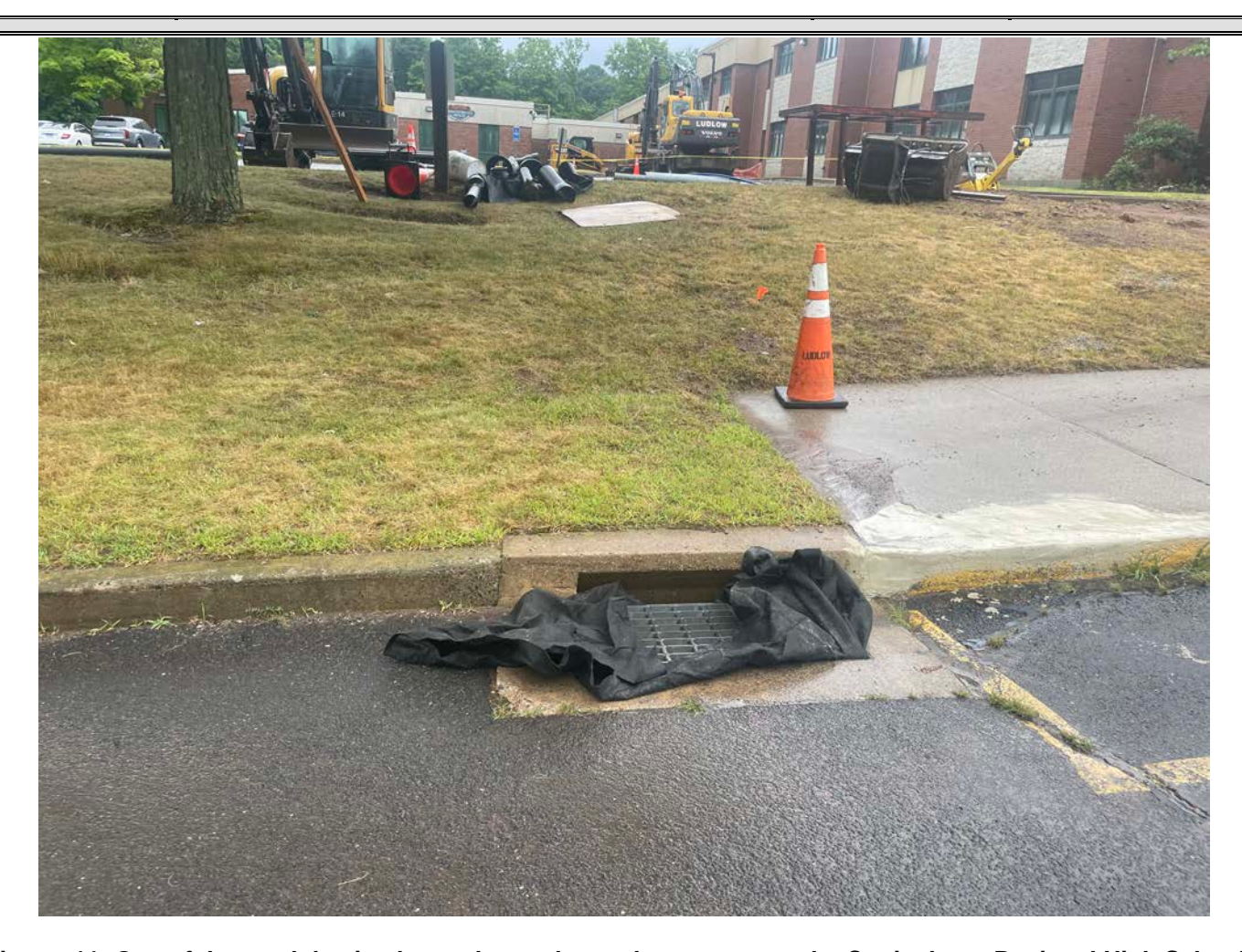
Picture 11: One of the catch basins located near the work zone next to the Coginchaug Regional High School that Ludlow lined with filter fabric to keep solids from entering the catch basin. View to the southwest.