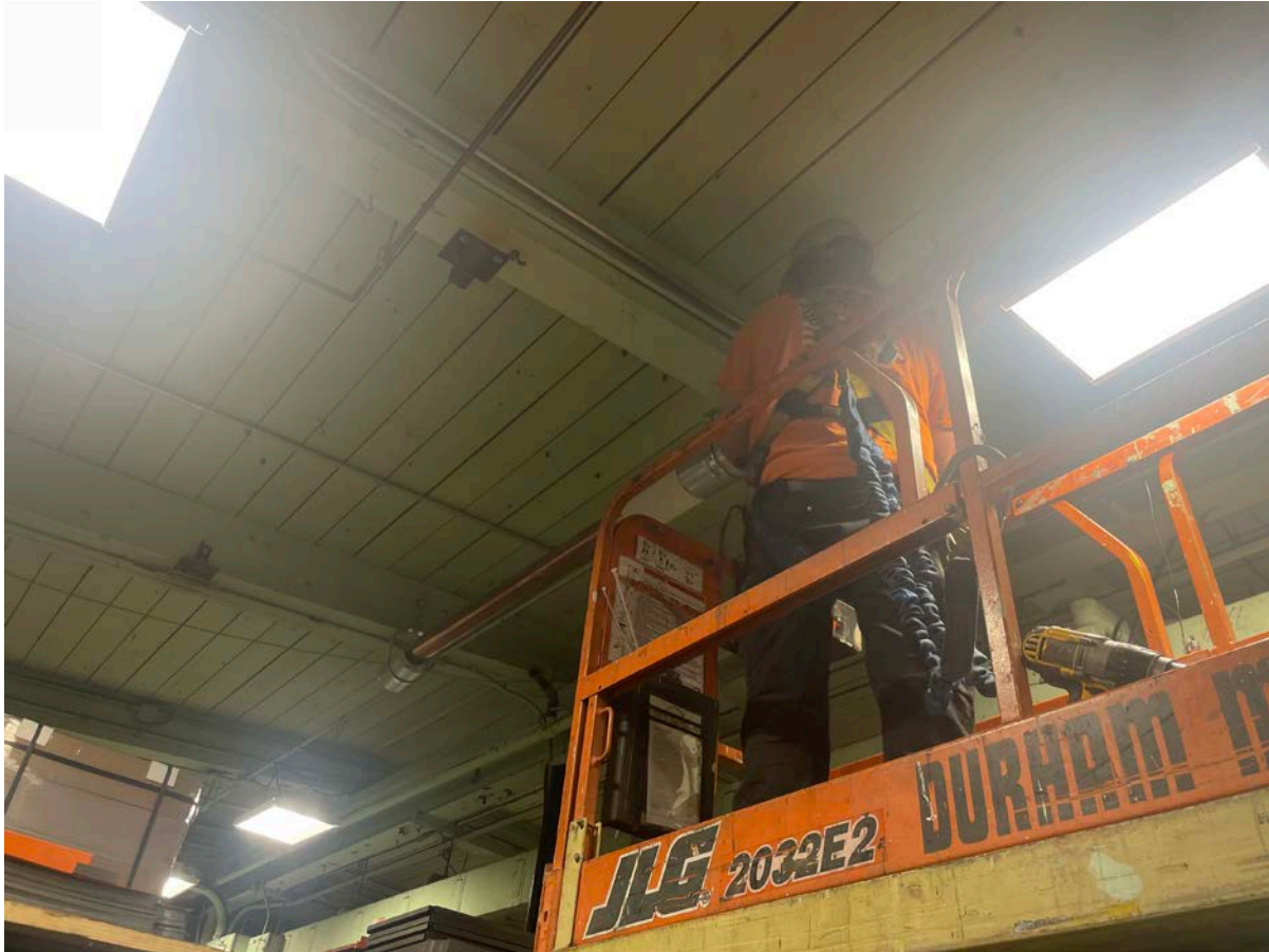
Picture 1: West State Mechanical installing a 4" copper water service line on the ceiling of the Durham Manufacturing facility.