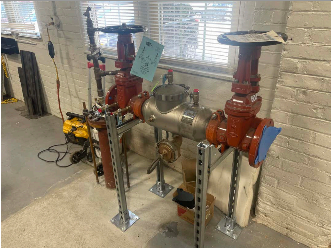
Picture 6: Backflow preventer that West State Mechanical installed on the west side of the Durham Manufacturing facility next to where the water service enters the building.