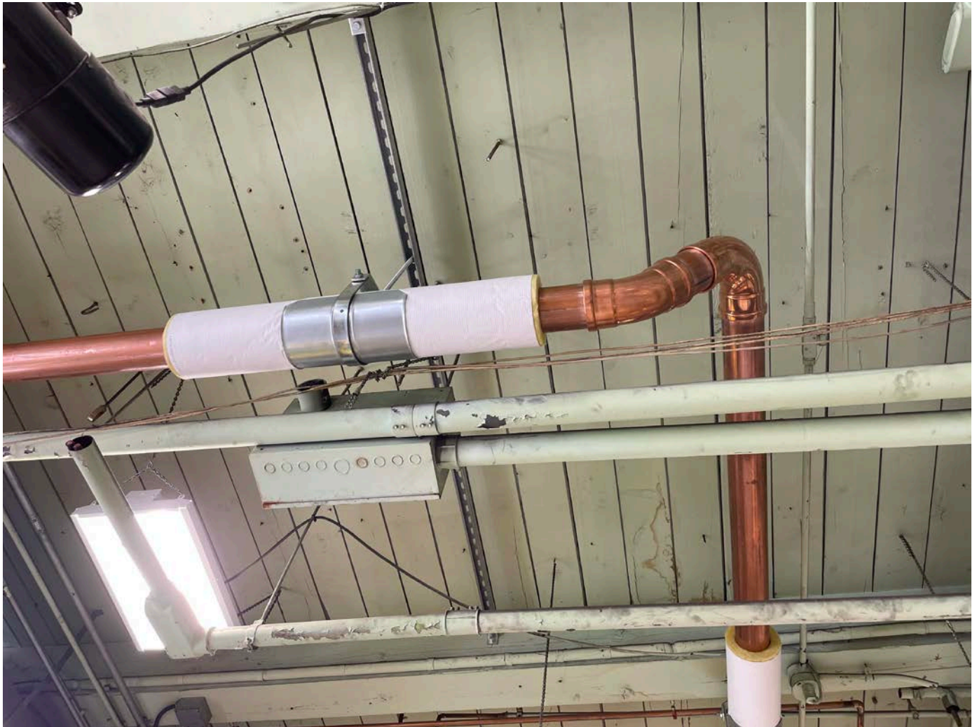
Picture 4: A section of 4" copper water feed line that West State Mechanical installed on the ceiling of the Durham Manufacturing facility.