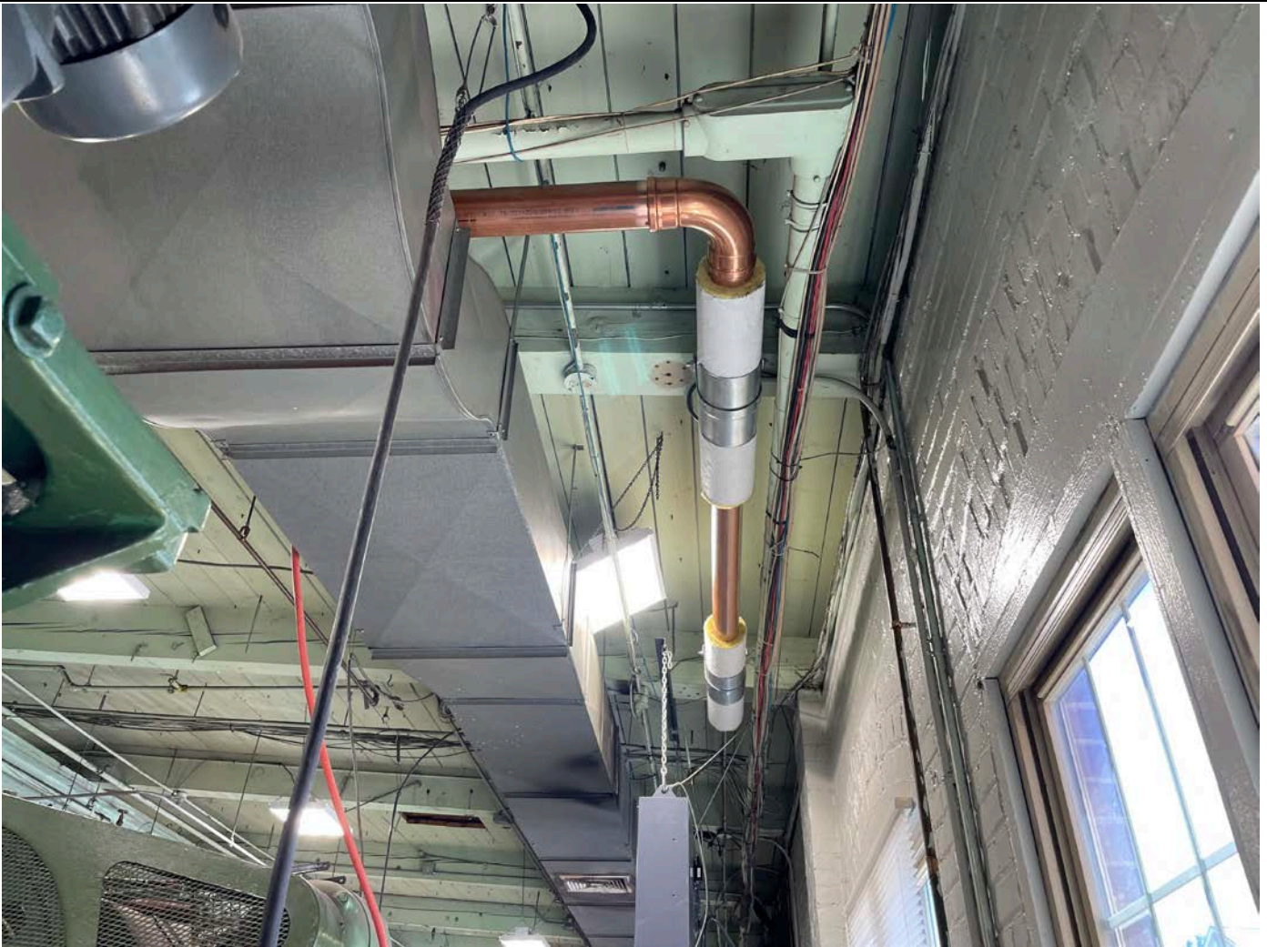
Picture 5: A section of 4" copper water feed line that West State Mechanical installed on the ceiling of the Durham Manufacturing facility.