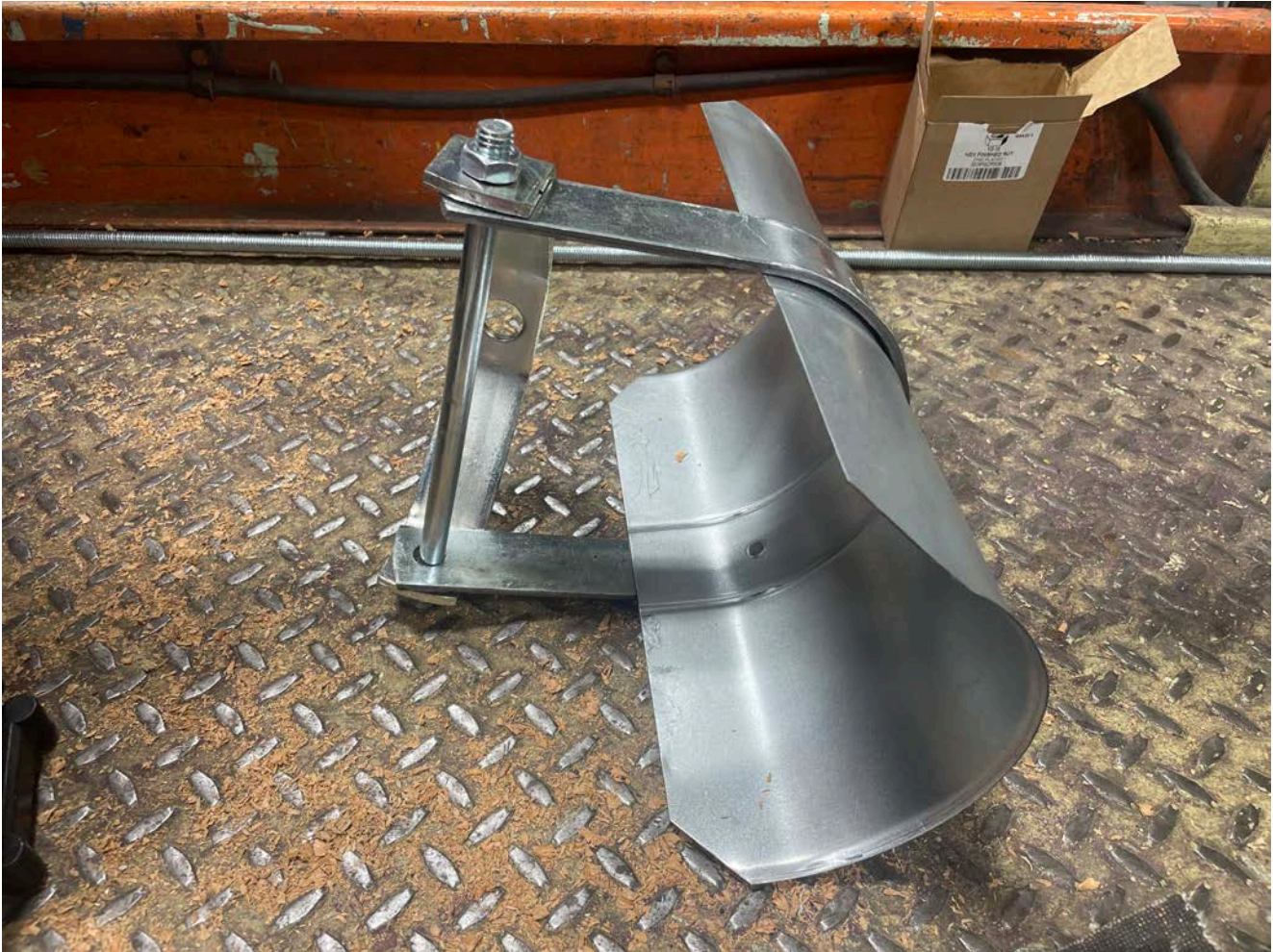
Picture 2: Pipe support that West State Mechanical is installing on the ceiling of the Durham Manufacturing Facility as they install a 4" copper water service line.

Project: Durham Meadows Pipeline Installation Date: July 07, 2022 Location: Main Street, Durham Day of Week: Thursday Project #: AECOM: 6061487 Report No: 462 Contractor: Ludlow Construction Page: 4 of 8