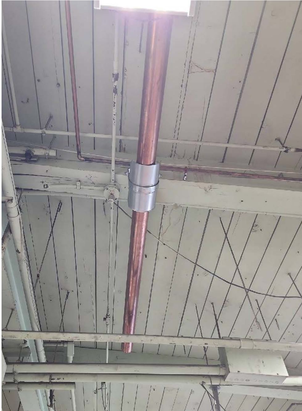
Picture 3: A section of 4" copper water feed line that West State Mechanical installed on the ceiling of the Durham Manufacturing facility.