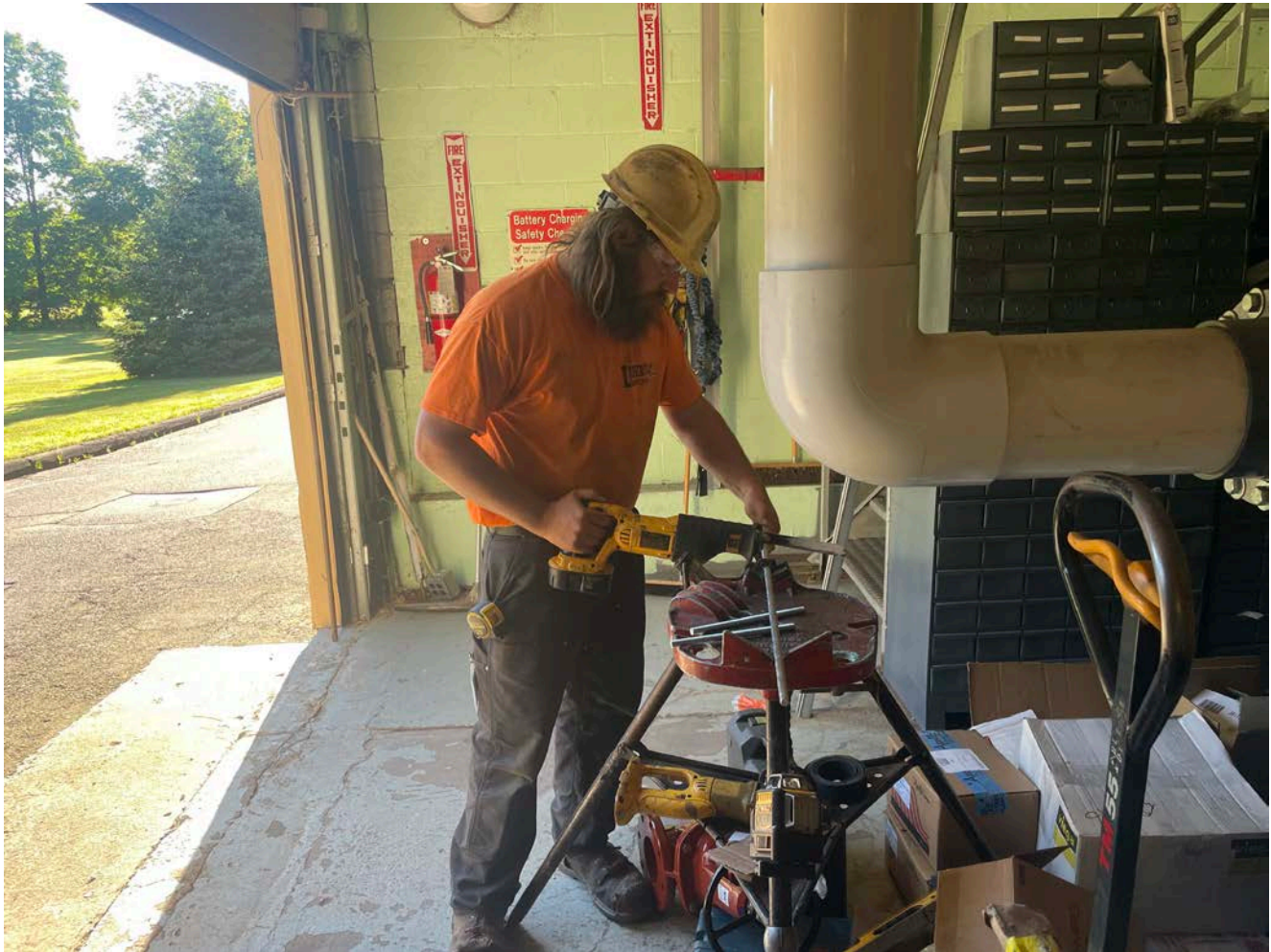
Picture 2: West State Mechanical cutting sections of threaded rod they will use on the pipe support hangers they are attaching to the ceiling of the Durham Manufacturing Facility.