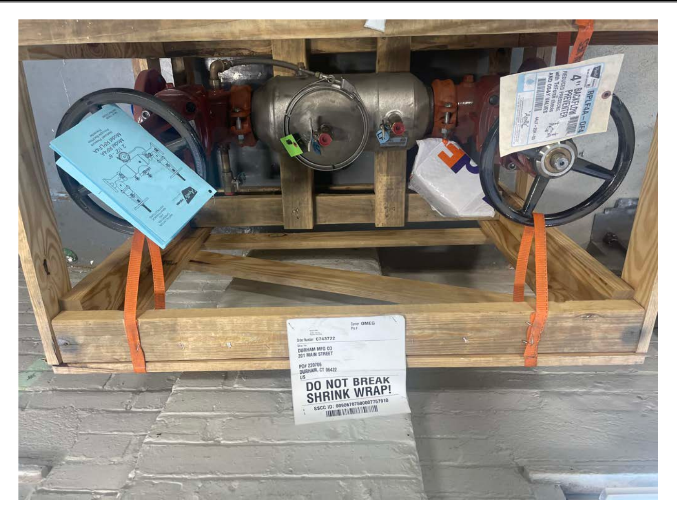
Picture 2: Backflow preventer that West State Mechanical is preparing to install on the water service that Ludlow brought into the Durham Manufacturing Facility.