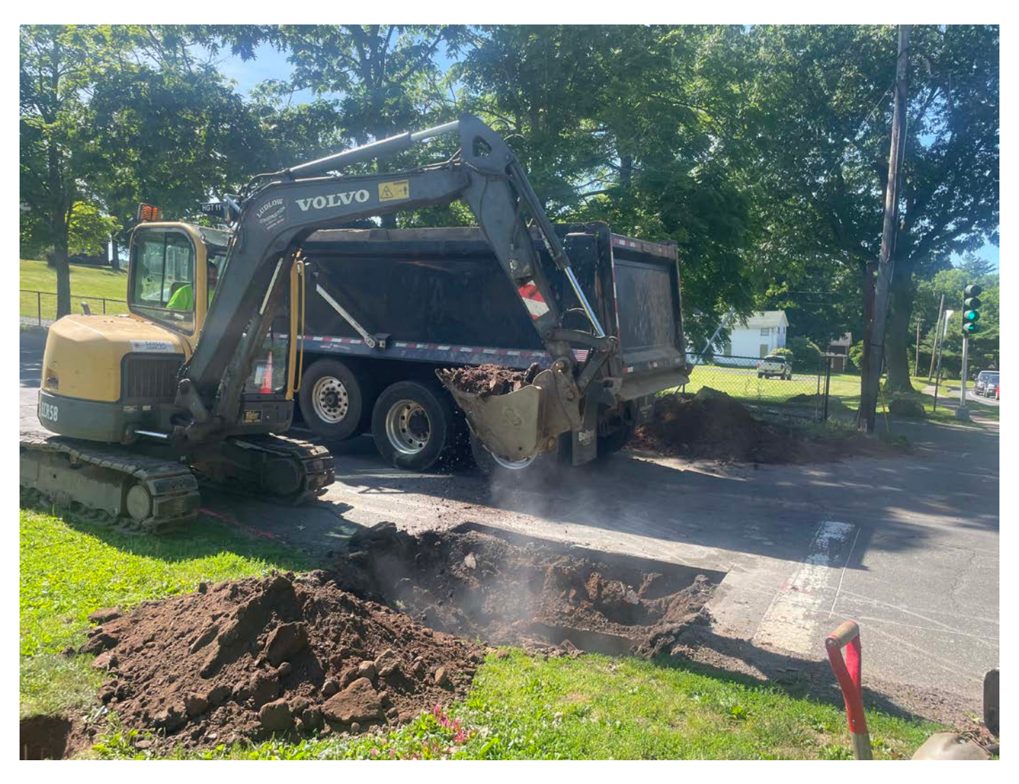
Picture 5: Ludlow excavating on the north side of Picket Lane at Station 500+50 after removing the existing catch basin. View to the south.

Contractor: Ludlow Construction Page: 7 of 11