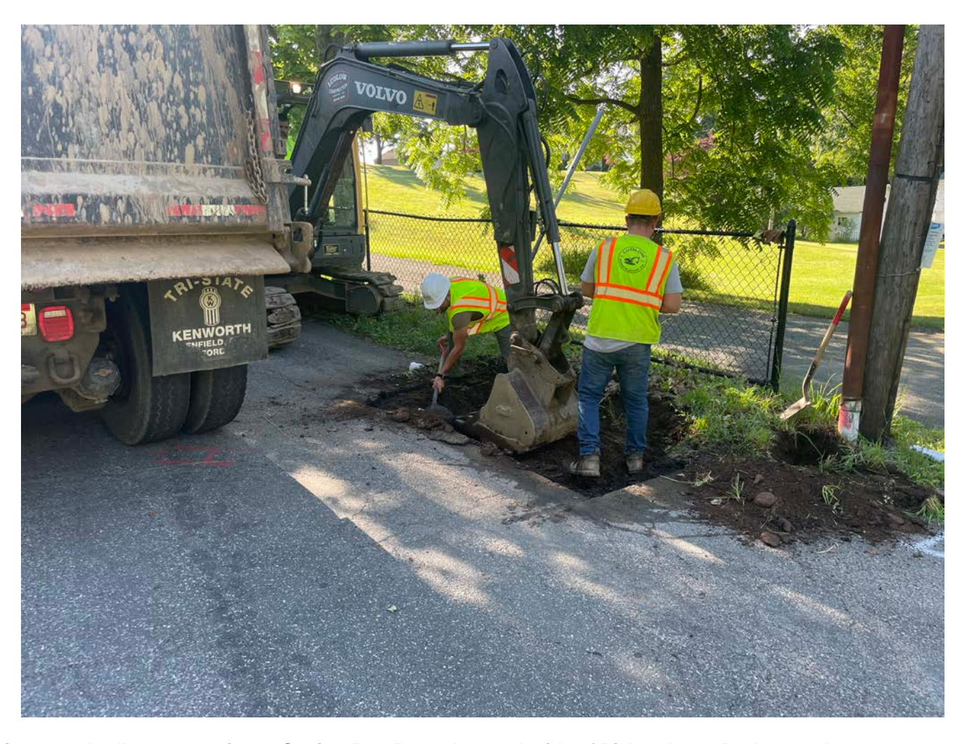
Picture 2: Ludlow excavating at Station 500+50 on the south side of Pickett Lane, Durham, to locate subsurface utilities. View to the southeast.

Contractor: Ludlow Construction Page: 4 of 11