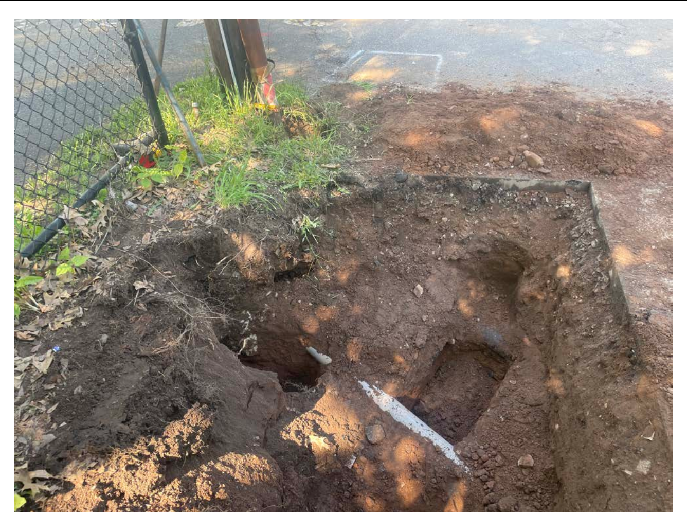
Picture 4: Subsurface utilities that Ludlow daylighted on the south side of Picket Lane at Station 500+50. View to the southwest.