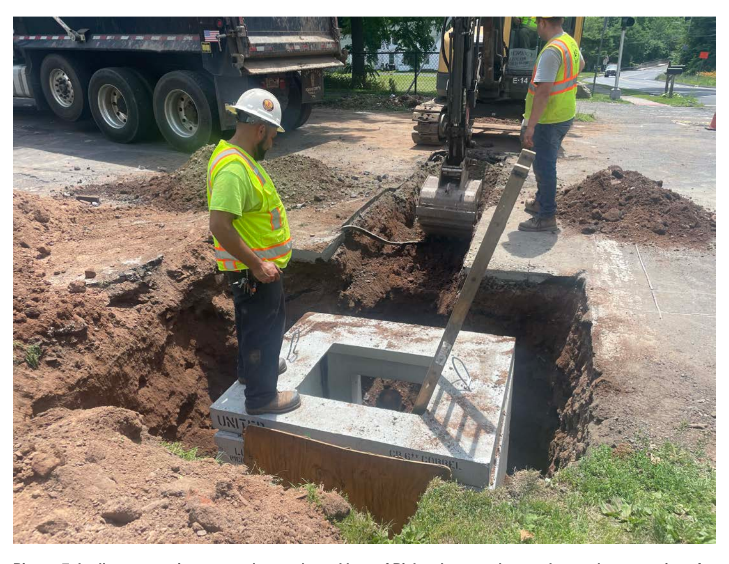
Picture 7: Ludlow excavating across the westbound lane of Pickett Lane as they work to replace a section of 12" RCP that will connect to the south side of the catch basin the just installed. View to the south.

Contractor: Ludlow Construction Page: 9 of 11