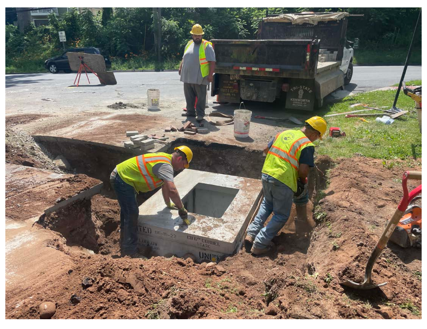
Picture 9: Ludlow compacting fill around sections of a catch basin they are installing on the north side of Pickett Lane at Station 500+50. View to the southeast.

Contractor: Ludlow Construction Page: 11 of 11