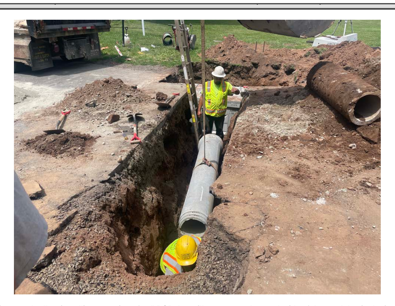
Picture 8: Ludlow installing a section of 12" RCP that will connect to the south side of the catch basin the just installed. View to the north.

Contractor: Ludlow Construction Page: 10 of 11