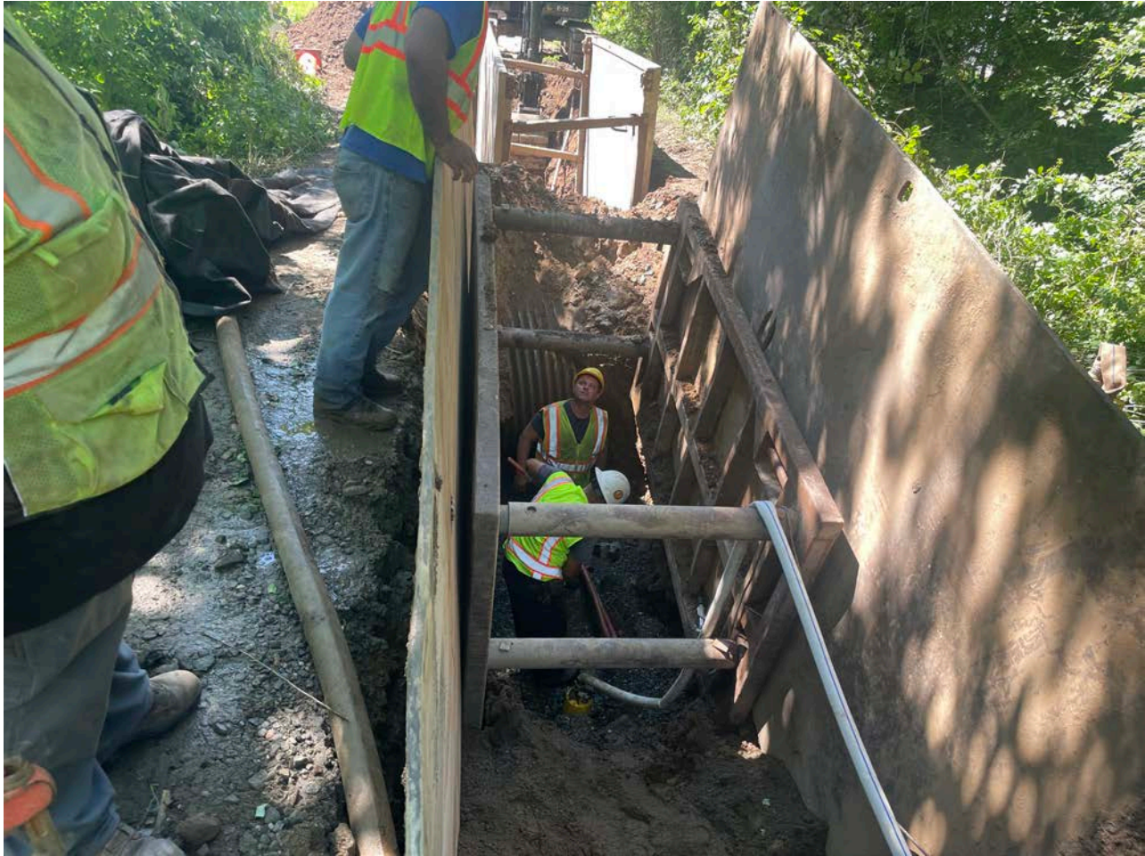
Picture 4: 2" copper water service line that Ludlow is in the process of installing on the west side of the 114 Maiden Lane, Durham, driveway. View to the south.