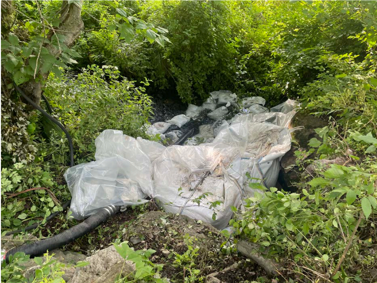
Picture 1: Temporary dam that Ludlow set up on the upstream side of the Ball Brook culvert on the 114 Maiden Lane, Durham, driveway where they are diverting the stream flow to allow them run a 2" copper water service line beneath the culvert. View to the southeast.