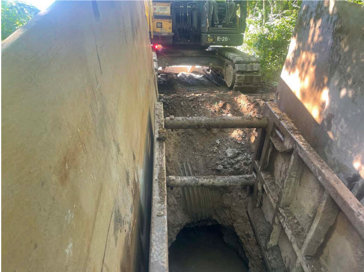
Picture 3: Corrugated pipe that Ludlow has exposed on the north side at the Ball Brook culvert on the 114 Maiden Lane, Durham, driveway. View to the south.