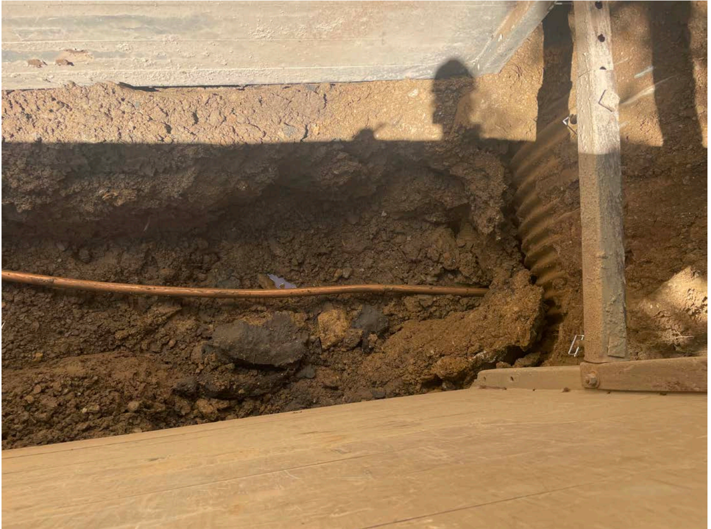
Picture 5: 2" copper water service line that Ludlow ran beneath the Ball Brook culvert located on the 114 Maiden Lane, Durham, driveway. View to the east.