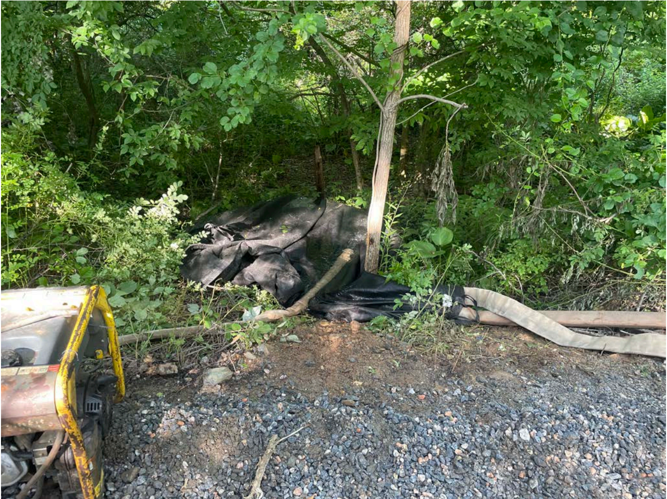
Picture 2: Filter bag that Ludlow set up to the northwest of the Ball Brook culvert on the 114 Maiden Lane, Durham, driveway where they are discharging water being pumped from the excavation on the north of the culvert. View to the west.

Project: Durham Meadows Pipeline Installation Date: June 29, 2022 Location: Maiden Lane, Durham Day of Week: Wednesday Project #: AECOM: 6061487 Report No: 457 Contractor: Ludlow Construction Page: 4 of 9