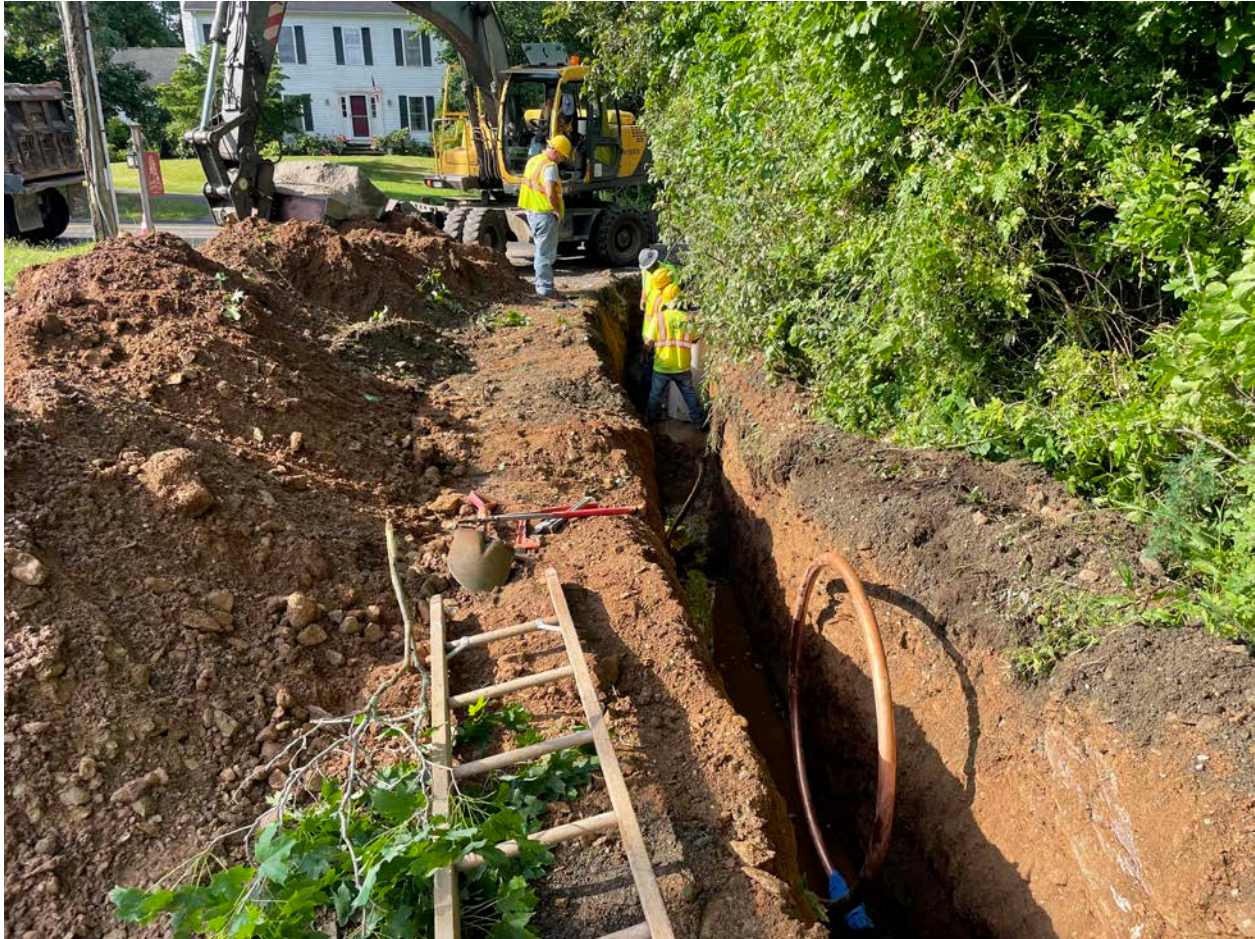
Picture 3: Ludlow installing 2" copper water service line on the west side of the 114 Maiden Lane, Durham, driveway. View to the south.