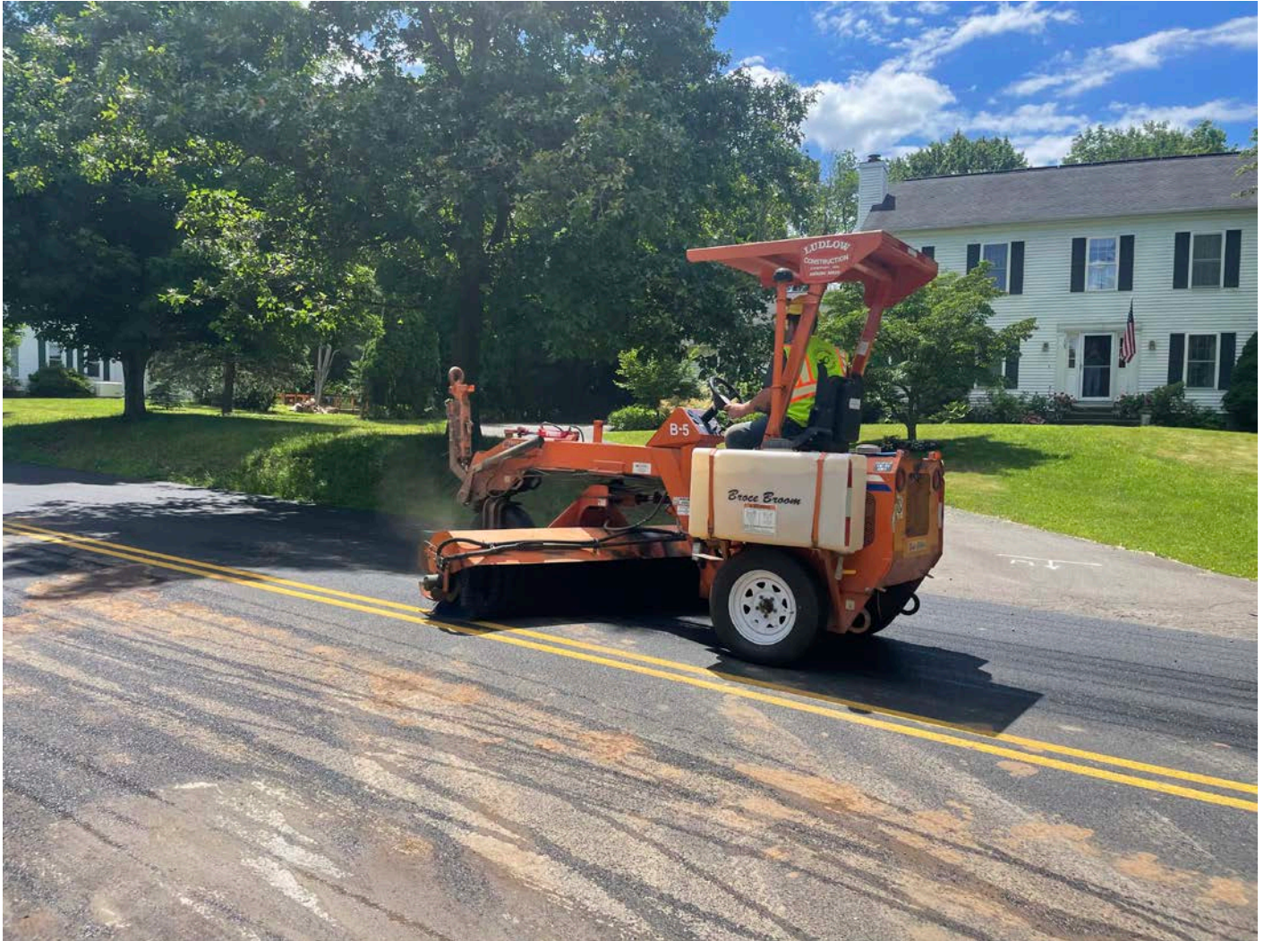
Picture 6: Ludlow cleaning up the section of Maiden Lane located in front of the 114 Maiden Lane driveway with a Broce Broom. View to the southeast.