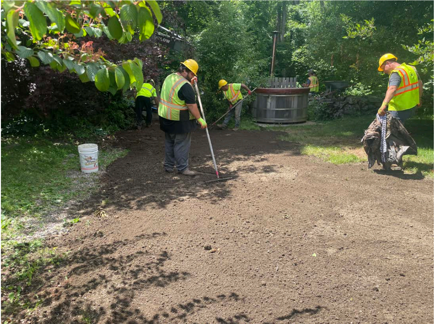
Picture 7: Ludlow raking out loam and placing grass seed to the northwest side of the 114 Maiden Lane residence where the lawn was disturbed during the installation of a 2" copper water service line.