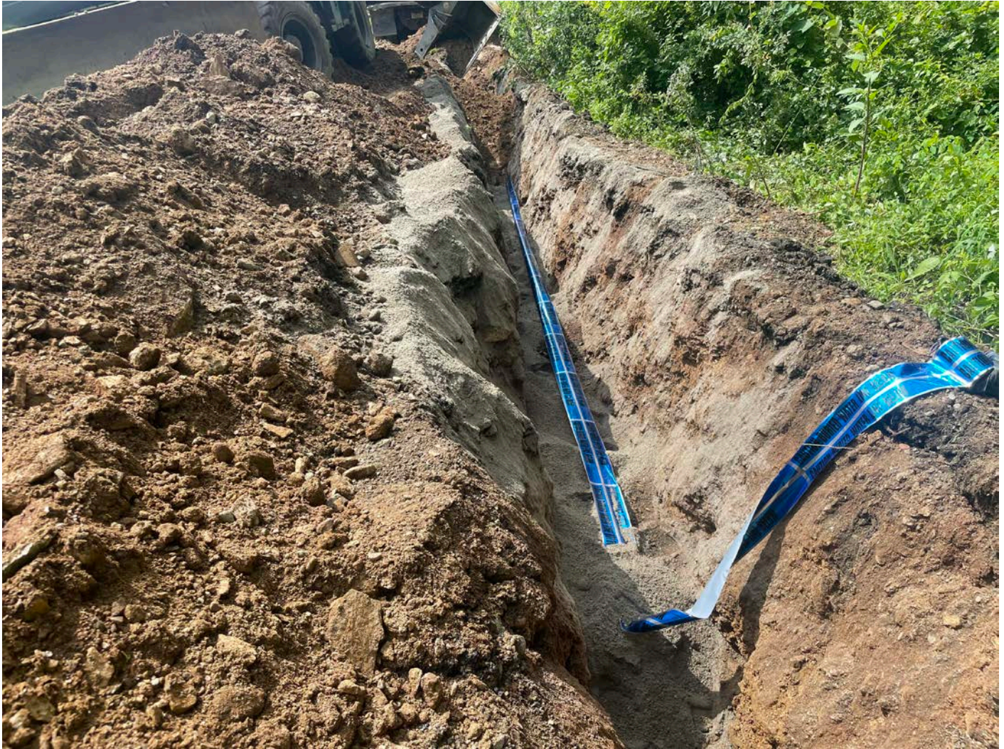
Picture 5: Sand and caution tape that Ludlow has placed over the 2" copper water service line that they have installed on the west side of the 114 Maiden Lane, Durham, driveway. View to the south.