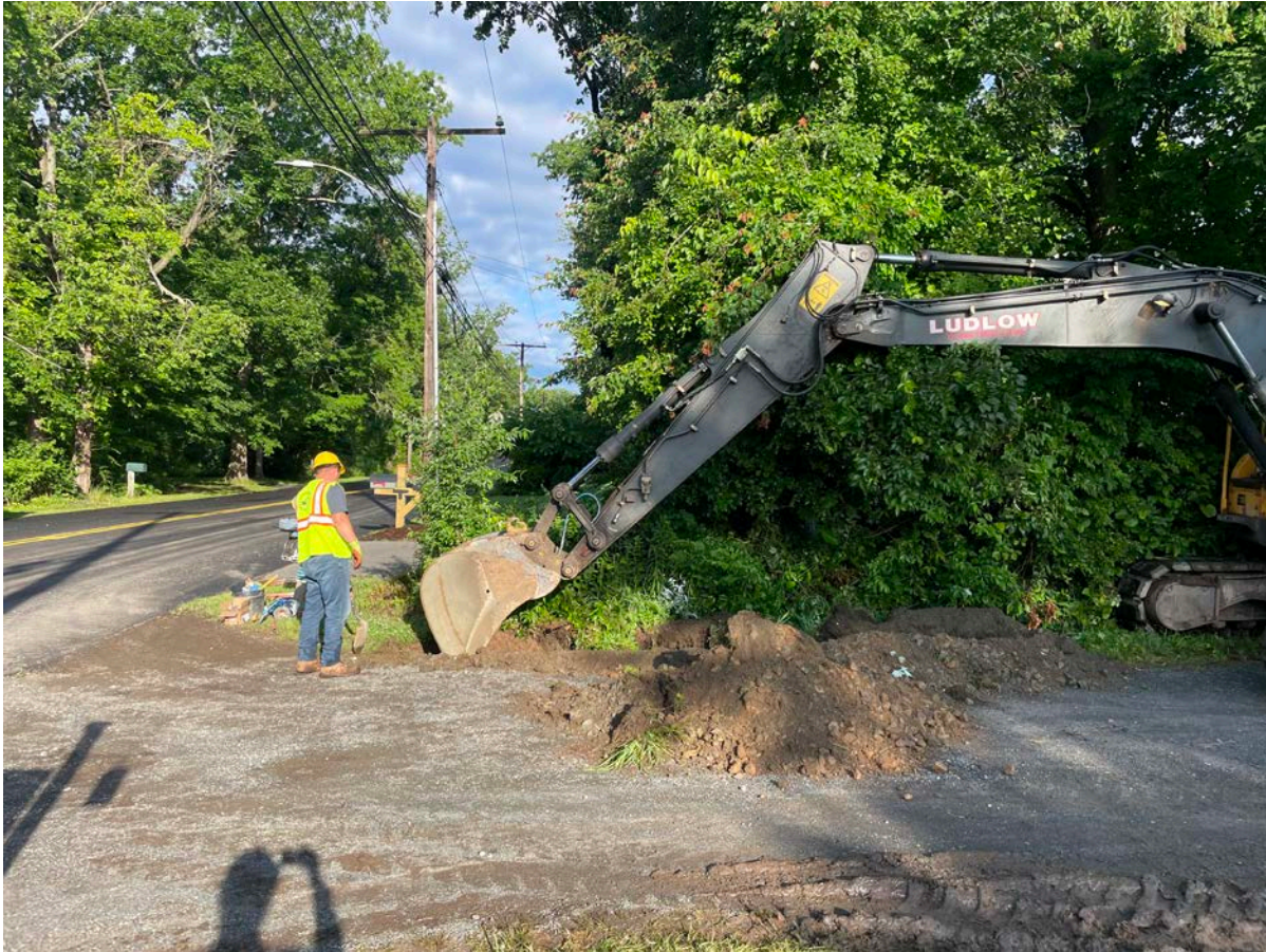
Picture 1: Ludlow excavating on the west side of the 114 Maiden Lane, Durham, driveway next to Maiden Lane as they continue to install a 2" copper water service line. View to the west.