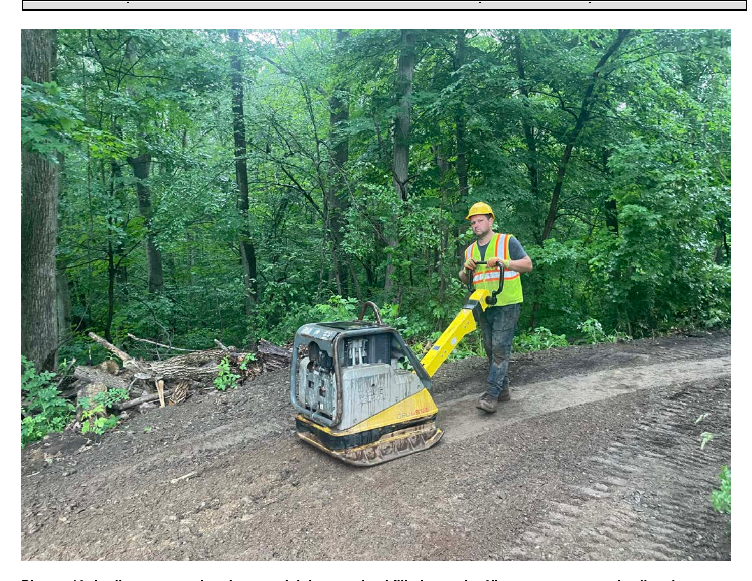
Picture 10: Ludlow compacting the material that was backfilled over the 2" copper water service line they installed at the 114 Maiden Lane, Durham, property. View to the northwest.

Contractor: Page: 13 of 14 Ludlow Construction, Laydon Industries