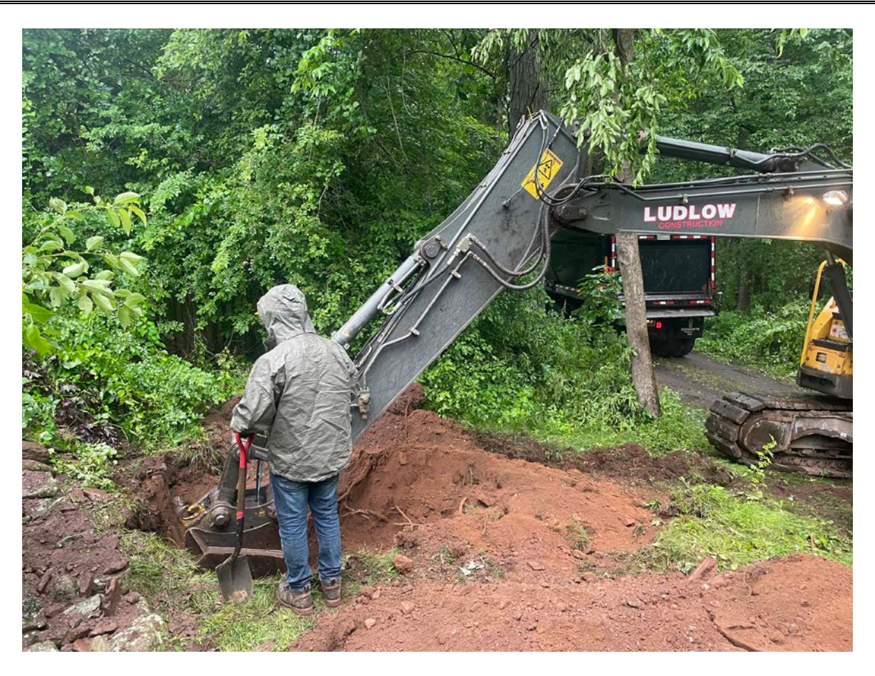
Picture 1: Ludlow excavating on the west side of a stone wall located next to the northwest corner of the 114 Maiden Lane, Durham, residence as they work to install a 2" copper water service line. View to the south.

Contractor: Ludlow Construction, Laydon Industries