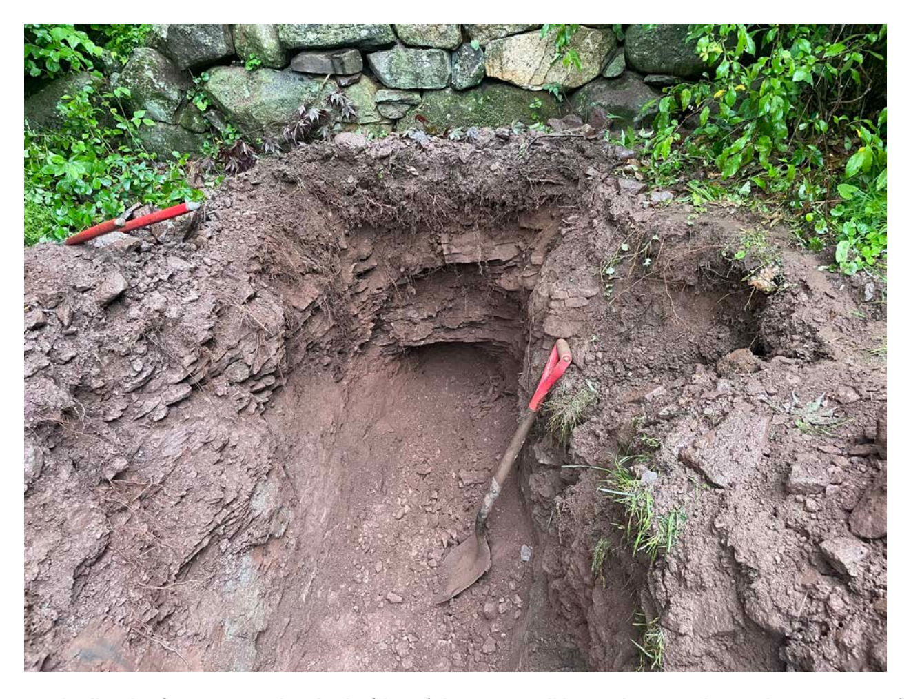
Picture 3: Ludlow having excavated on both sides of the stone wall located next to the northwest corner of the 114 Maiden Lane, Durham, residence where they will use a pneumatic mole to punch a hole beneath the wall to install a 2" copper water service line. View to the west.

Contractor: Ludlow Construction, Laydon Industries