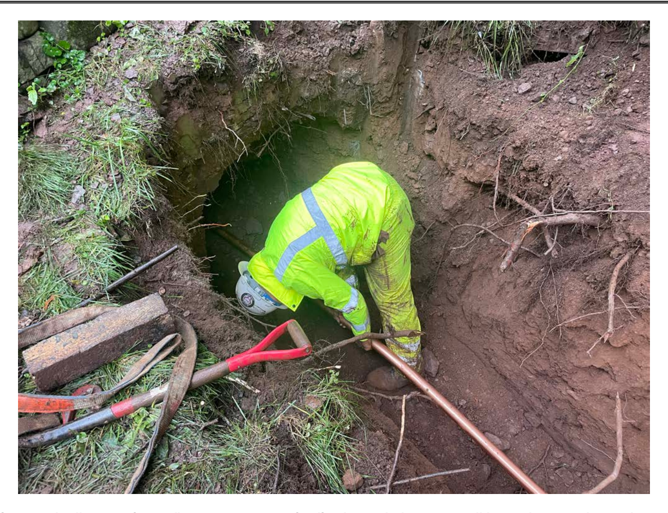
Picture 4: Ludlow running a 2" copper water service line beneath the stone wall located next to the northwest corner of the 114 Maiden Lane, Durham, residence. View to the southeast.

Contractor: Ludlow Construction, Laydon Industries