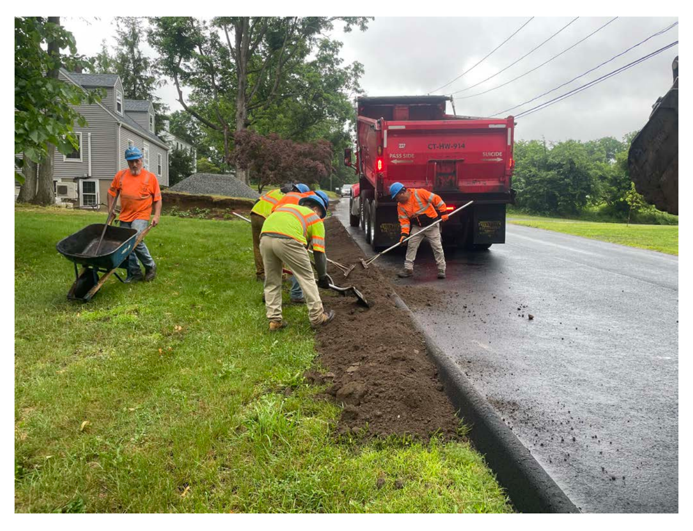
Picture 5: Laydon raking out loam they have placed on the west side of asphalt curbing they placed yesterday east of the 230 Maple Avenue, Durham, property. View to the north.

Contractor: Ludlow Construction, Laydon Industries