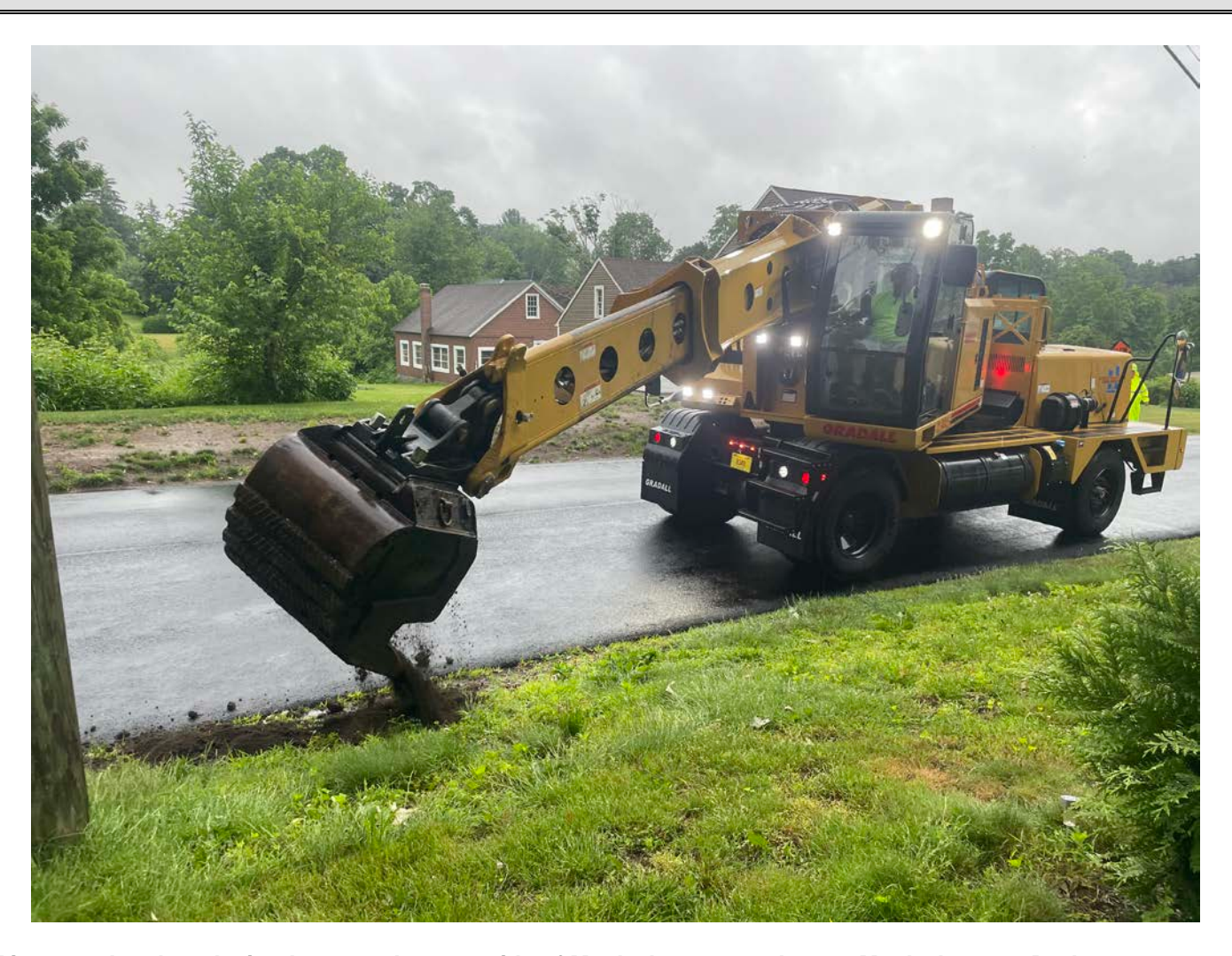
Picture 2: Laydon placing loam on the west side of Maple Avenue on the 248 Maple Avenue, Durham property. View to the southeast.

Contractor: Ludlow Construction, Laydon Industries 5 of 14