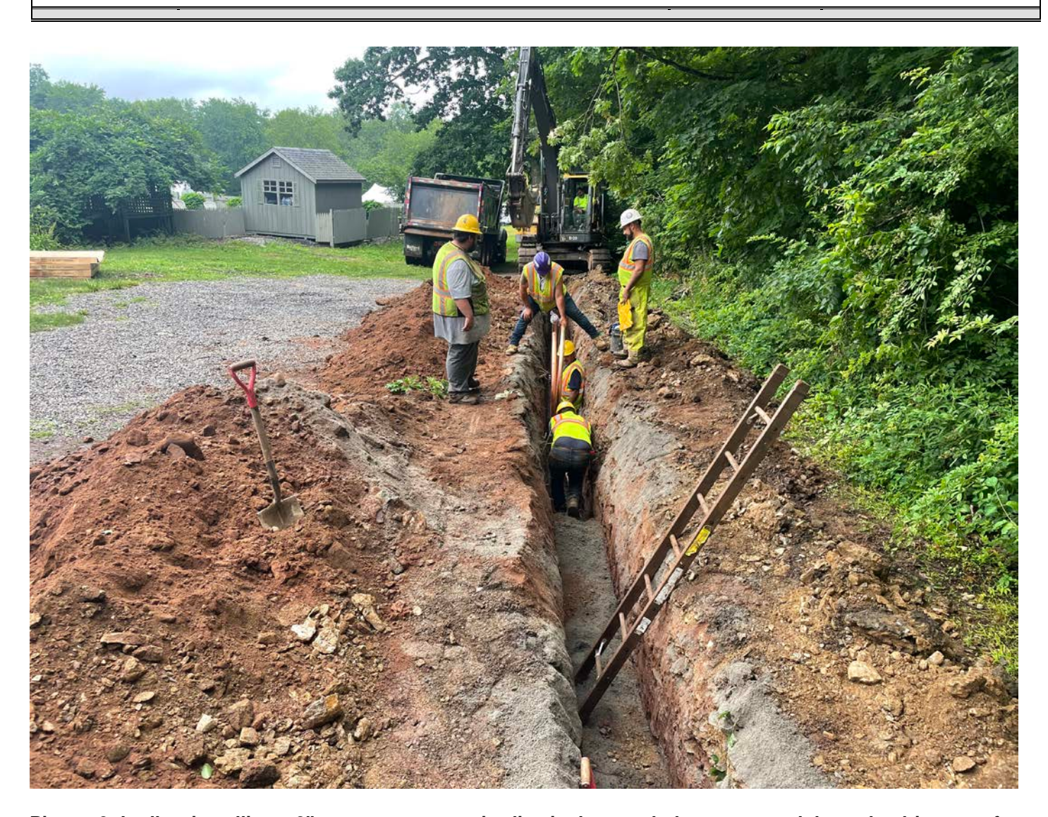
Picture 9: Ludlow installing a 2" copper water service line in the trench they excavated down the driveway of the 114 Maiden Lane, Durham, property. View to the south.

Contractor: Ludlow Construction, Laydon Industries Page: 12 of 14