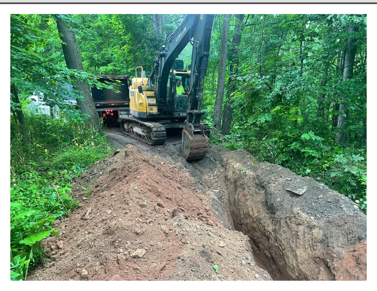
Picture 8: Ludlow excavating down the driveway of the 114 Maiden Lane, Durham, property as they install a 2" copper water service line. View to the southwest.

Contractor: Page: 11 of 14 Ludlow Construction, Laydon Industries