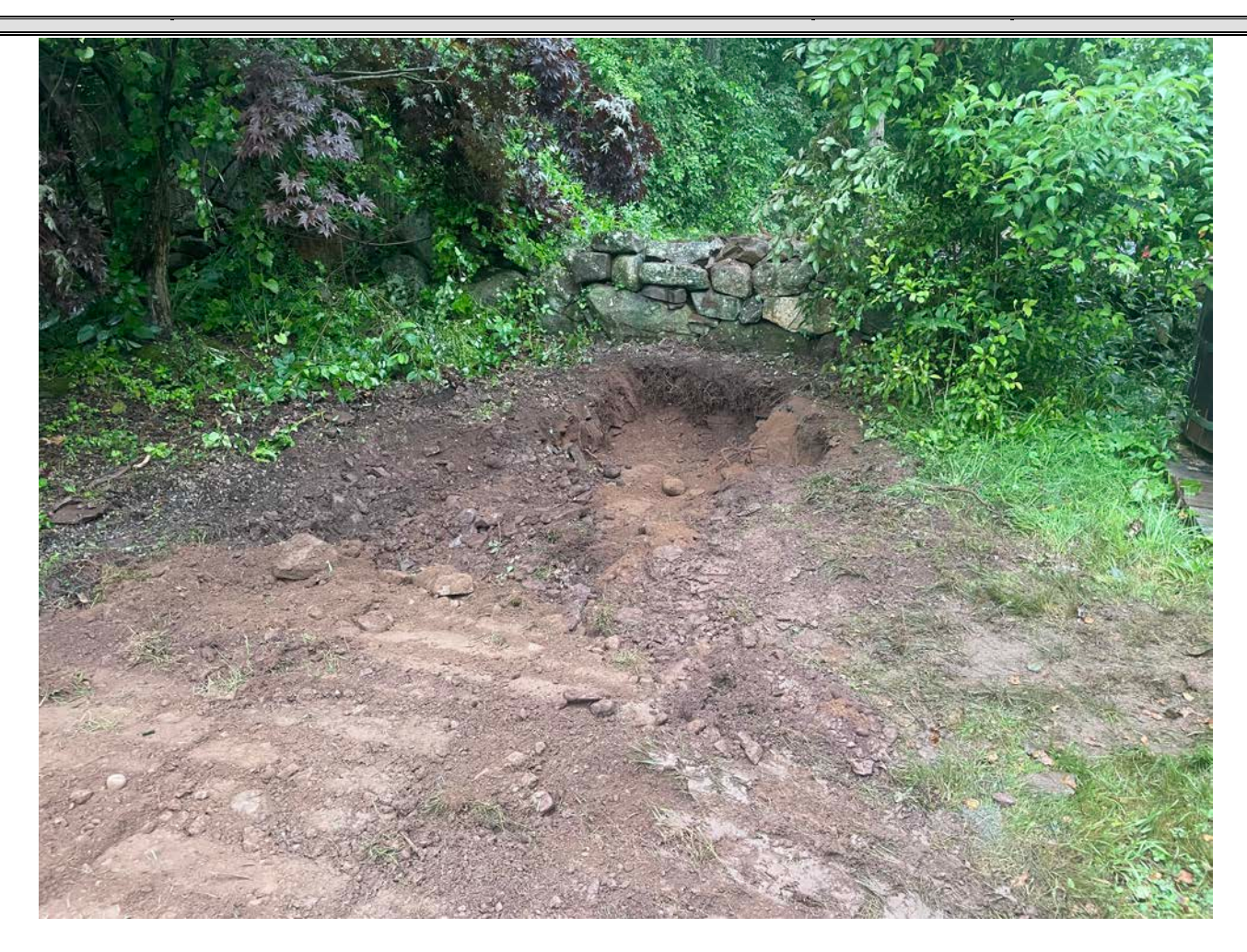
Picture 6: The east side of a stone wall located next to the northwest corner of the 114 Maiden Lane, Durham, residence after Ludlow installed a 2" copper water service line and backfilled over it. View to the west.

Contractor: Ludlow Construction, Laydon Industries