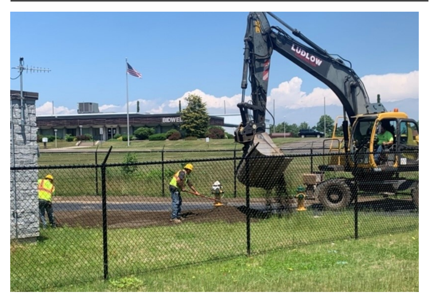
Picture 3: Ludlow at the Talcott Ridge Booster Station placing topsoil with an excavator, and having Ludlow personnel to adjust the topsoil placement using rakes.