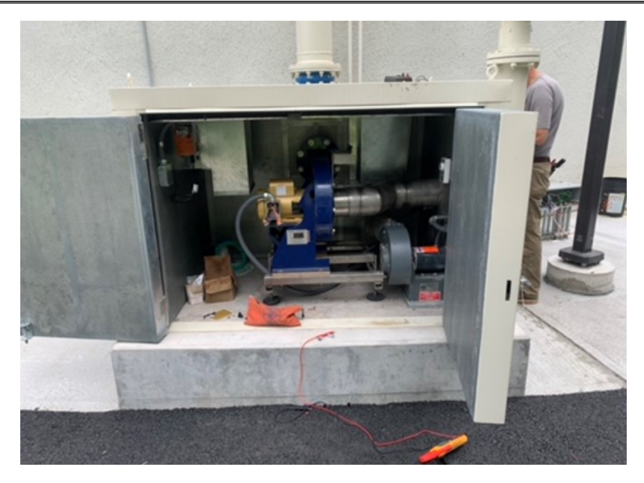
Picture 4: Ludlow at end of the common driveway (Water Tank) working on the wiring of the tank aeration blower.

Res. Representative: A. Mora Date: 6/17/22