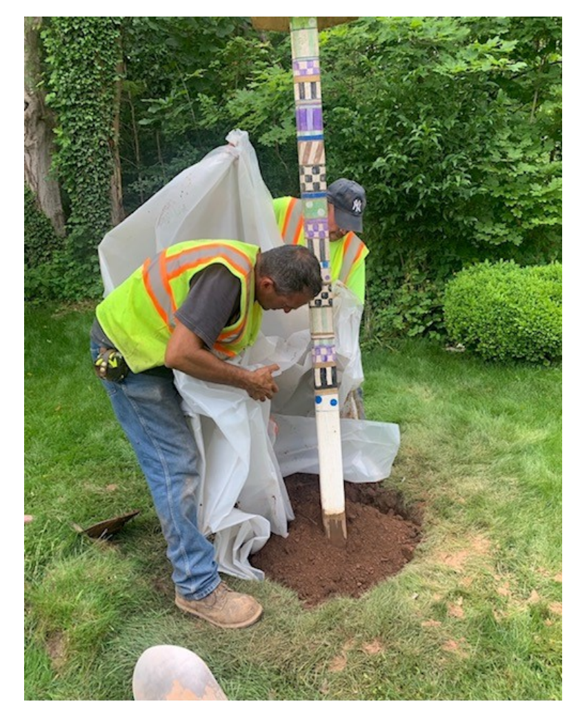
Picture 7: Ludlow at 29 Maiden Lane Backfilling the excavated area, and in the process of fully restoring the area to its previous state.