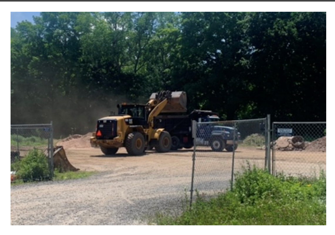
Picture 5: Ludlow loading topsoil onto a loading truck to transported to the Talcott Ridge Booster Station.

Contractor: Ludlow Construction Page: 7 of 9