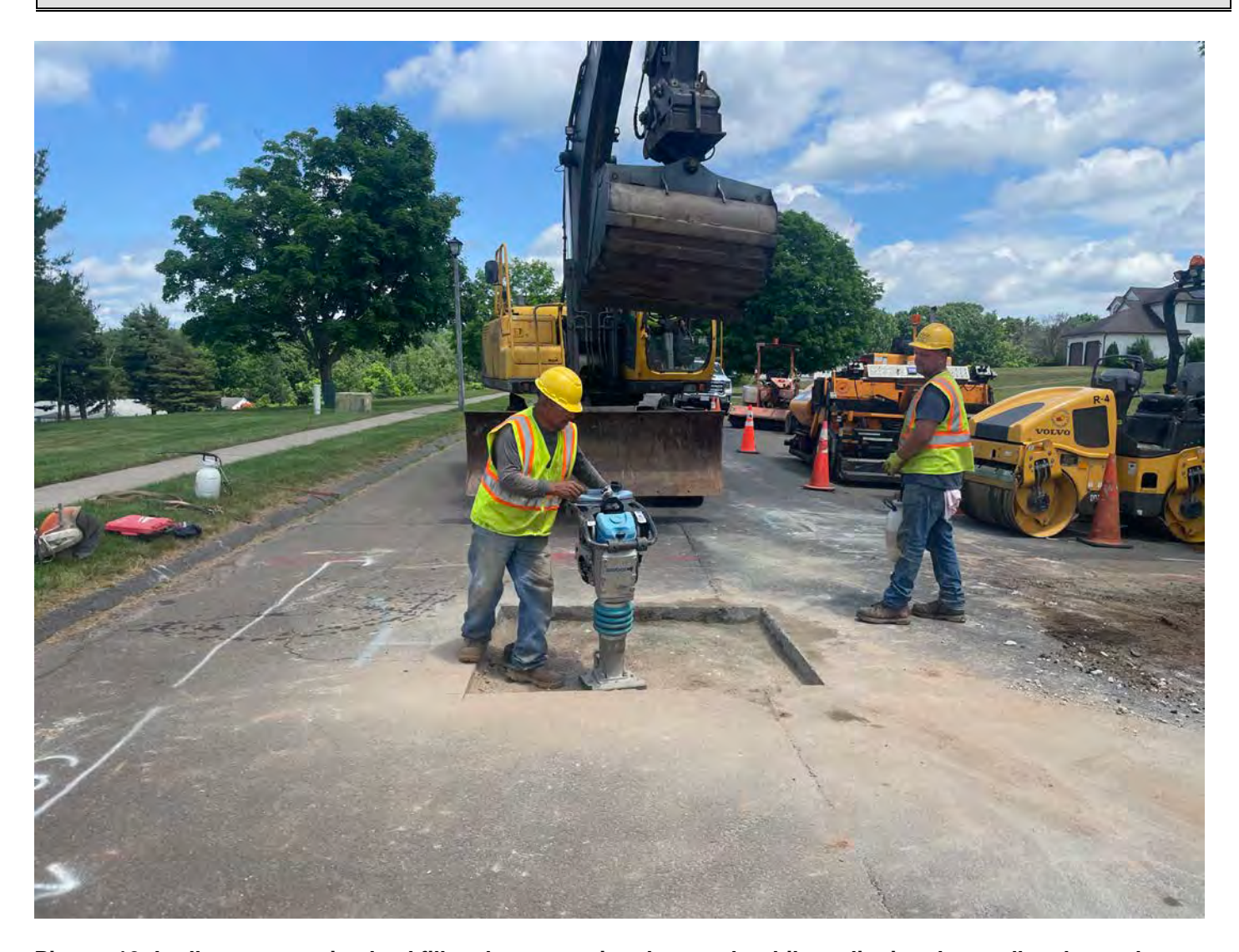
Picture 12: Ludlow compacting backfill at the excavation they made while realigning the roadbox located at Station 44+64 on Talcott Ridge Drive. View to the east.