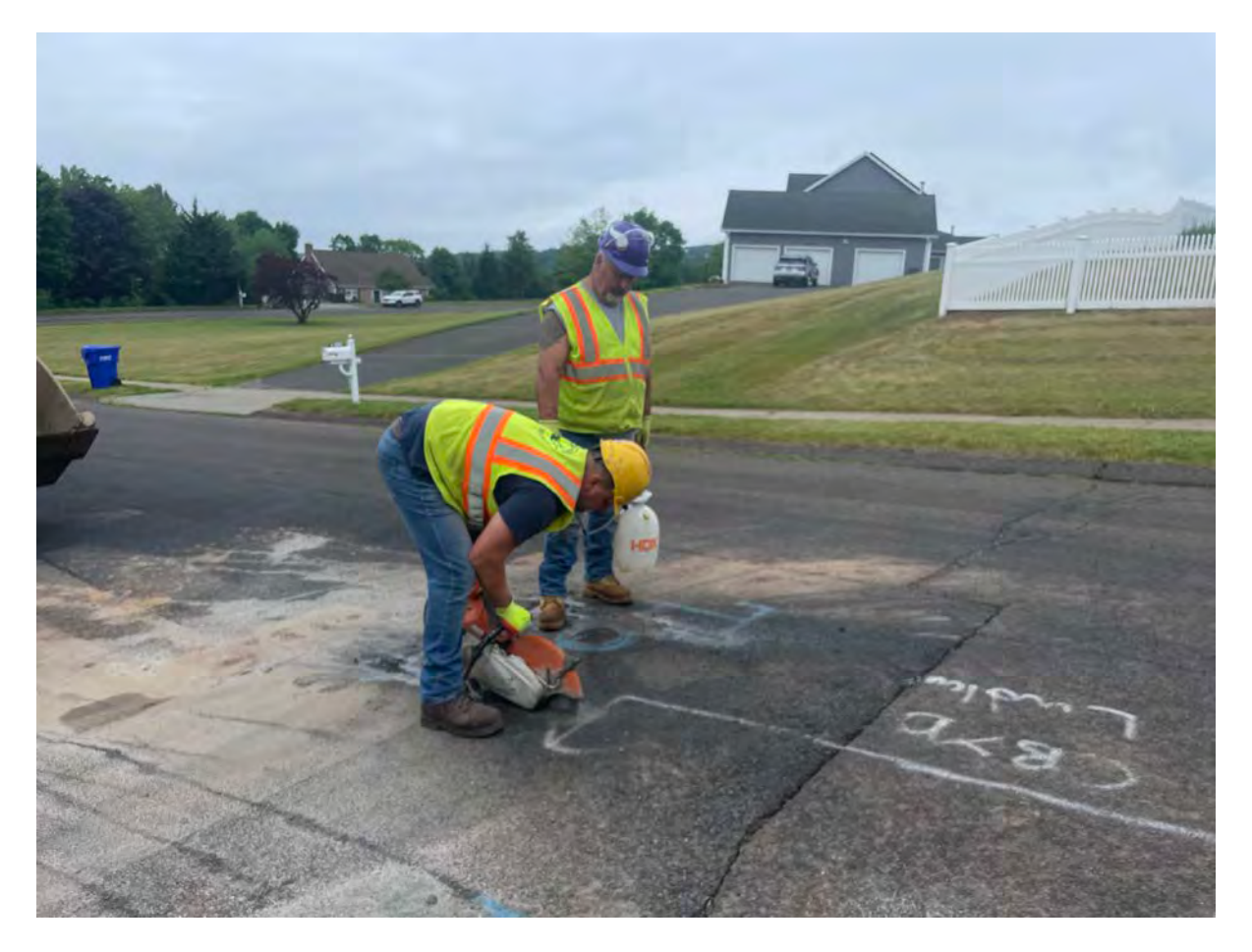
Picture 1: Ludlow saw-cutting around the roadbox located on Watch Hill Drive near Station 607+12 as they prepare to realign it. View to the northeast.