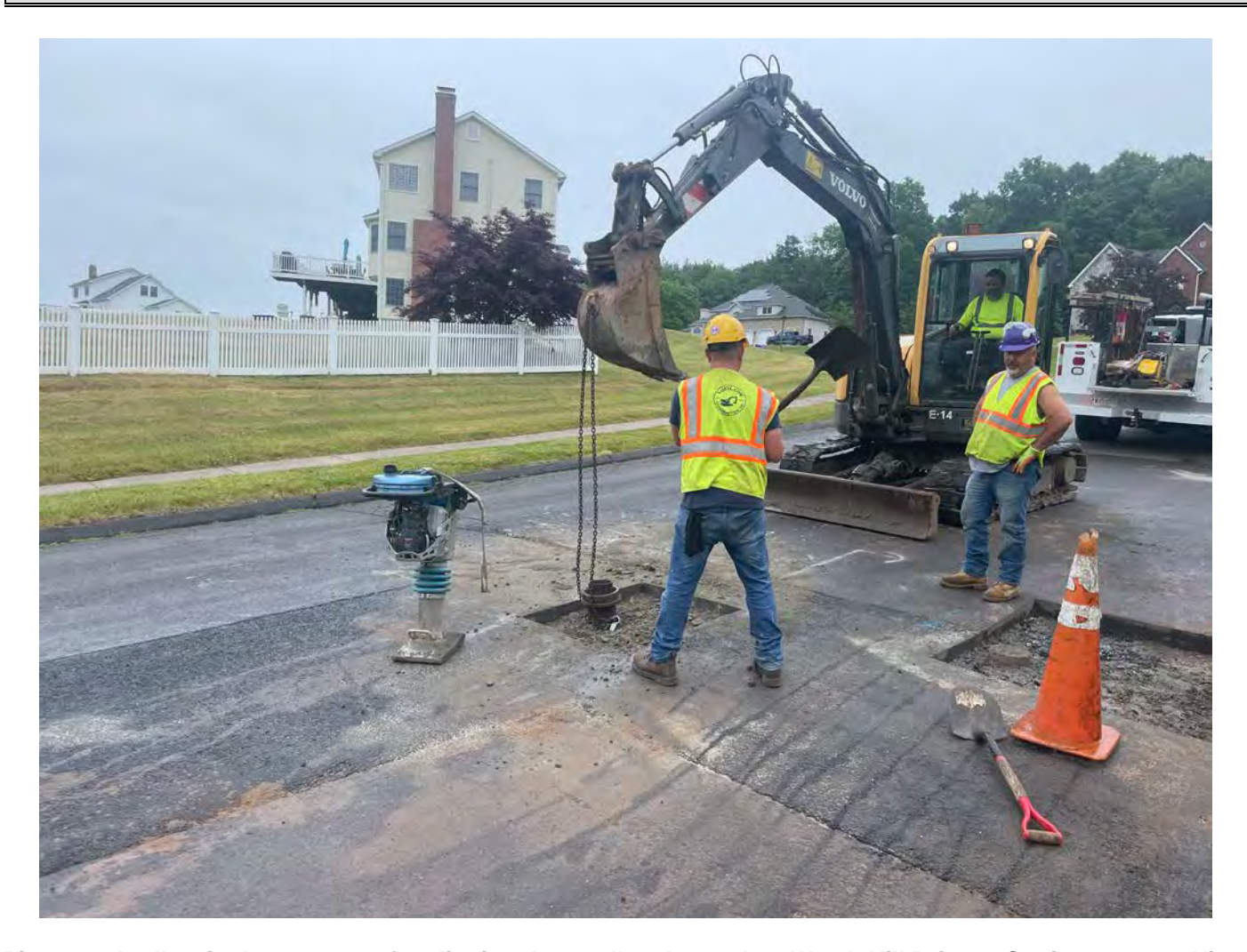
Picture 2: Ludlow in the process of realigning the roadbox located on Watch Hill Drive at Station 607+12. View to the southeast.