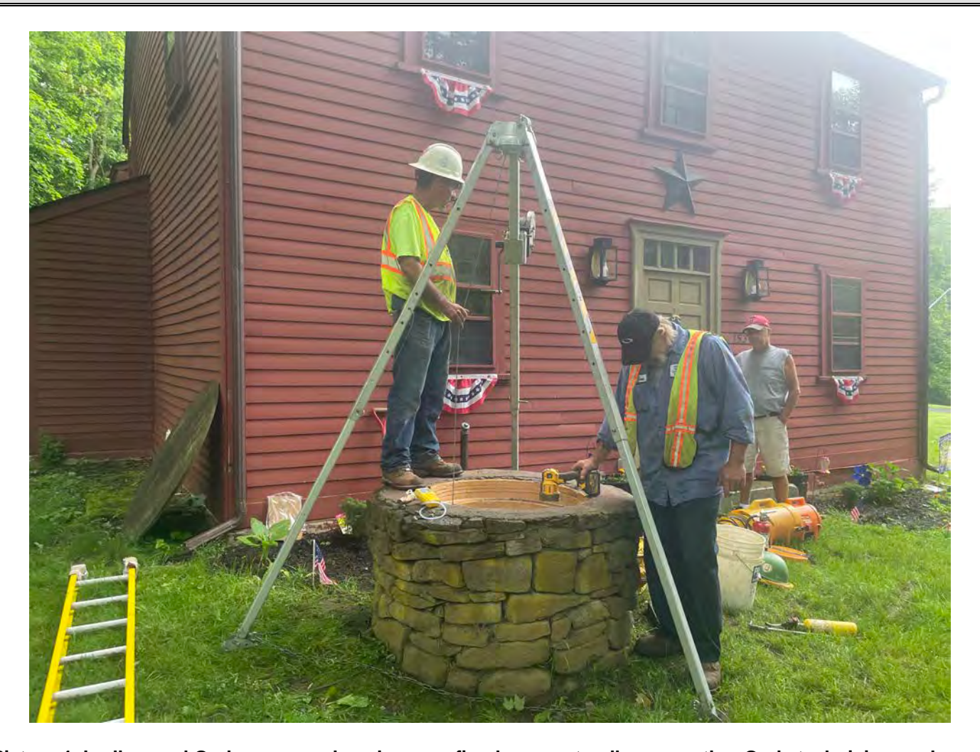
Picture 4: Ludlow and Grela personnel work on confined space standby as another Grela technician works inside of the well tile located on the west side of the 153 Main Street, Durham, residence. View to the southeast.