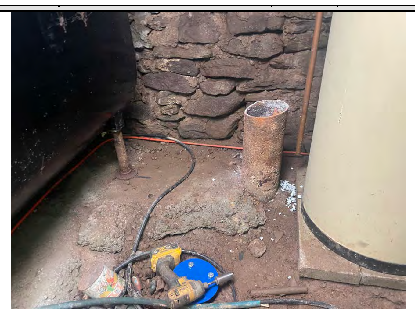
Picture 10: The well located on the north side of the 176 Maple Avenue, Durham, residence where Grela has decommissioned the well by filling it with sand and bentonite chips. View to the north.