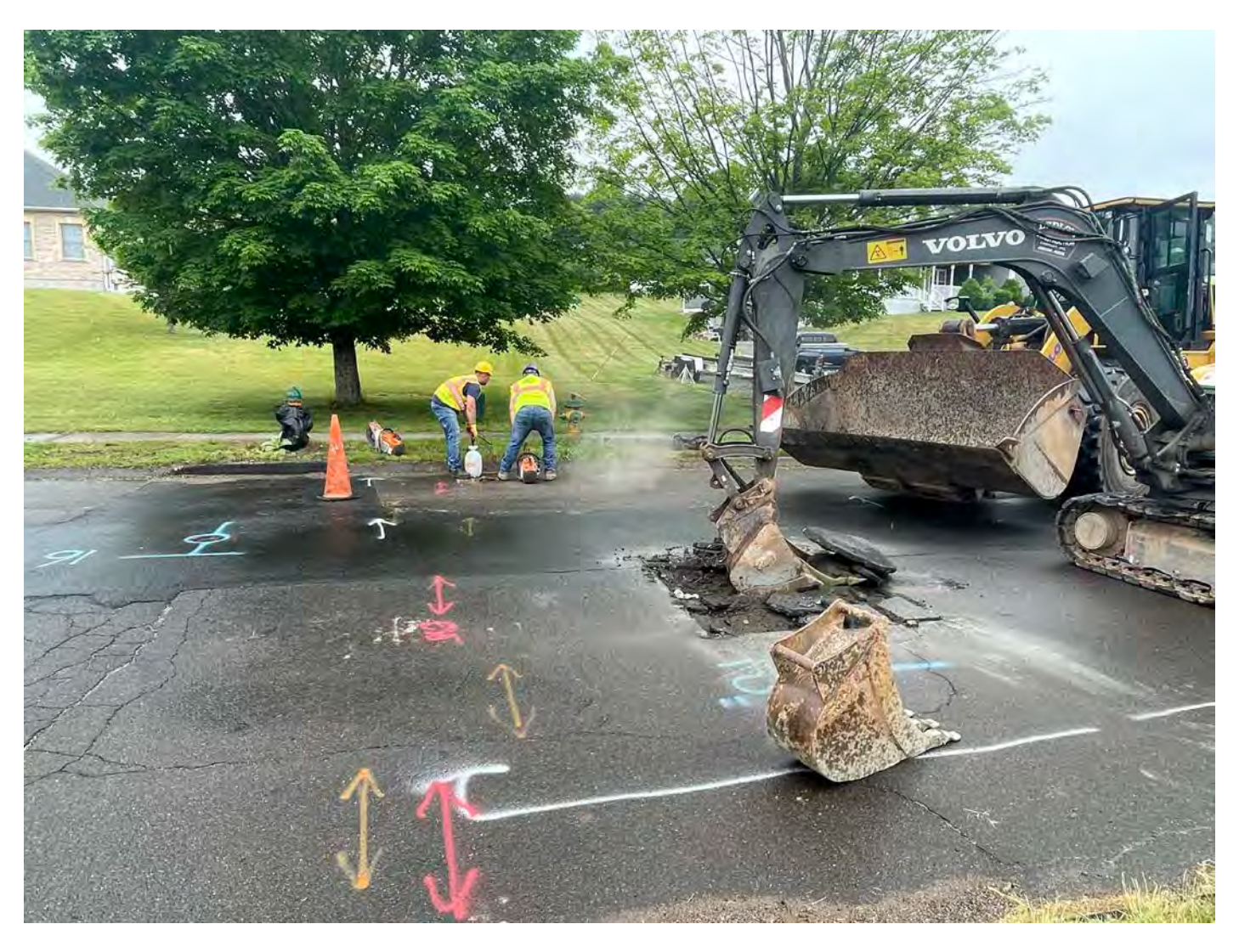
Picture 6: Ludlow excavating to realign a road box on the north side of Talcott Ridge Drive at Station 44+53. View to the south.

Contractor: Ludlow Construction Page: 9 of 17