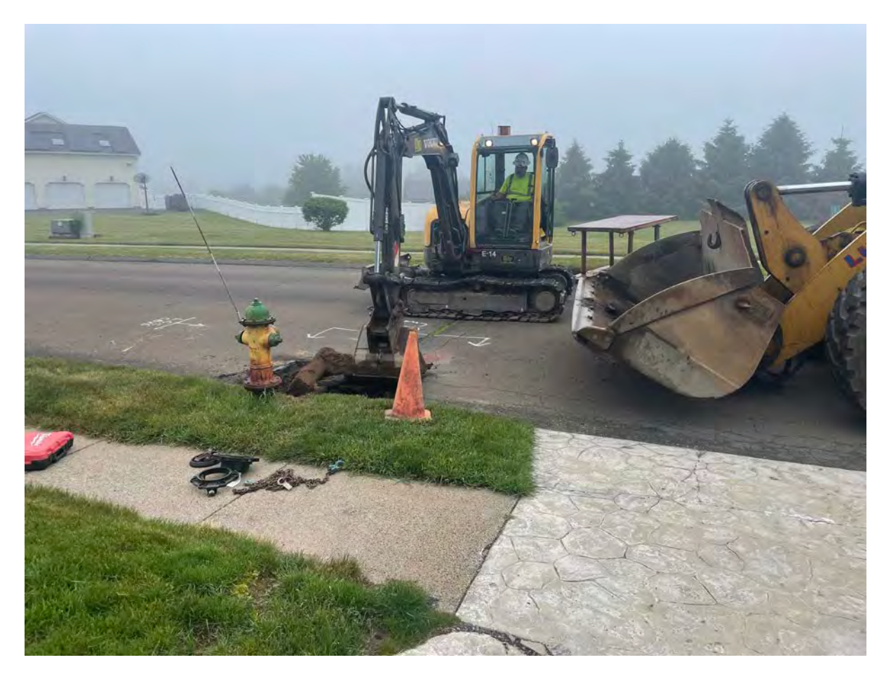
Picture 1: Ludlow excavating to remove the old hydrant located on the south of Watch Hill Drive at Station 604+31. View to the north.