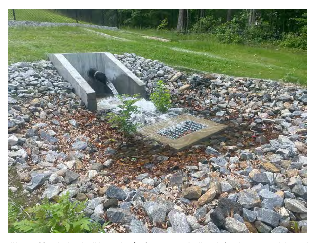
Picture 7: Water exiting the headwall located at Station 11+72 as Ludlow drains the water tank located east of the Shared Access Driveway in Middletown. View to the southeast.

Contractor: Ludlow Construction Page: 10 of 15