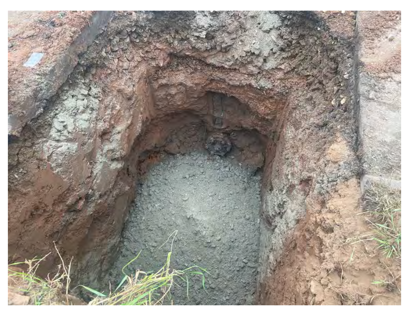
Picture 4: DIP plug that Ludlow placed on the gate valve located at Station 604+31 on Watch Hill Drive in Middletown. View to the north.

Contractor: Ludlow Construction Page: 7 of 15