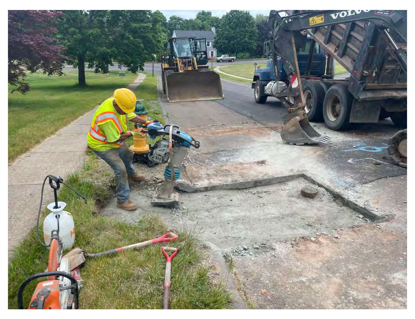
Picture 12: Ludlow backfilling the excavation they made during the removal of a hydrant Station 607+12 on Watch Hill Drive. View to the north.

Contractor: Ludlow Construction Page: 15 of 15