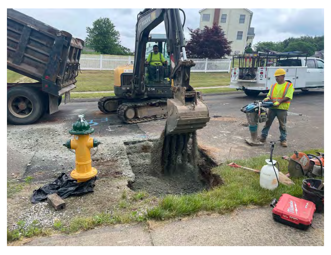
Picture 11: Ludlow backfilling the excavation they made during the removal of a hydrant Station 607+12 on Watch Hill Drive. View to the southeast.

Contractor: Ludlow Construction Page: 14 of 15