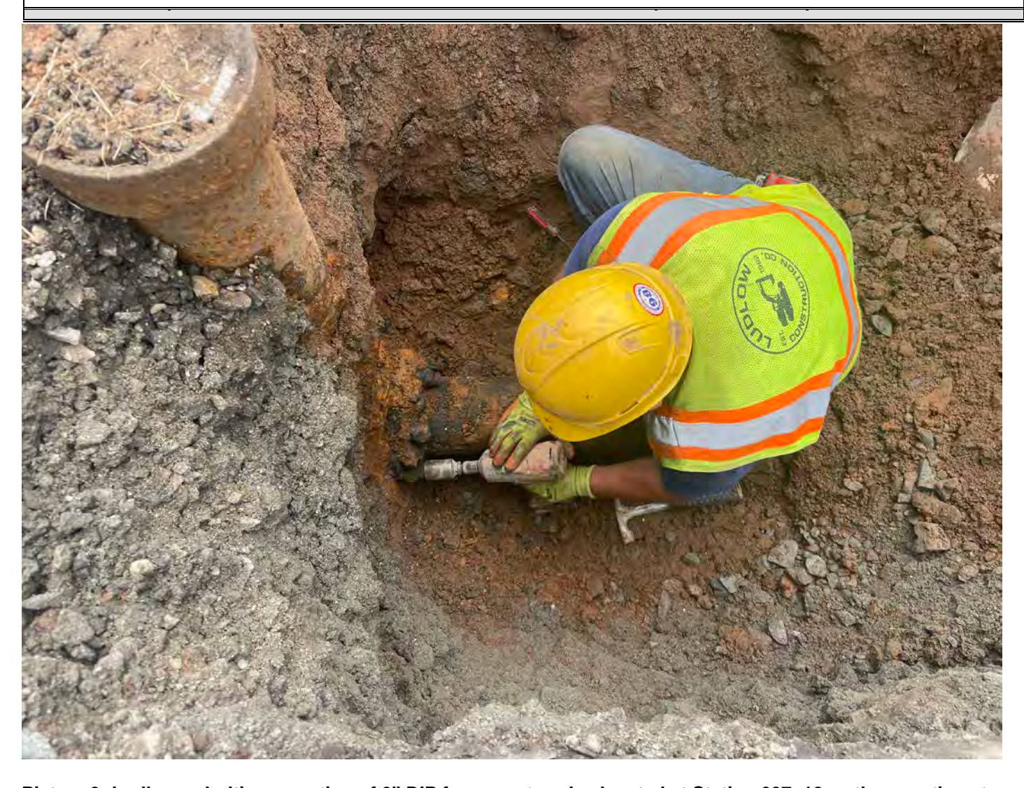
Picture 9: Ludlow unbolting a section of 6" DIP from a gate valve located at Station 607+12 as they continue to decommission the old hydrant located at the same station. View to the south.

Contractor: Ludlow Construction Page: 12 of 15