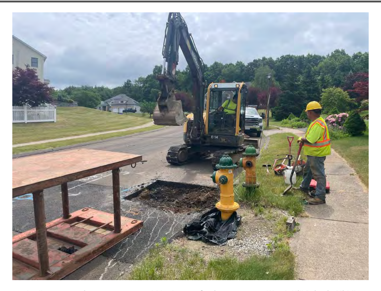
Picture 8: Ludlow excavating to remove an old hydrant at Station 607+12 on Watch Hill Drive in Middletown. View to the south.