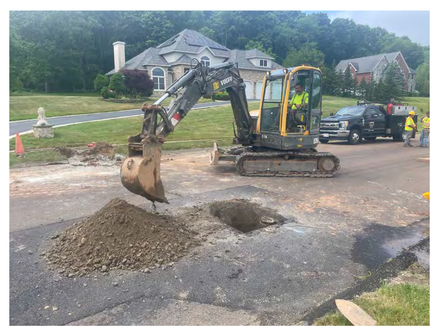
Picture 6: Ludlow excavating to realign a road box on the north side of Watch Hill Drive at Station 604+31. View to the southwest.

Contractor: Ludlow Construction Page: 9 of 15