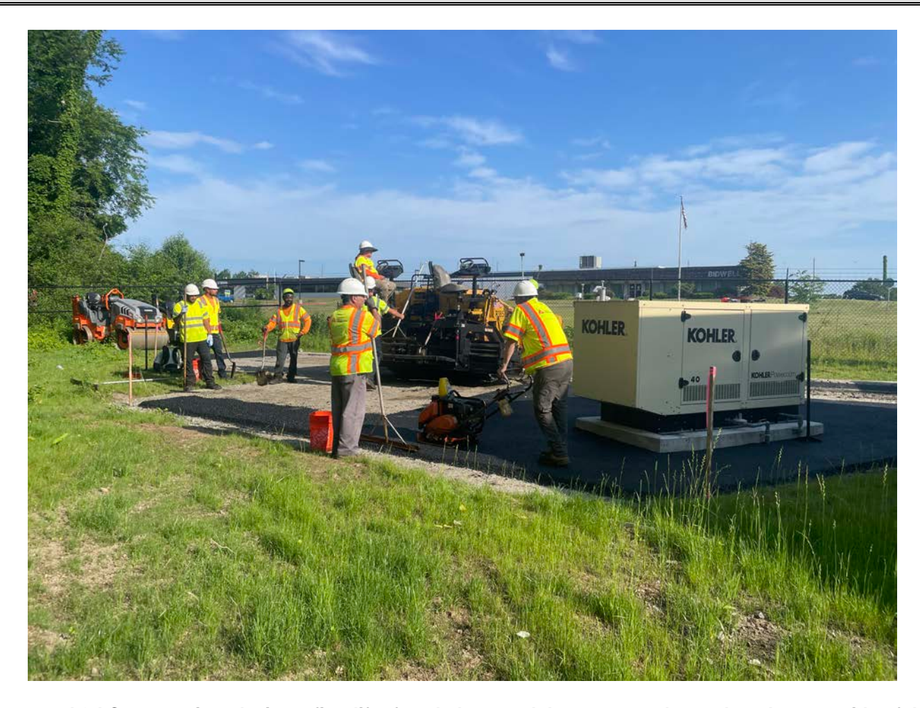
Picture 3: A&J Construction placing a first lift of asphalt around the generator located on the west side of the Booster Station. View to the northwest.