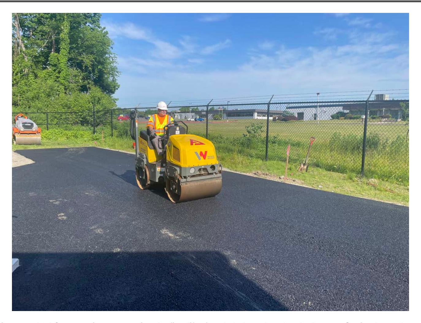
Picture 4: A&J Construction compacting the first lift of asphalt they placed at the Booster Station located on S. Main Street in Middletown. View to the west.