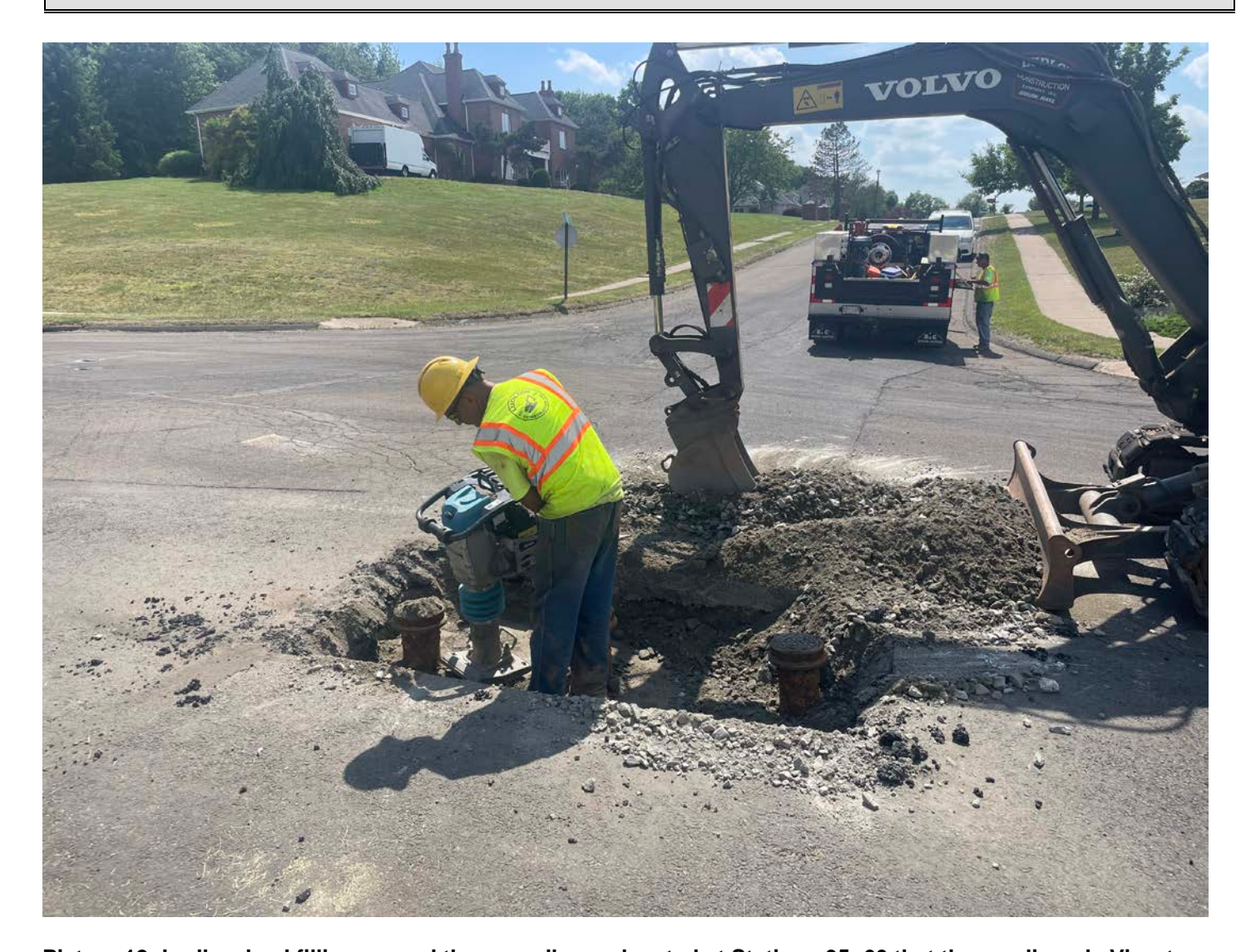
Picture 12: Ludlow backfilling around three roadboxes located at Station \sim 35+60 that they realigned. View to the south.