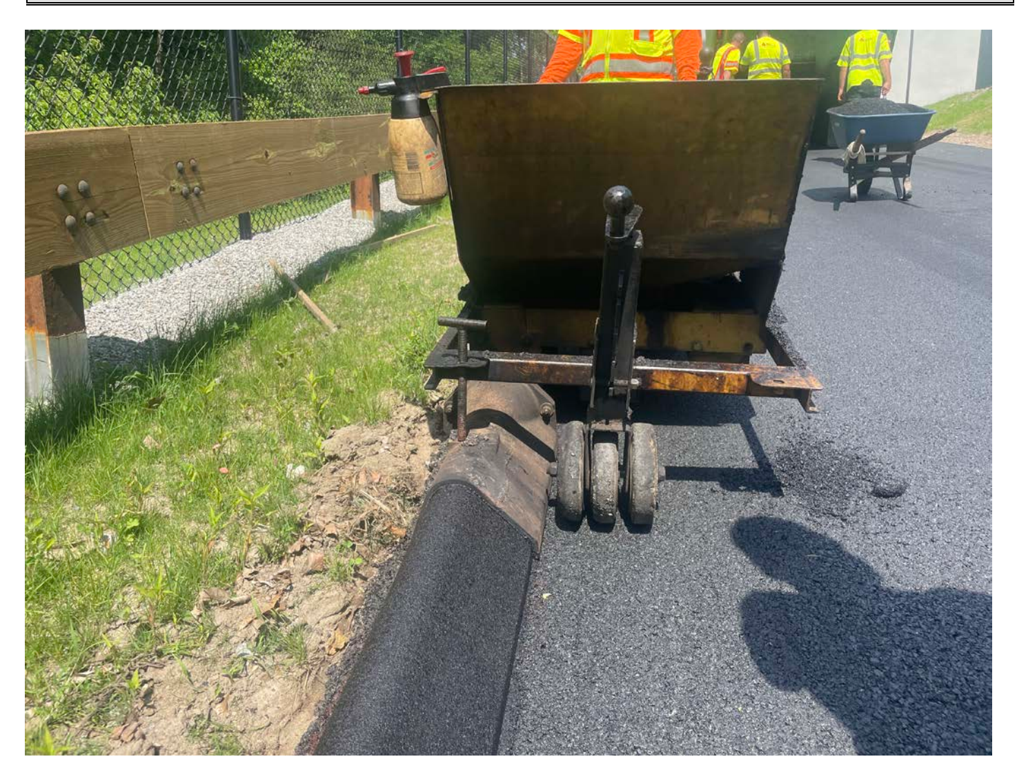
Picture 14: Asphalt curbing that A&J Construction is placing on the north side of the Shared Access Driveway in Middletown. View to the east.

Contractor: Ludlow Construction Page: 17 of 17