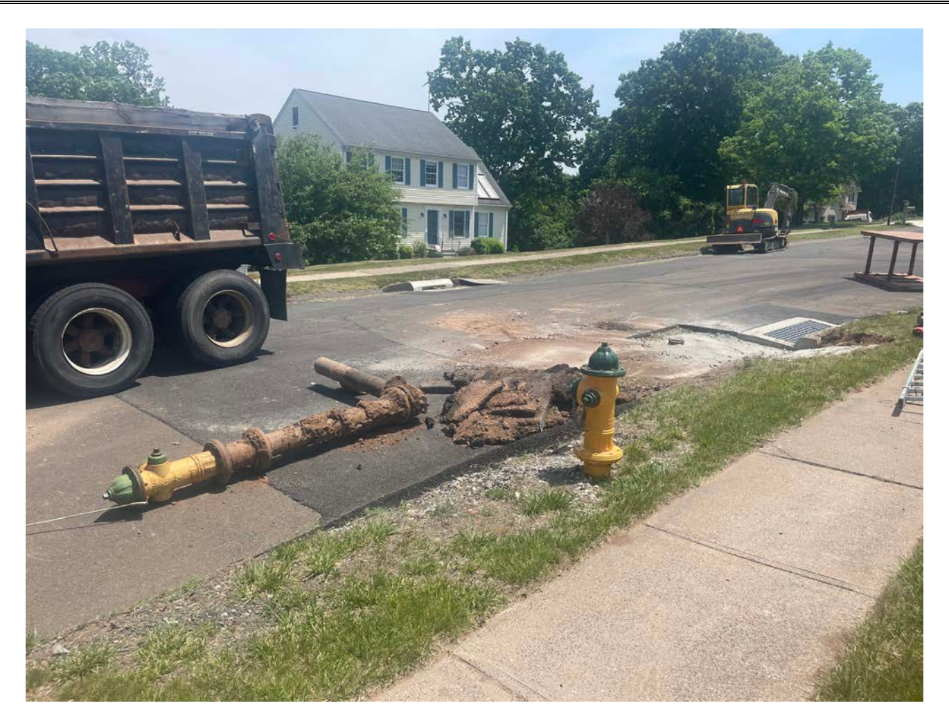
Picture 10: Station 36+28 where Ludlow removed an existing hydrant and cut and capped the 6" DIP water line that fed the hydrant. View to the east.