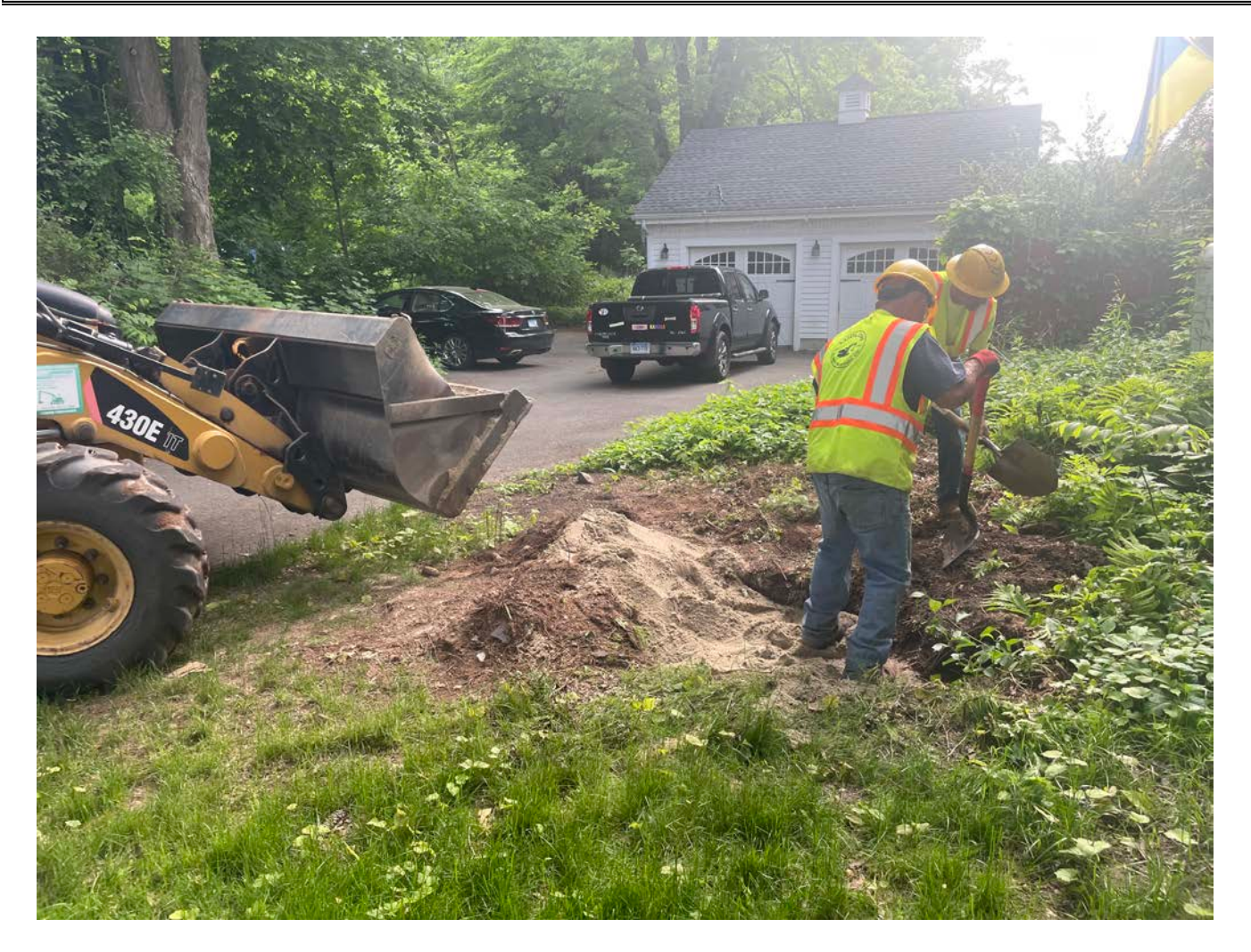
Picture 2: Ludlow backfilling over the well located on the north side of the 313 Main Street residence that was decommissioned by Grela. View to the east.