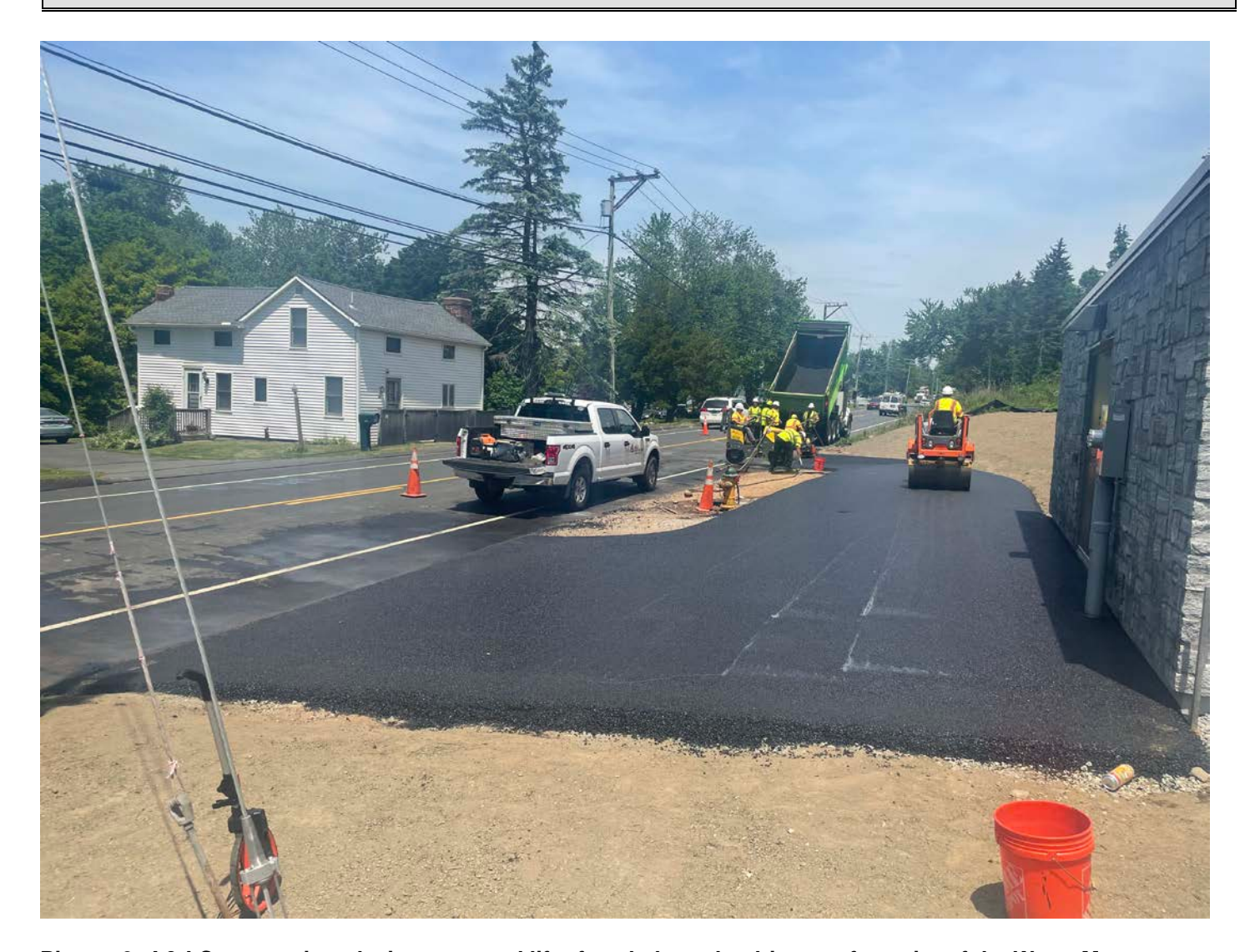
Picture 9: A&J Construction placing a second lift of asphalt on the driveway footprint of the Water Meter Building on S. Main Street, Middletown. View to the north.