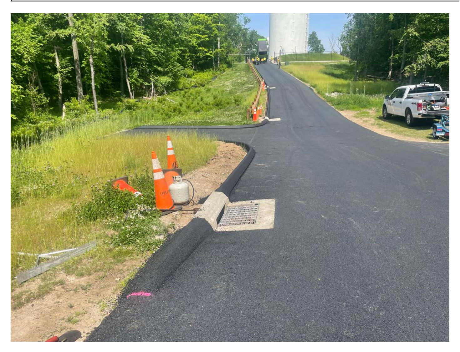
Picture 13: Asphalt curbing that A&J Construction placed on the north side of the Shared Access Driveway in Middletown. View to the east.