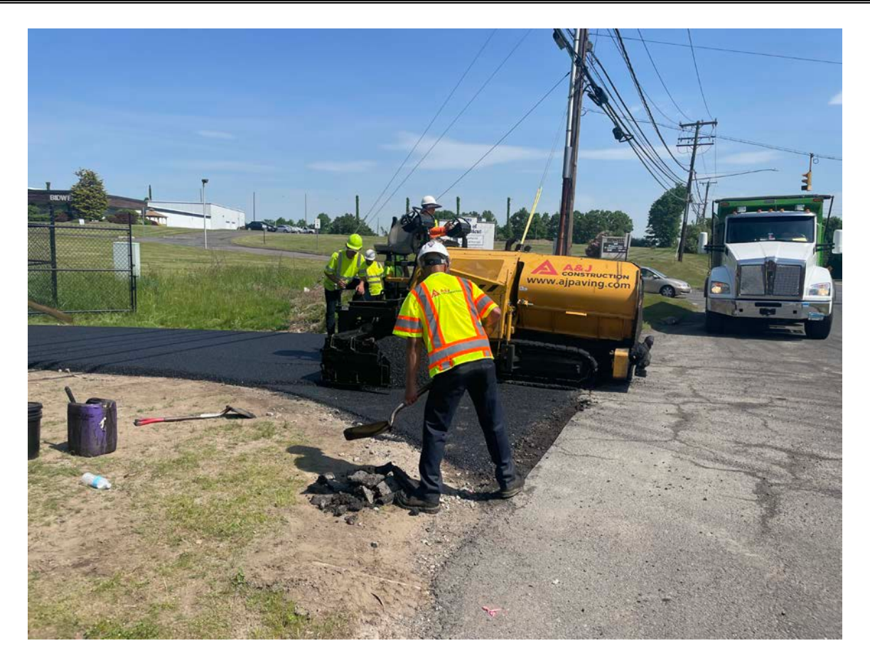
Picture 7: A&J Construction placing a second lift of asphalt on the driveway footprint of the Booster Station where it meets the west edge of S. Main Street. View to the north.