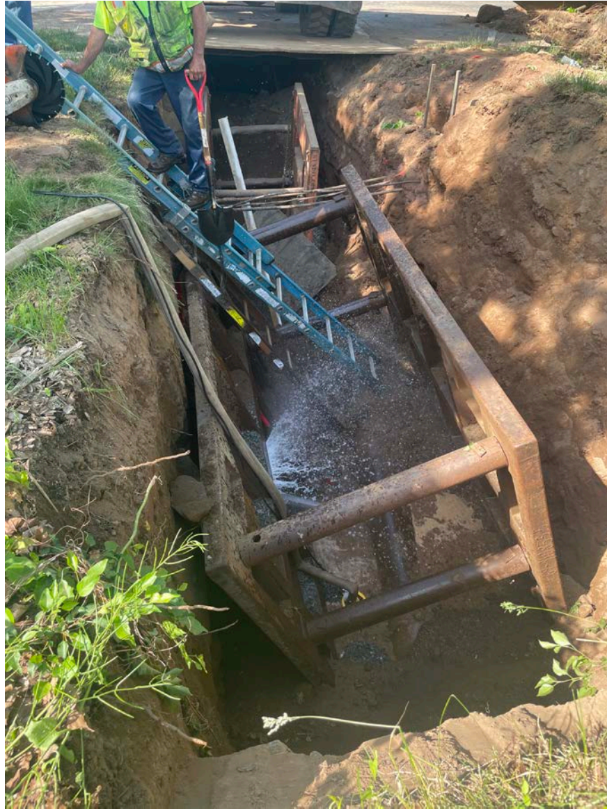
Picture 7: 12" DIP water line that Ludlow slit with a cutoff saw to purge it of water so they can connect it to the 16" DIP water line at Station 40+41 on Talcott Ridge Drive, Middletown. View to the south.