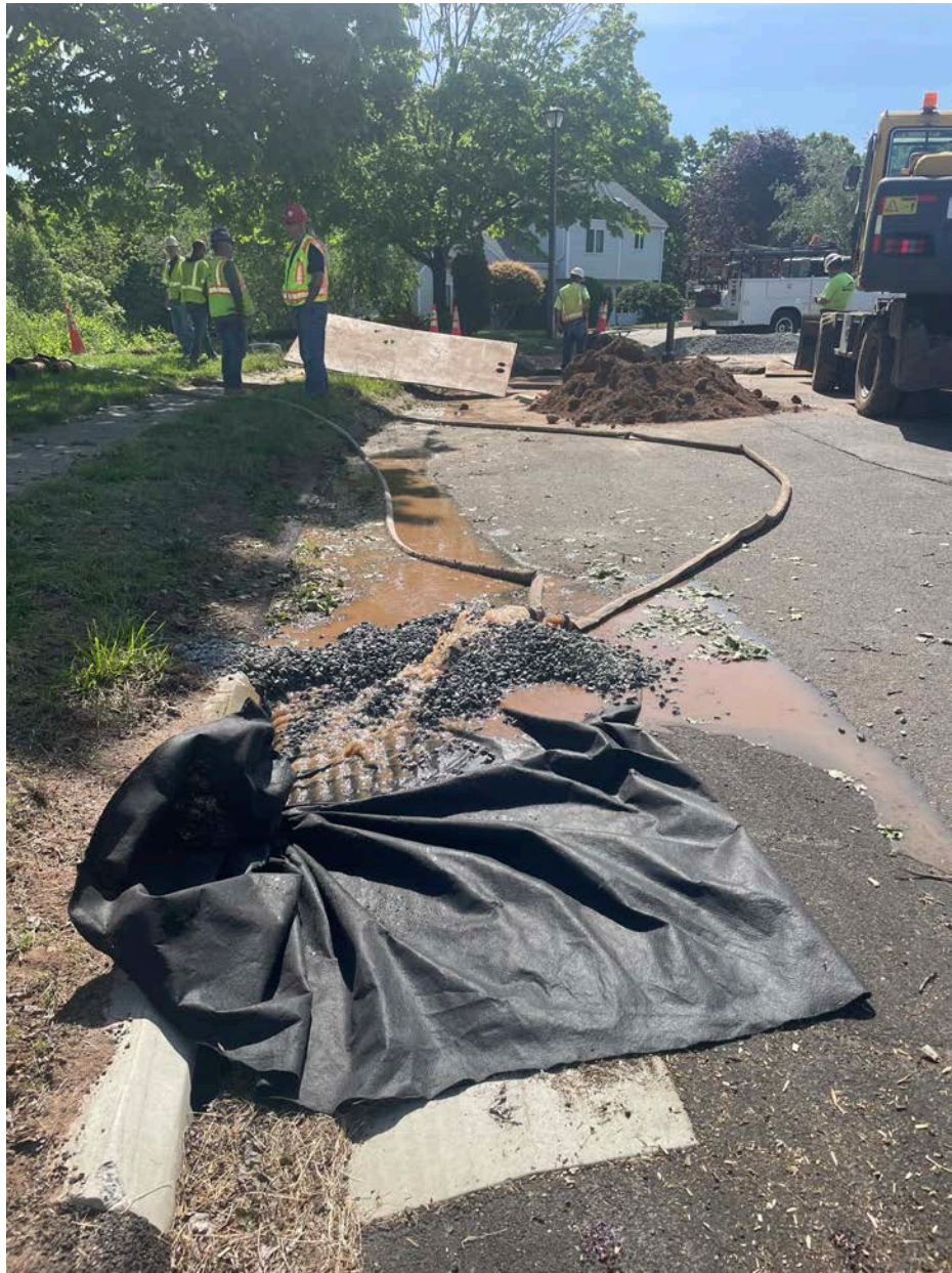
Picture 8: Ludlow discharging water being pumped from the excavation at Station 40+41 into a catch basin located several feet to the west through filter fabric. View to the east.