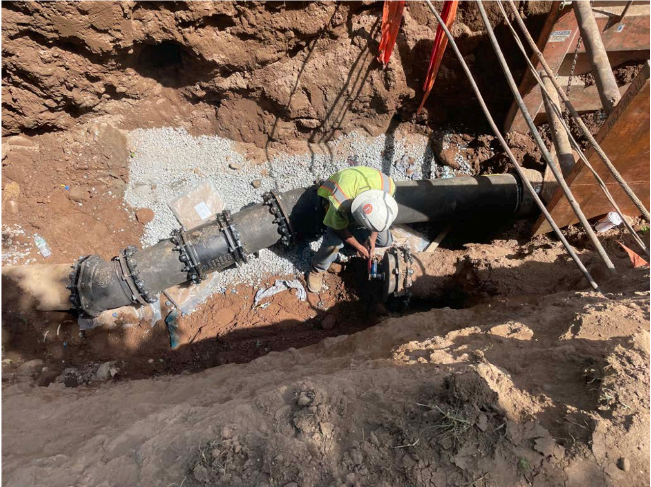
Picture 11: Ludlow installing a corporation stop on the DIP plug they installed on the cut end of the 12" DIP water line located at Station 40+41 . View to the east.