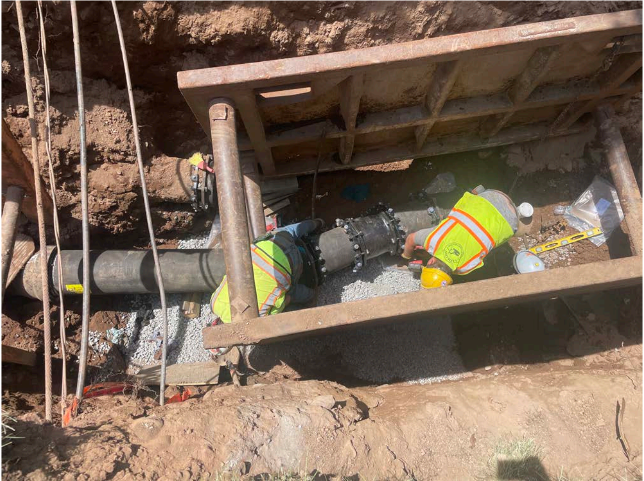
Picture 10: Ludlow making the final connection at Station 40+41 between the 12" DIP water line coming from Round Hill Road and the 16" DIP water line located on Talcott Ridge Drive. View to the west.