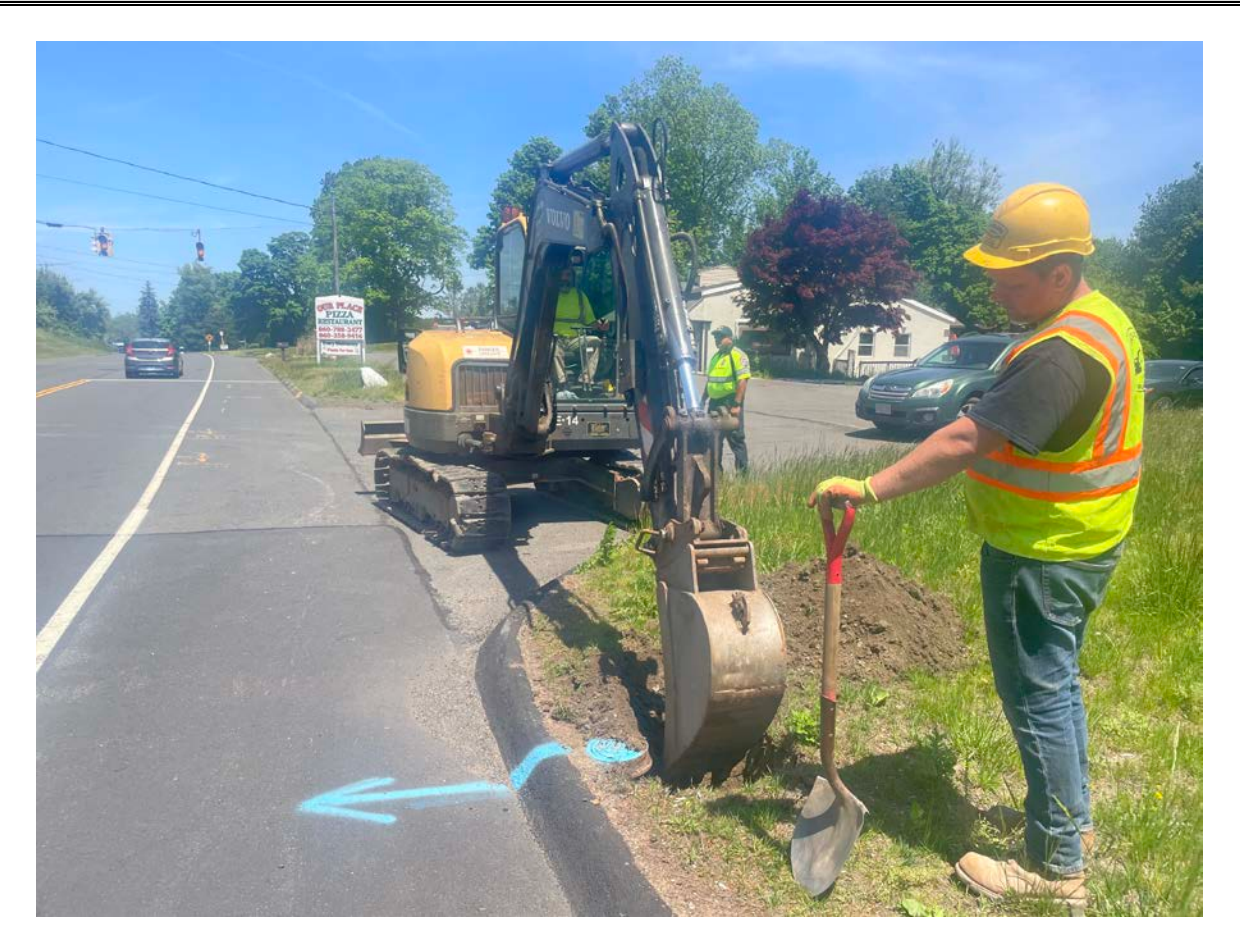
Picture 8: Ludlow excavating around the road box located at Station 750+59 on S. Main Street, Durham as they work to center it over the valve stem to an 8" M.J. gate valve. View to the north.