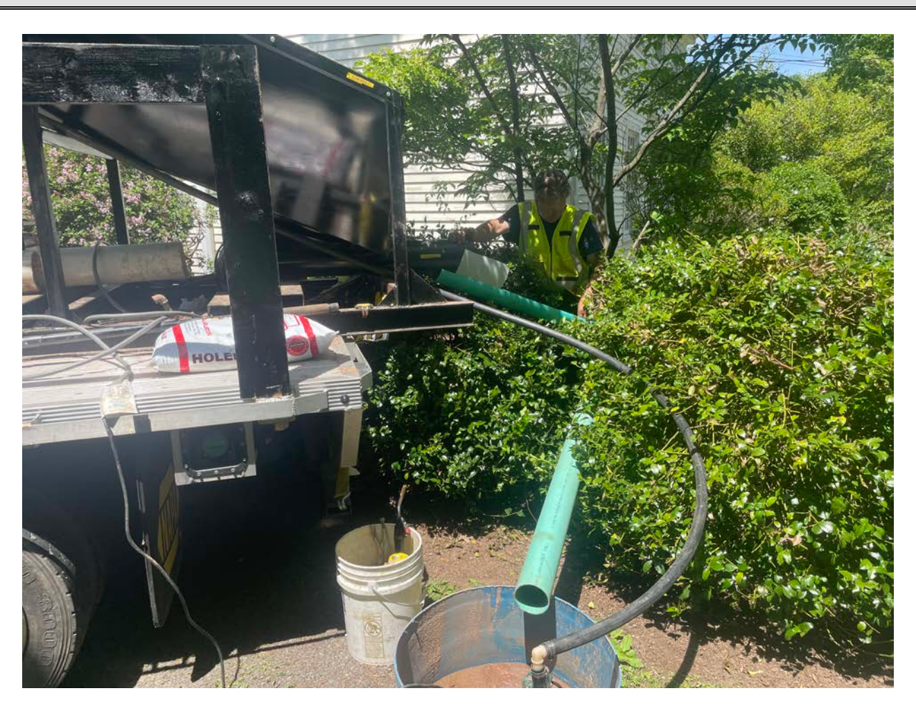
Picture 7: Grela placing sand into the well located on the east side of the 261 Main Street, Durham property as part of well decommissioning activities. View to the northwest.

Contractor: Ludlow Construction Page: 11 of 15