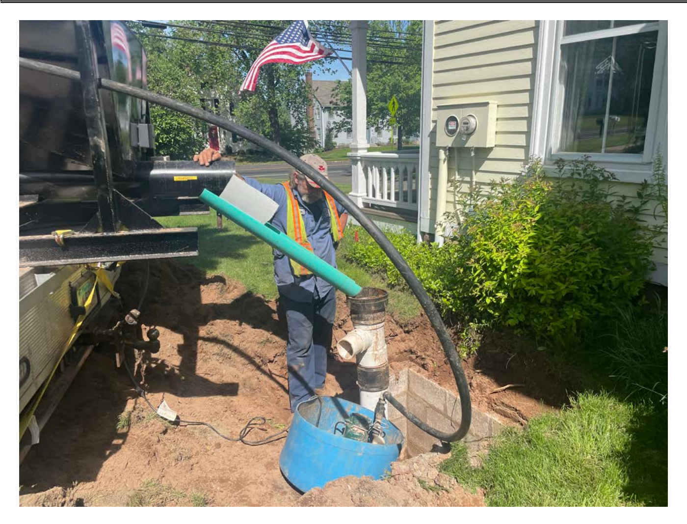
Picture 5: Grela placing sand into the well located on the south side of the 265 Main Street, Durham residence as part of well decommissioning activities. View to the northwest.