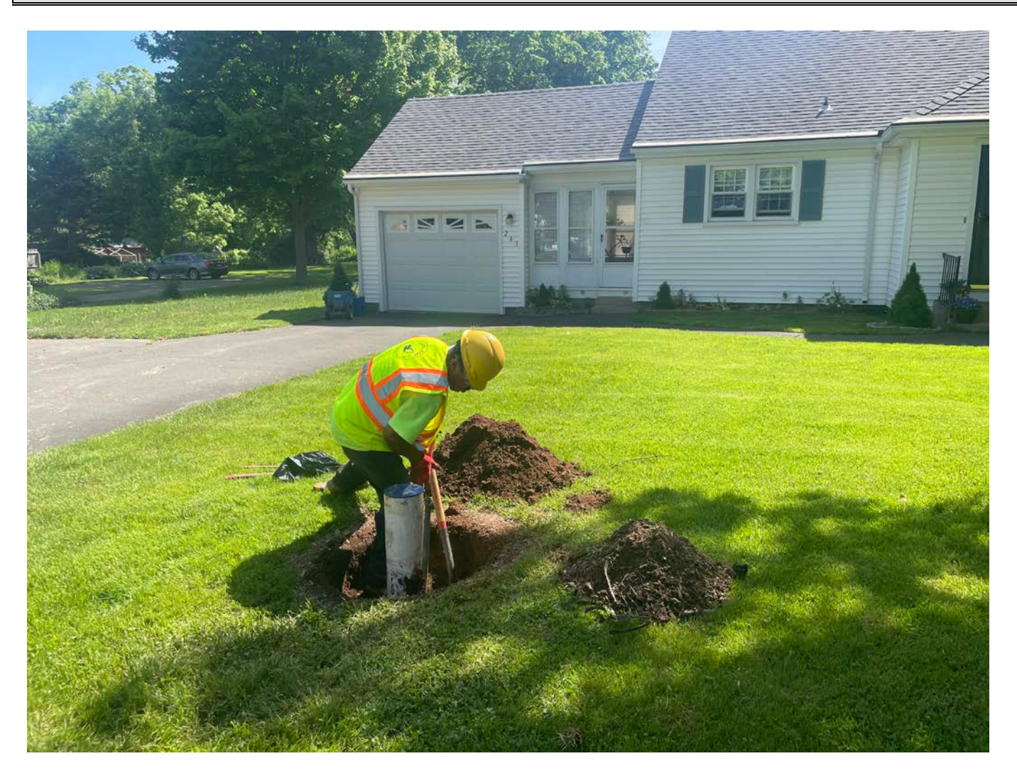
Picture 4: Ludlow hand-excavating around the 6" PVC casing of the well located on the west side of the 261 Main Street, Durham residence. This is being done to provide Grela room to cut the casing 2' below surface grade as part of well decommissioning activities. View to the northeast.