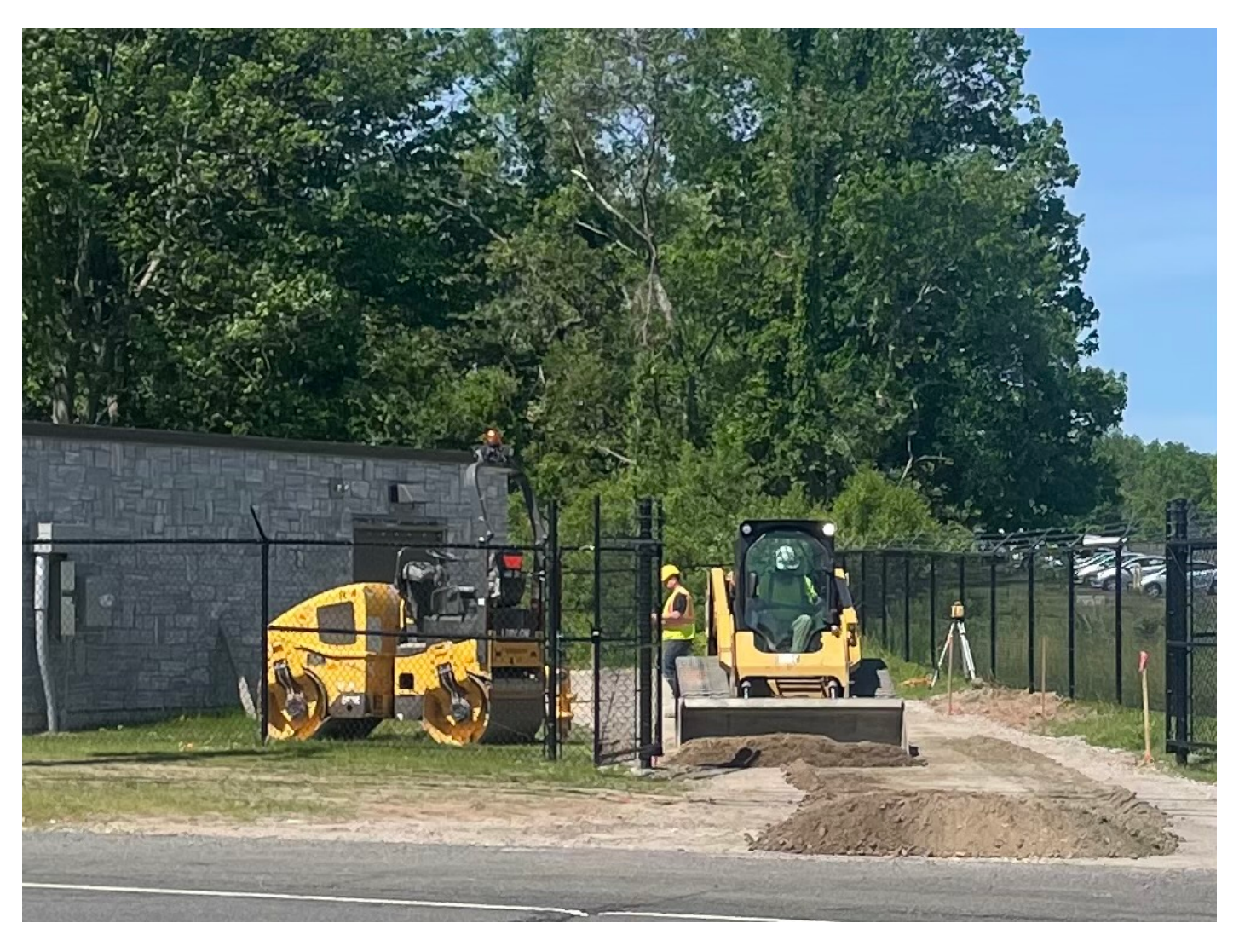
Picture 11: Ludlow the footprint of the driveway at the Booster Station located on S. Main Street in Middletown in preparation of paving. View to the west.

Contractor: Ludlow Construction Page: 15 of 15