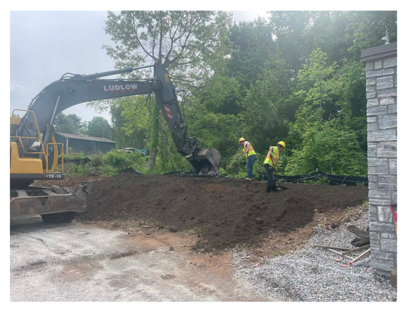
Picture 3: Ludlow placing and grading loam on the north side of the Water Meter Building located at Station 124+80 on S. Main Street, Middletown. View to the northeast.