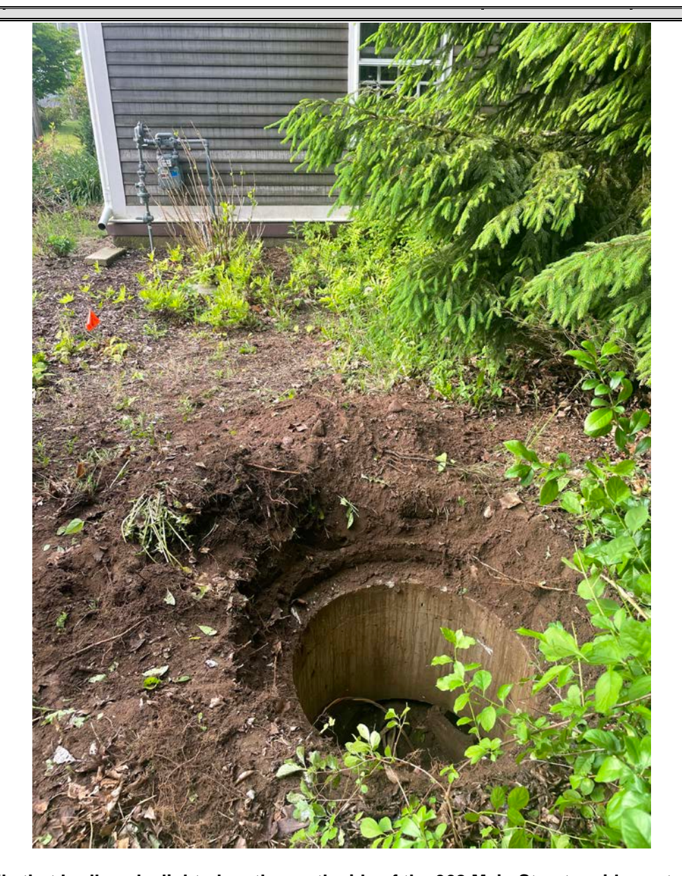
Picture 1: Well tile that Ludlow daylighted on the north side of the 308 Main Street residence to assist Grela in decommissioning the well located inside of it. View to the south.