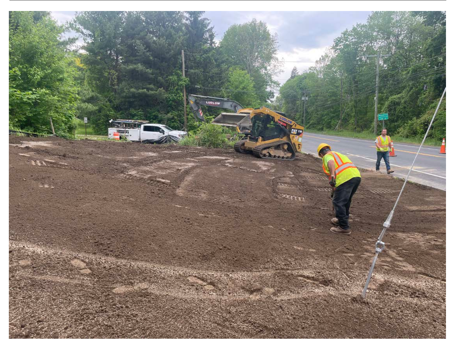
Picture 10: Ludlow raking and seeding the slope located on the south side of the Water Meter Building located at Station 124+80 on S. Main Street in Middletown. View to the south.

Contractor: Ludlow Construction Page: 13 of 13