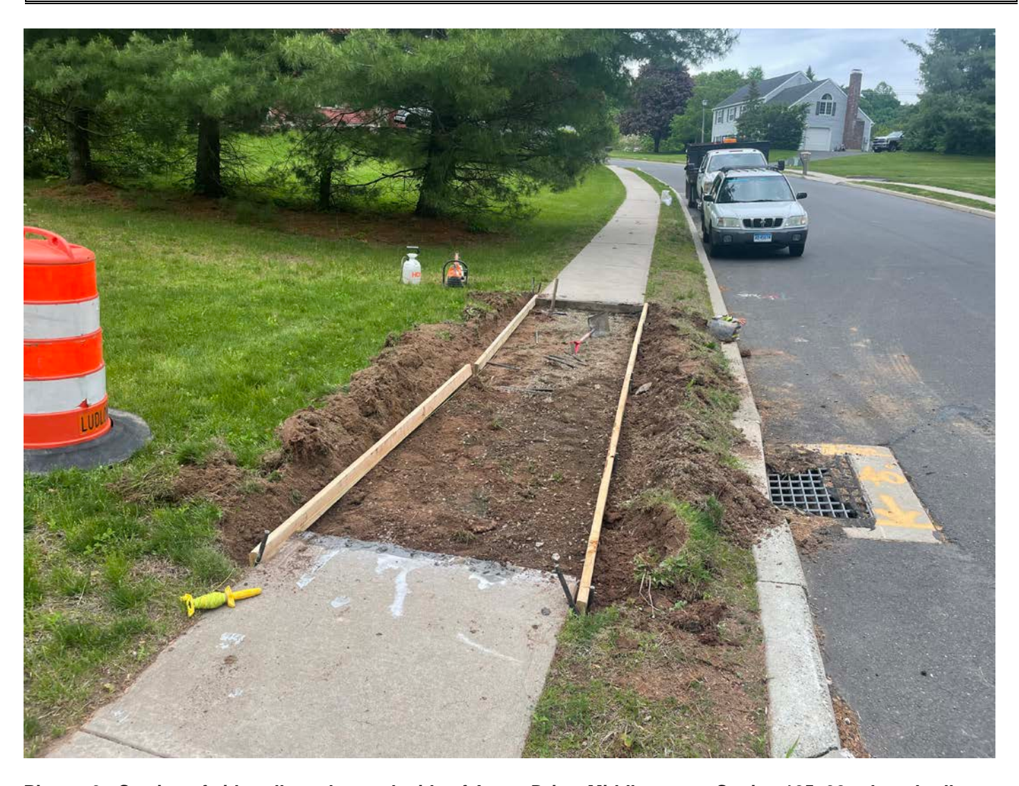
Picture 9: Section of sidewalk on the north side of Acorn Drive, Middletown at Station 125+92, where Ludlow has removed damaged panels of concrete and have built a form to pour new panels. View to the east.

Contractor: Ludlow Construction Page: 12 of 13