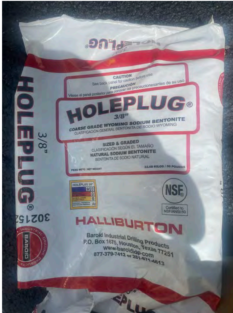
Picture 10: Bentonite chips that Grela is using during well decommissioning activities.