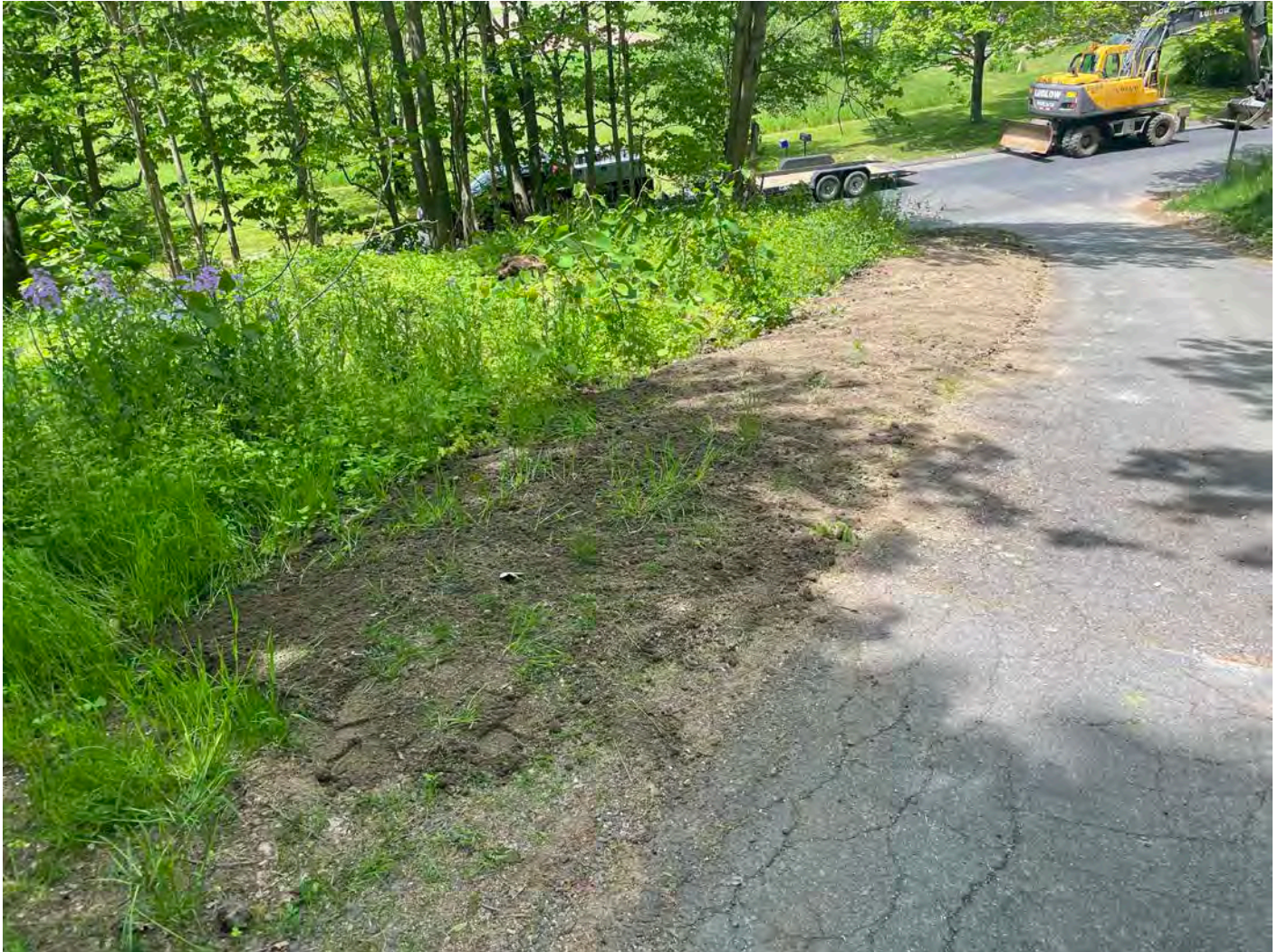
Picture 12: The south side of the driveway for the 95R Maple Avenue, Durham, property where Ludlow placed loam and grass seed. View to the west.