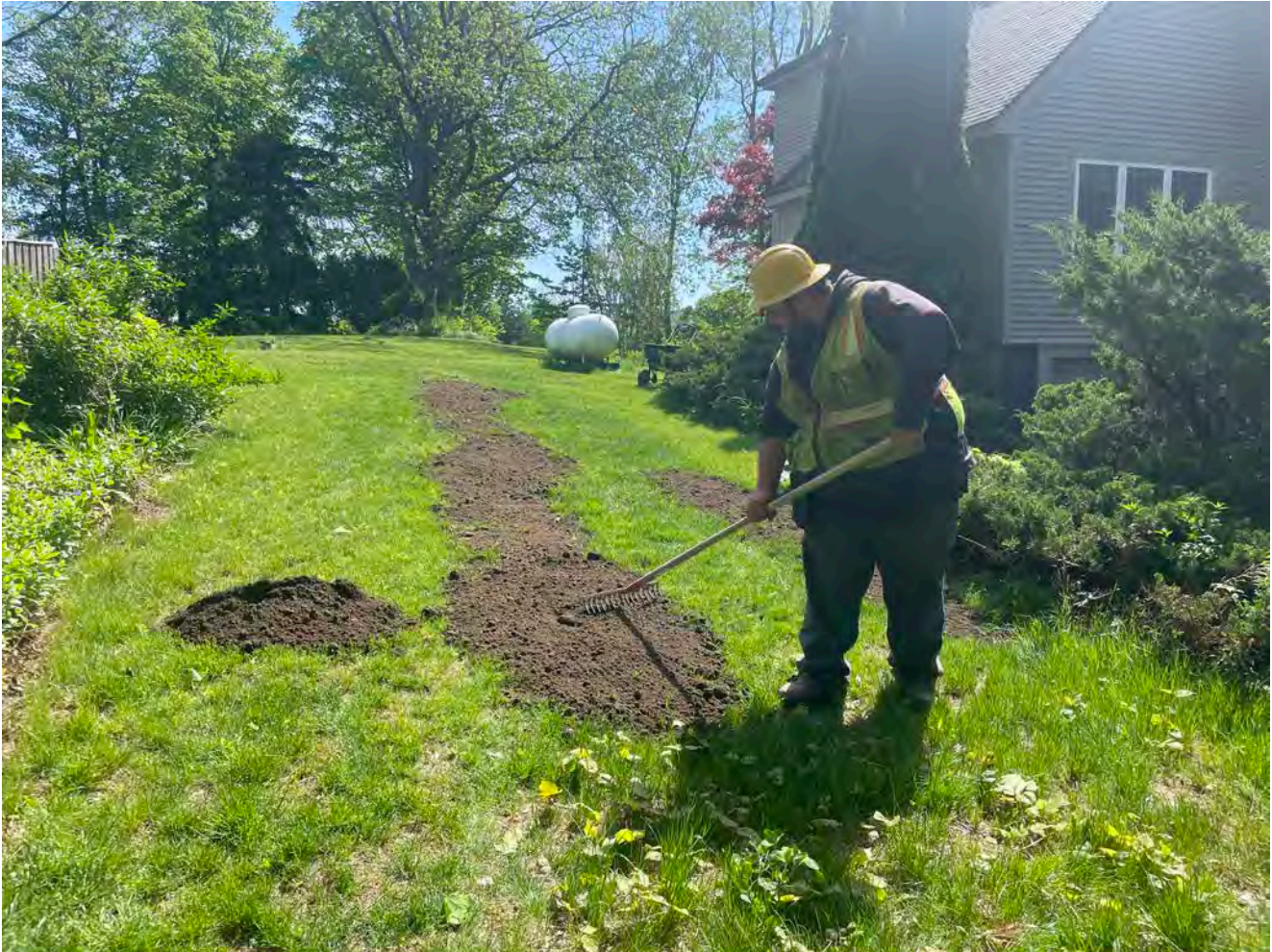
Picture 2: Ludlow grading loam that they just placed on the north side of the 95R Maple Avenue, Durham, property. View to the east.