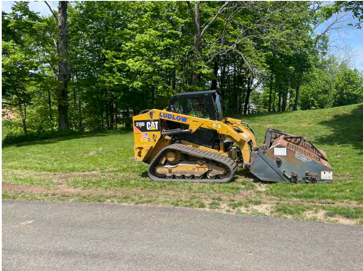
Picture 3: Ludlow using a Harley Rake to level an area of the lawn at the 95R Maple Avenue property as they work on restoring those areas that were disturbed during the installation of a copper water service line last year. View to the north.