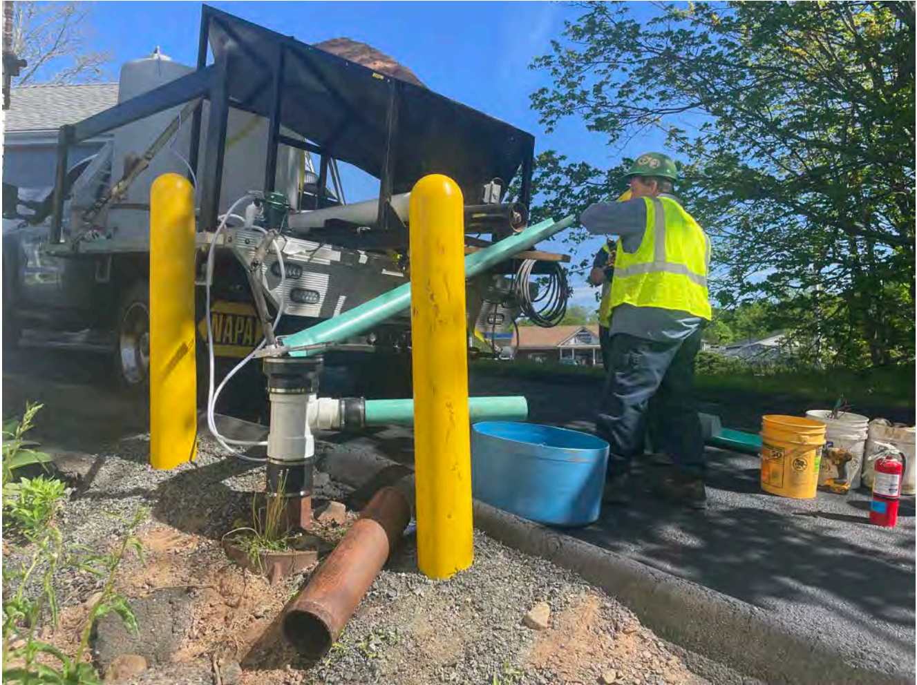
Picture 5: Grela placing sand into the well located on the northeast corner of the 325 Main Street building as they work to decommission the well. View to the northwest.