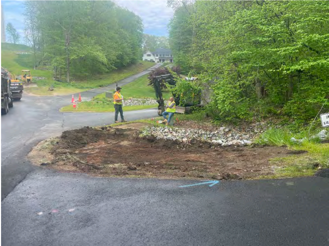
Picture 3: Area located between the driveways for 214 and 216 Talcott Ridge Drive where Ludlow removed several inches of loam. The north side of this peninsula will receive additional paving; Ludlow will loam and seed the remainder of the peninsula. View to the east.