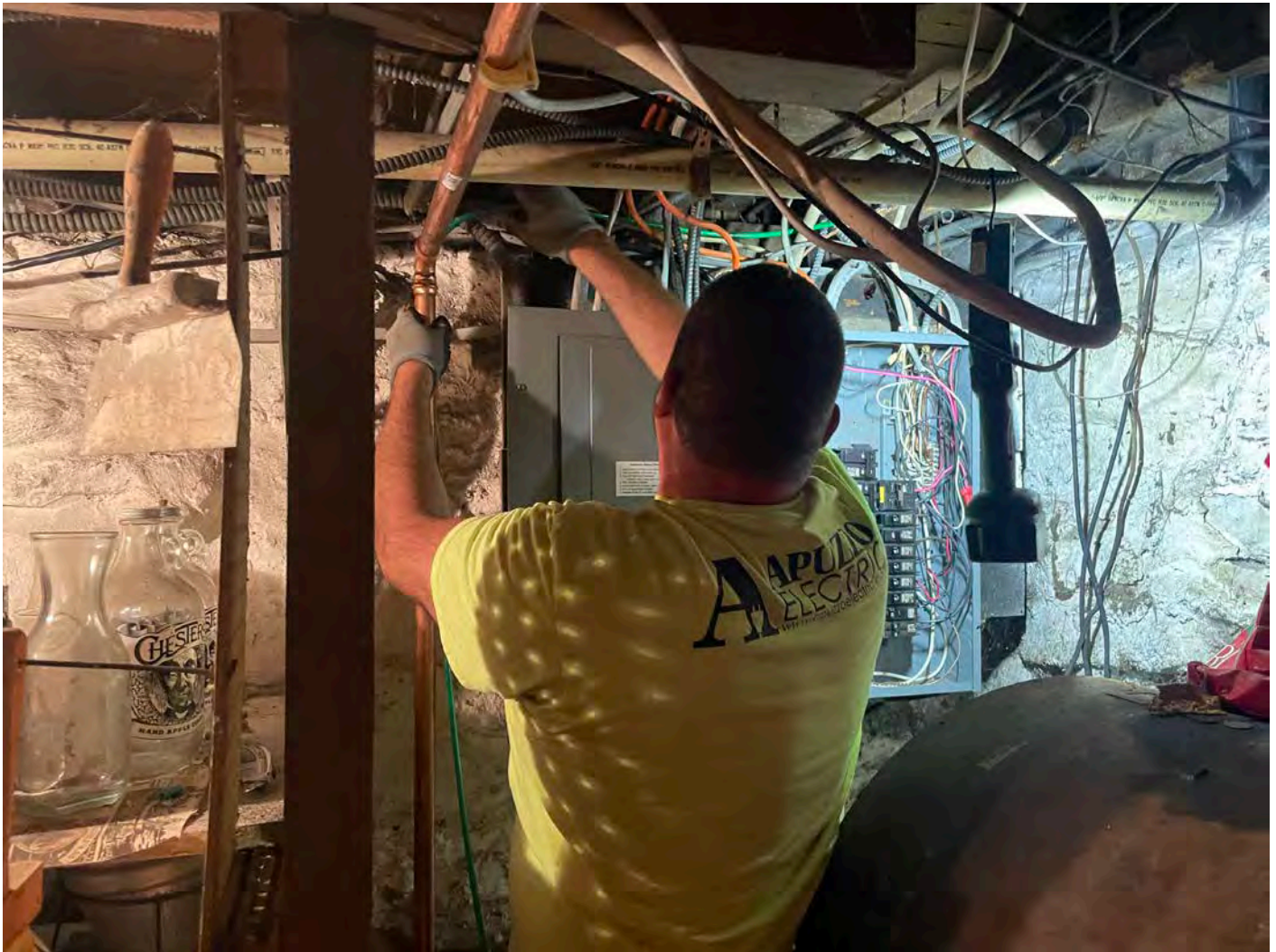
Picture 6: Apuzzo Electric installing ground wires to the recently installed final water system components at the 176 Maple Avenue, Durham, residence.