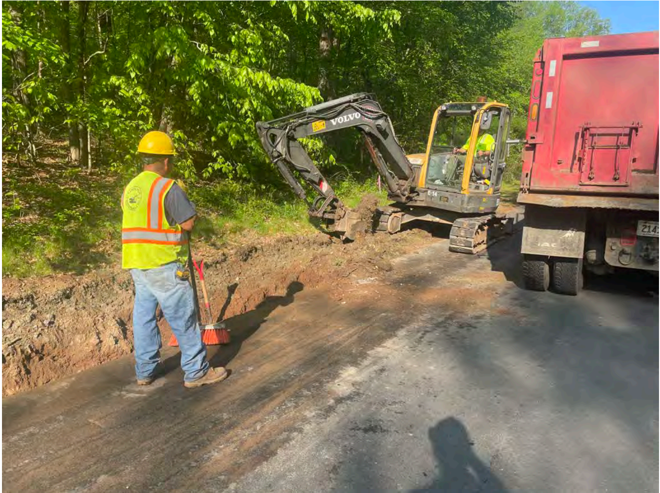
Picture 1: Ludlow excavating soil along the south edge of the Shared Access Driveway in Middletown where they are constructing a drain comprised of \frac{3}{4} " stone and 4" black, plastic, corrugated drain line. View to the northwest.