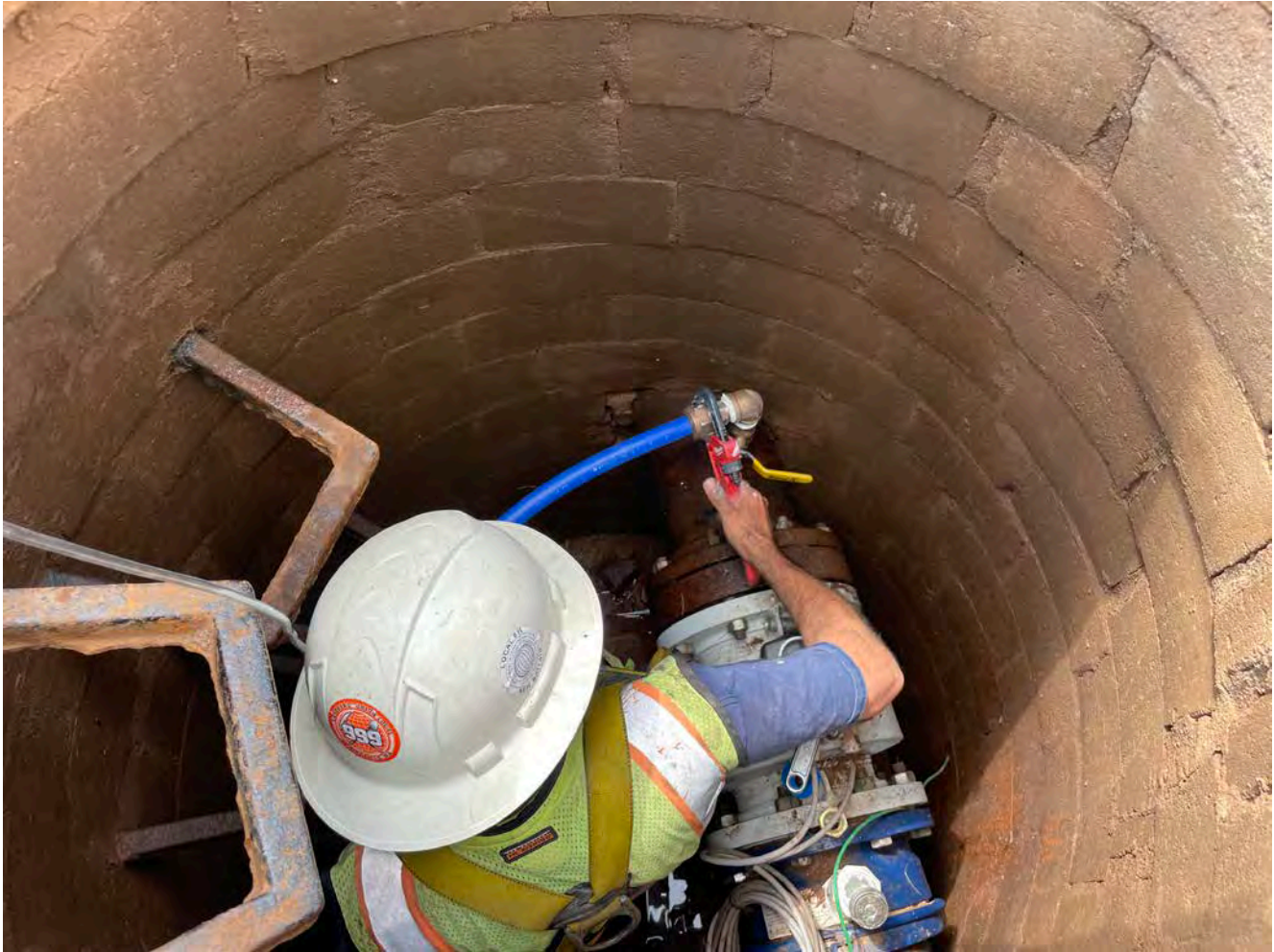
Picture 5: Ludlow working on the tap they just installed on a 10" DIP line located on the south side of the Long Hill Pump Station. This tap was installed as a sampling port for the water line. View to the south.