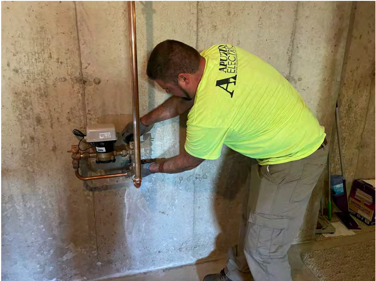
Picture 7: Apuzzo Electric installing ground wires to the recently installed final water system components at the 166 Maple Avenue, Durham, residence. View to the east.