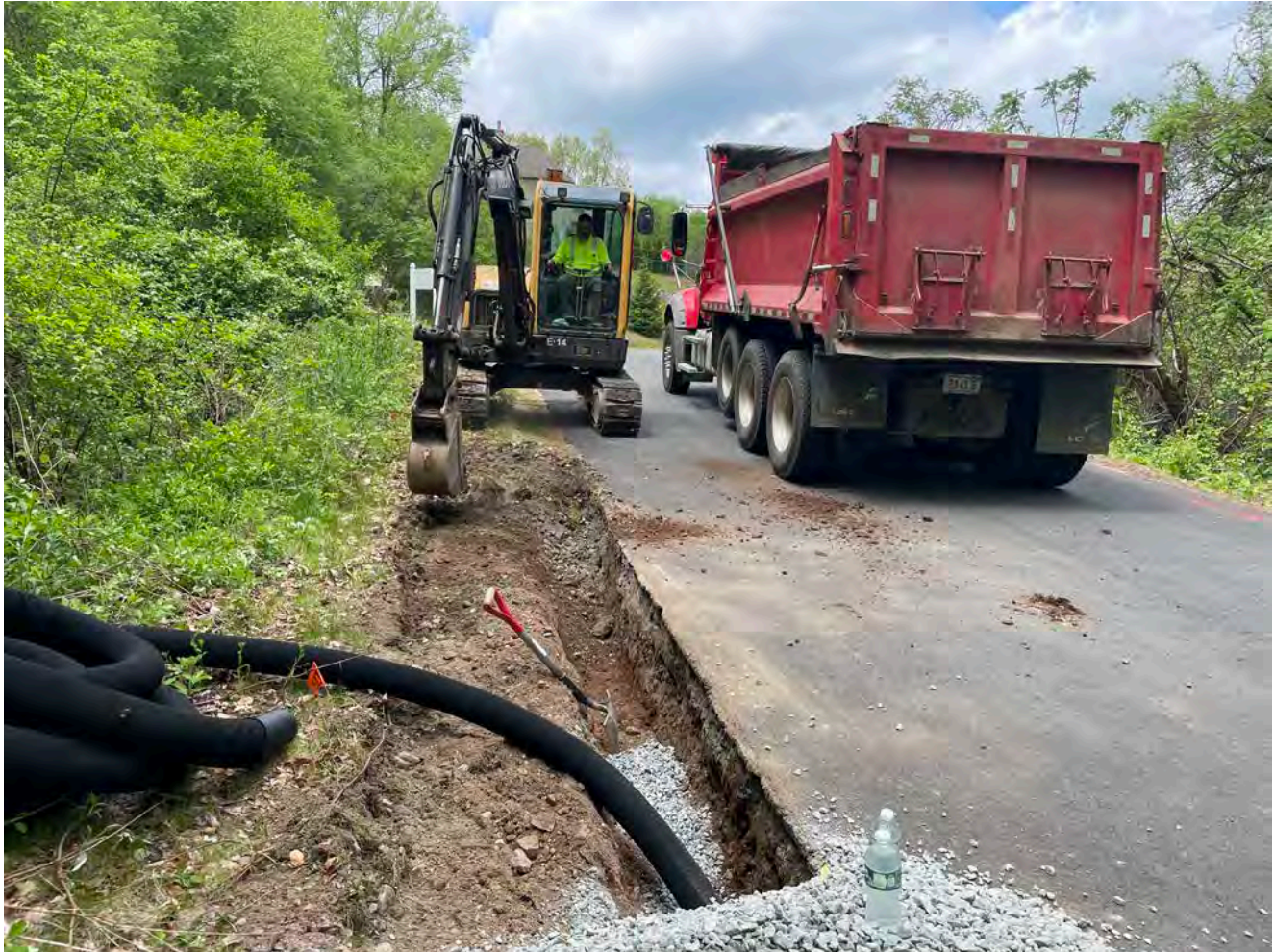
Picture 2: Ludlow installing a 4" black, plastic, corrugated drain line on the south side of the Shared Access Driveway at ~Station 21+30. View to the west.