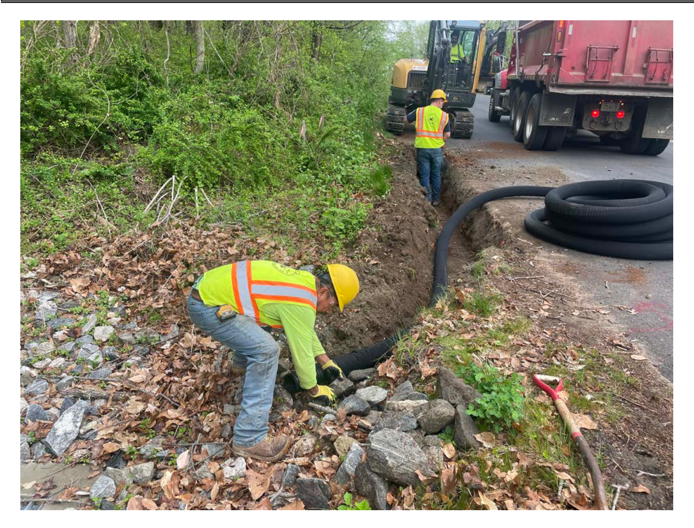
Picture 2: Ludlow installing a 4" black, plastic, corrugated drain line at Station 15+90. View to the west.