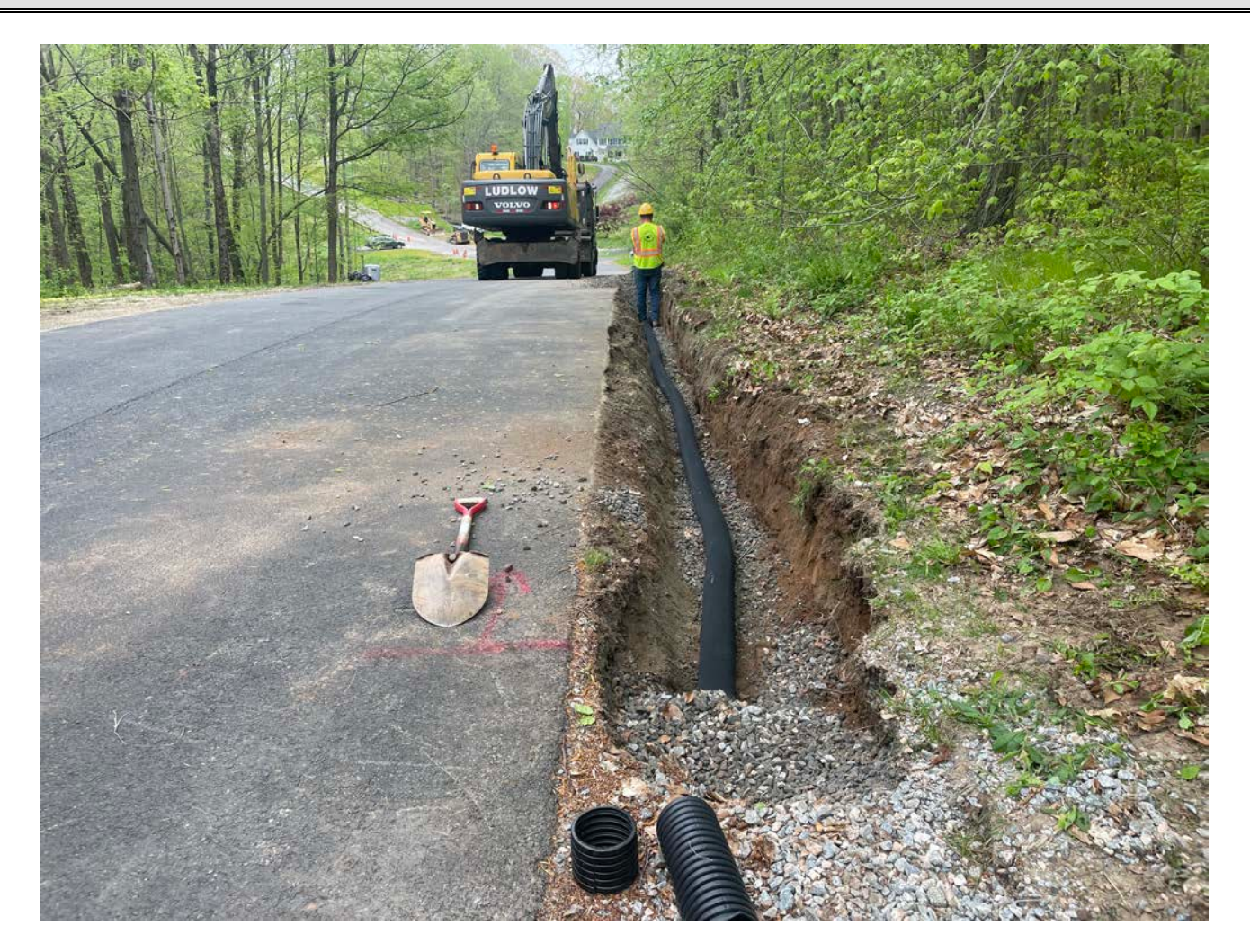
Picture 7: Station 17+90, looking east after Ludlow tied the 4" drain line they installed today into the 4" drain line that was previously installed between Stations 17+90 and 18+15 on the south side of the Shared Access Driveway.