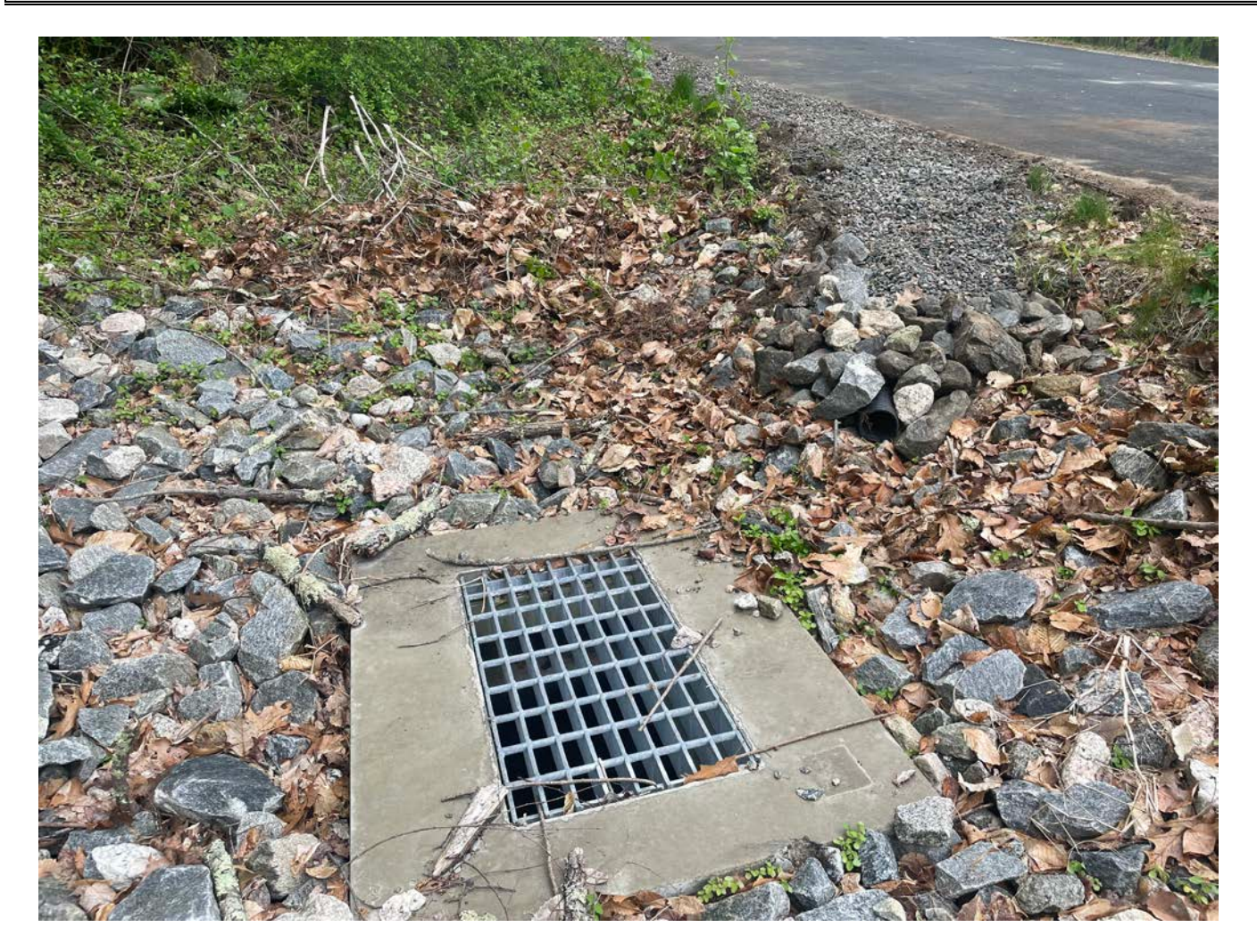
Picture 5: Finished drain line installation at Station 15+90, looking northwest.