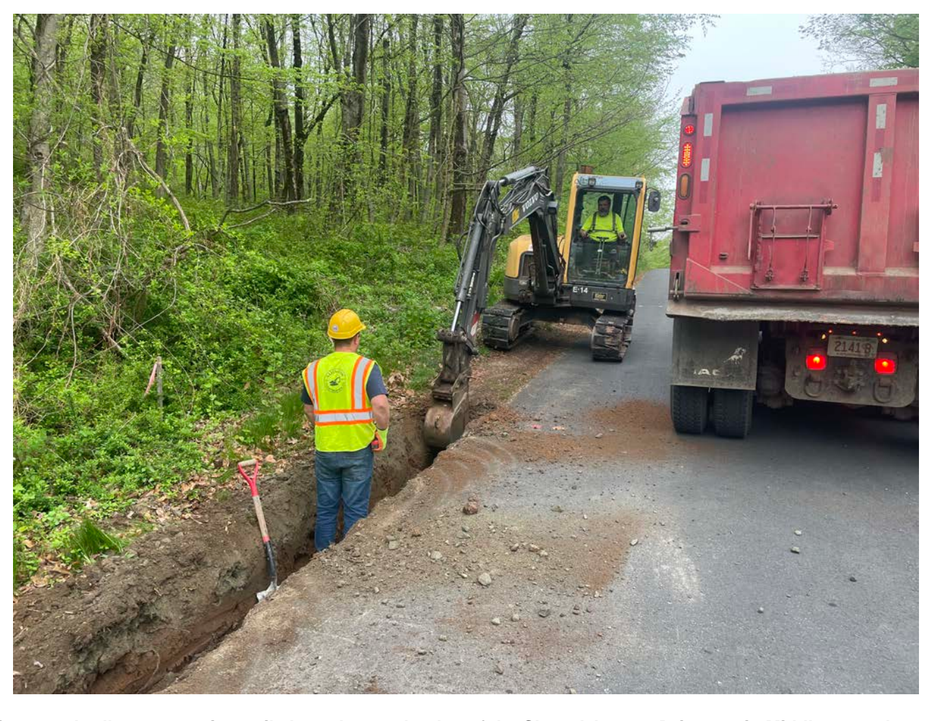
Picture 1: Ludlow excavating soil along the south edge of the Shared Access Driveway in Middletown where they are constructing a drain comprised of 3/4" stone and 4" black, plastic, corrugated drain line. View to the southwest.

Contractor: Ludlow Construction Page: 4 of 12