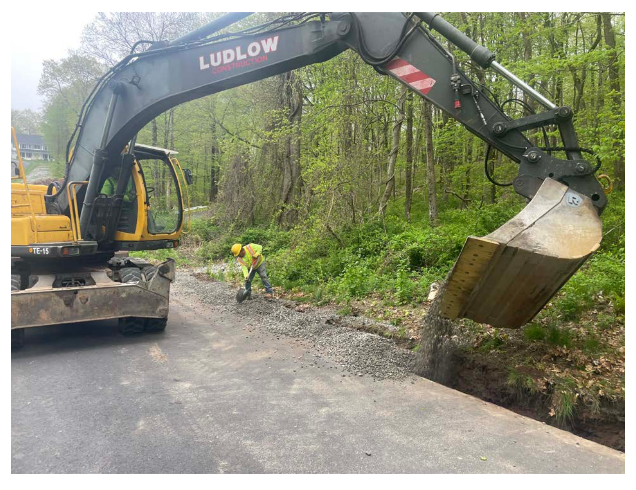
Picture 3: Ludlow placing \frac{3}{4} " stone over 4" black, plastic, corrugated drain line along the south edge of the Shared Access Driveway in Middletown. View to the southeast.

Contractor: Ludlow Construction Page: 6 of 12