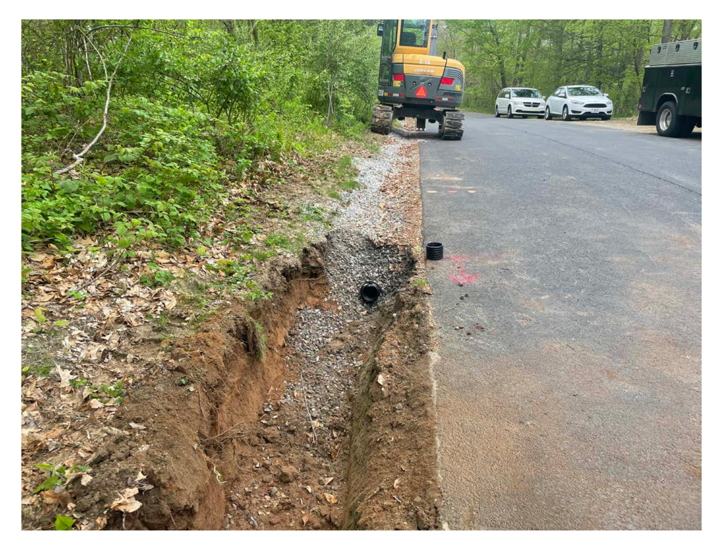
Picture 6: Previously installed 4" drain line at Station 17+90 that Ludlow daylighted in order to tie into it with the 4" drain line they are installing today. View to the west.