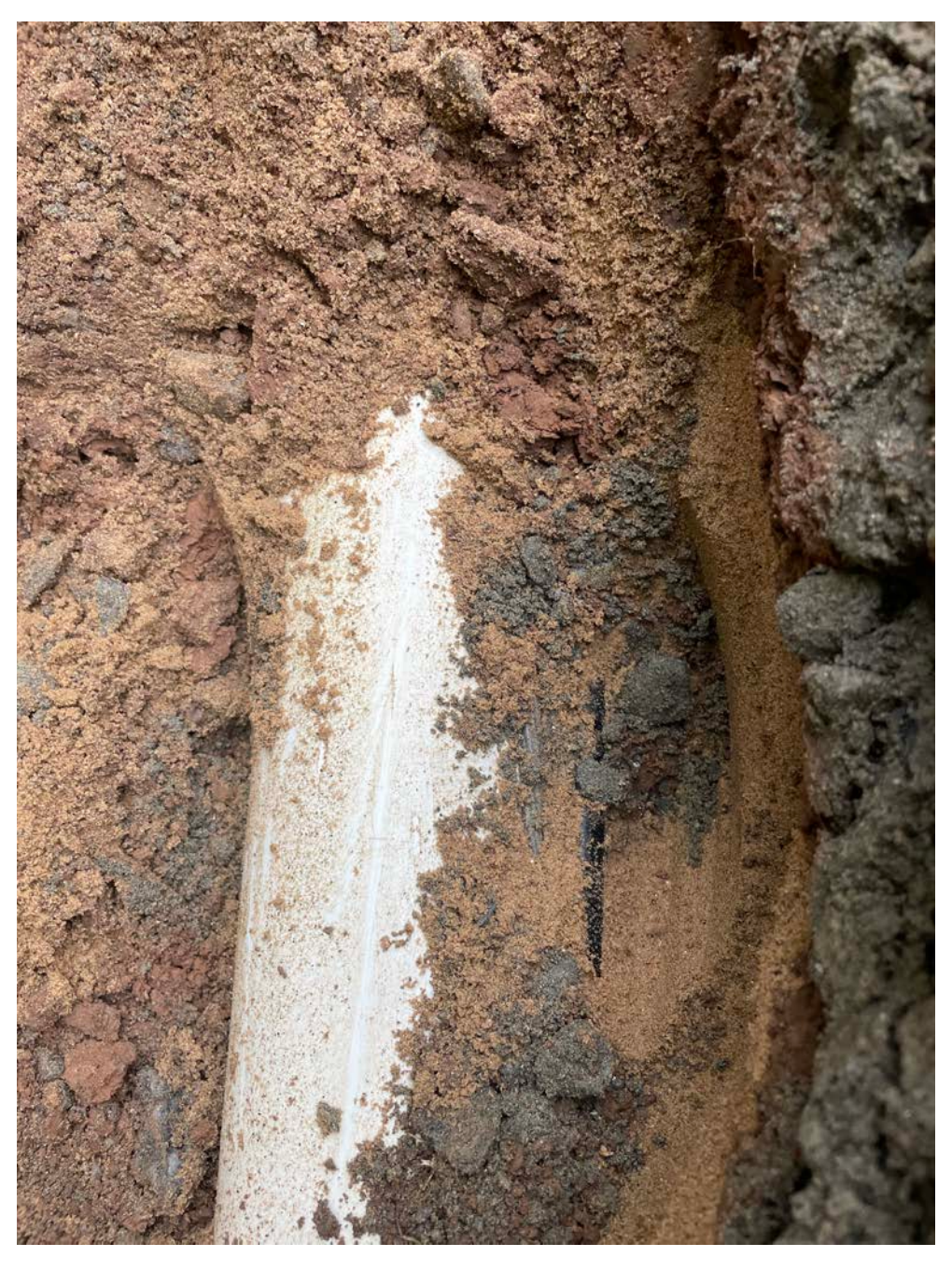
Picture 8: White 4" PVC conduit and several other unshielded utilities located on the right-hand side of the PVC that Ludlow daylighted while hand-excavating on the south edge of the Shared Access Driveway.

Project: Durham Meadows Pipeline Installation Date: May 13, 2022 Day of Week: Friday Location: Long Hill Road and the Shared Access Driveway, Middletown Report No: 425 Project #: AECOM: 6061487 Page: 11 of 12 Contractor: Ludlow Construction