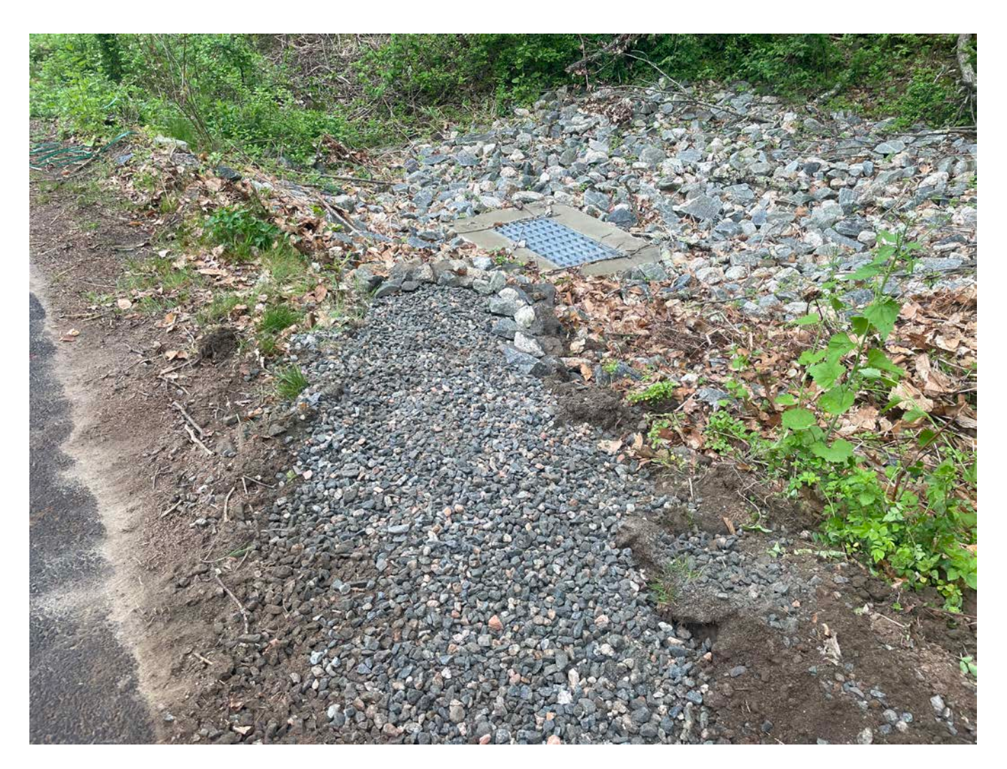
Picture 4: Finished drain line installation at Station 15+90, looking southeast towards the plunge bowl.