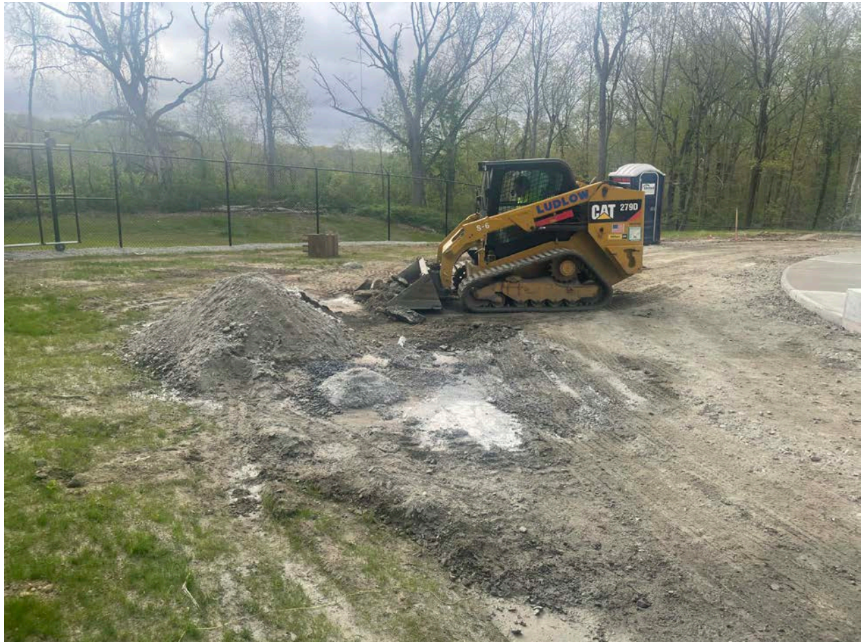
Picture 3: Ludlow cleaning up gravel and waste asphalt located at the northeast side of the water tank located east of the Shared Access Driveway in Middletown. View to the southeast.