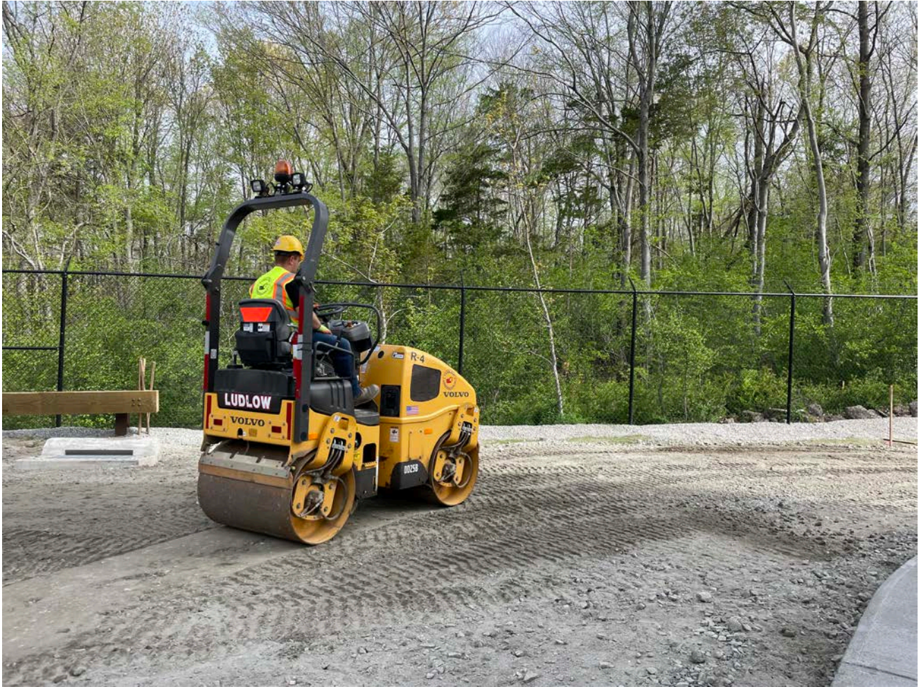
Picture 5: Ludlow grading and compacting fill surrounding the water tank.