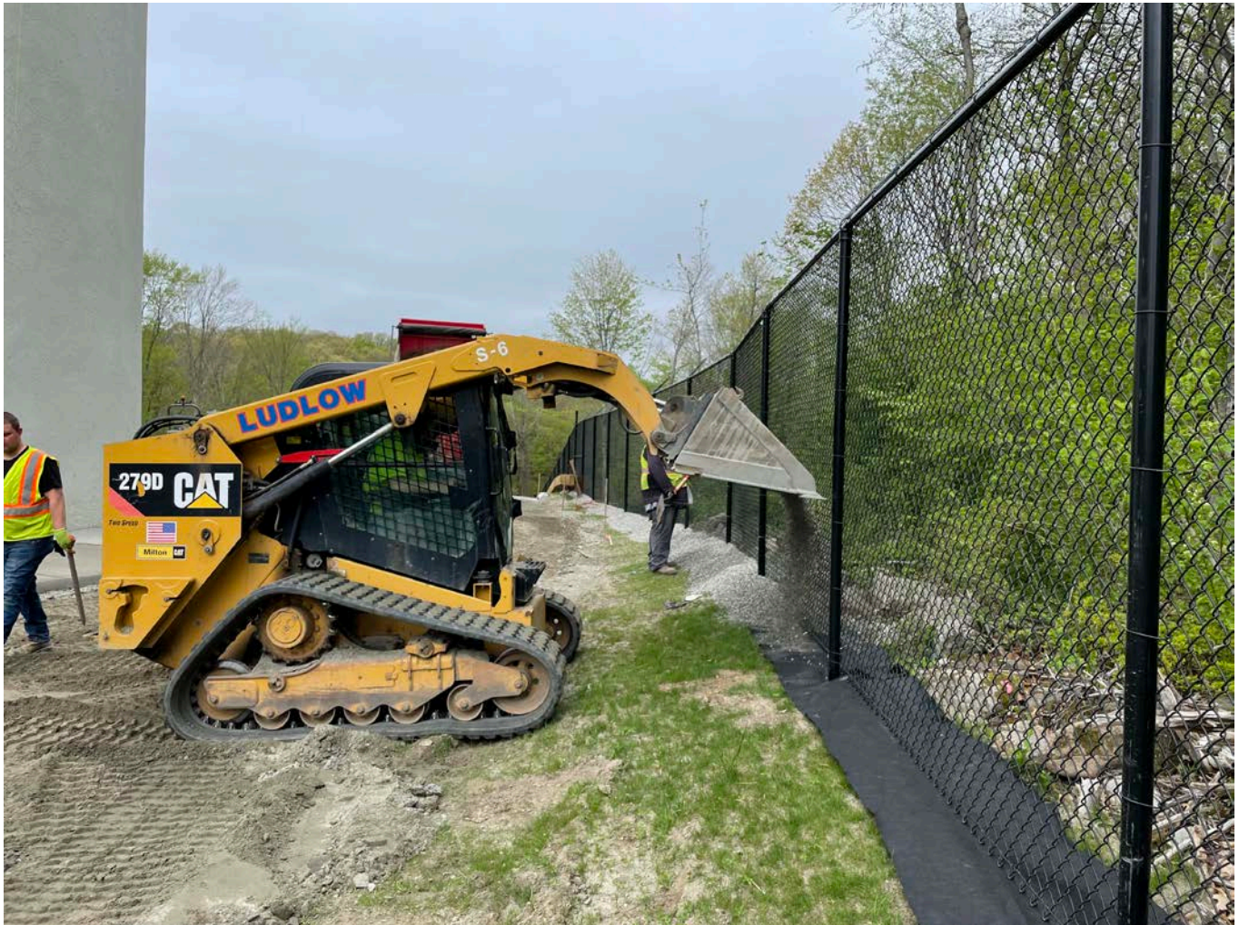
Picture 4: Ludlow is placing 3/8" rock on top of black geofabric at the toe of the chain-link fence located on the north side of the water tank. View to the west.