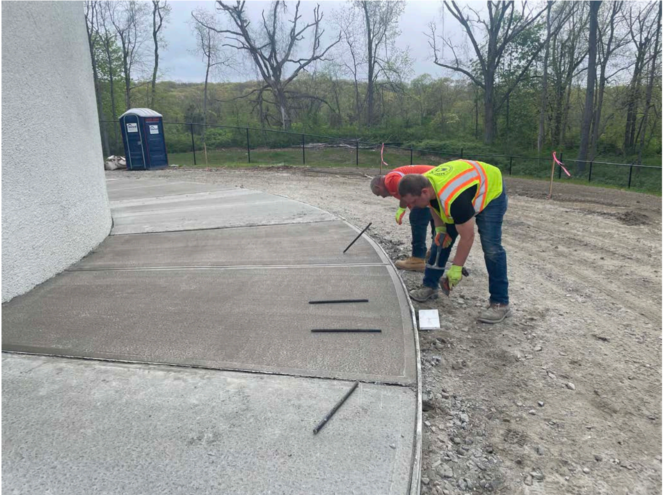
Picture 1: Ludlow removing the form work from around the concrete sidewalk they constructed around the perimeter of the water tank located east of the Shared Access Driveway in Middletown. View to the southeast.