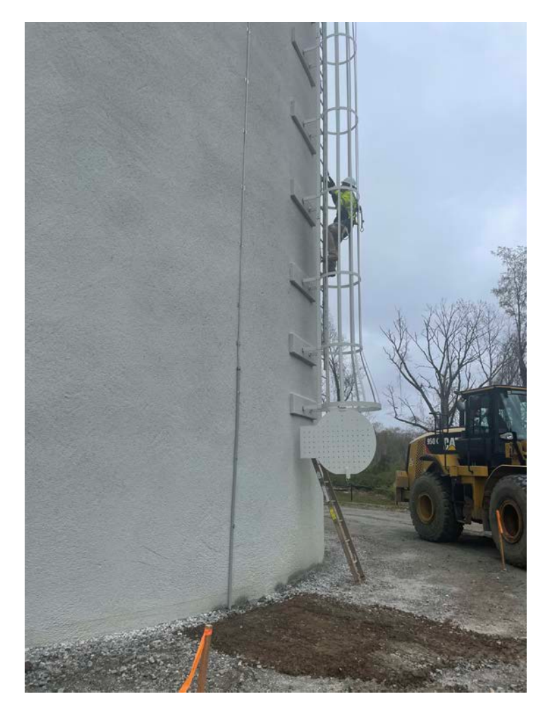
Picture 4: DN Tanks ascending the water tank located to the east of the Shared Access Driveway in Middletown to collect a water level from the tank as part of their leak test activities. View to the east.