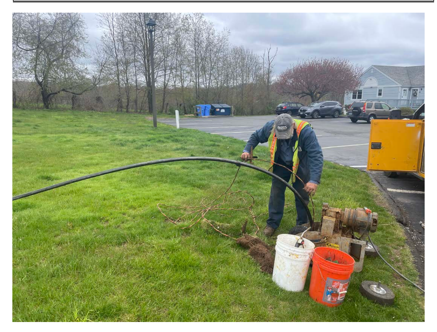
Picture 8: Grela removing the pump from the third of three wells located at the condominium complex on Mill Pond Lane in Durham. View to the northeast.