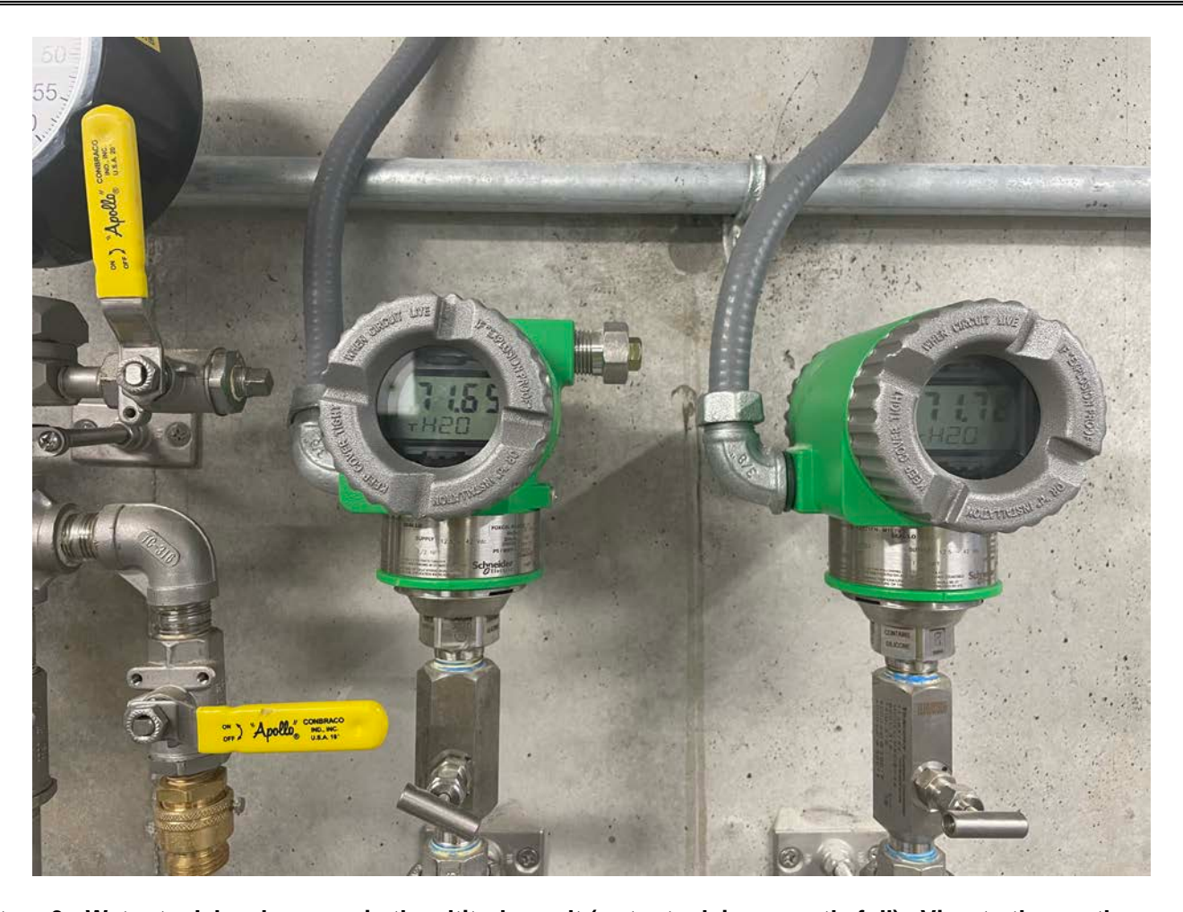
Picture 3: Water tank level gauges in the altitude vault (water tank is currently full). View to the south.