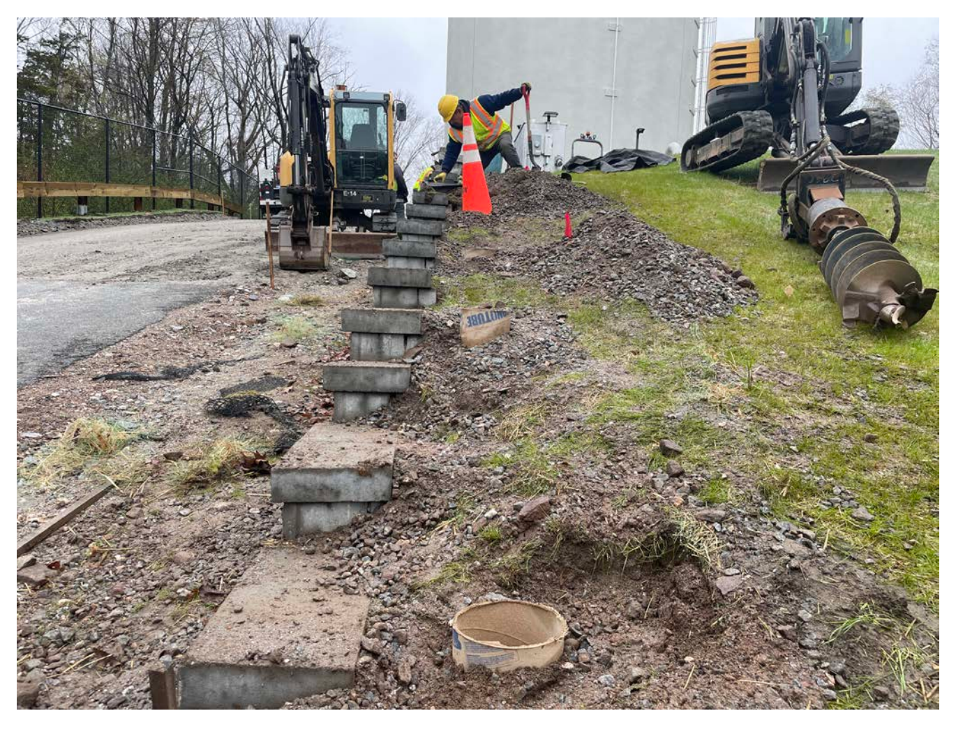
Picture 1: Ludlow working on the installation of Sonotubes on the south side of the retaining wall located between Stations 10+65 and 11+35 on the Shared Access Driveway in Middletown. View to the east.

Contractor: Ludlow Construction Page: 4 of 11