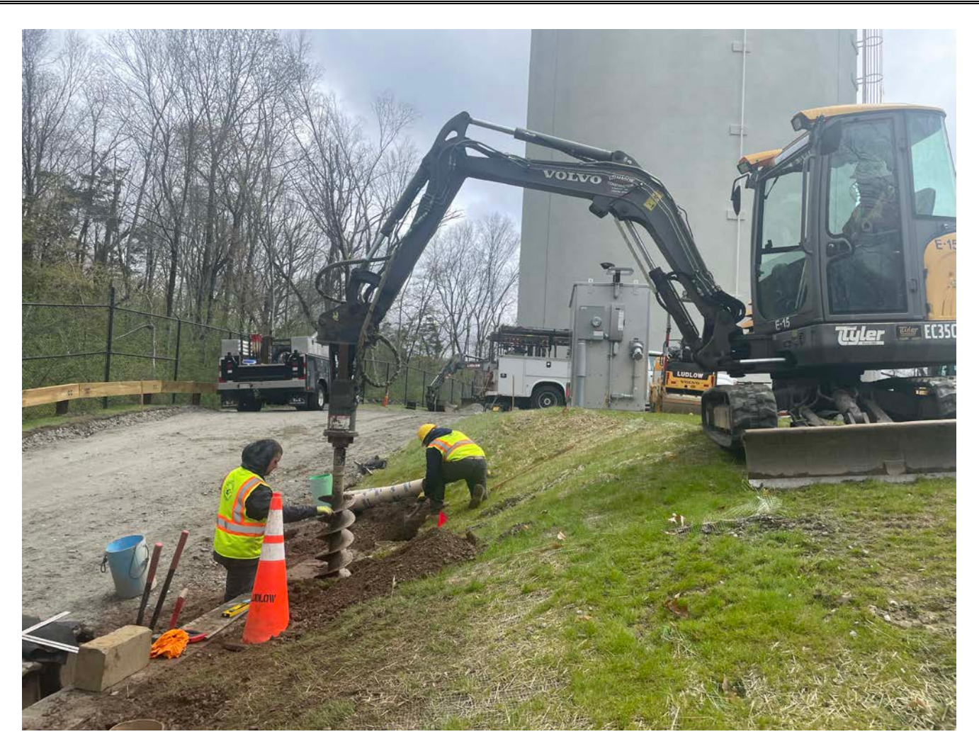
Picture 2: Ludlow auguring a hole on the south side of the retaining wall located between Stations 10+65 and 11+35 on the Shared Access Driveway in Middletown for the installation of a Sonotube. View to the east.

Contractor: Ludlow Construction Page: 5 of 11