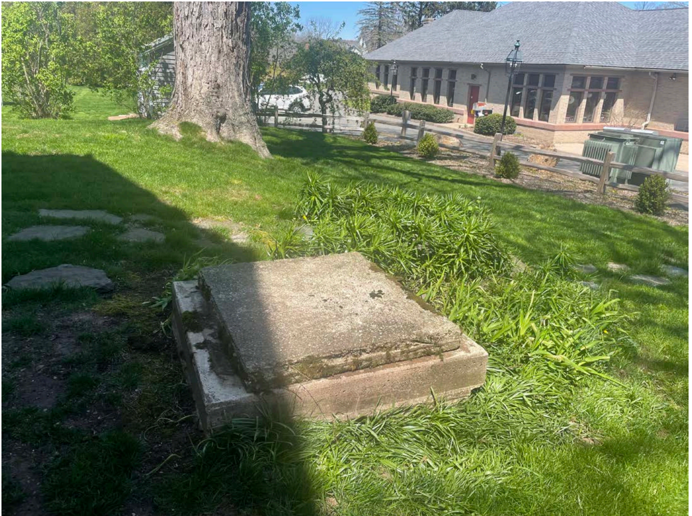
Picture 13: The dug well located on the east side of the 13 Maple Avenue, Durham, property. View to the north.