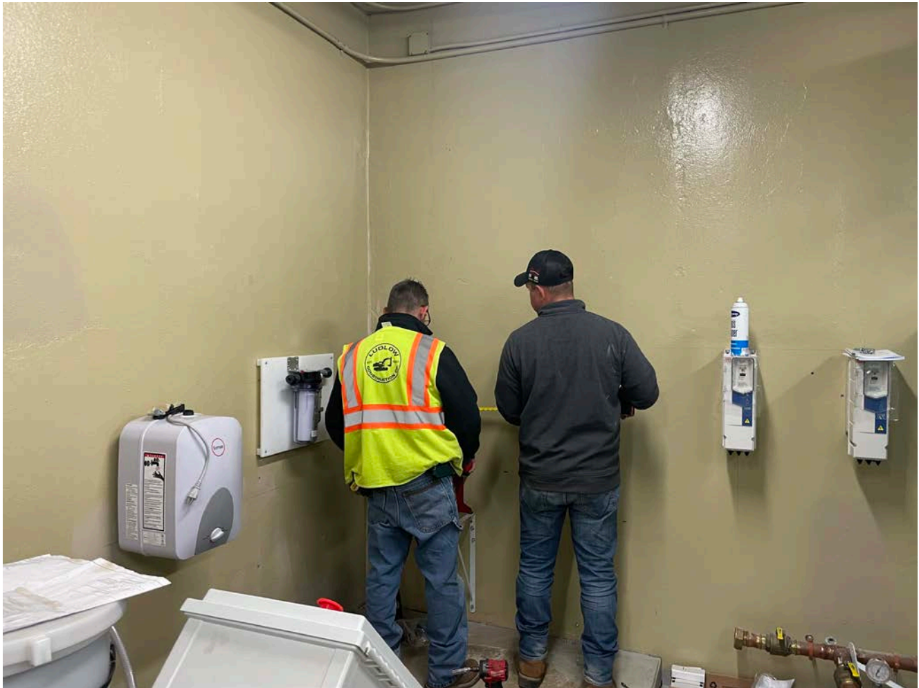
Picture 1: Ludlow laying out the location of the chlorination system components they are installing at the Long Hill pump station located on Long Hill Road in Middletown. View to the south.