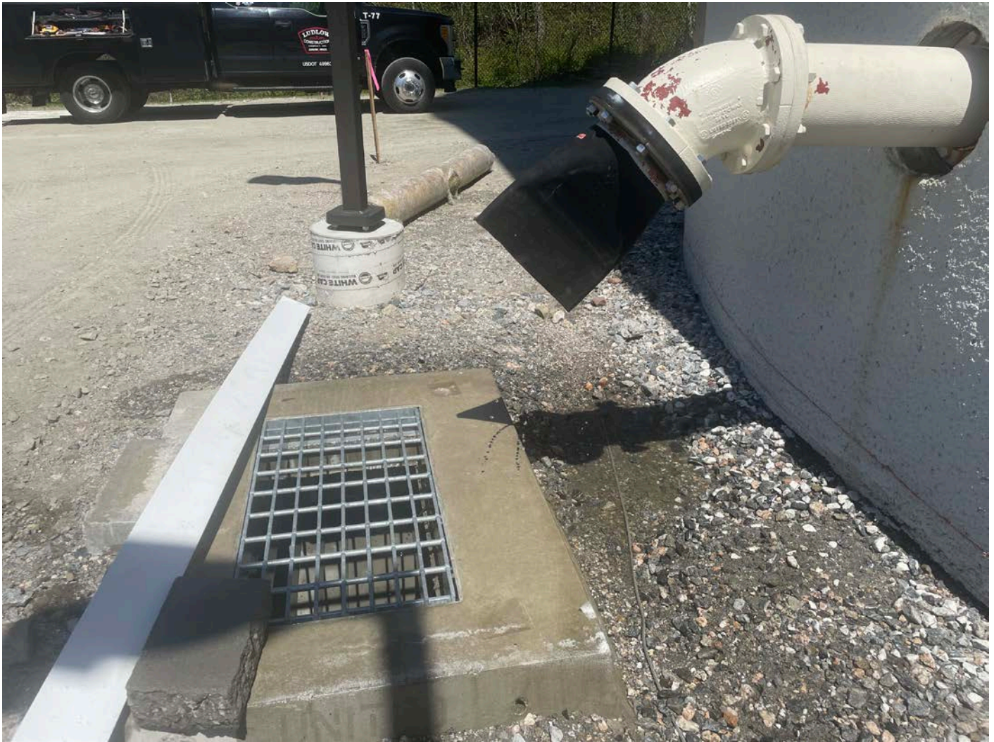
Picture 2: Water coming out of the tank overflow after Ludlow filled the tank. West side of the water tank located west of the Shared Access Driveway in Middletown. View to the north.