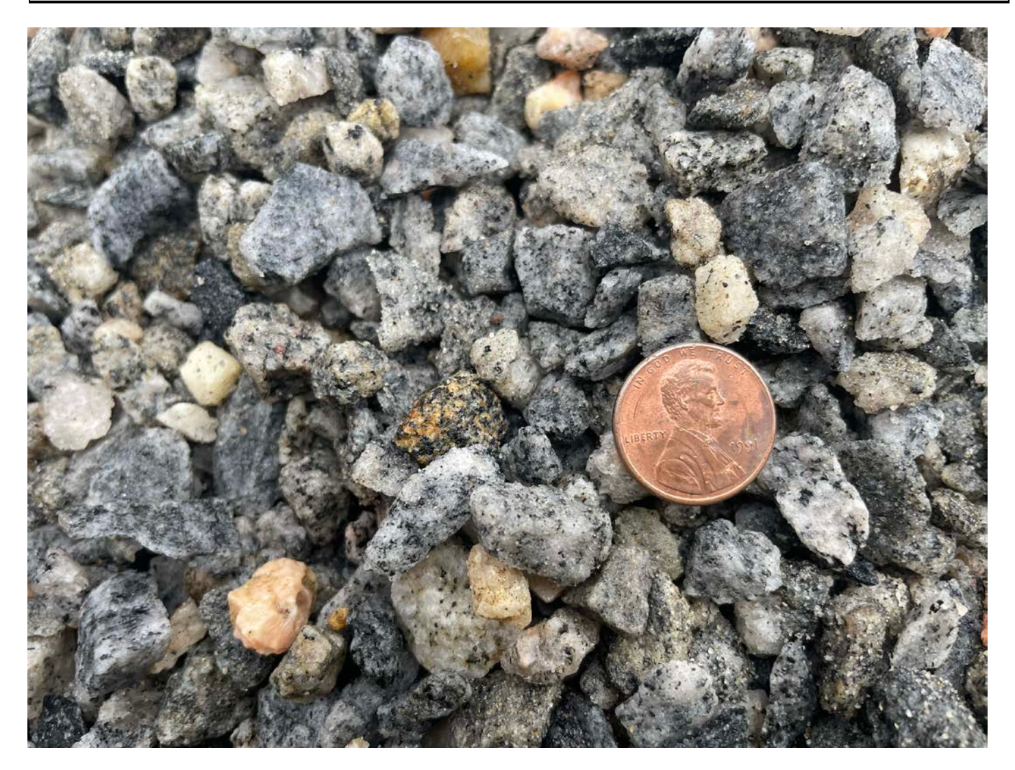
Picture 13: Closeup of the 3/8" stone that Ludlow is placing over black geofabric along the bottom of the fence that surrounds the water tank located east of the Shared Access Driveway in Middletown.