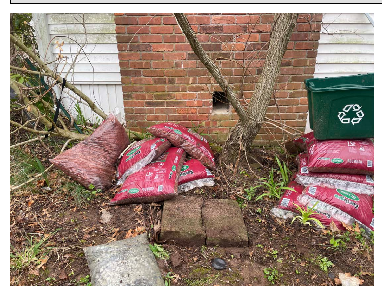
Picture 2: Well cover at the 162 Maple Avenue, Durham, residence. Grela removed the pump from this well. View to the south.