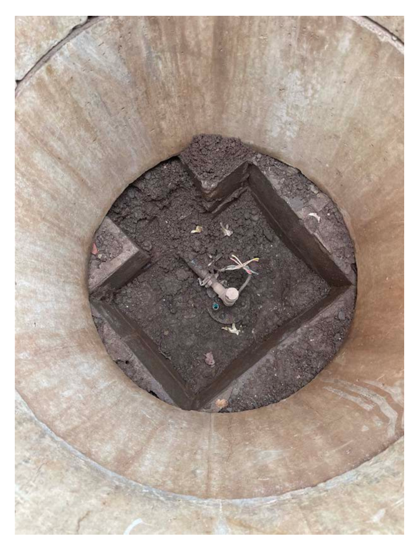
Picture 3: Inside of the tile where the well at the 17 Wallingford Road, Durham, property is located. Grela was unable to remove the pump from this well today due to logistical issues.