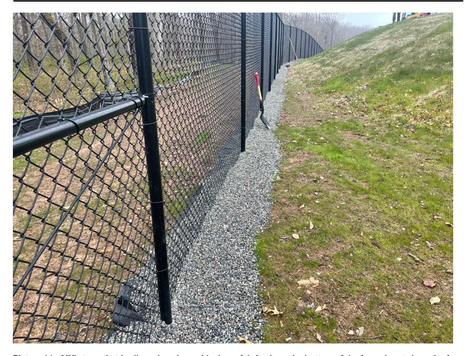
Picture 14: 3/8" stone that Ludlow placed over black geofabric along the bottom of the fence located south of the water tank located east of the Shared Access Driveway in Middletown. View to the west.