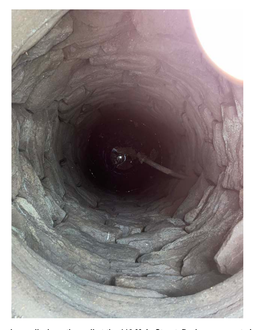
Picture 4: Inside of the dug well where the well at the 119 Main Street, Durham, property is located. Grela was unable to remove the pump from this well today due to logistical issues.