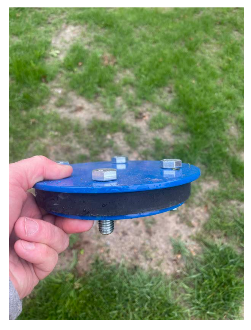
Picture 9: Expanding well cap that Grela has been placing on top of the well casing after removing a pump from a well.