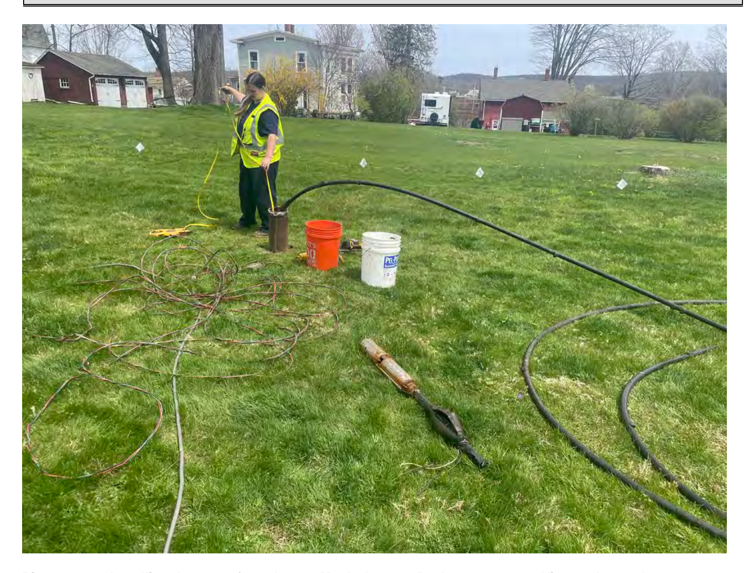
Picture 3: Grela pulling the pump from the 109 Maple Avenue, Durham, property. View to the northeast.