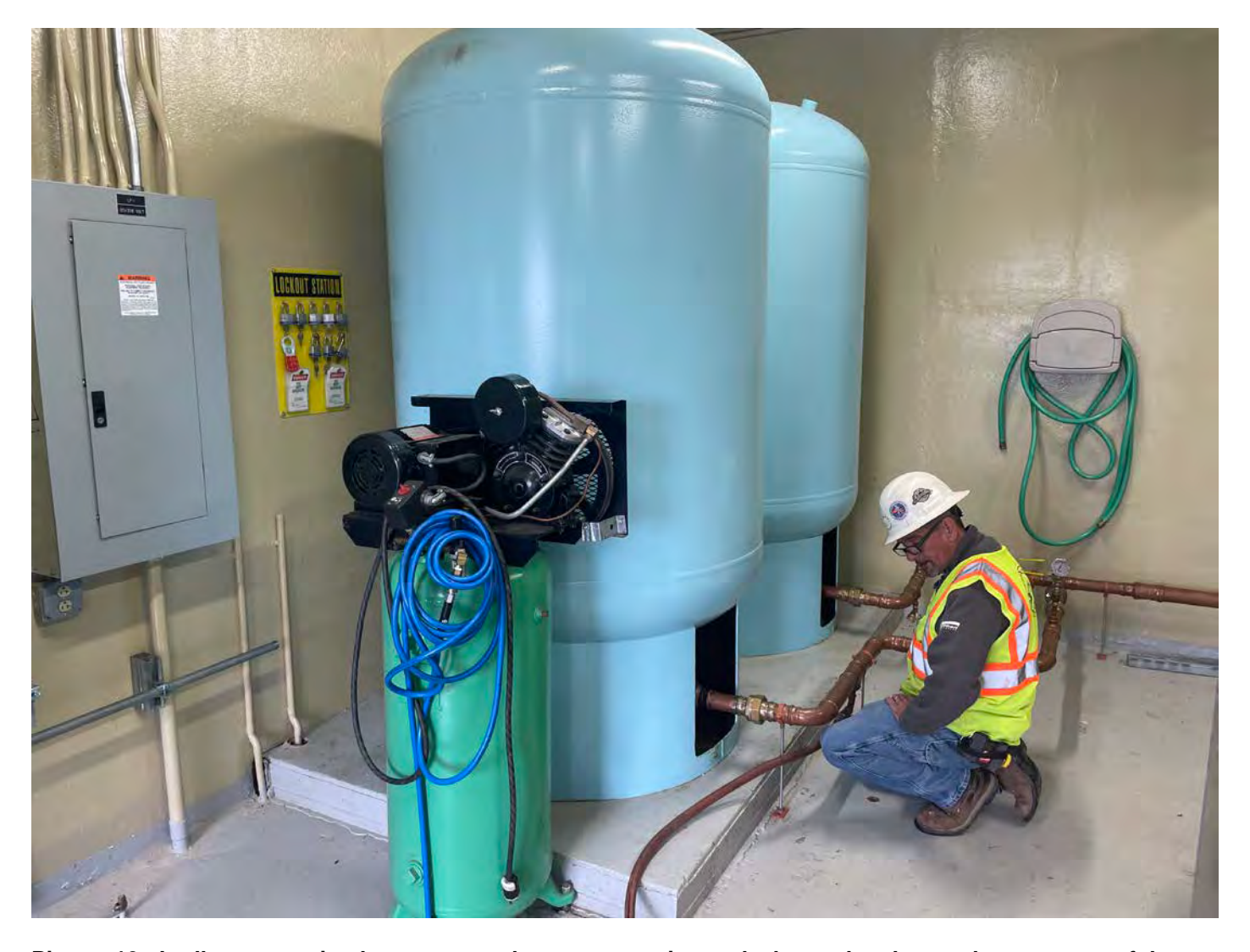
Picture 10: Ludlow assessing how to move the two expansion tanks located at the southeast corner of the Long Hill pump station in Middletown. View to the southeast.

Contractor: Ludlow Construction Page: 13 of 14