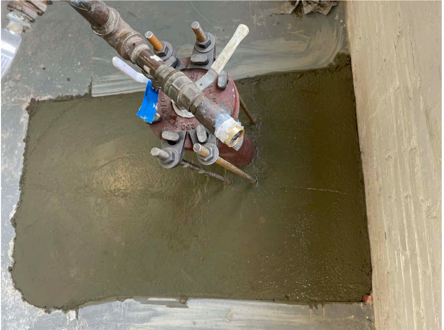
Picture 10: Hole in the floor of the Durham Manufacturing facility where Ludlow brought in a 4" DIP water service line and subsequently patched today with concrete. View to the south.