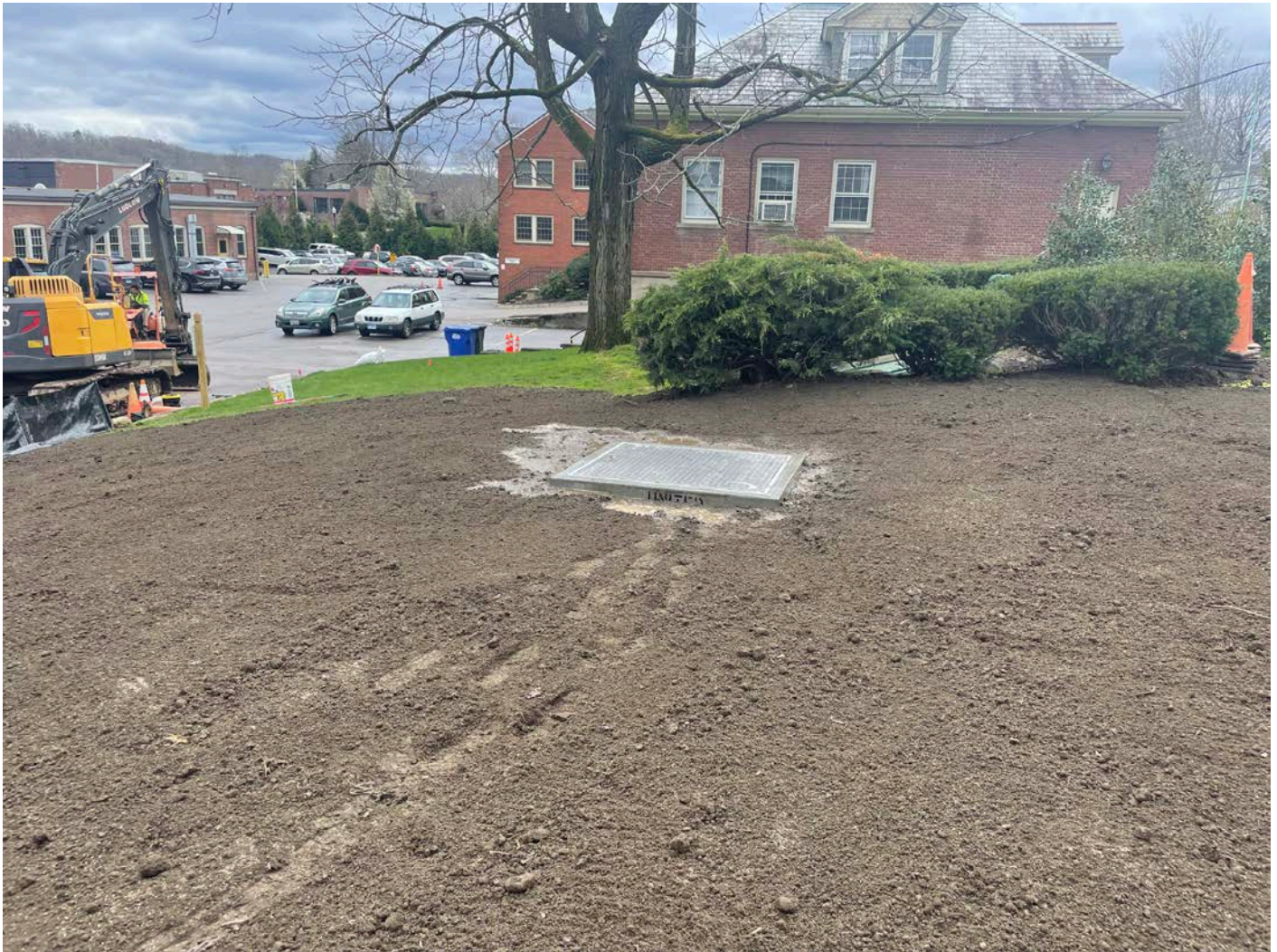
Picture 12: View of the area surrounding the hatch to the water meter vault that Ludlow installed at the Durham Manufacturing property. View to the southeast.