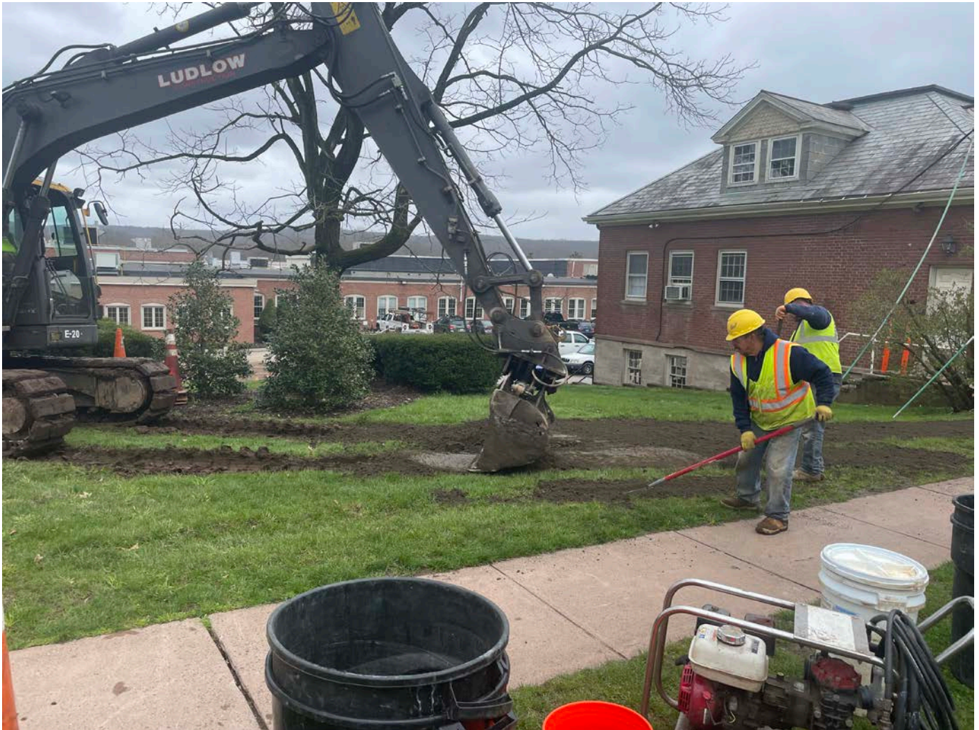
Picture 11: Ludlow placing and raking fill on those portions of the lawn at the Durham Manufacturing property that were disturbed during the installation of a 4" DIP water service line. View to the west.