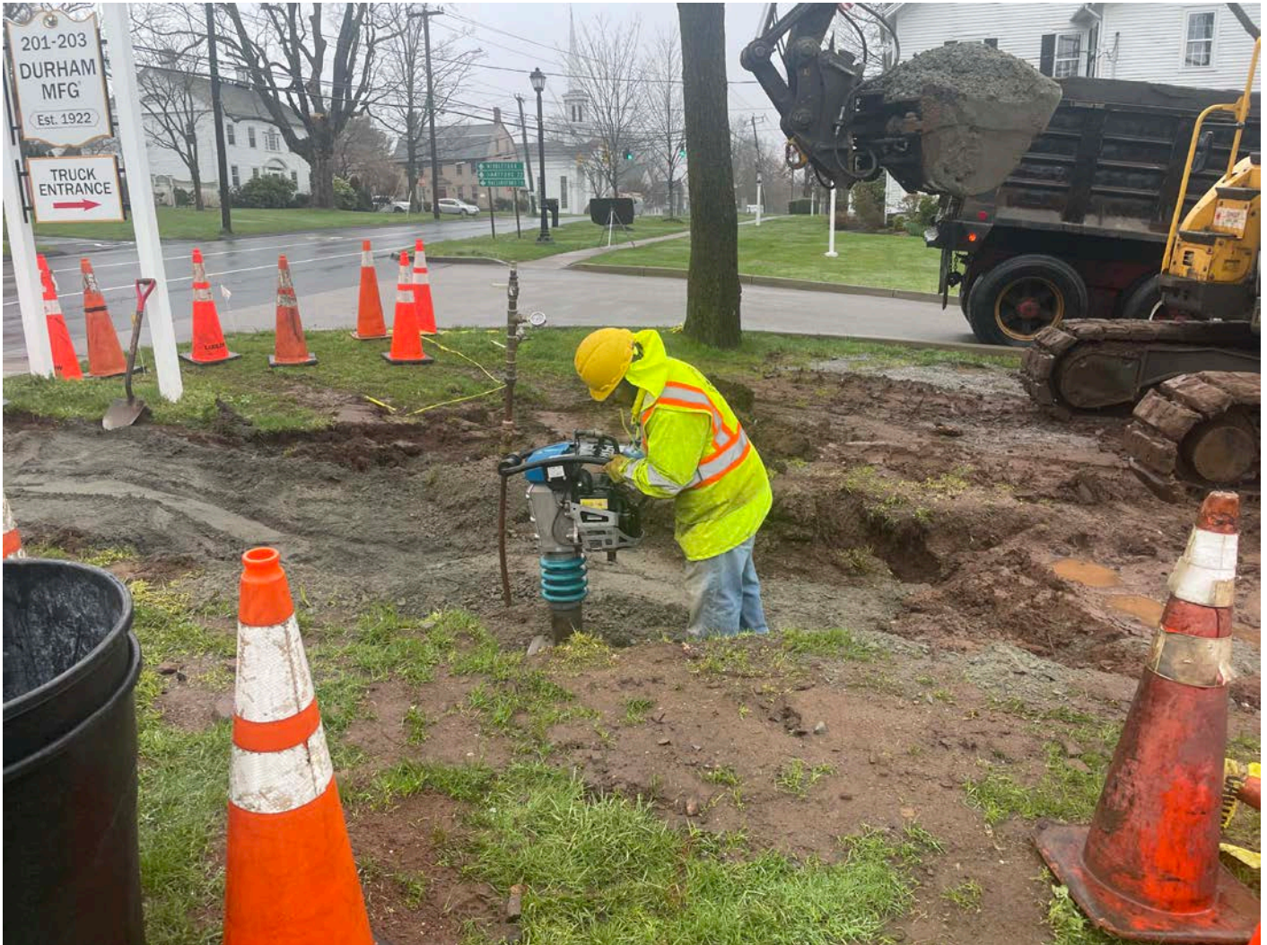
Picture 7: Ludlow compacting fill in 1' lifts as they backfill the trench they excavated on the west side of the meter vault at the Durham Manufacturing property for the installation of a 4" DIP water service line.