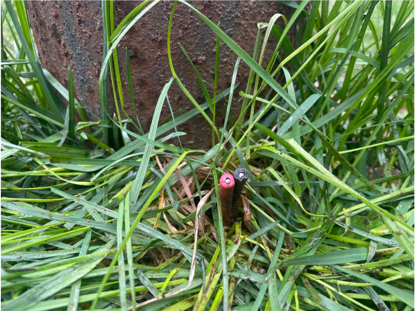
Picture 6: Power lines (without a protective exterior conduit surrounding them) that connected to the well pump at 267 Main Street, Durham, residence. View to the northeast.