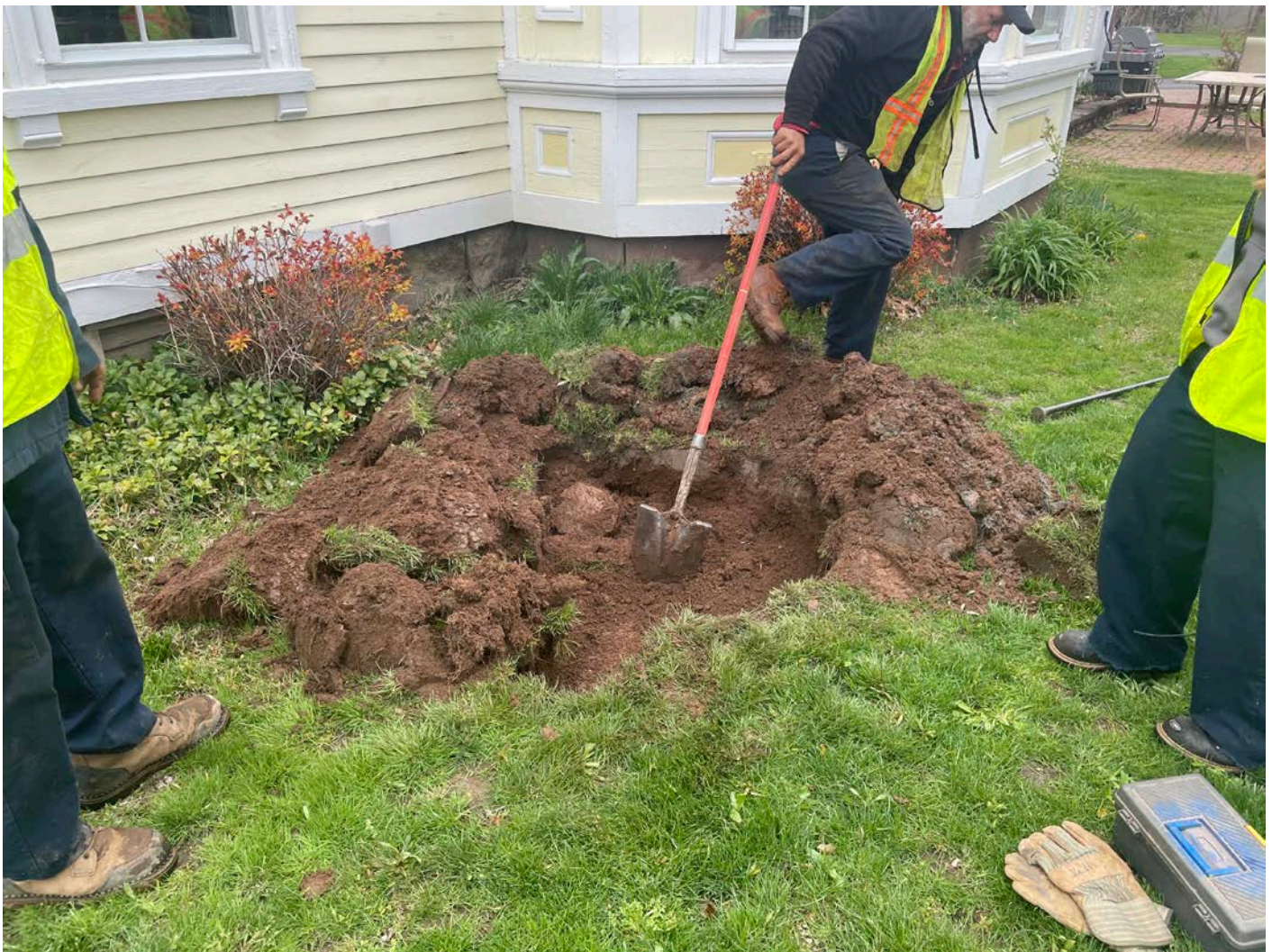
Picture 4: Grela daylighting a cement cover that sits over the well located on the south side of the 265 Main Street, Durham, residence. View to the northeast.