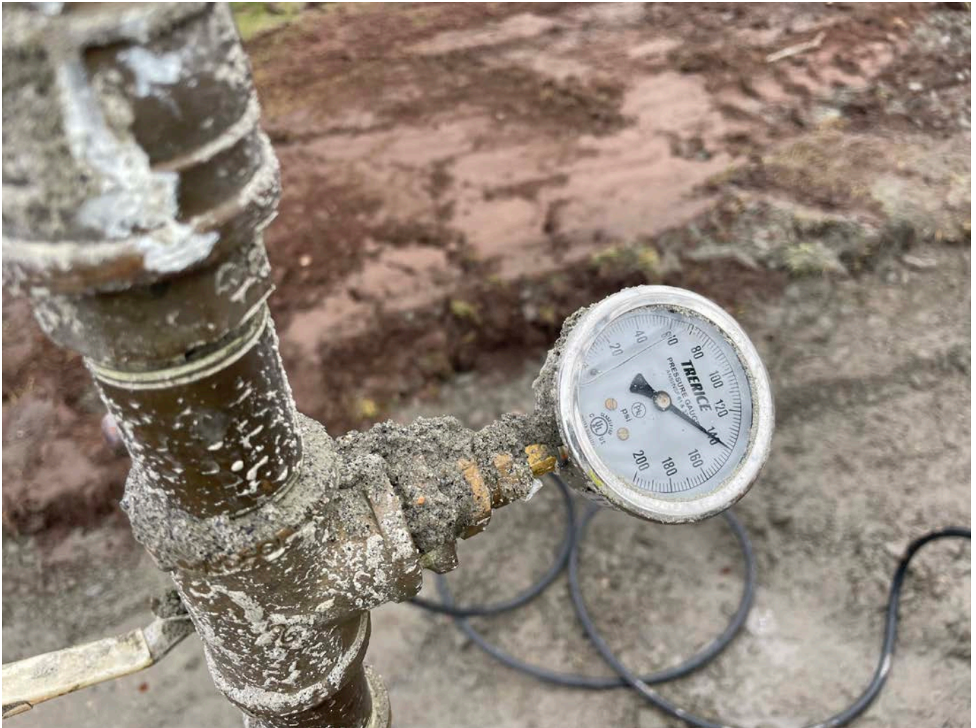
Picture 9: Pressure gage showing a pressure of 140 PSI on the 4" DIP water service line they installed at the Durham Manufacturing property.