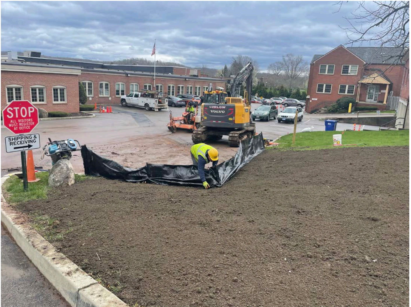
Picture 13: Ludlow erecting silt fencing at the Durham Manufacturing property, downslope of where they restored and seeded the area that was disturbed during the installation of a 4" DIP water service line. View to the northeast.