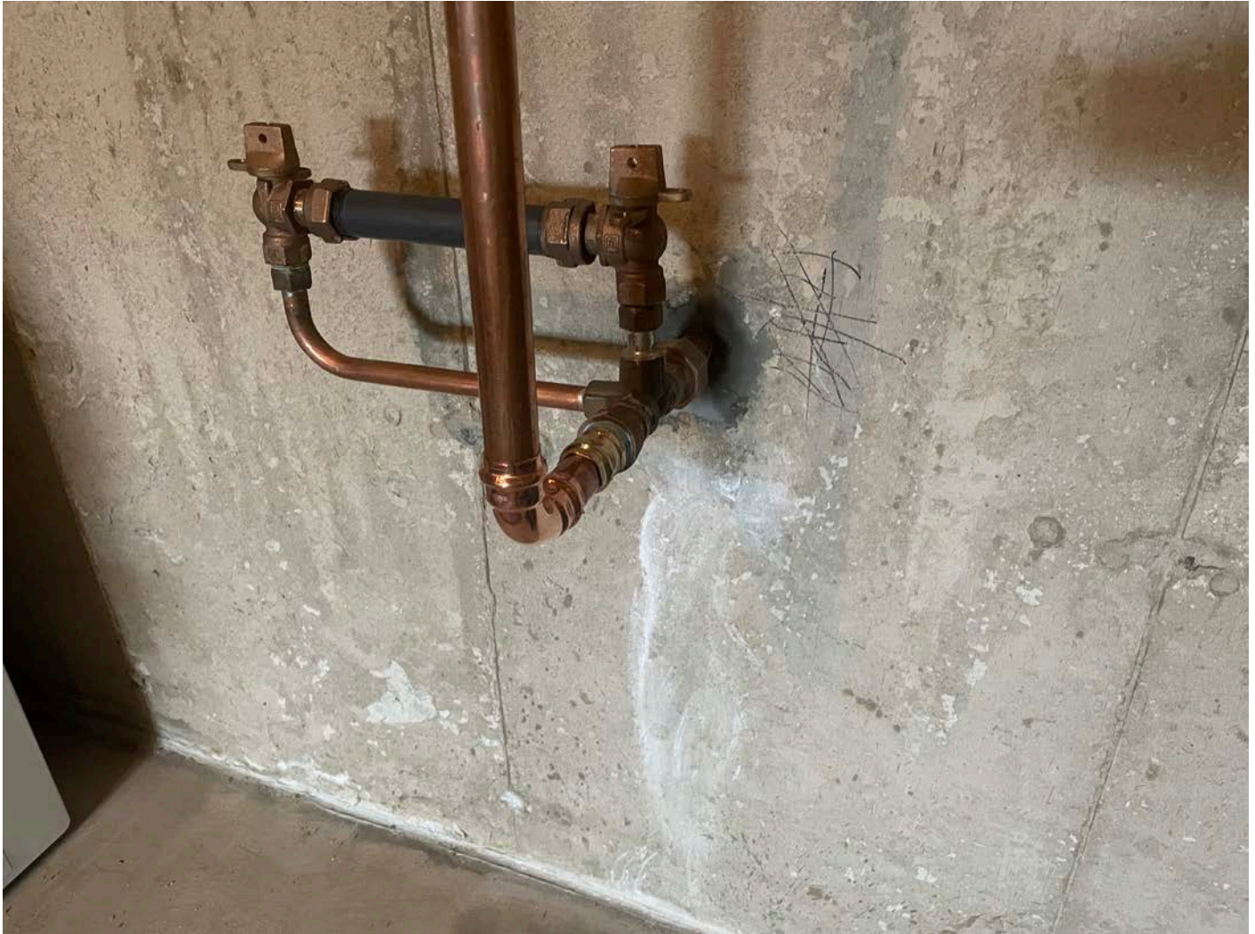
Picture 14: Area of the wall and floor in the basement of the 166 Maple Avenue residence where the resident observed leaking where the 1" copper water service line penetrates the eastern foundation of the home. View to the northeast.