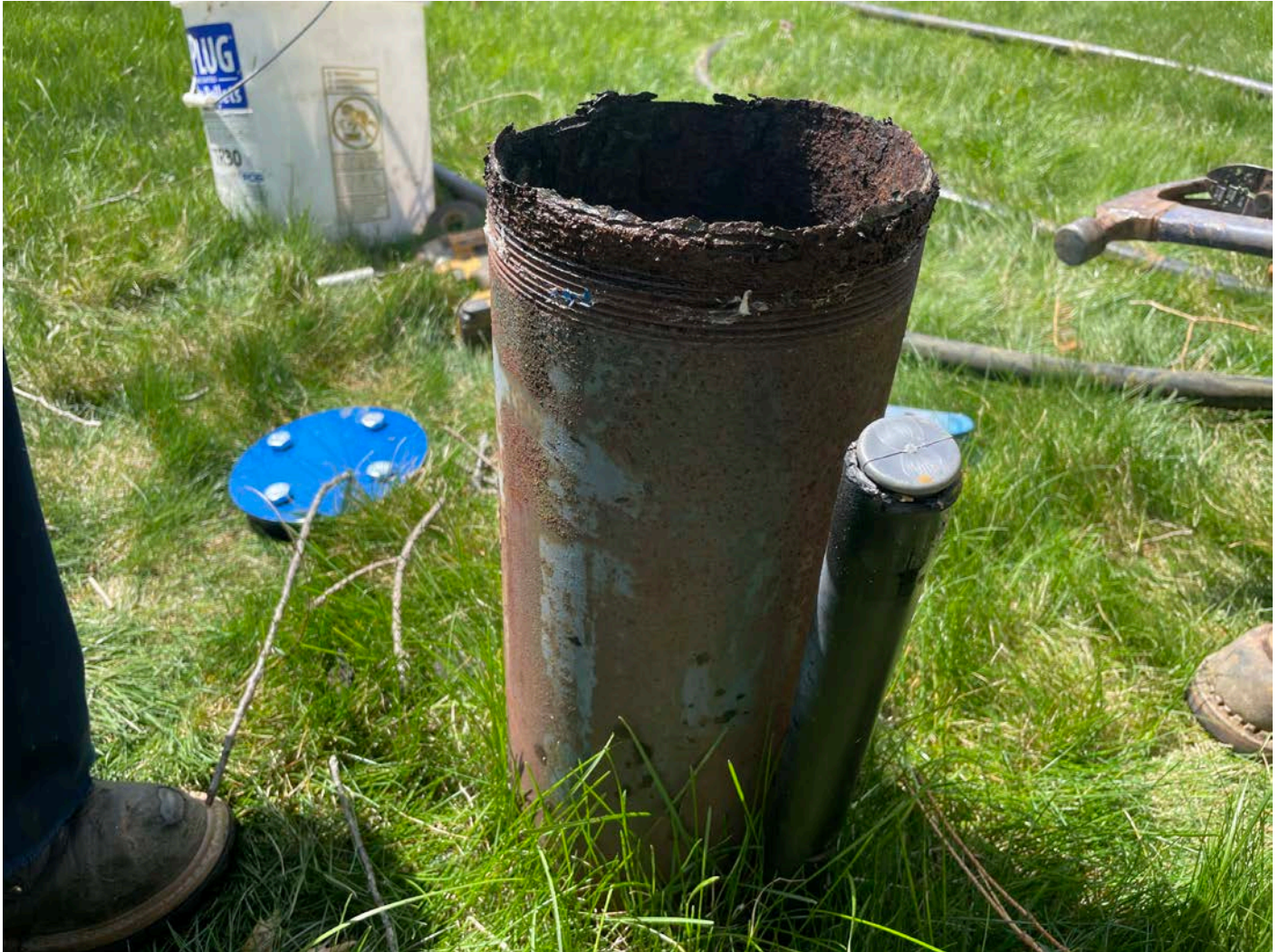
Picture 8: Grela has just sealed the electric line conduit for the well pump with a gray plastic plug on the well located on the west side of the 176 Main Street, Durham, property. View to the southwest.