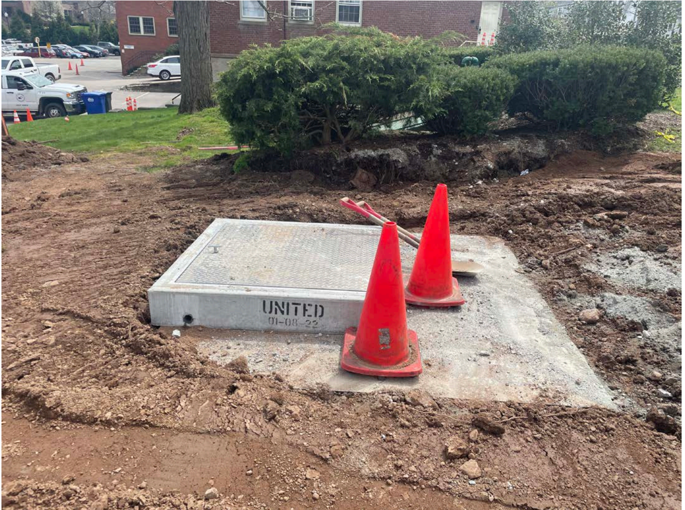
Picture 14: Ludlow has partially backfilled around the top of the water meter vault that they installed at the Durham Manufacturing property. View to the southeast.