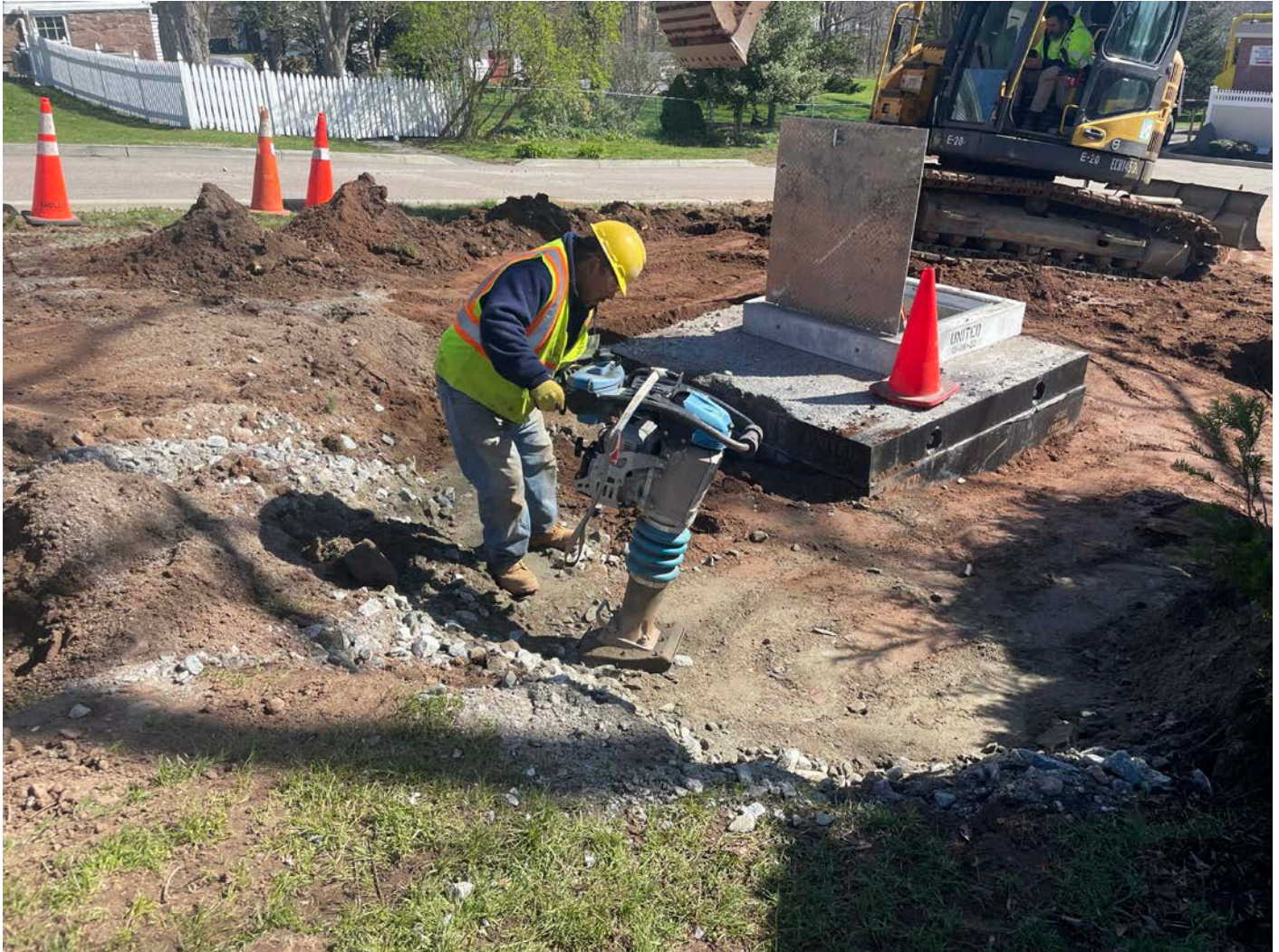
Picture 3: Ludlow using a jumping jack to compact fill on the west side of the meter vault they just installed at the Durham Manufacturing property. View to the northeast.