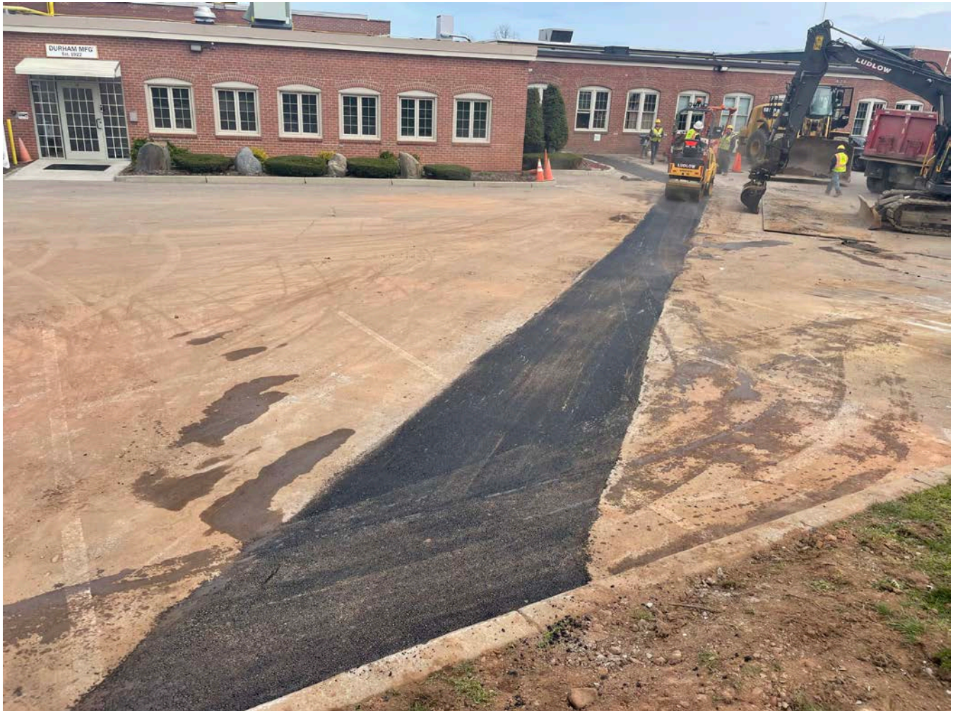
Picture 15: Overview of the paving that Ludlow placed to seal the trench they excavated during the installation of a 4" DIP water service line at the Durham Manufacturing property. View to the east/southeast.