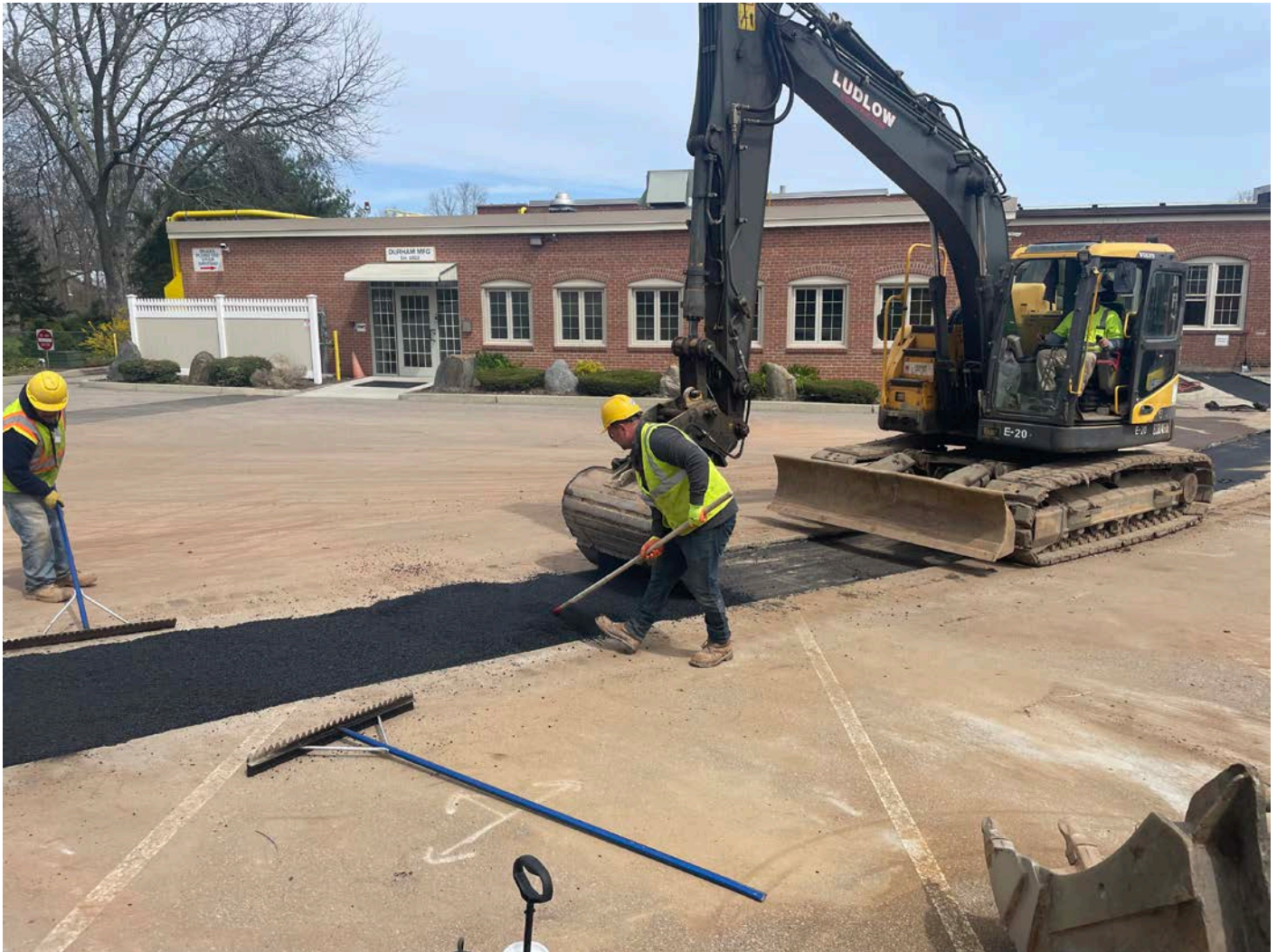
Picture 13: Ludlow placing and raking a second lift of asphalt within the trench footprint at the Durham Manufacturing property. View to the northeast.