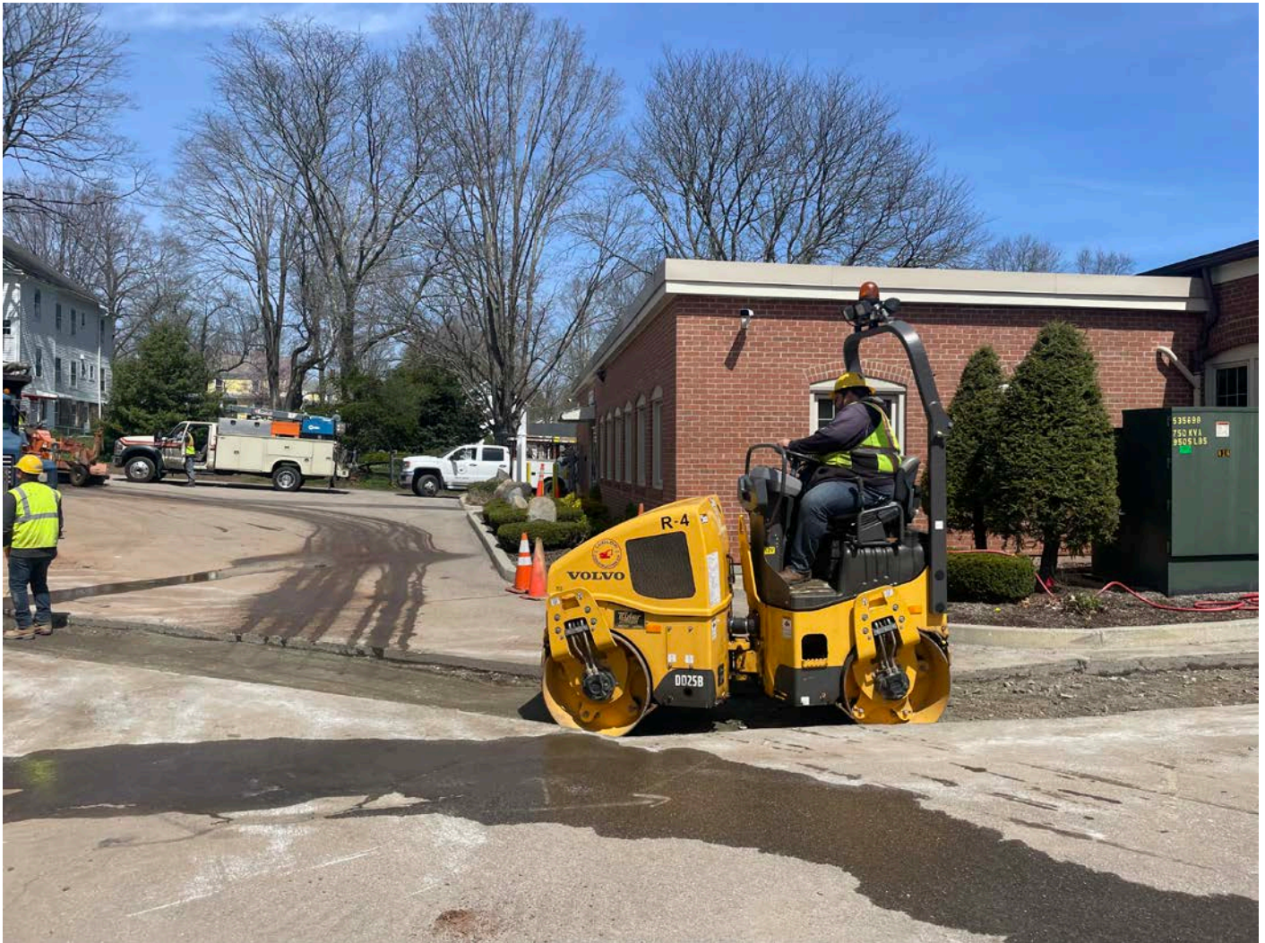
Picture 9: Ludlow compacting fill within the trench footprint at the Durham Manufacturing property as they prepare to pave the trench. View to the north.