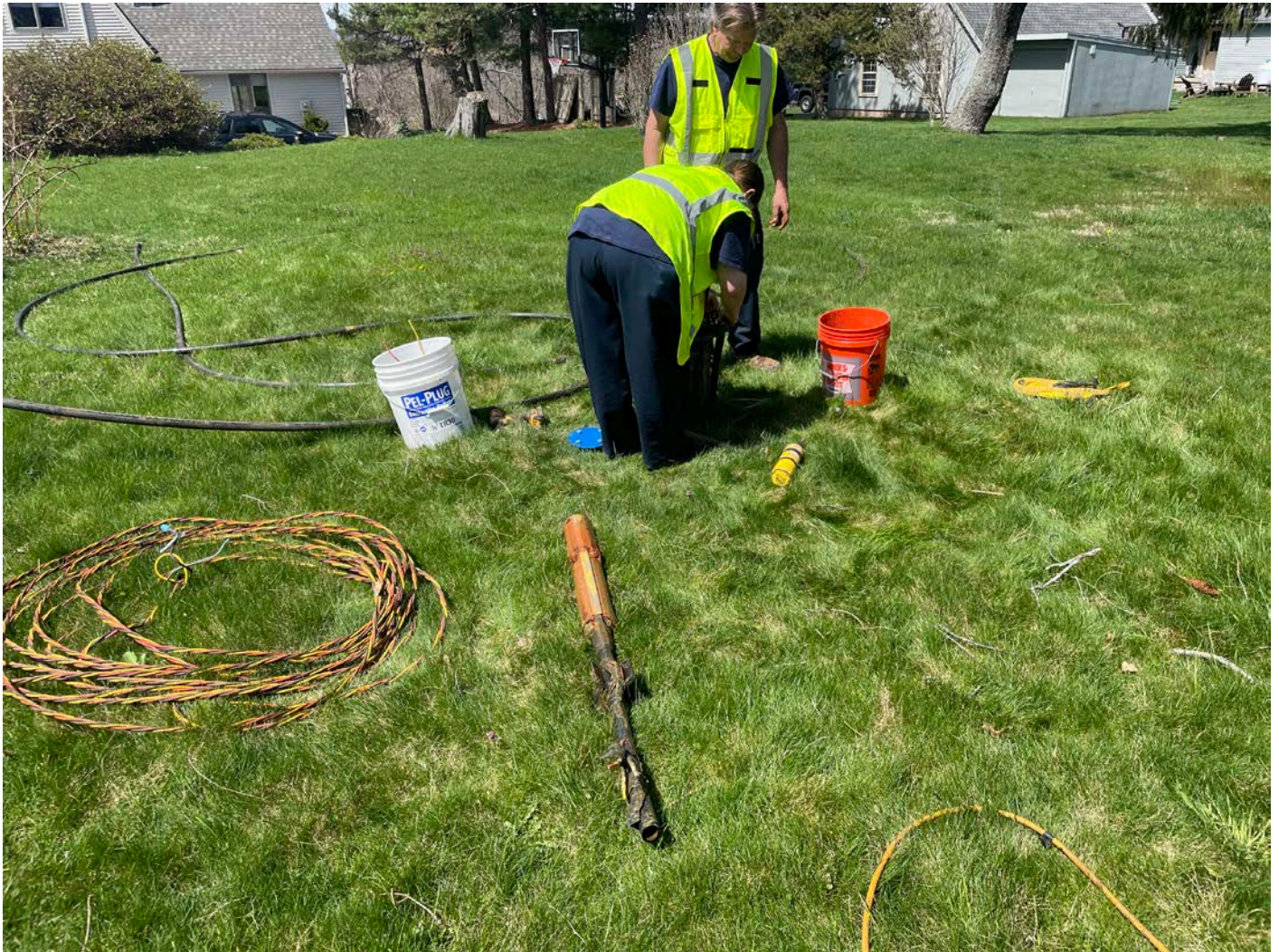
Picture 7: Grela has just pulled the well line and well pump from the second well located on the west side of the 176 Main Street, Durham, property. View to the west.