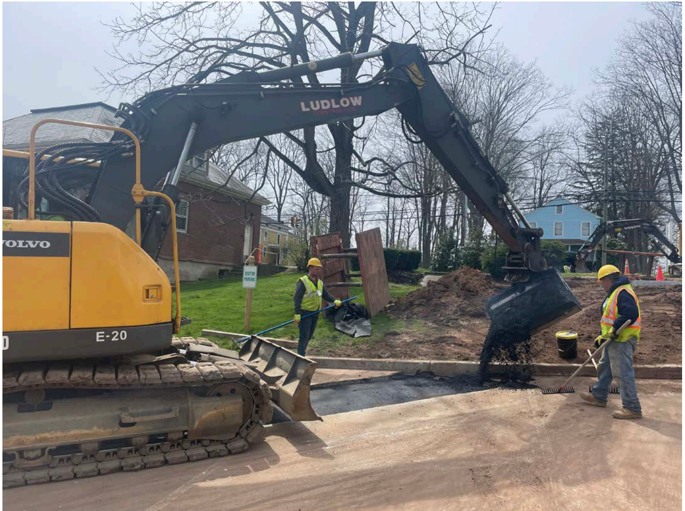
Picture 12: Ludlow placing a second lift of asphalt within the trench footprint at the Durham Manufacturing property. View to the west.