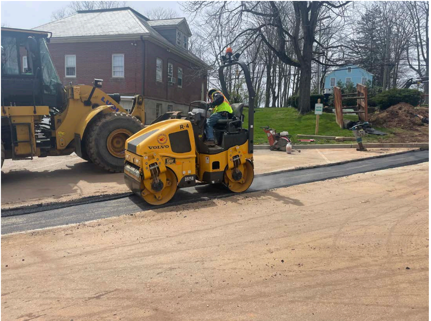
Picture 11 Ludlow compacting the first lift of asphalt that they placed within the trench footprint at the Durham Manufacturing property. View to the west.