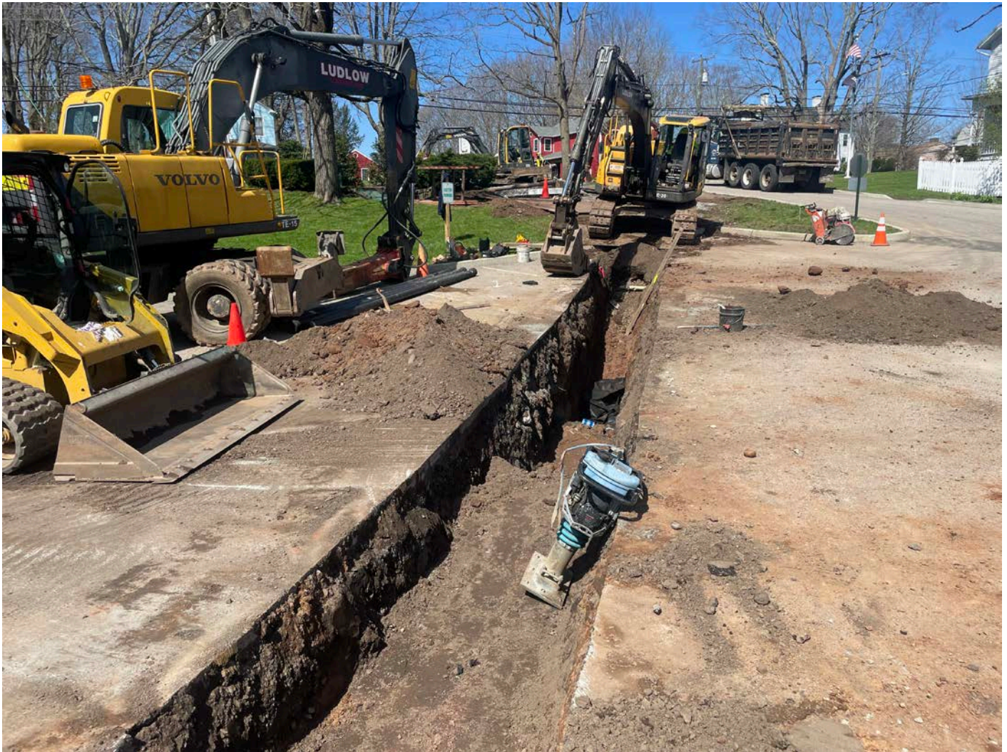
Picture 11 Overview of the trench that Ludlow excavated across the parking lot of the Durham Manufacturing property for the installation of a 4" DIP water service line. View to the northwest.