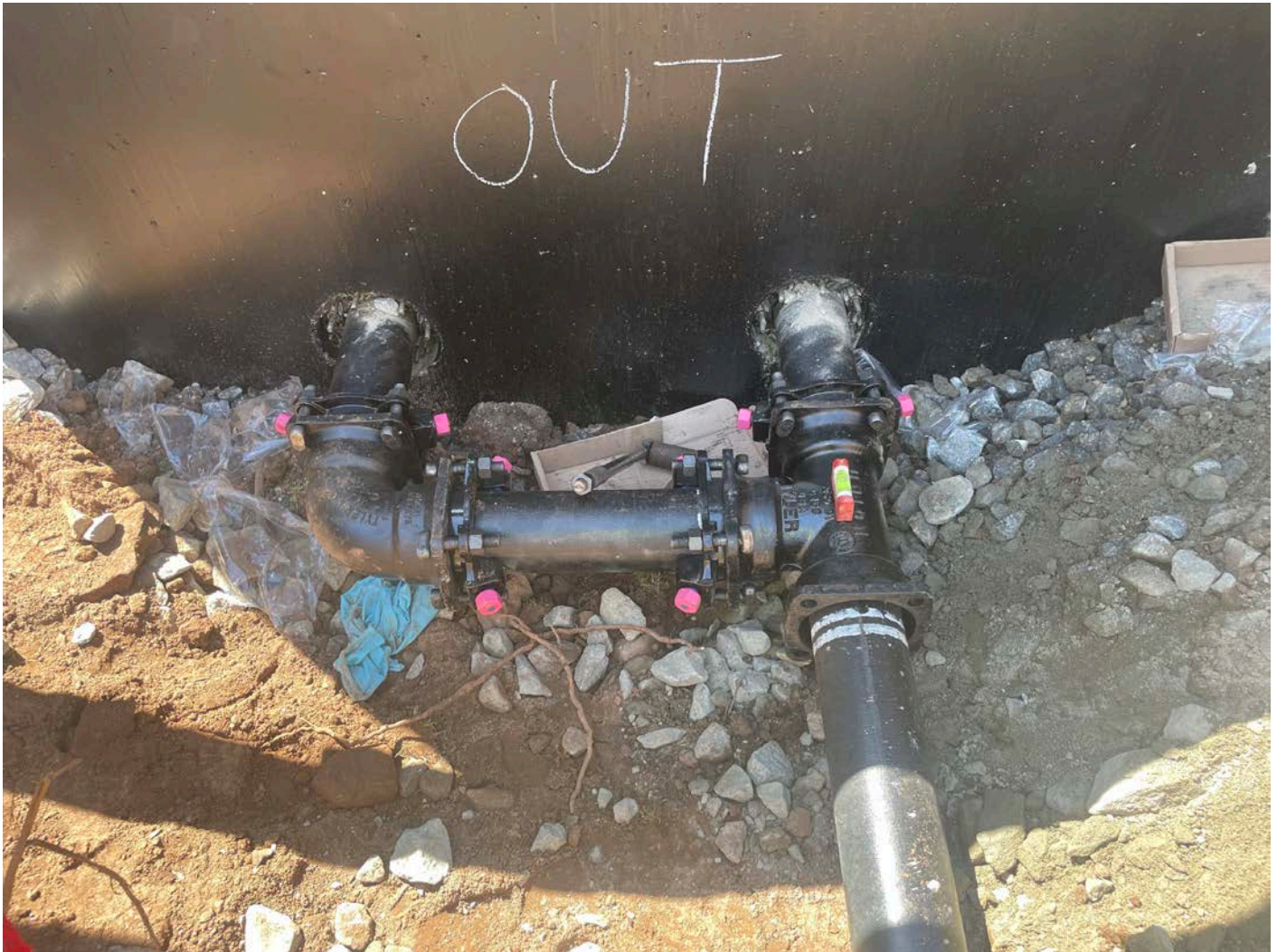
Picture 14: 4" DIP and DIP fittings that Ludlow installed on the east side of the water meter vault they installed at the Durham Manufacturing facility. View to the west.