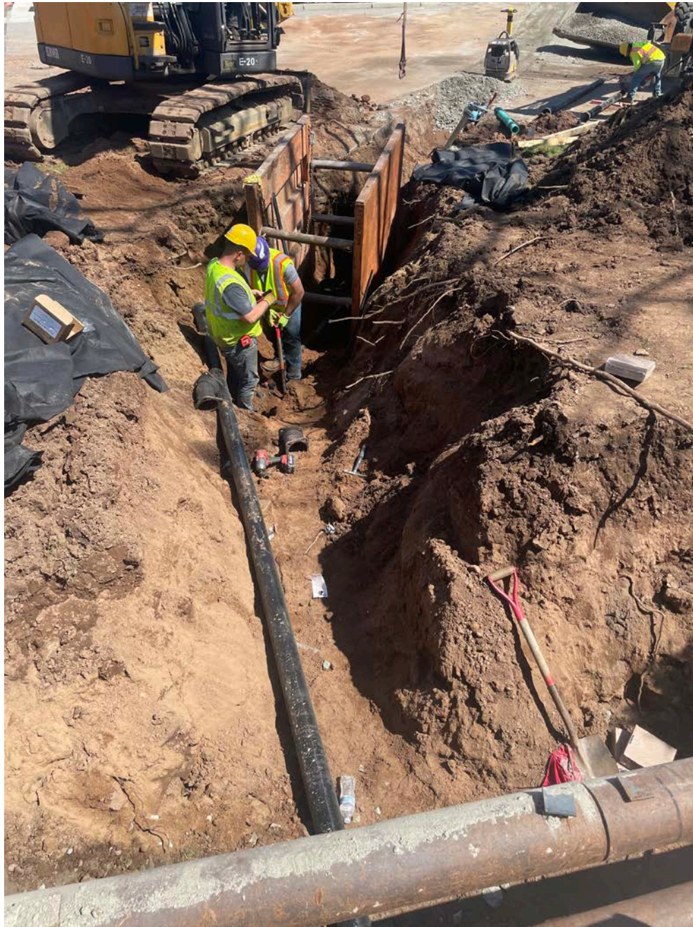
Picture 15: Overview of the 4" DIP water service line that Ludlow installed on the east side of the water meter vault at the Durham Manufacturing property. View to the east.