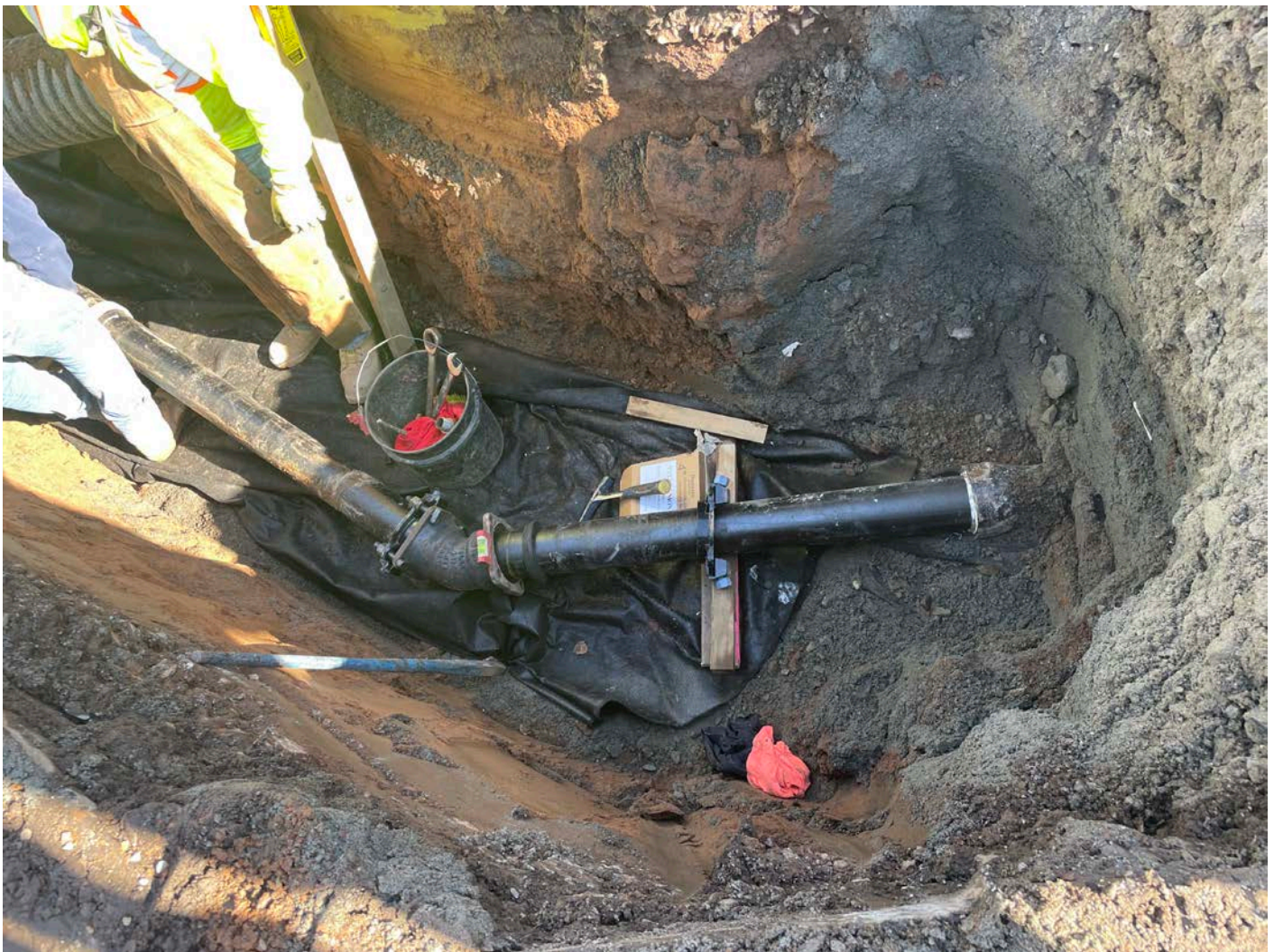
Picture 10: 4" DIP that Ludlow installed on the west side of the Durham Manufacturing facility (the facility's foundation appears on the right side of the photograph). View to the north.