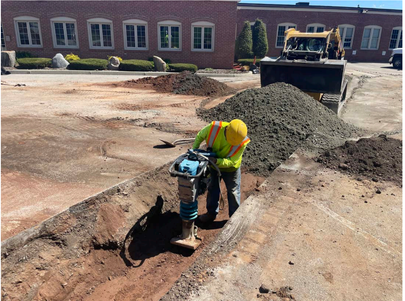
Picture 13: Ludlow using a jumping jack to compact fill that Ludlow is backfilling into the trench in 1'-lifts at the Durham Manufacturing facility. View to the east.

Project: Durham Meadows Pipeline Installation Date: April 15, 2022 Location: Durham Day of Week: Friday Project #: AECOM: 6061487 Report No: 405 Contractor: Ludlow Construction Page: 17 of 20