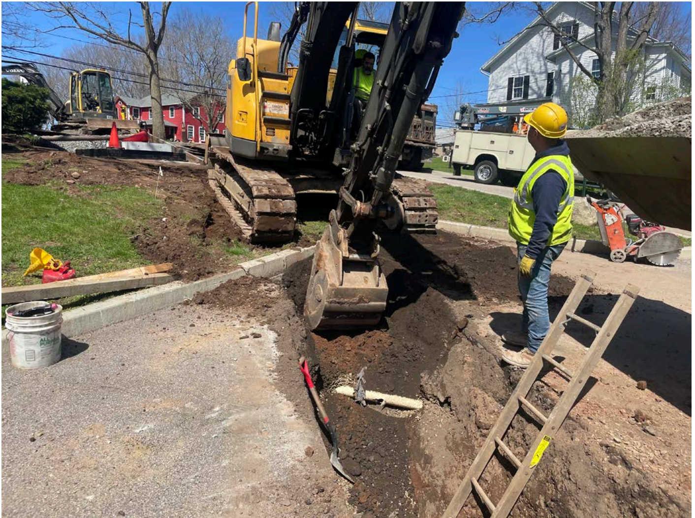
Picture 12: Ludlow excavating a trench on the northwest side of the parking lot of the Durham Manufacturing property for the installation of a 4" DIP water service line. The 4" white PVC drain line they damaged is visible in front of the excavator bucket. View to the northwest.