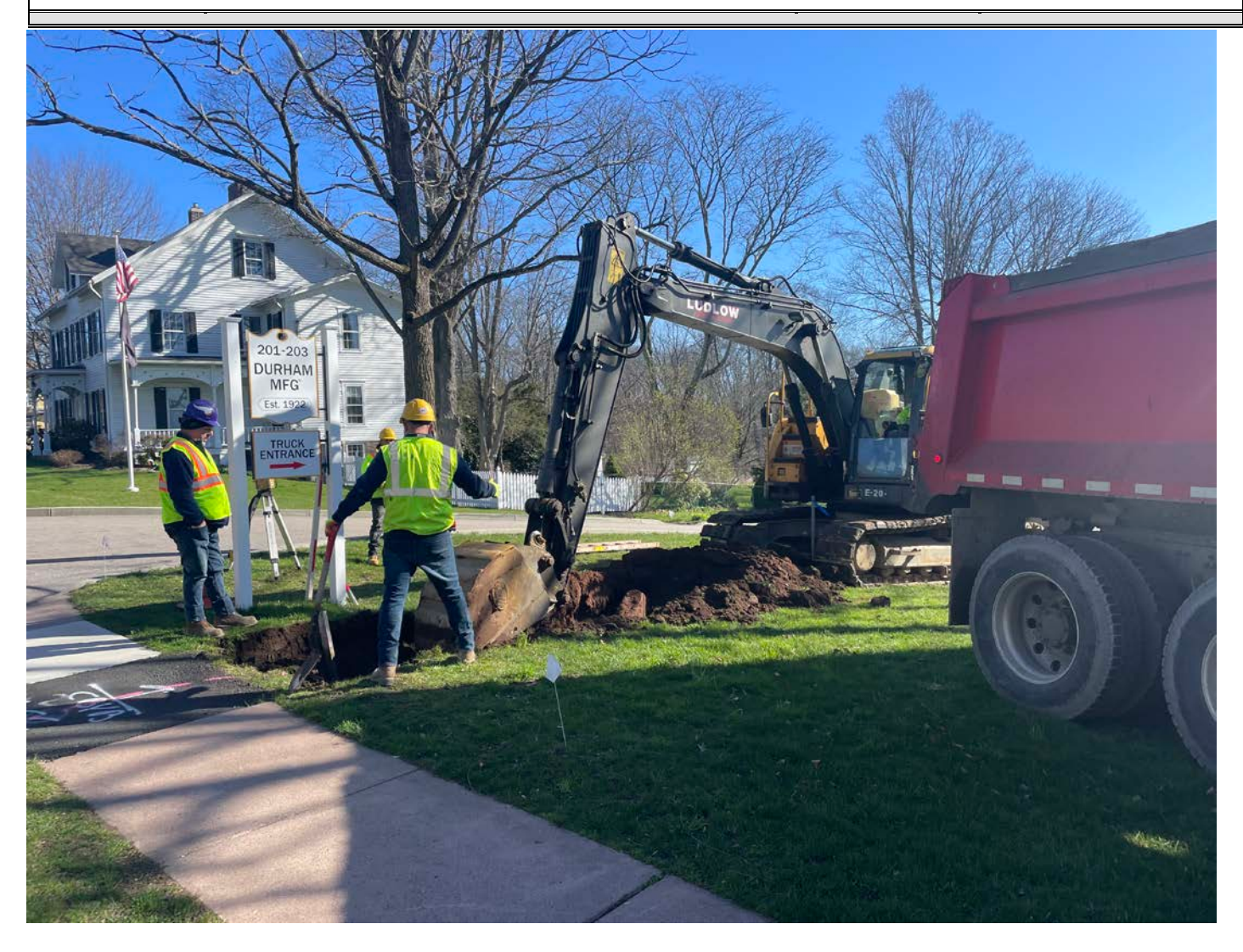
Picture 1: Ludlow beginning to excavate a trench at the Durham Manufacturing property for the installation of a 4" DIP water service line. View to the northeast.

Contractor: Ludlow Construction Page: 3 of 8