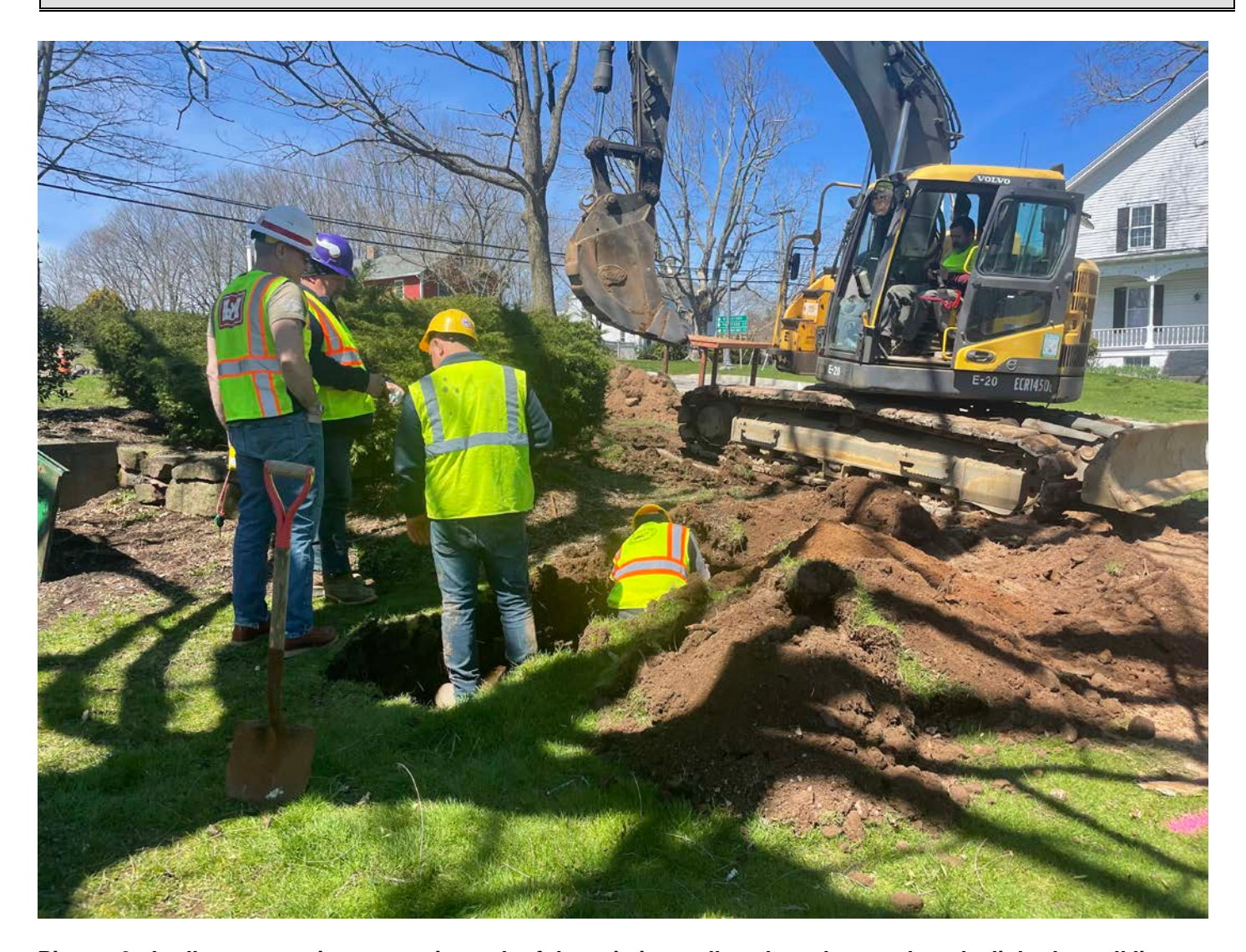
Picture 6: Ludlow excavating a test pit south of the existing well vault as they work to daylight the well line and its associated power line. View to the northwest.