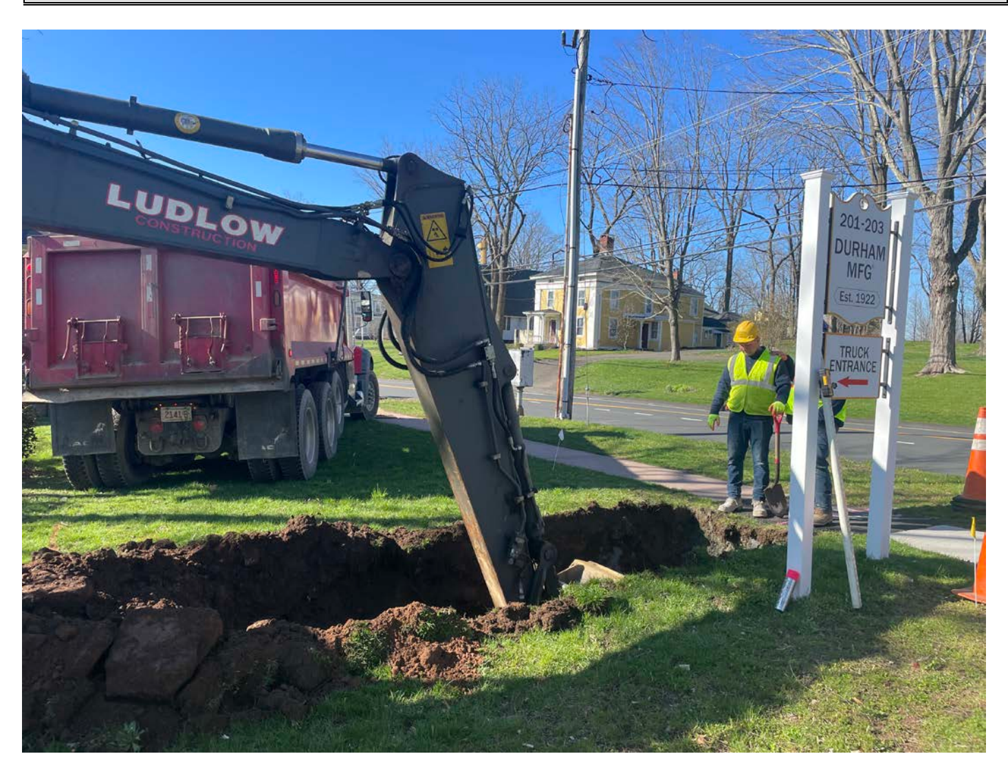
Picture 2: Ludlow beginning to excavate a trench at the Durham Manufacturing property for the installation of a 4" DIP water service line. View to the southwest.

Contractor: Ludlow Construction Page: 4 of 8