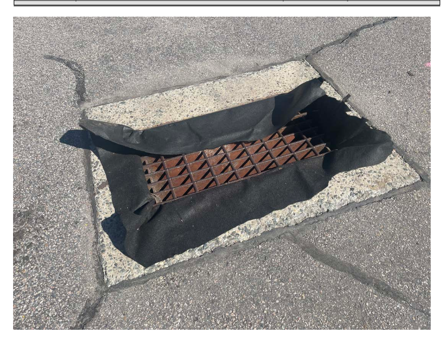
Picture 3: One of two catch basins where Ludlow placed filter fabric beneath the grate to capture sediment while they install a 4" DIP water line at the Durham Manufacturing property. View to the northwest.

Contractor: Ludlow Construction Page: 5 of 8