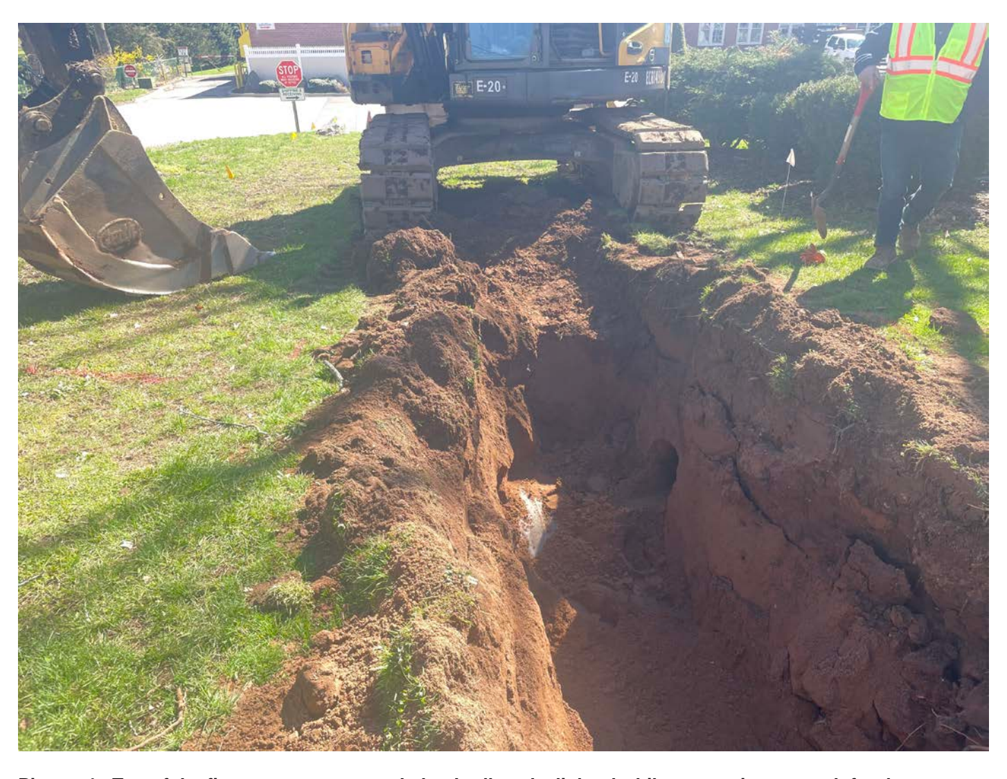
Picture 4: Top of the first water storage tank that Ludlow daylighted while excavating a trench for the installation of a 4" DIP water service line at the Durham Manufacturing property. View to the east.

Contractor: Ludlow Construction Page: 6 of 8