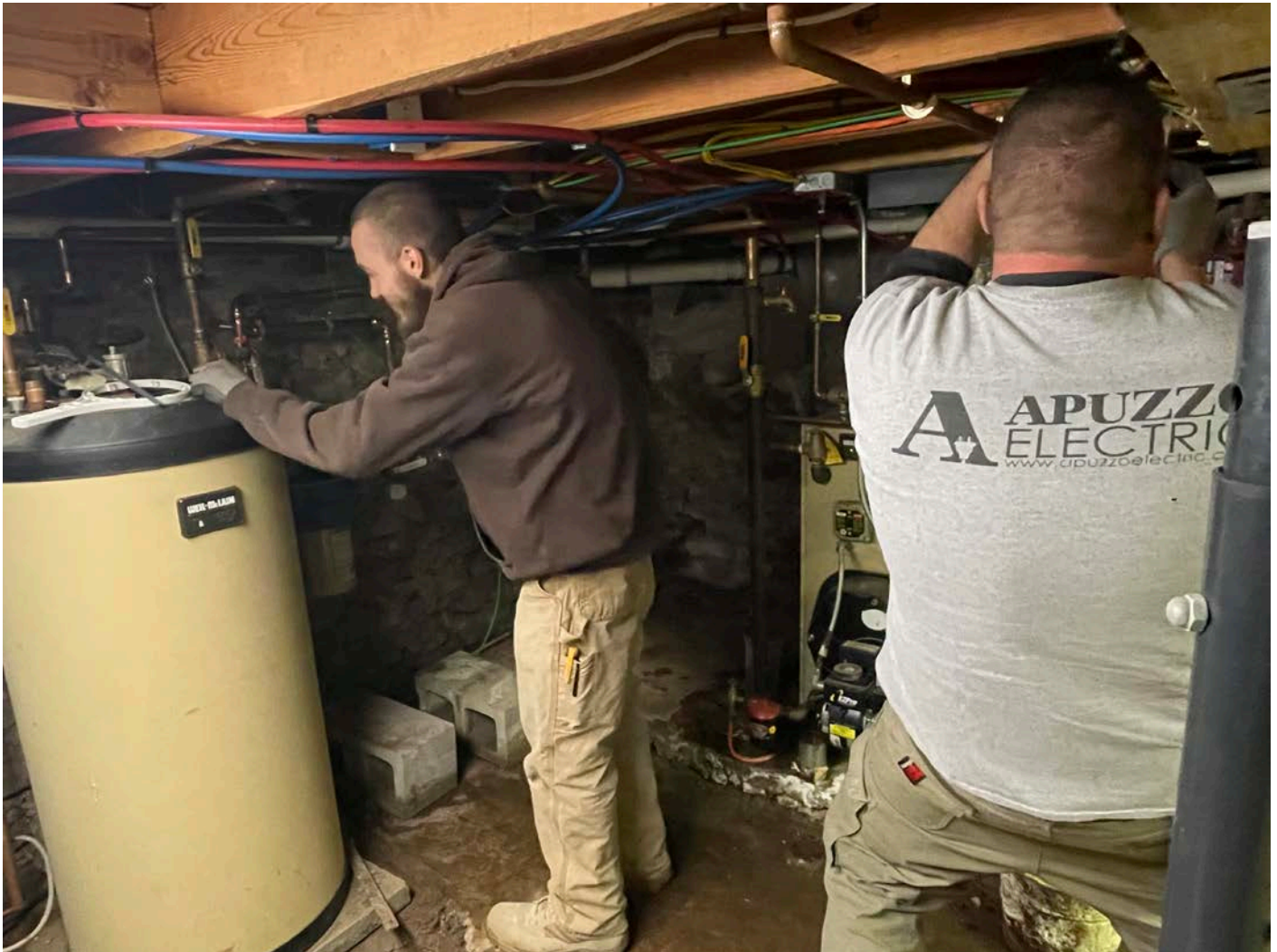
Picture 6: Apuzzo Electric installing a ground line to the final water service components at the 172 Maple Avenue, Durham, residence.