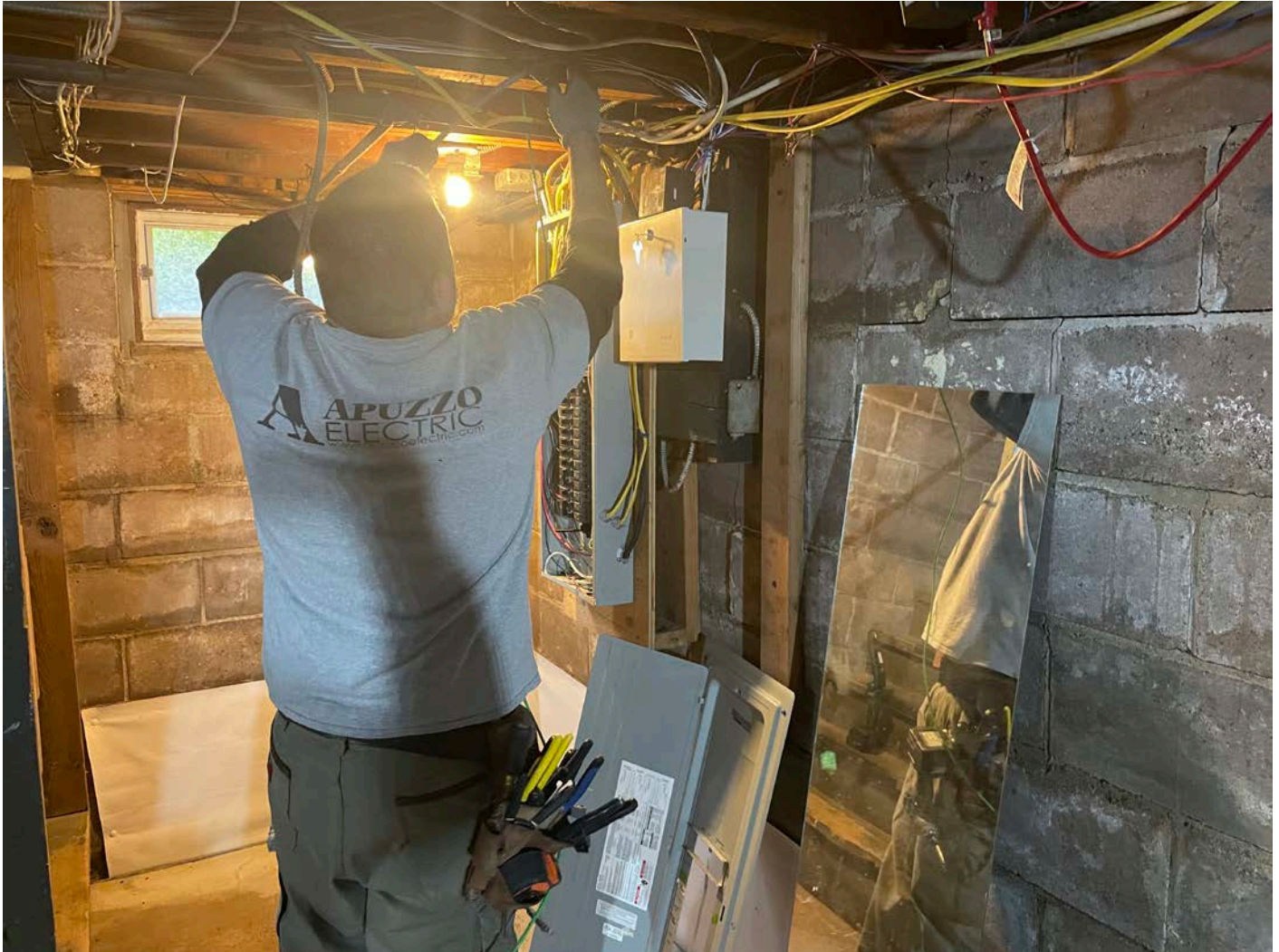
Picture 5: Apuzzo Electric installing a ground line to the final water service components at the 110 Maiden Lane, Durham, residence.