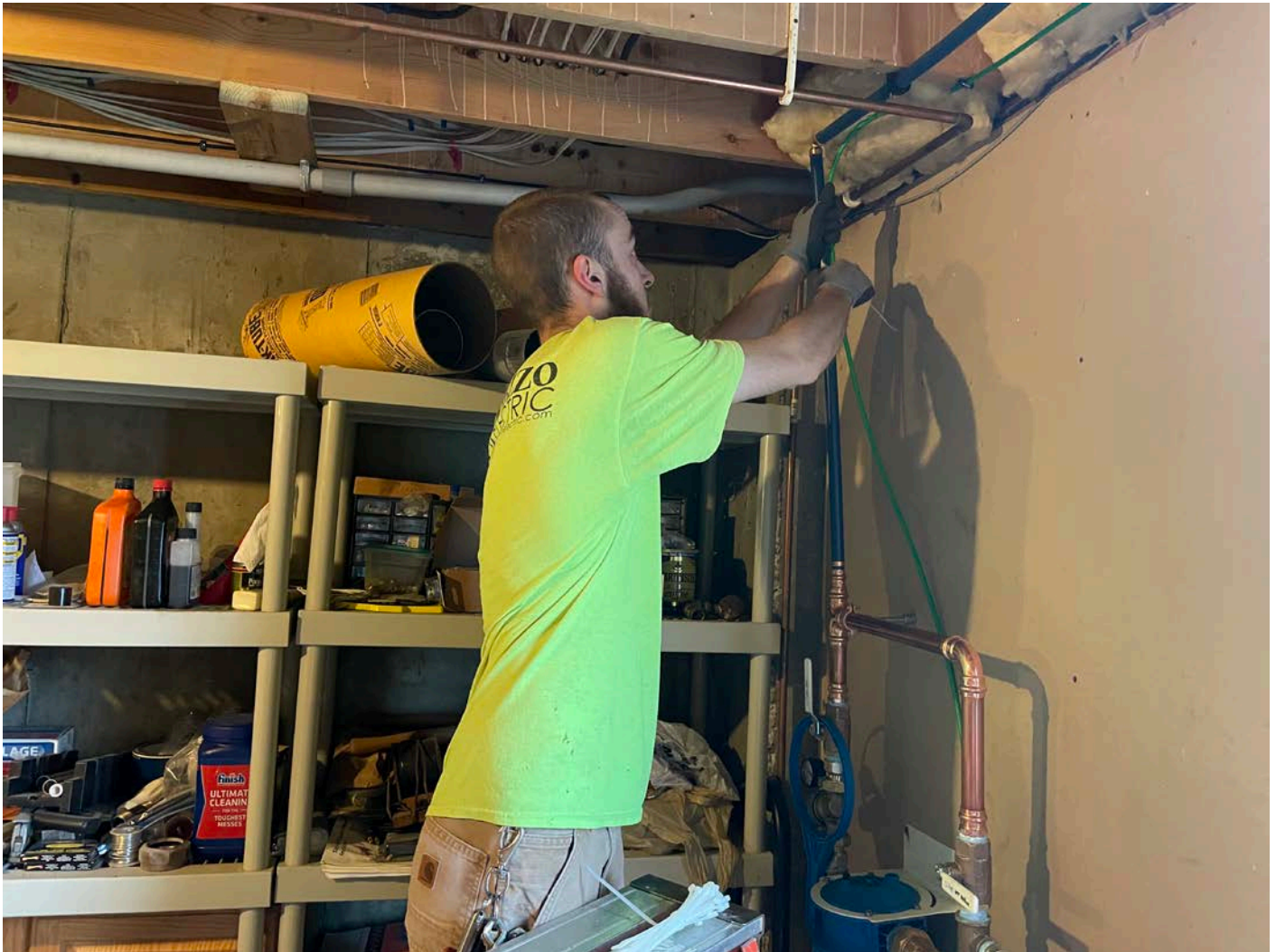
Picture 7: Apuzzo Electric installing a ground line to the final water service components at the 14 Talcott Lane, Durham, residence.