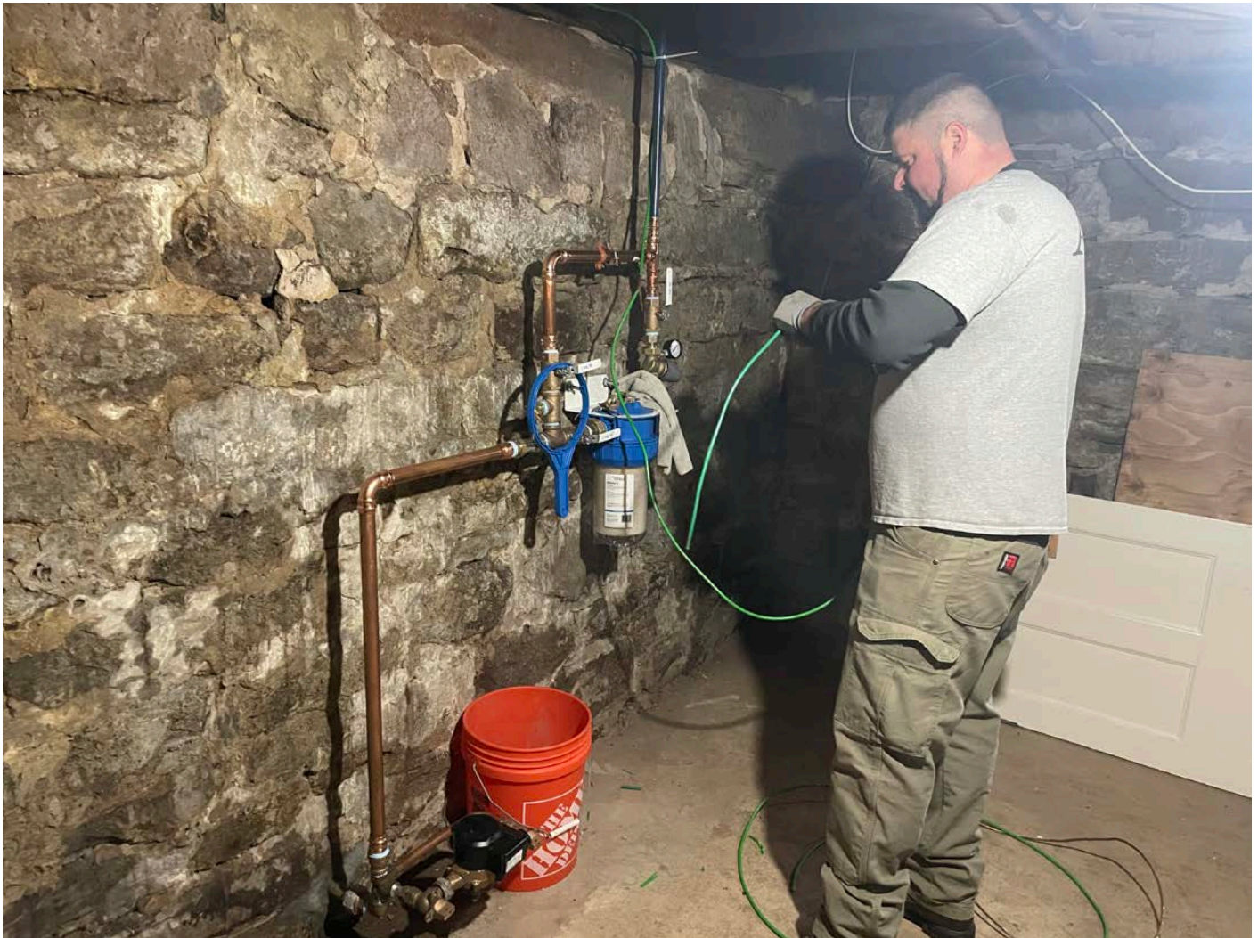
Picture 2: Apuzzo Electric installing a ground line to the final water service components at the 244 Maple Avenue, Durham, residence.