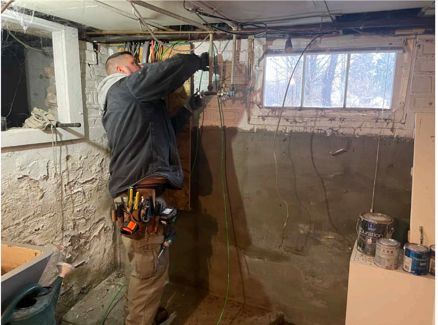
Picture 1: Apuzzo Electric installing a ground line to the final water service components at the 175 Maple Avenue, Durham, residence.