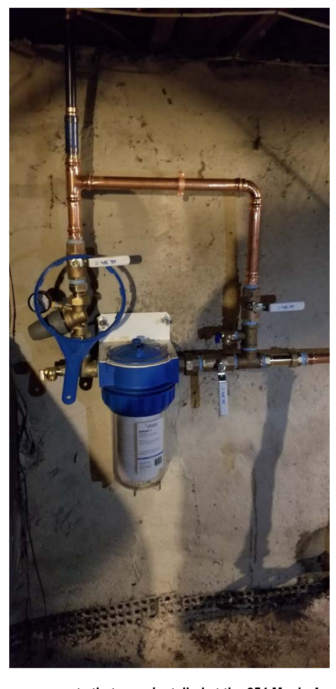
Picture 2: Final water system components that were installed at the 254 Maple Avenue, Durham, residence by Fazzino Plumbing.