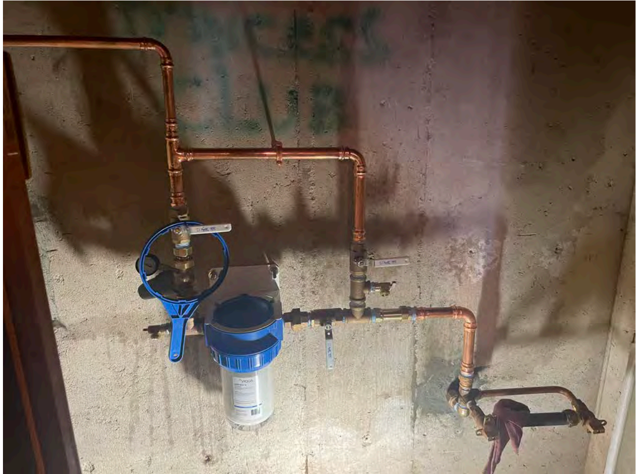
Picture 4: Final water system components at the 184 Maple Avenue, Durham, residence installed by Fazzino Plumbing.