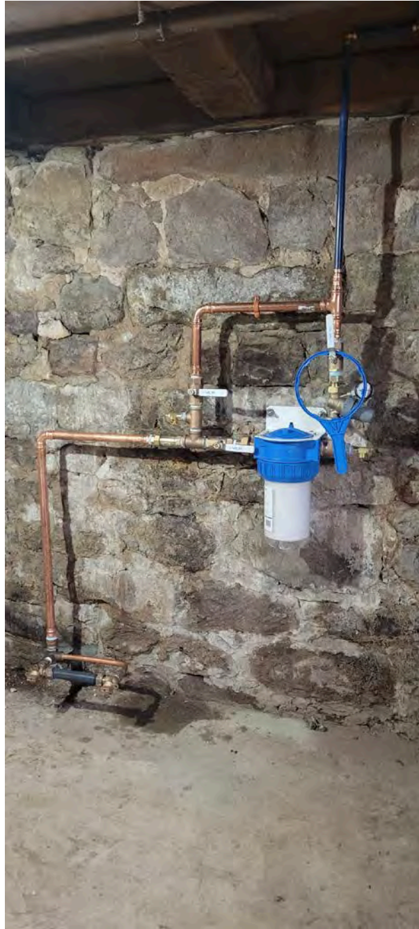
Picture 2: Final water system components installed at the 244 Maple Avenue, Durham, residence by Fazzino Plumbing.