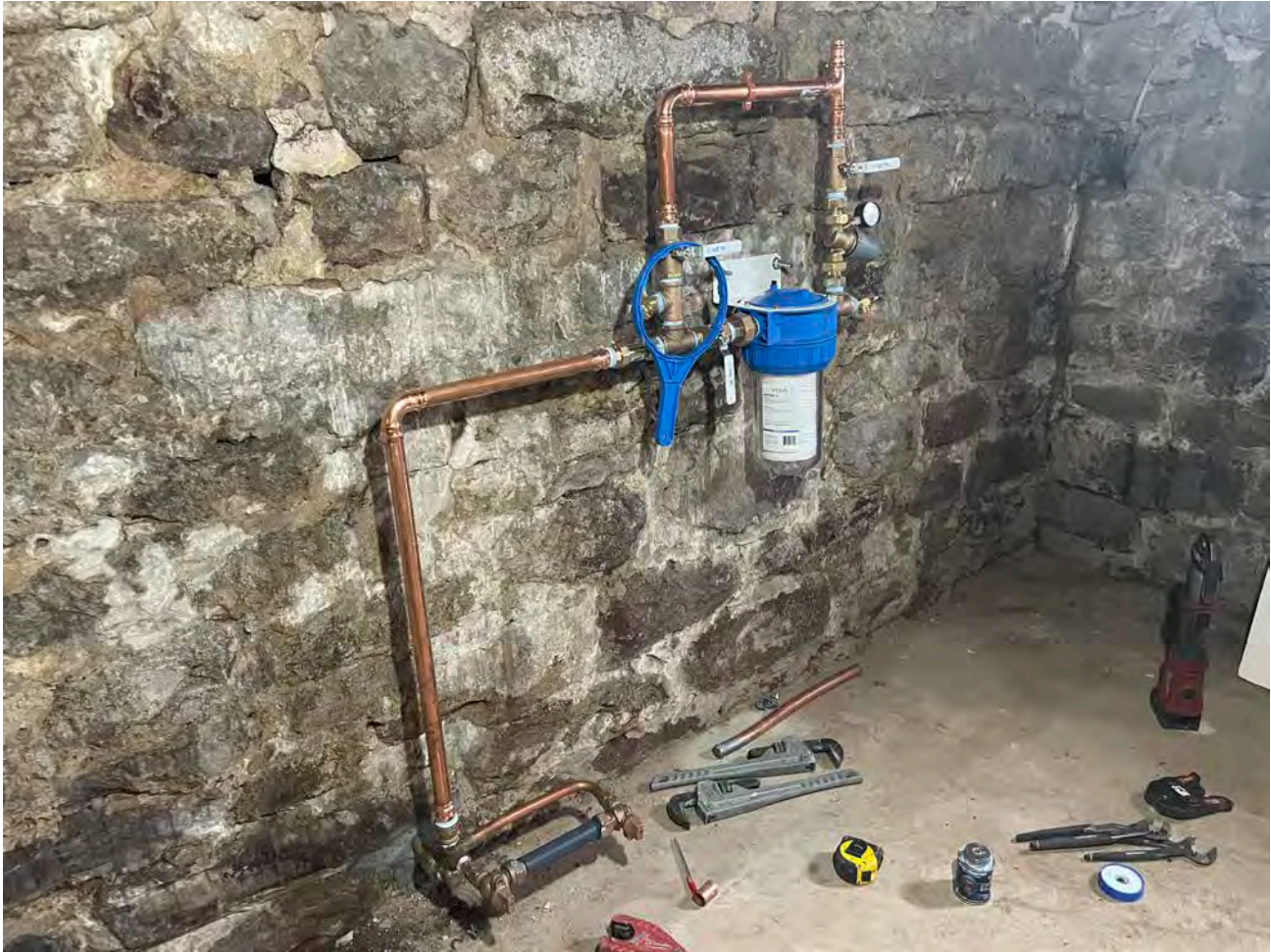
Picture 1: Final water system components at the 244 Maple Avenue, Durham, residence being installed by Fazzino Plumbing.