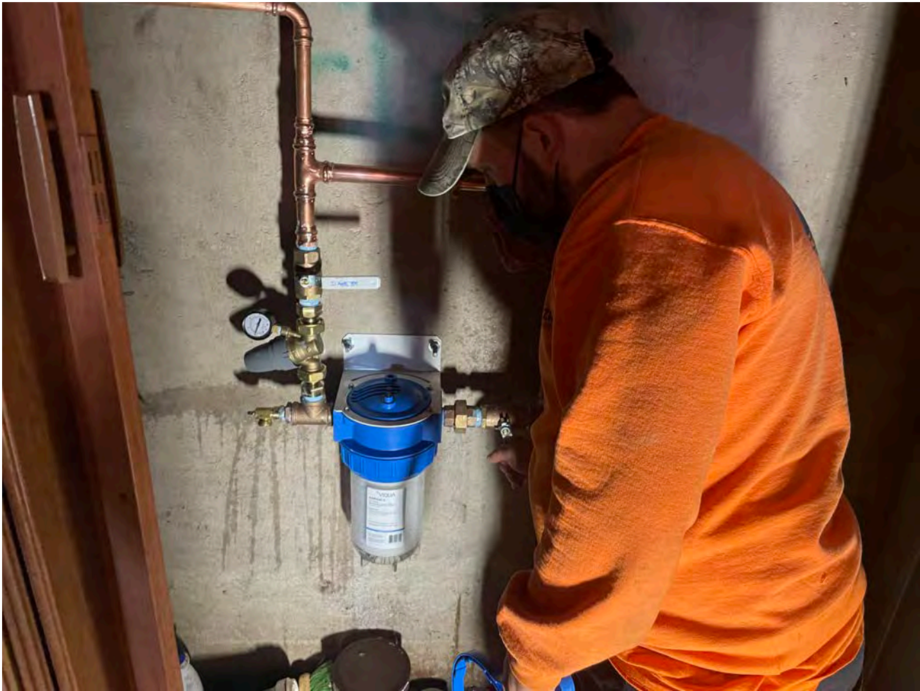
Picture 3: Final water system components at the 184 Maple Avenue, Durham, residence being installed by Fazzino Plumbing.