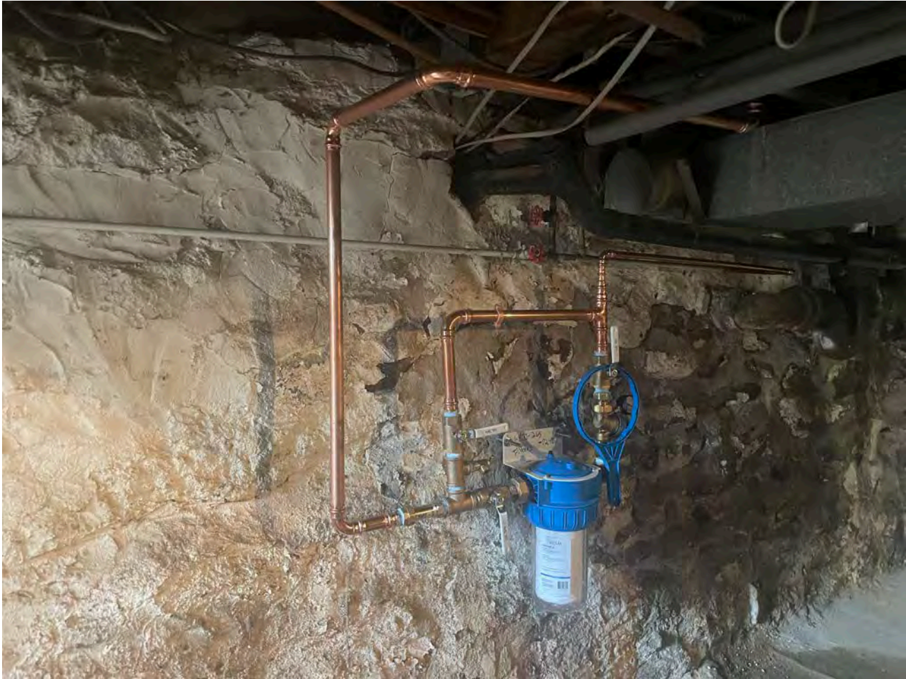
Picture 6: Final water system components at the 176 Maple Avenue, Durham, residence being installed by Fazzino Plumbing. View to the northwest