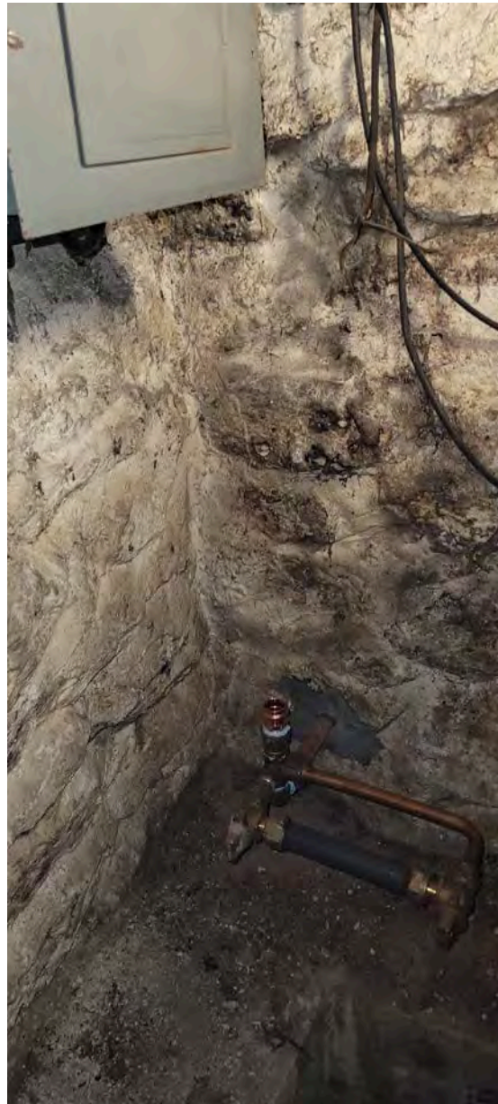
Picture 7: Water service line entering the east wall of the foundation at 176 Maple Avenue. The breaker panel that obstructed the original spot selected for the installation of the final water service components is visible at the top of the photograph.