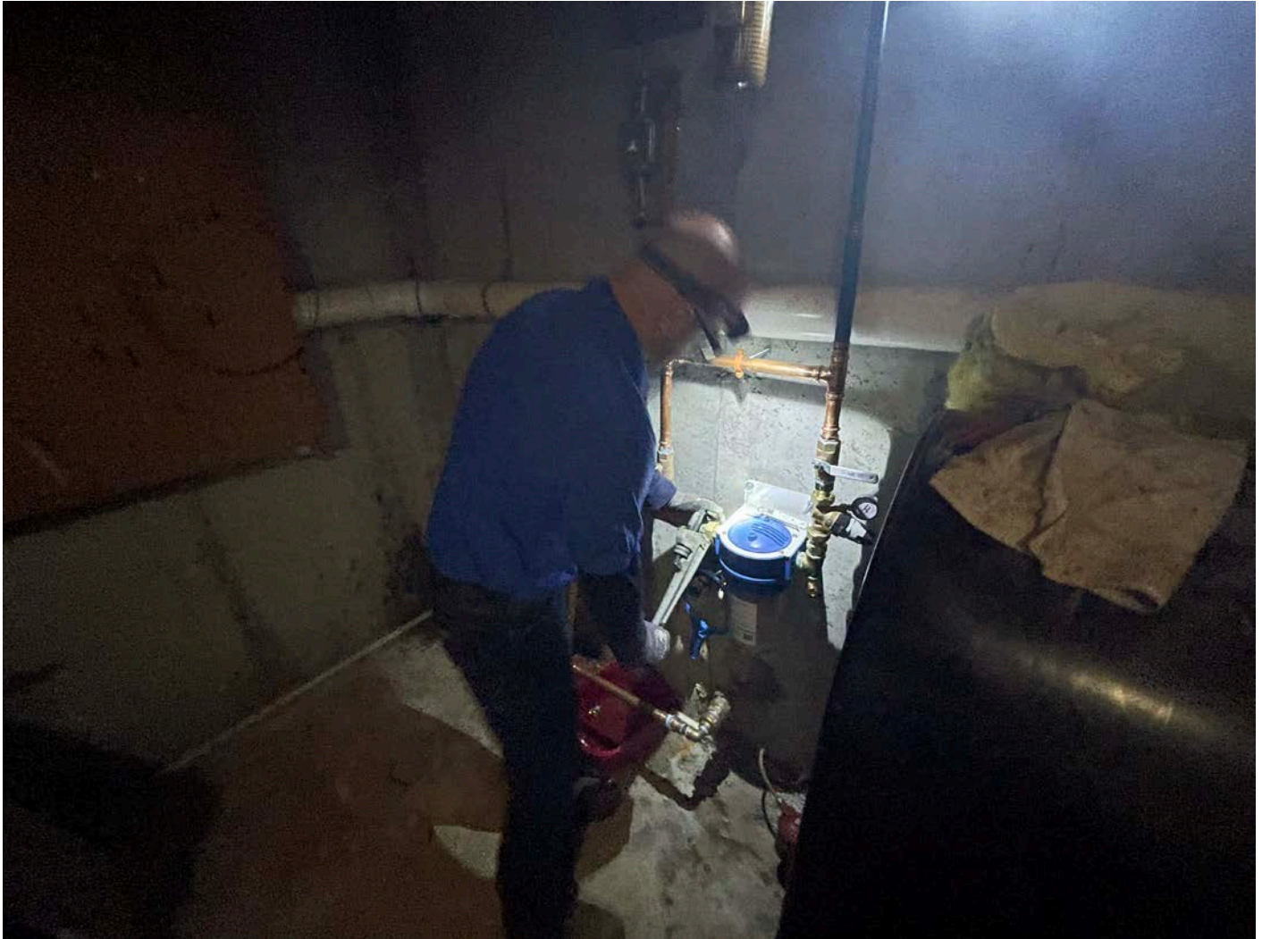
Picture 7: Fazzino Plumbing replacing the brass tees on the final water service components that they previously installed at the 10 Johns Way, Durham, residence.