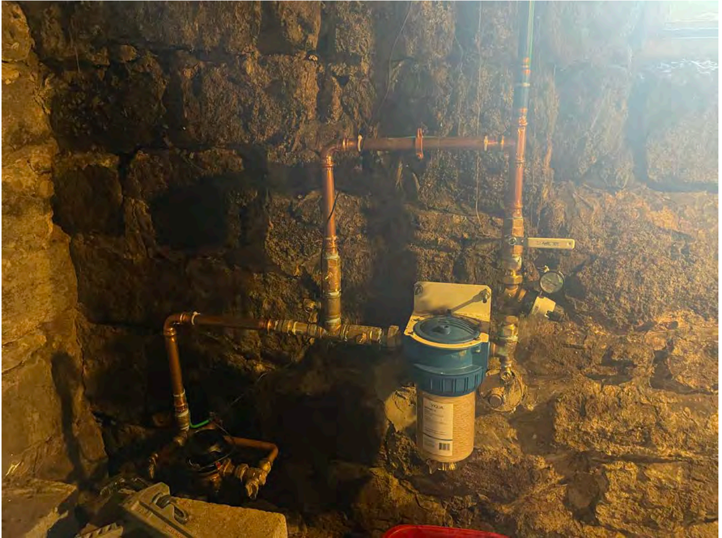
Picture 6: Fazzino Plumbing replacing the brass tees on the final water service components that they previously installed at the 268 Main Street, Durham, residence.