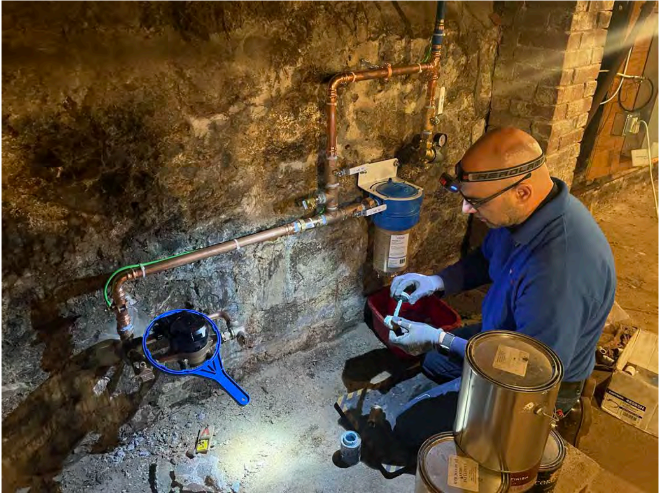
Picture 1: Fazzino Plumbing replacing the brass tees on the final water service components that they previously installed at the 202 Main Street, Durham, residence.