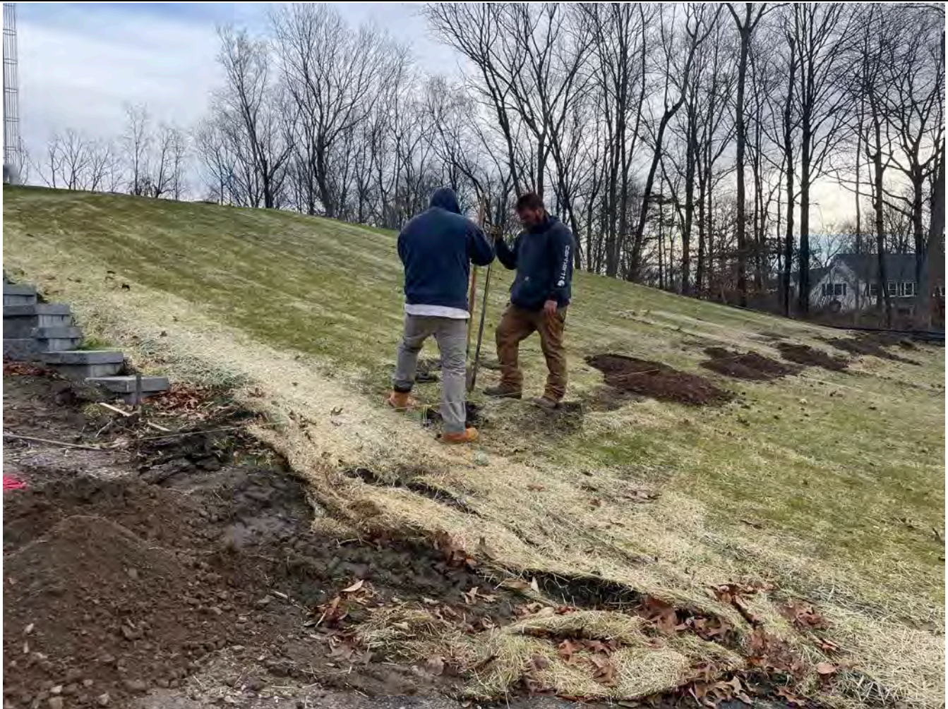
Picture 9: Eagle Fence and Guardrail clearing a hole they augured yesterday on the west side of the altitude valve vault at the water tank work zone with a pole hole digger. View to the south.