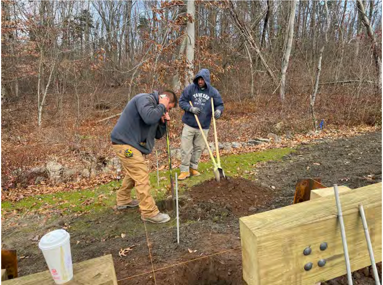
Picture 8: Eagle Fence and Guardrail working to clear a hole they augured yesterday on the north side of the Shared Access Driveway in Middletown with a breaker bar and a pole hole digger. View to the north.