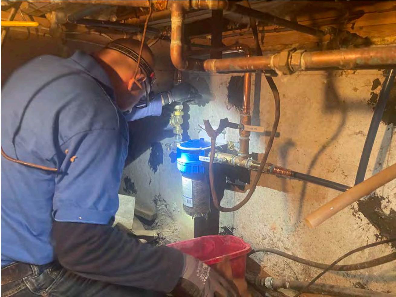
Picture 3: Fazzino Plumbing replacing the brass tees on the final water service components that they previously installed at the 119 Maple Avenue, Durham, residence.