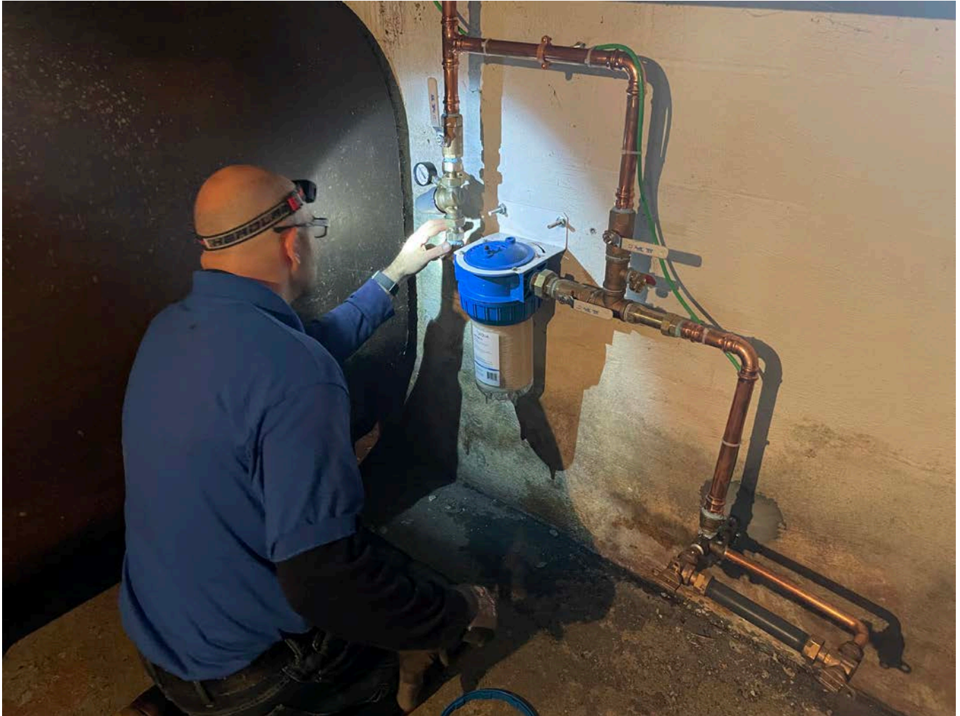
Picture 4: Fazzino Plumbing replacing the brass tees on the final water service components that they previously installed at the 177R Main Street, Durham, residence.