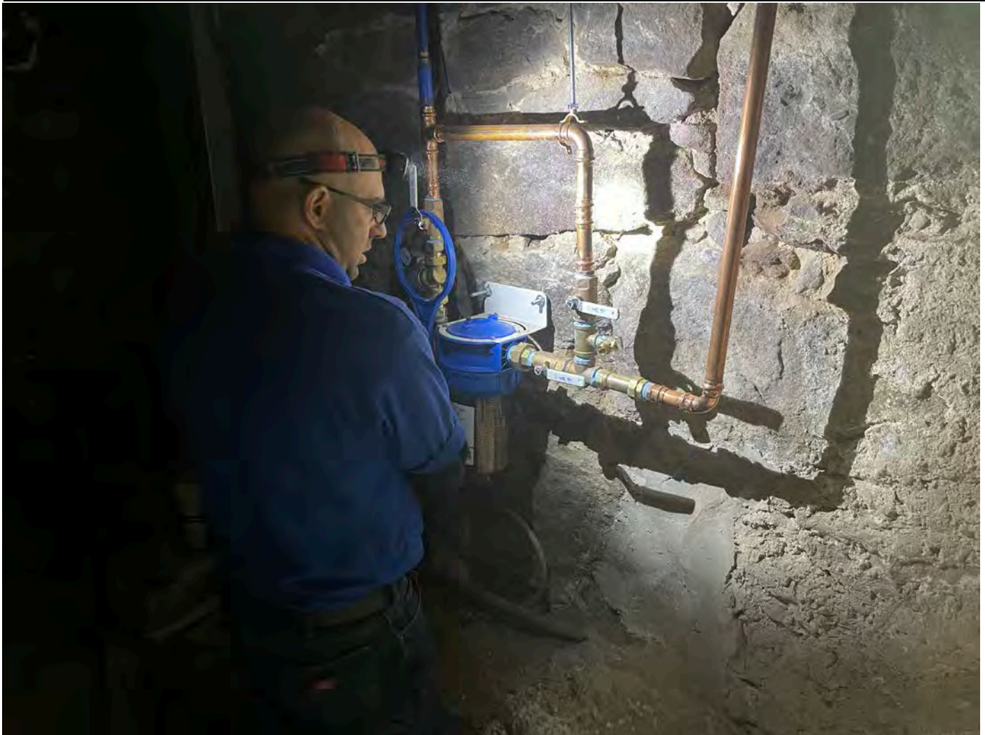
Picture 5: Fazzino Plumbing replacing the brass tees on the final water service components that they previously installed at the 297 Main Street, Durham, residence.