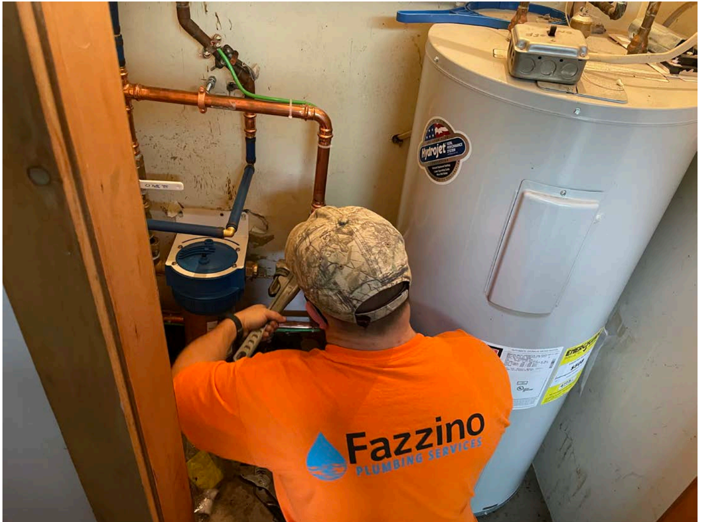
Picture 7: Fazzino Plumbing replacing the brass tees on the final water service components that they previously installed at the 305 Main Street, Durham, residence.