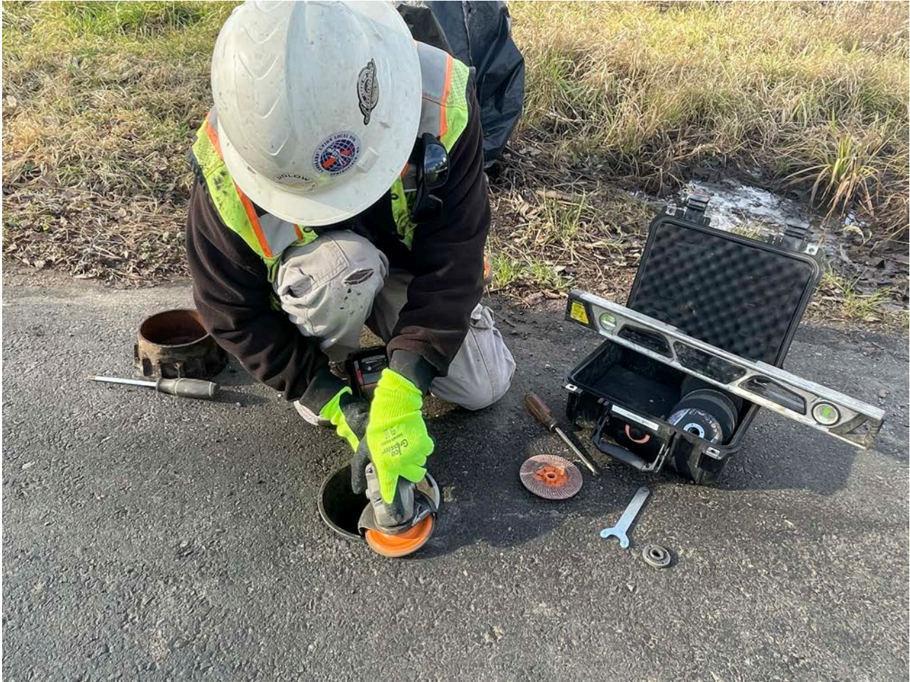
Picture 1: Ludlow grinding the top of a road box on Brick Lane to lower the profile of the lip. View to the west.

Project: Durham Meadows Pipeline Installation Date: December 14, 2021 Location: Main Street, Maiden Lane, and Maple Avenue, Durham; Shared Access Driveway, Middletown Day of Week: Tuesday Project #: AECOM: 6061487 Report No: 382 Contractor: Ludlow Construction Page: 3 of 12