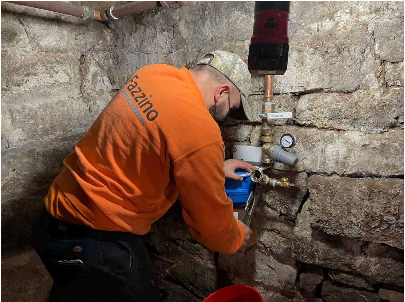
Picture 4: Fazzino Plumbing replacing the brass tees on the final water service components that they previously installed at the 146 Maple Avenue, Durham, residence.