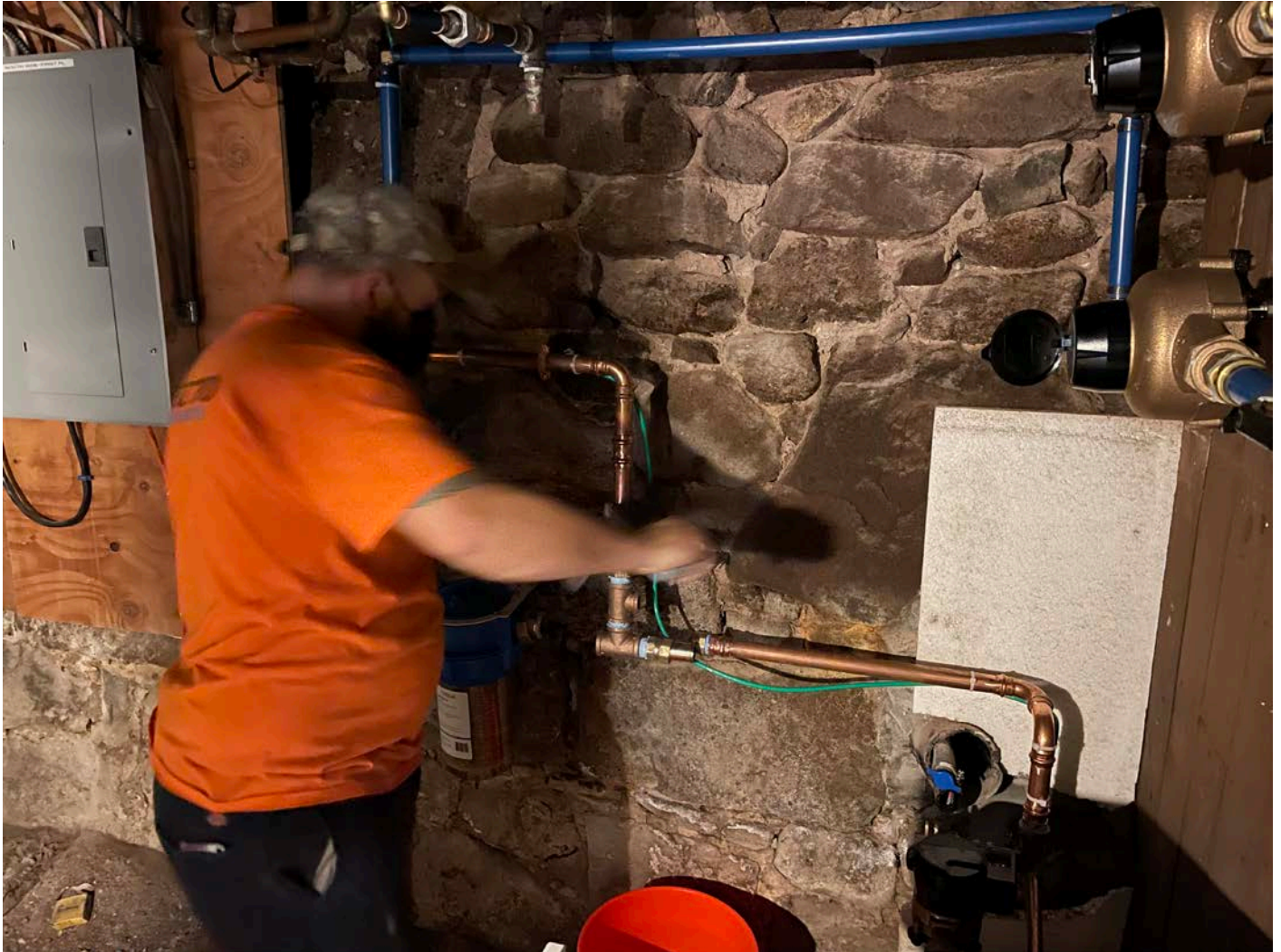
Picture 6: Fazzino Plumbing replacing the brass tees on the final water service components that they previously installed at the 303 Main Street, Durham, residence.