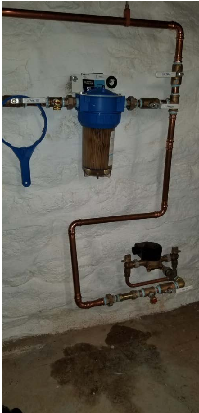
Picture 10: Fazzino Plumbing replacing the brass tees on the final water service components that they previously installed at the 13 Maple Avenue, Durham, property.