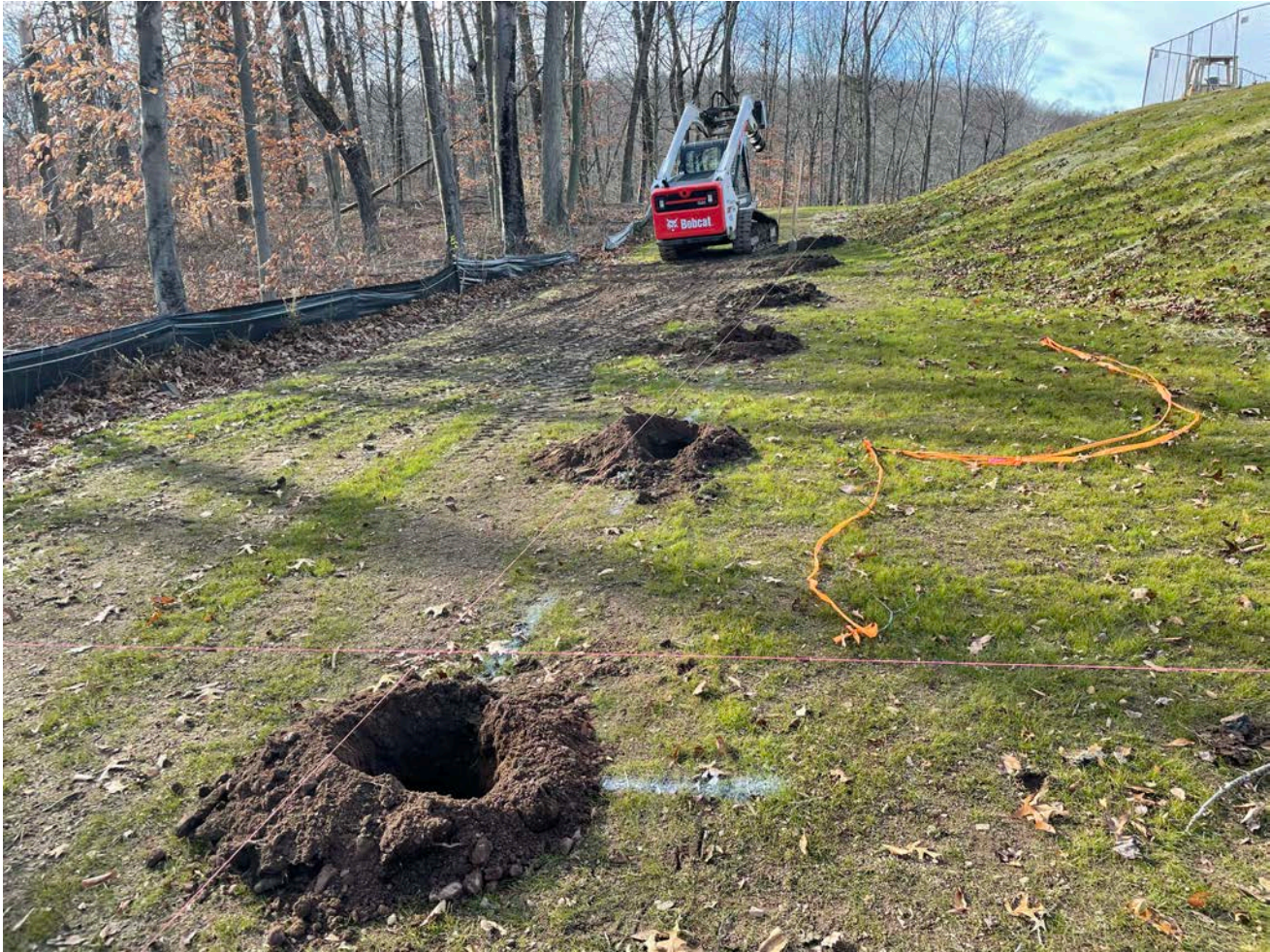
Picture 3: Eagle Fence and Guardrail drilling holes for the installation of fence posts to the south of the water tank located east of the Shared Access Driveway in Middletown. View to the west.