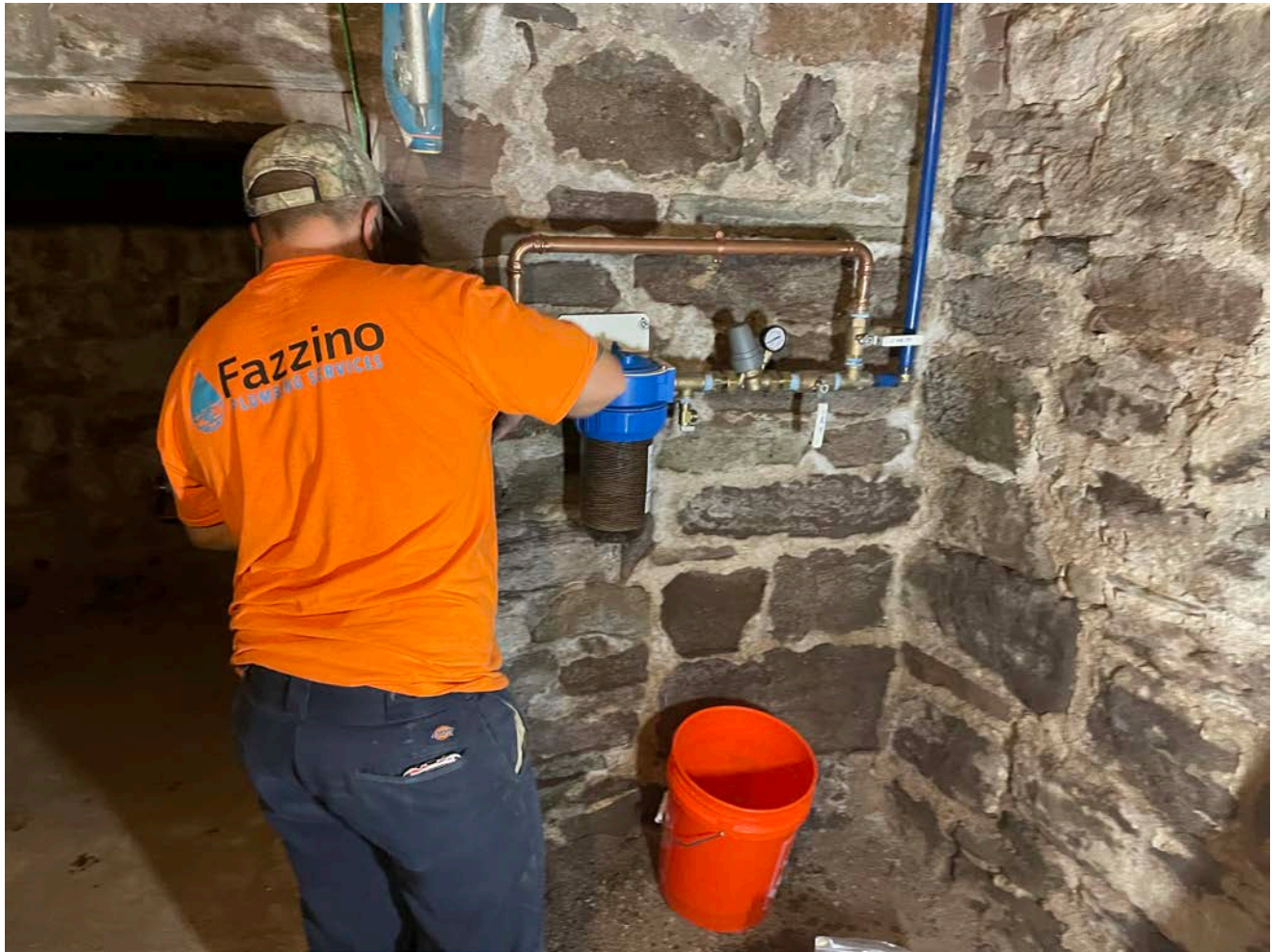
Picture 8: Fazzino Plumbing replacing the brass tees on the final water service components that they previously installed at the 127 Main Street, Durham, property.