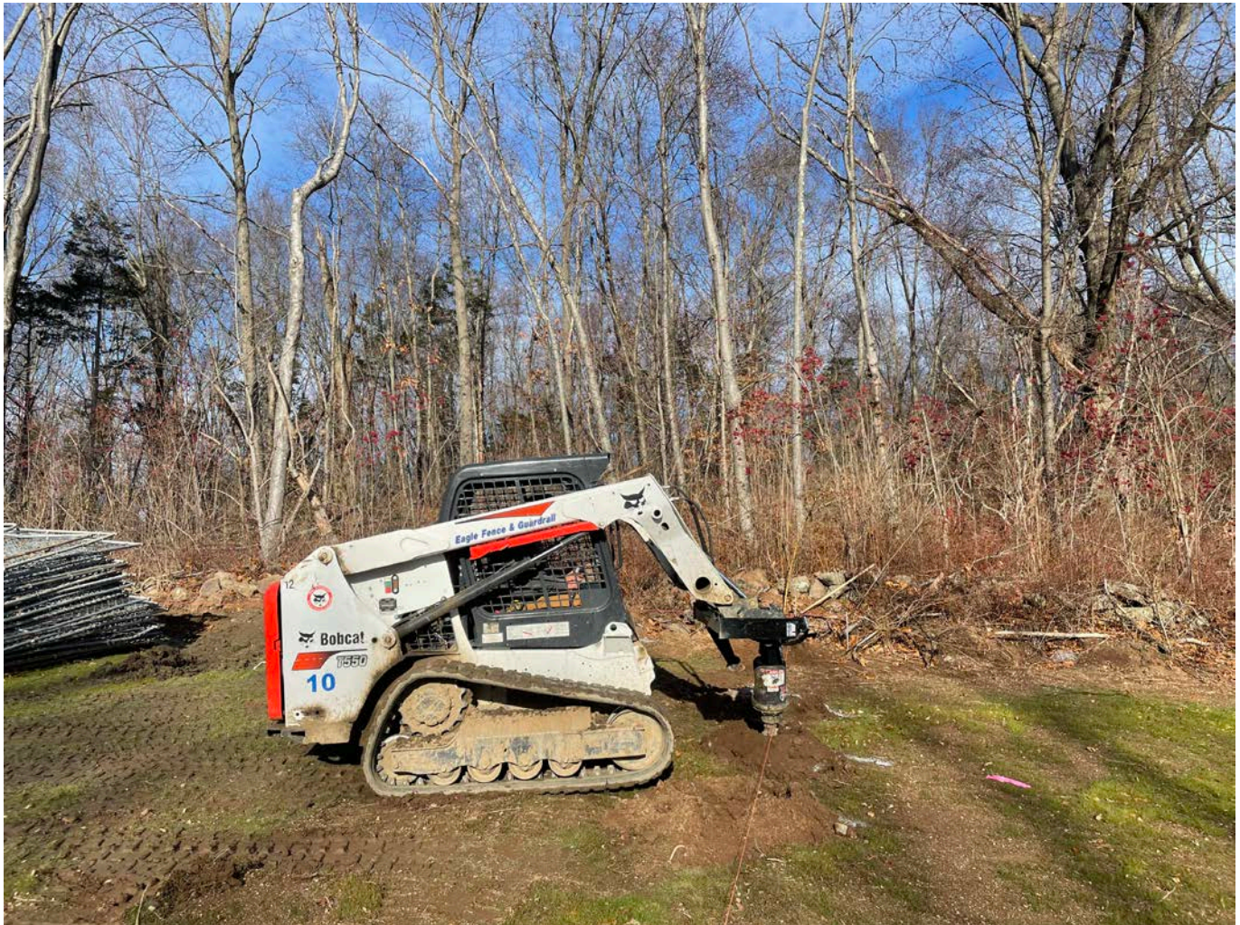
Picture 2: Eagle Fence and Guardrail drilling a hole for the installation of a fence post to the northeast of the water tank located east of the Shared Access Driveway in Middletown. View to the north.