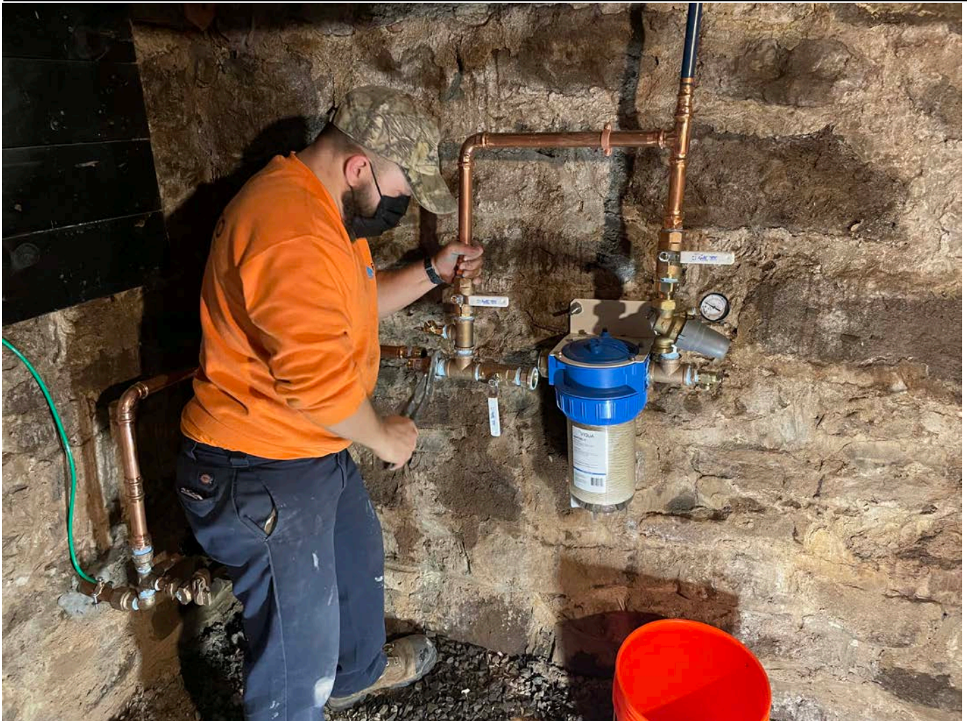
Picture 5: Fazzino Plumbing replacing the brass tees on the final water service components that they previously installed at the 24 Maiden Lane, Street, Durham, residence.