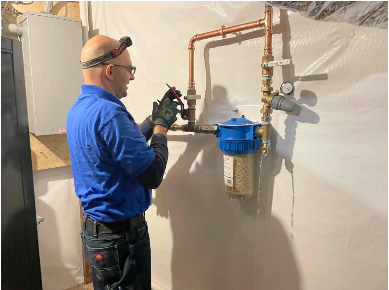
Picture 9: Fazzino Plumbing replacing the brass tees on the final water service components that they previously installed at the 35 Maiden Lane, Durham, property.