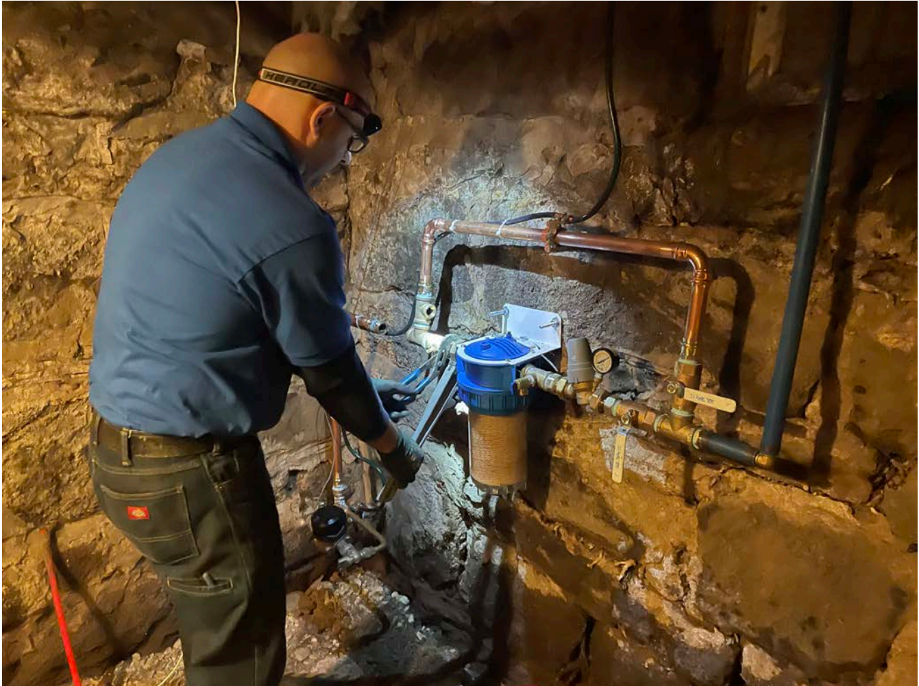
Picture 12: Fazzino Plumbing replacing the brass tees on the final water service components that they previously installed at the 199 Main Street, Durham, property.