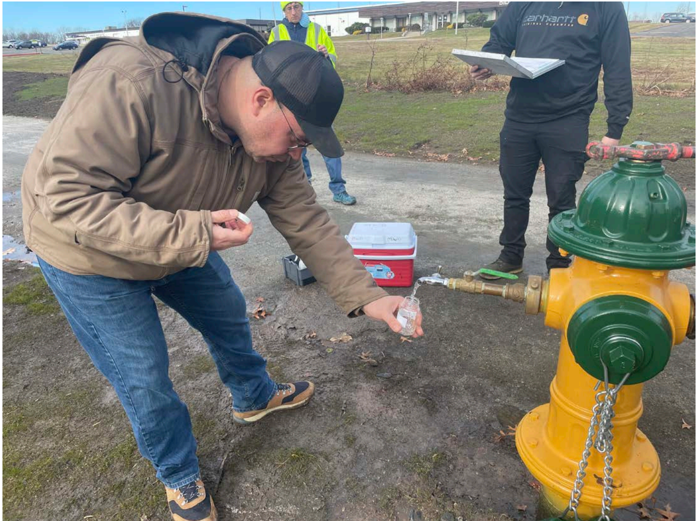
Picture 7: City of Middletown collecting a sample for laboratory analysis from the water that is being purged from the 8" DIP waterlines located on the east side of the booster station. View to the northwest.