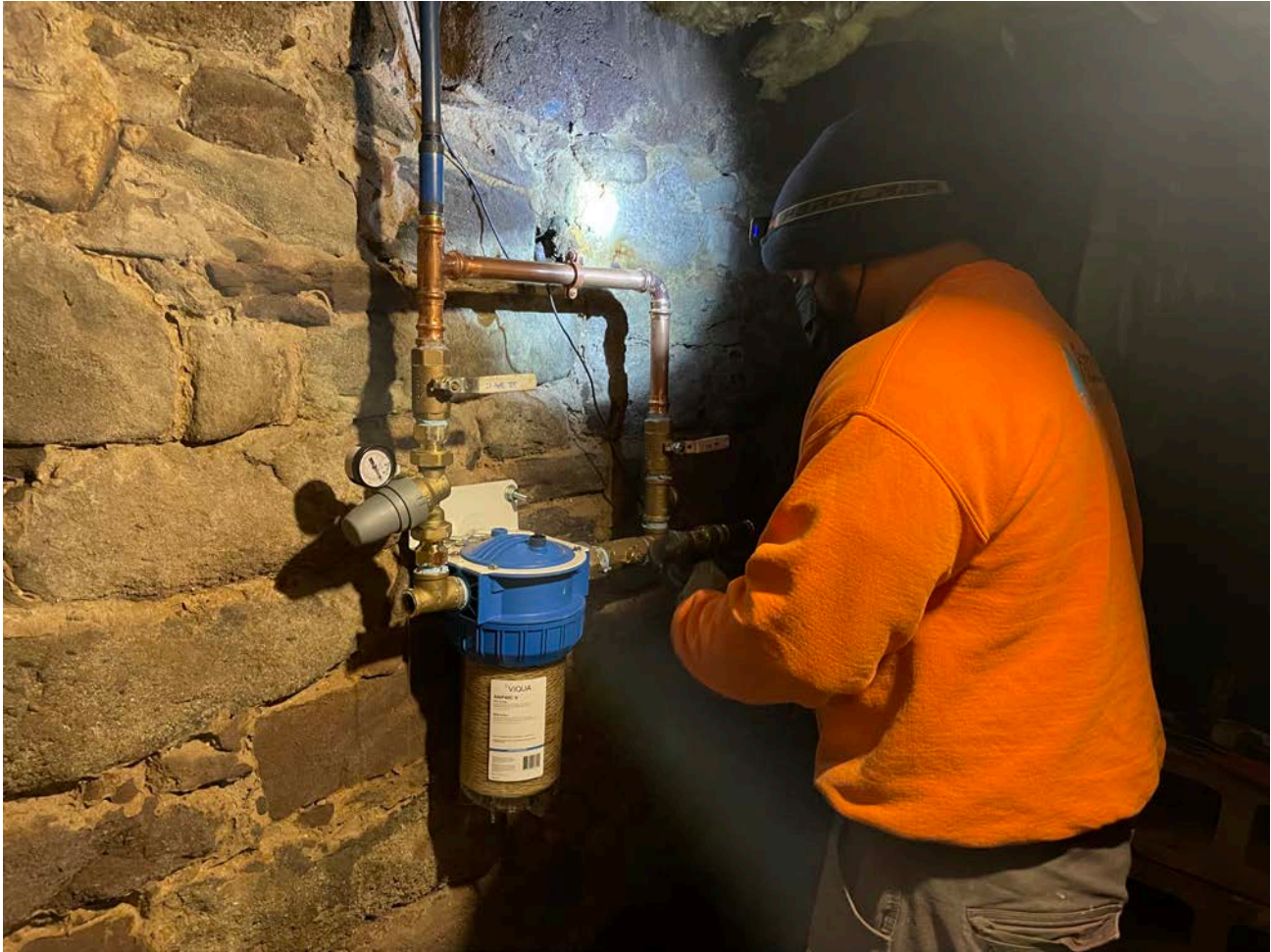
Picture 1: Fazzino Plumbing replacing the brass tees on the final water service components that they previously installed at the 307 Main Street, Durham, property.