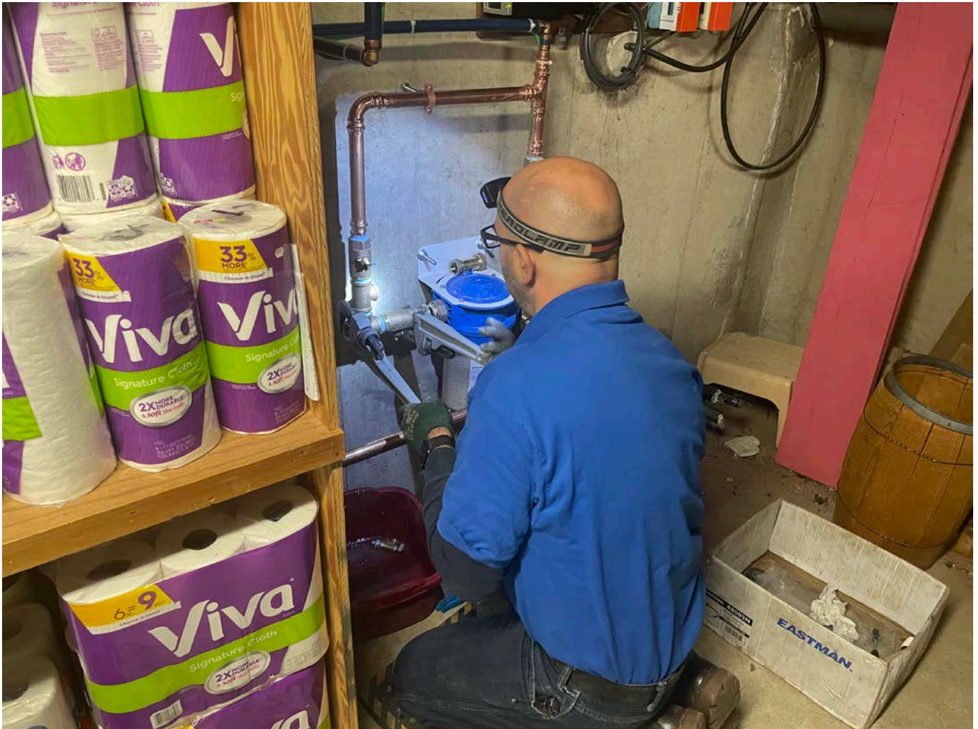
Picture 6: Fazzino Plumbing replacing the brass tees on the final water service components that they previously installed at the 321 Main Street, Durham, property.