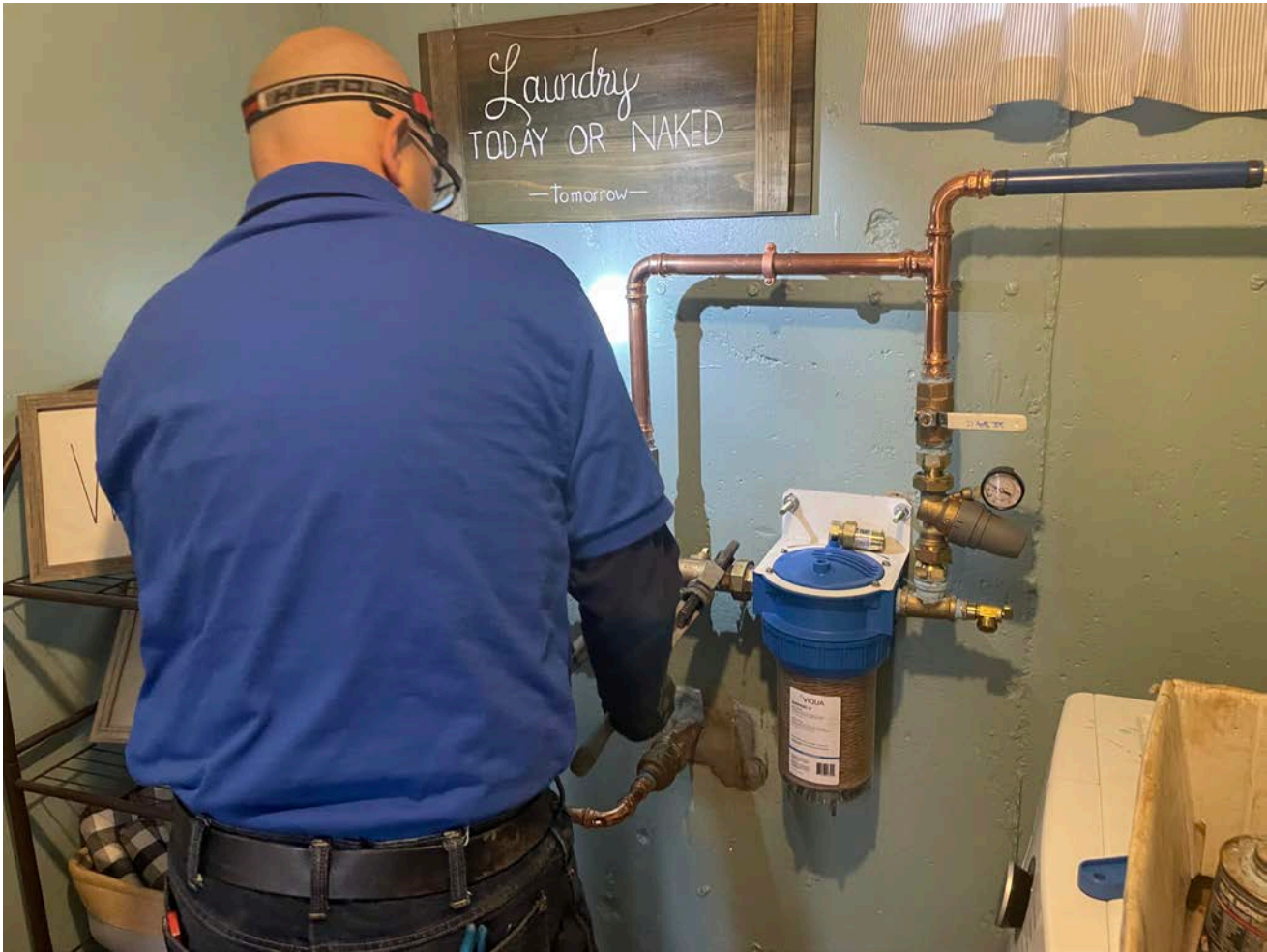
Picture 3: Fazzino Plumbing replacing the brass tees on the final water service components that they previously installed at the 129 Maple Avenue, Durham, property.