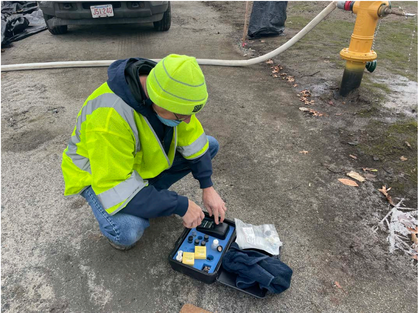
Picture 4: City of Middletown performing a field test for chlorine in the water that is being purged from the 8” DIP waterlines located on the east side of the booster station. View to the east.