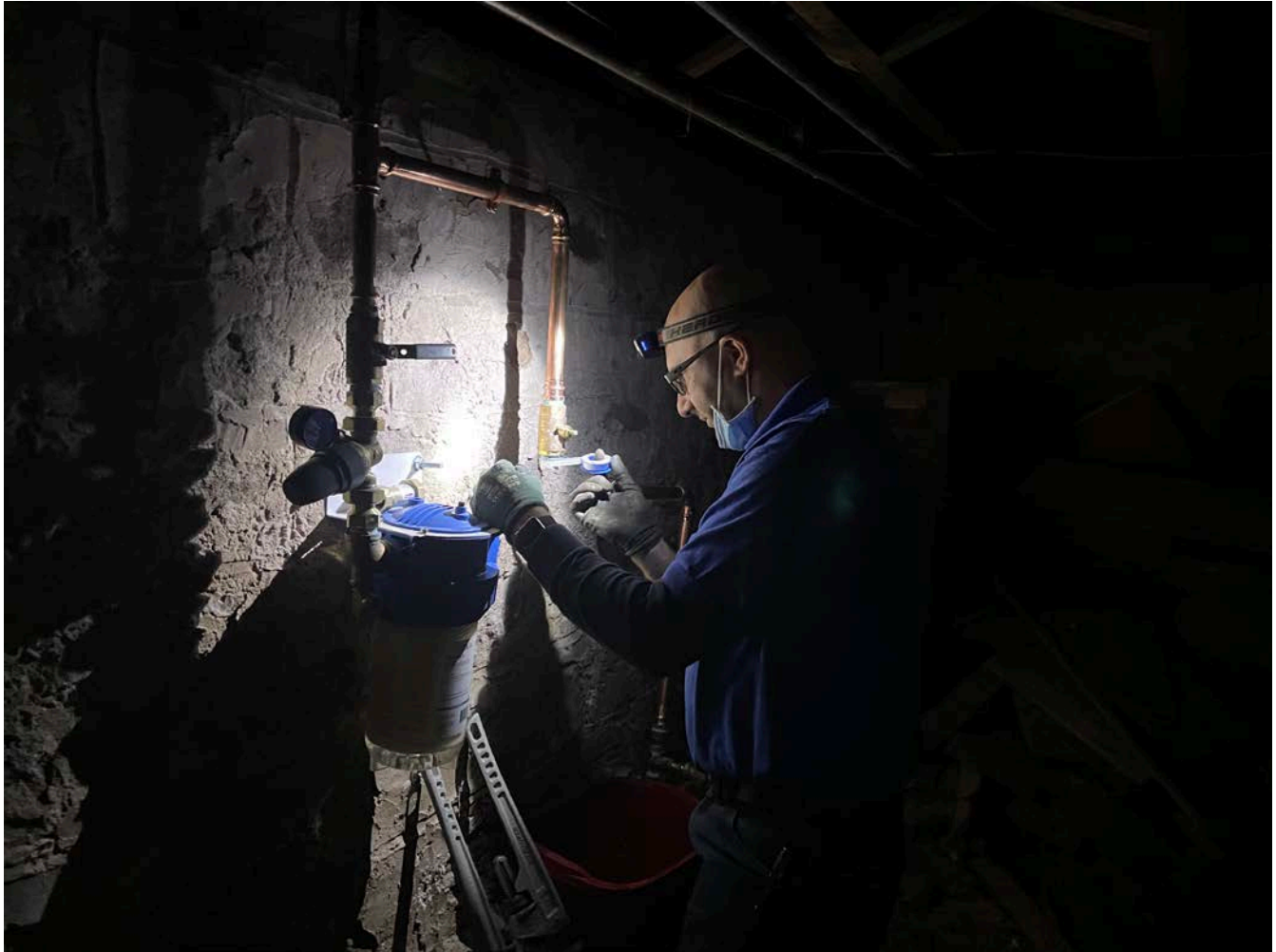
Picture 13: Fazzino Plumbing replacing the brass tee on the final water service components that they previously installed at the 289 Main Street, Durham, property.