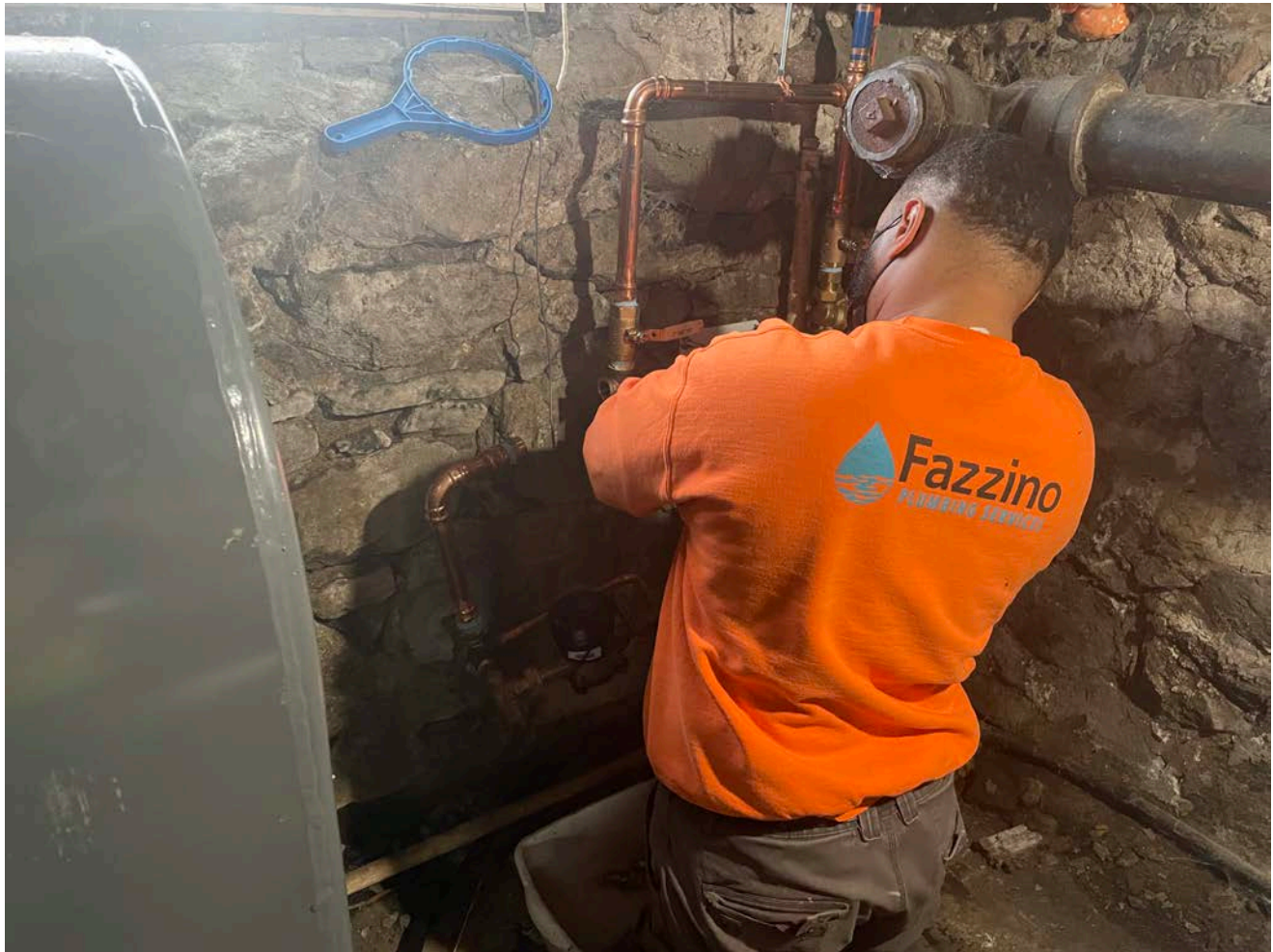
Picture 8: Fazzino Plumbing replacing the brass tees on the final water service components that they previously installed at the 271 Main Street, Durham, property.