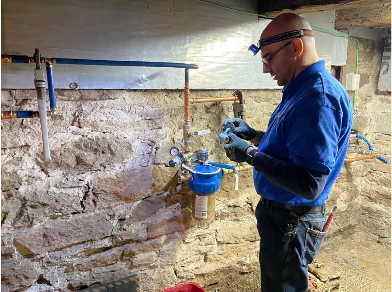
Picture 11: Fazzino Plumbing replacing the brass tees on the final water service components that they previously installed at the 227 Main Street, Durham, property.