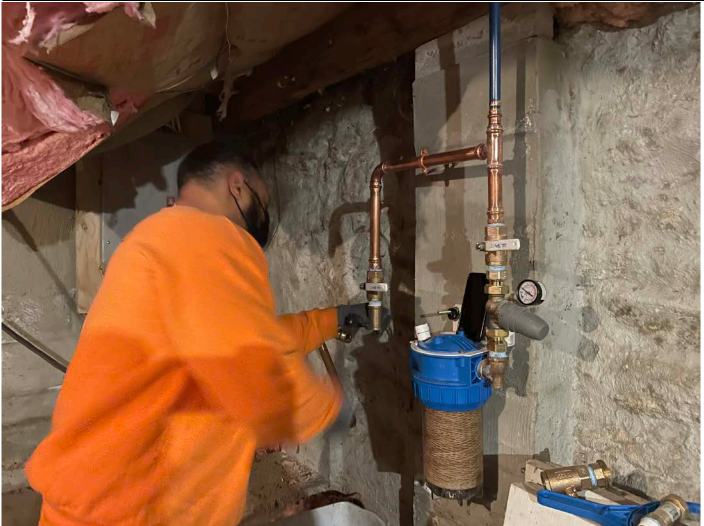
Picture 5: Fazzino Plumbing replacing the brass tees on the final water service components that they previously installed at the 233 Main Street, Durham, property.