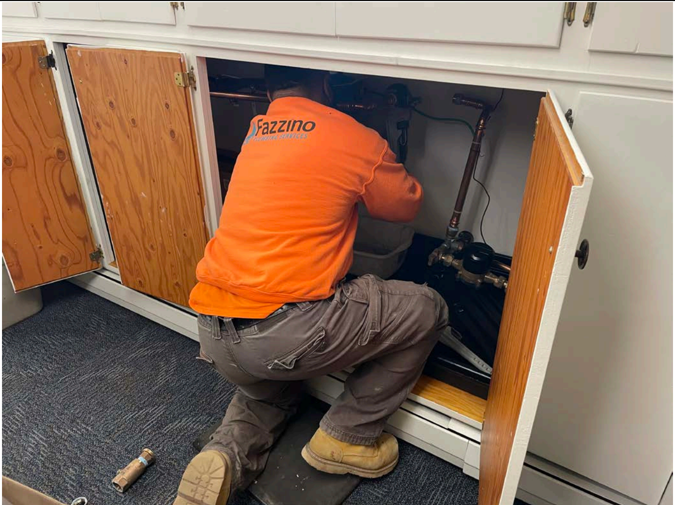
Picture 10: Fazzino Plumbing replacing the brass tees on the final water service components that they previously installed at the 201 Main Street, Durham, property.