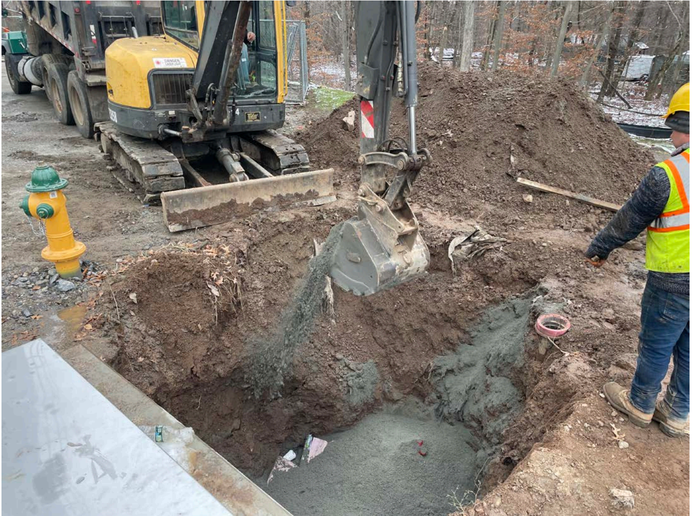
Picture 7: Ludlow placing sand over the new 6" gate valve and 6" DIP that they just installed on the south side of the altitude valve vault. View to the southeast.