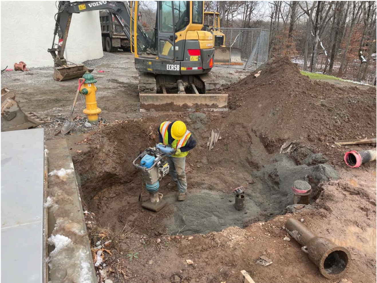
Picture 8: Ludlow compacting the sand they just placed over the new 6" gate valve and 6" DIP they just installed on the south side of the altitude valve vault. View to the southeast.