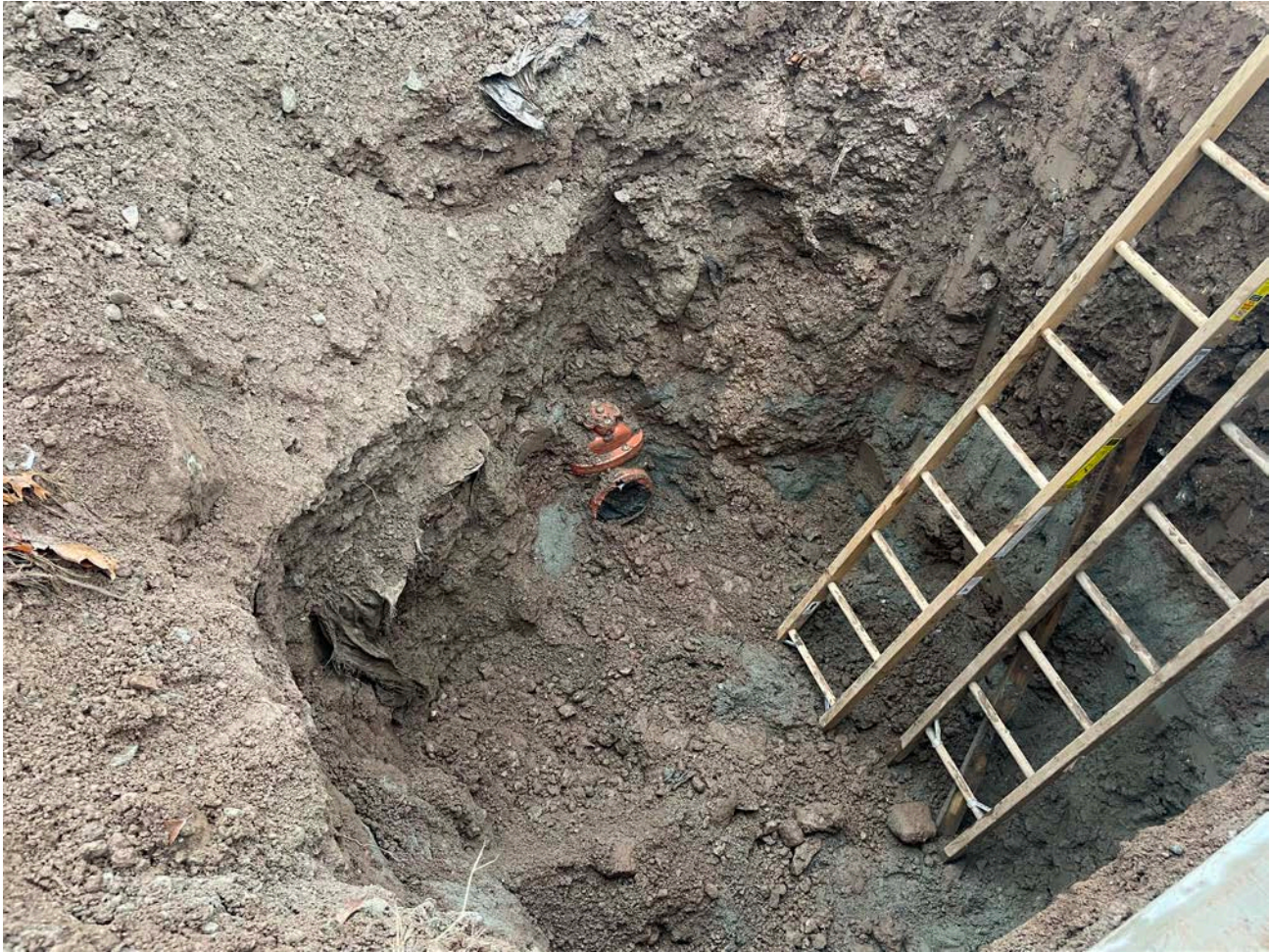
Picture 1: 6" gate valve on the south side of the altitude vault that Ludlow daylighted and, in the process, broke one of the bolts on the valve, necessitating its replacement. View to the southwest.