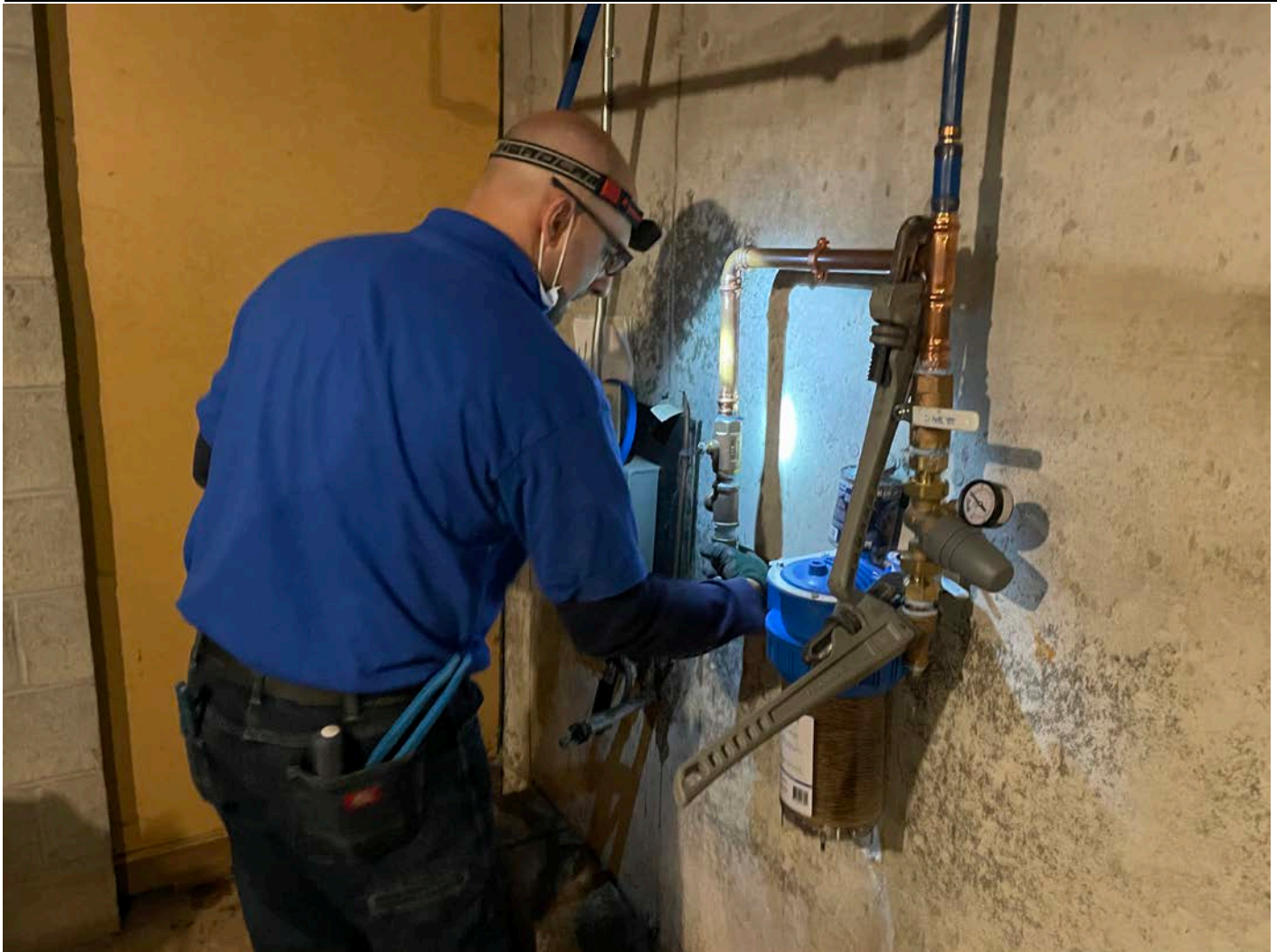
Picture 5: Fazzino Plumbing replacing the brass tees on the final water service components that they previously installed at the 97 Maple Avenue property.