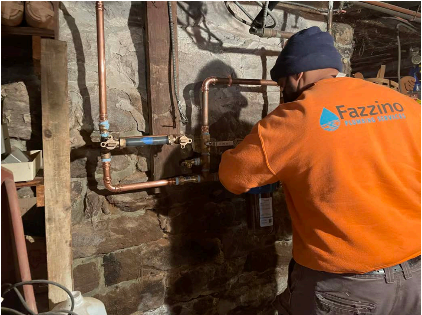
Picture 9: Fazzino Plumbing replacing the brass tees on the final water service components that they previously installed at the 110 Maple Avenue property.

Project: Durham Meadows Pipeline Installation Date: December 10, 2021 Location: Main Street, Maiden Lane, and Picket Lane, Durham; Shared Access Driveway, Middletown Day of Week: Friday Project #: AECOM: 6061487 Report No: 380 Contractor: Ludlow Construction Page: 12 of 12