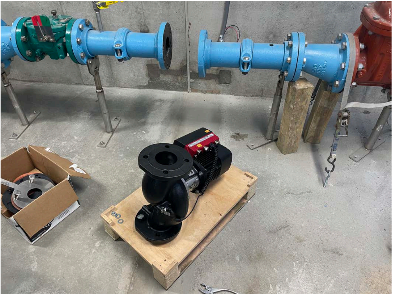
Picture 2: Recirculation pump that Ludlow is about to install on the east side of the altitude valve vault. View to the east.