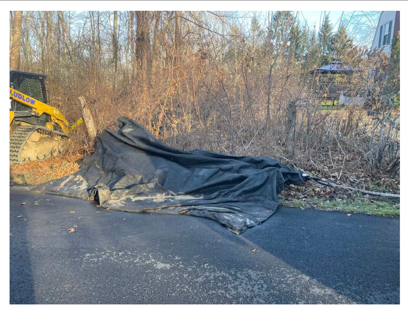
Picture 3: Silt bag that Ludlow placed on the north side of Maiden Lane to discharge water being pumped from the trench they are excavating at the 110 Maiden Lane property for the installation of a 1" copper water service line. View to the north.