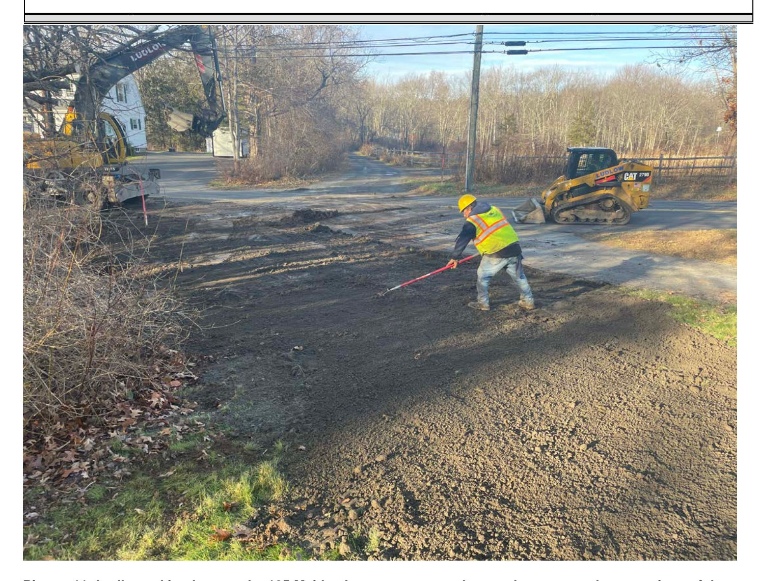
Picture 11: Ludlow raking loam at the 105 Maiden Lane property as they work to restore those portions of the property that were disturbed by the installation of a 1" copper water service line. View to the north.