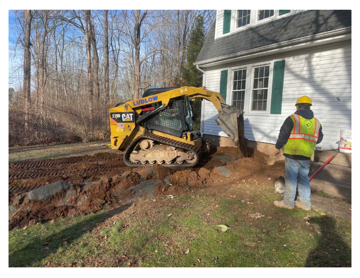
Picture 4: Ludlow placing sand over the 1" copper water service line they installed at the 110 Maiden Lane property. View to the west.