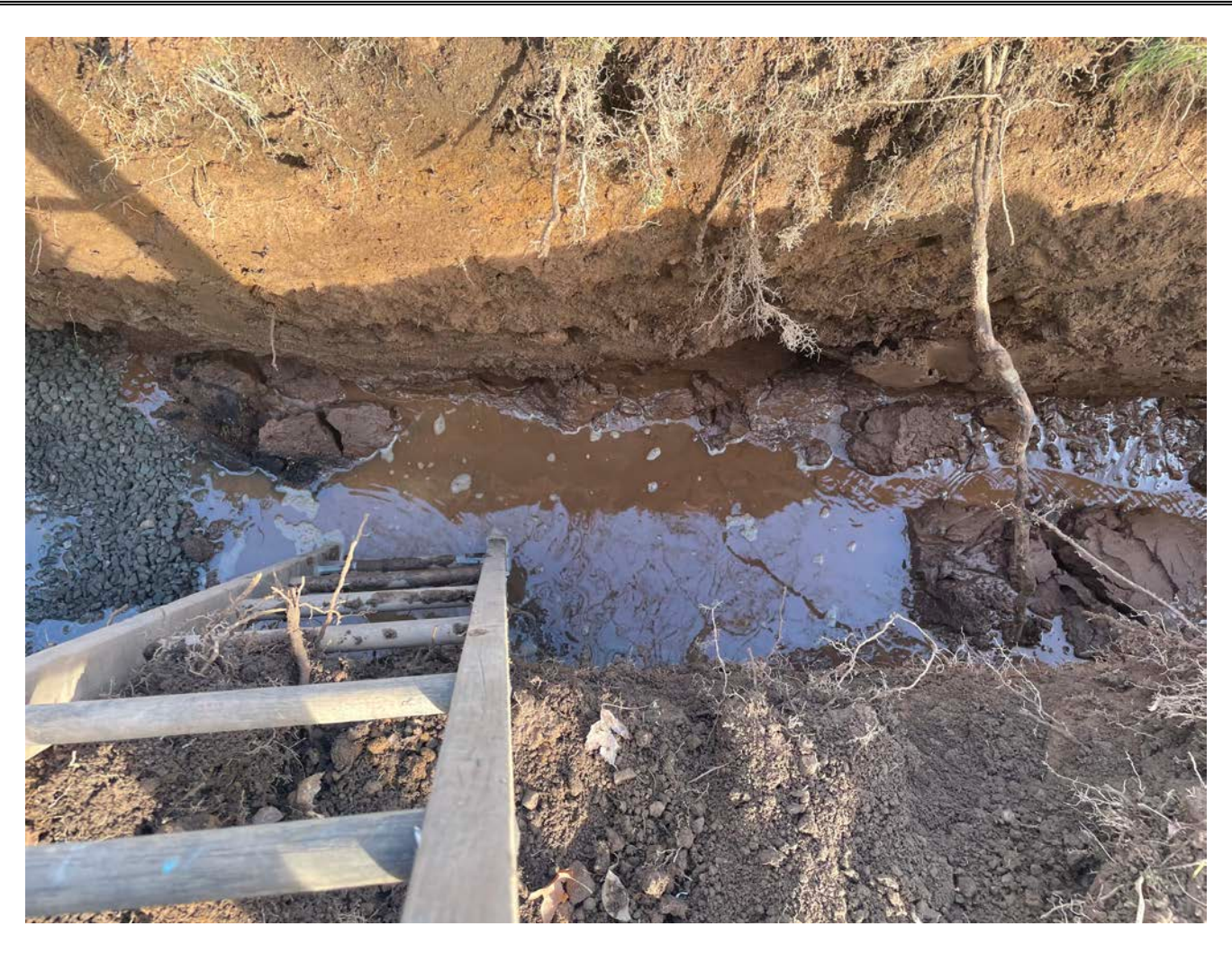
Picture 8: Water that was observed in the bottom of the trench that Ludlow is excavating at the 105 Maiden Lane property for the installation of a 1" copper water service line.