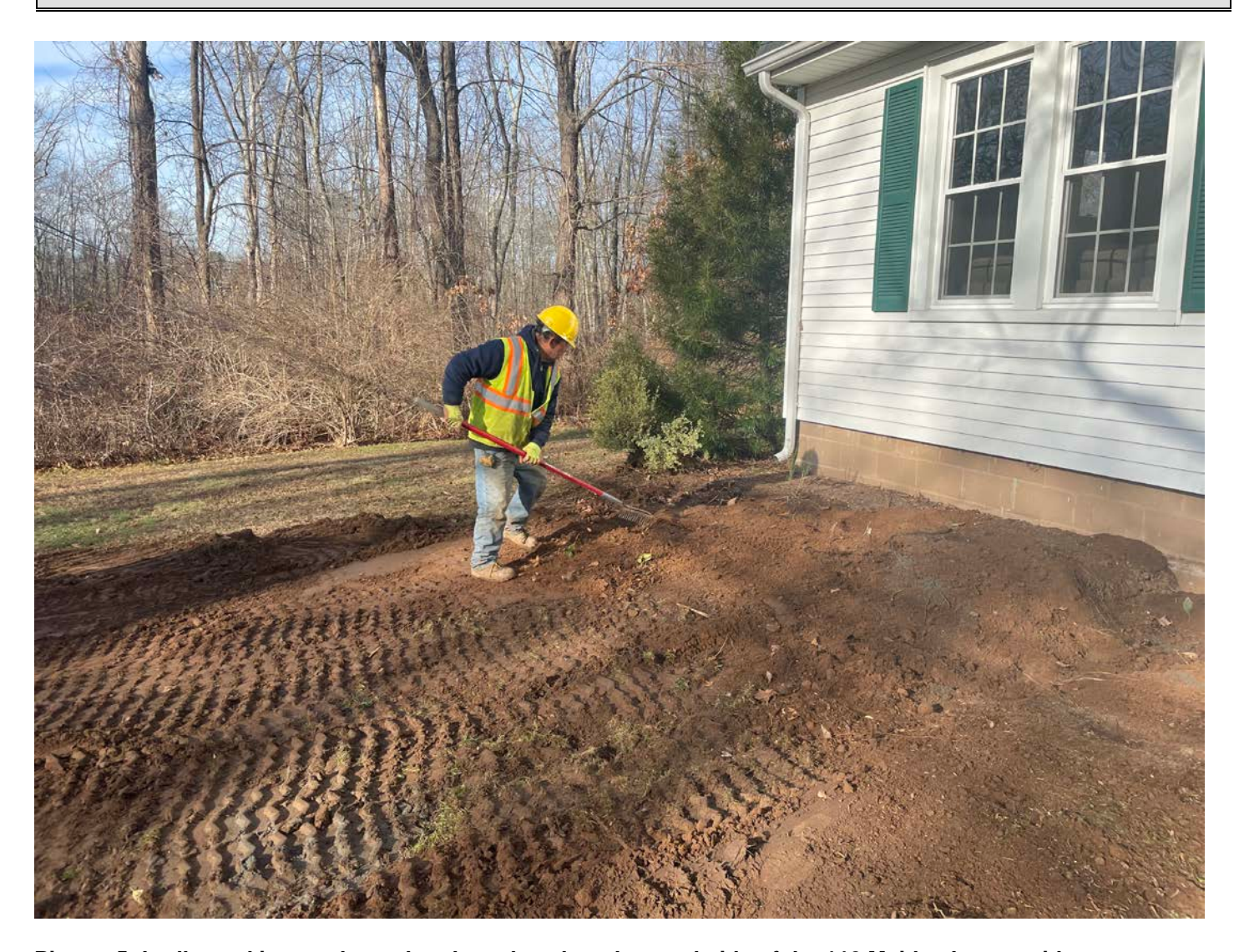
Picture 5: Ludlow raking out loam that they placed on the southside of the 110 Maiden Lane residence to restore those areas that were disturbed by the installation of a 1" copper water service line. View to the west.