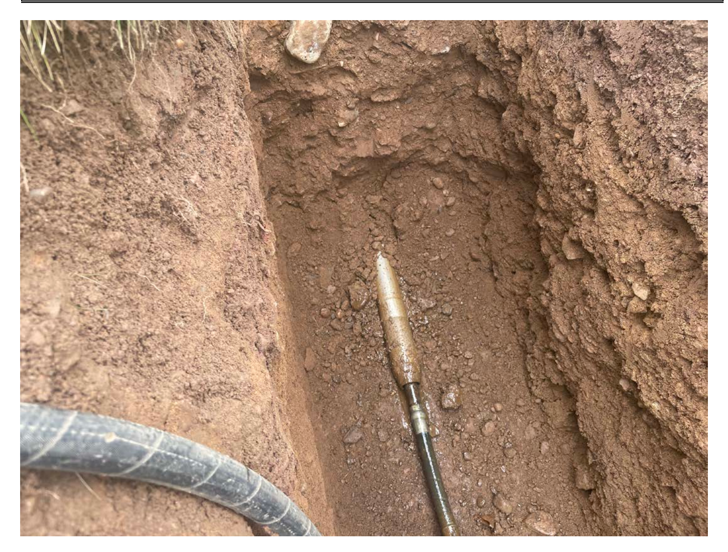
Picture 7: Pneumatic mole that Ludlow is using to make a hole beneath the sidewalk of the 105 Maiden Lane residence for the installation of a 1" copper water service line. View to the north.