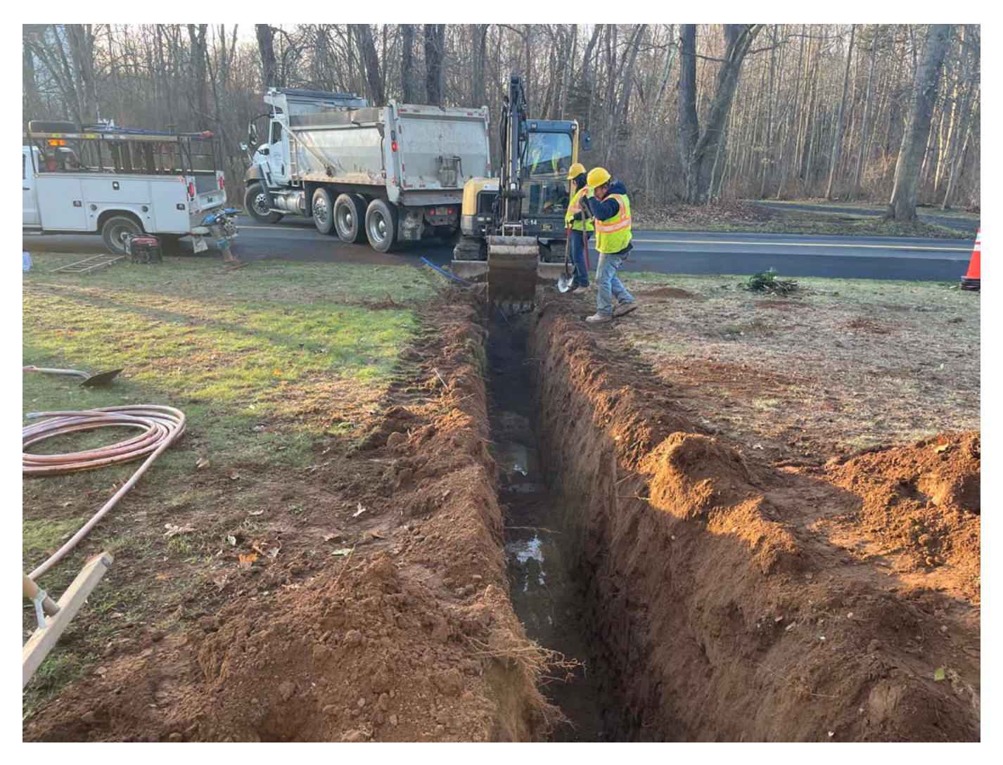
Picture 2: Ludlow excavating a trench for the installation of a 1" copper water service line on the south side of the 110 Maiden Lane residence. View to the south.