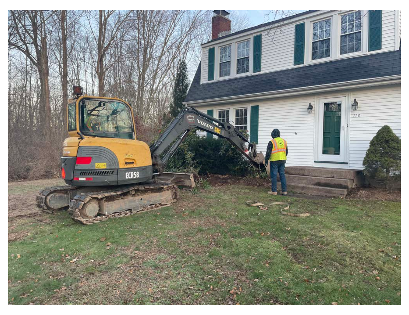
Picture 1: Ludlow prepares to begin excavating a trench for the installation of a 1" copper water service line on the south side of the 110 Maiden Lane residence. View to the northwest.