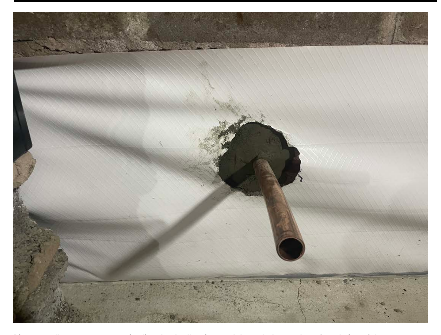
Picture 6: 1" copper water service line that Ludlow inserted through the southern foundation of the 110 Maiden Lane residence and secured in place with non-shrink grout. View to the south.