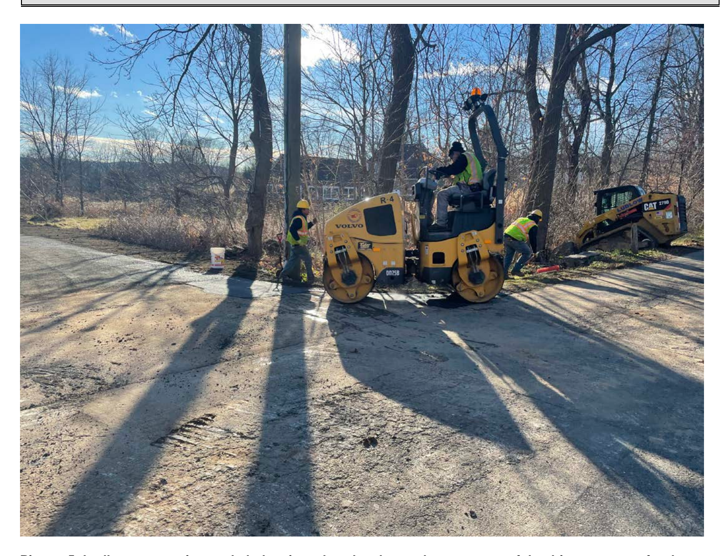
Picture 5: Ludlow compacting asphalt they just placed at the northwest corner of the driveway apron for the 14 Talcott Lane property. View to the southwest.