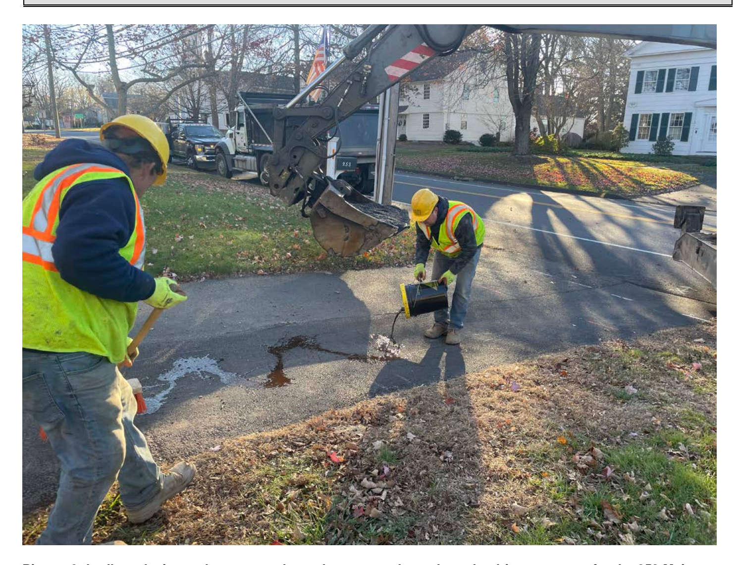
Picture 9: Ludlow placing tack coat over the curb stop trench patch on the driveway apron for the 253 Main Street, Durham, to address some settling that occurred there. View to the wouthwest.