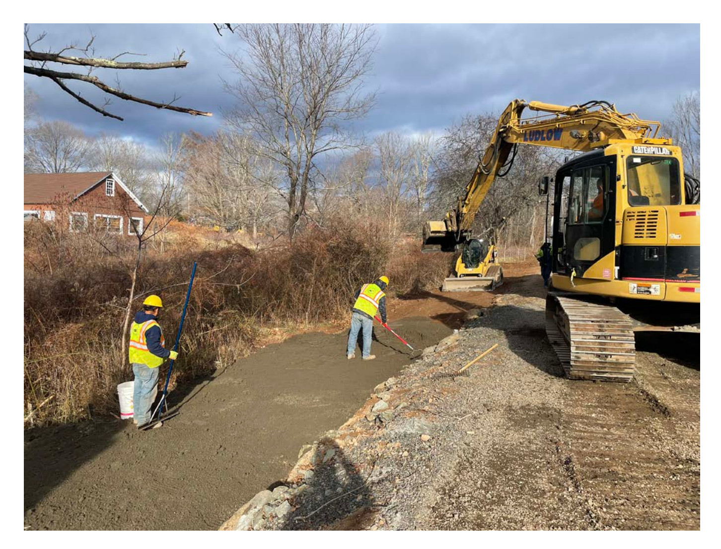
Picture 2: Ludlow placing, grading, and raking out loam on the west side of the driveway of the 14 Talcott Lane property as they finish the installation of a 2" copper water service line. View to the north.