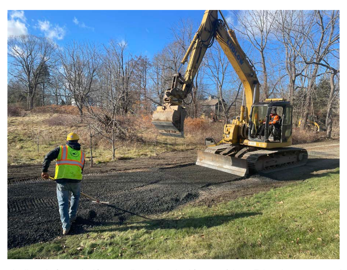
Picture 4: Ludlow placing and raking out ¾" gravel on the driveway of the 14 Talcott Lane property where they are working to restore those portions of the property that were disturbed during the installation of a 2" copper water service line. View to the northwest.