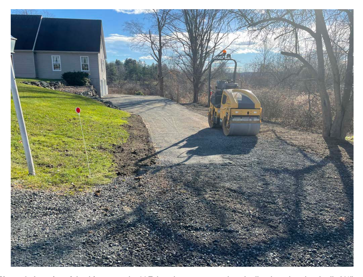
Picture 3: A portion of the driveway at the 14 Talcott Lane property where Ludlow has placed and rolled 3/4" gravel as they work to restore those portions of the property that were disturbed during the installation of a 2" copper water service line. View to the south.