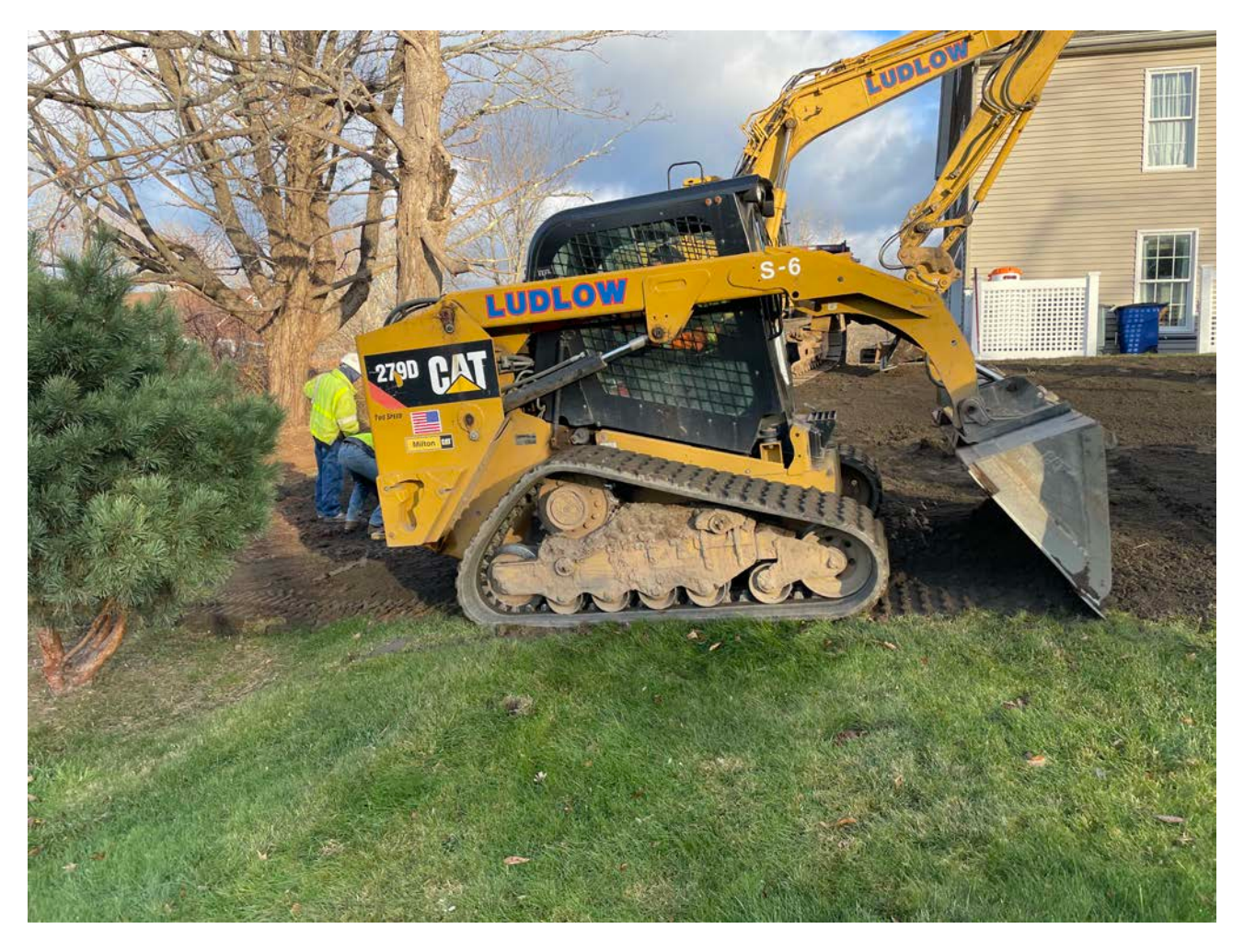
Picture 1: Ludlow grading loam to the southwest of the 14 Talcott Lane property as they finish up the installation of a 2" copper water service line. View to the north.