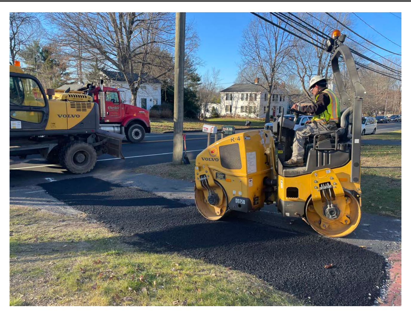
Picture 8: Ludlow compacting asphalt they placed over the curb stop trench patch on the driveway apron for the 257 Main Street, Durham, to address some settling that occurred there. View to the northwest.