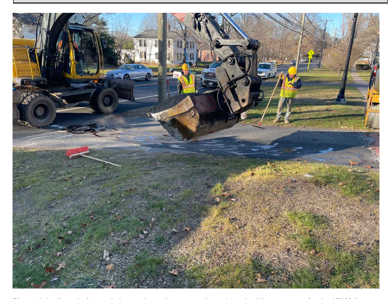
Picture 6: Ludlow placing asphalt over the curb stop trench patch on the driveway apron for the 257 Main Street, Durham, to address some settling that occurred there. View to the northwest.