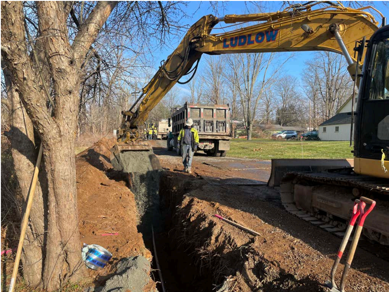
Picture 3: Ludlow placing sand over 2” copper water service line that they placed in the trench they excavated on the west side of the 14 Talcott Lane property. View to the north.