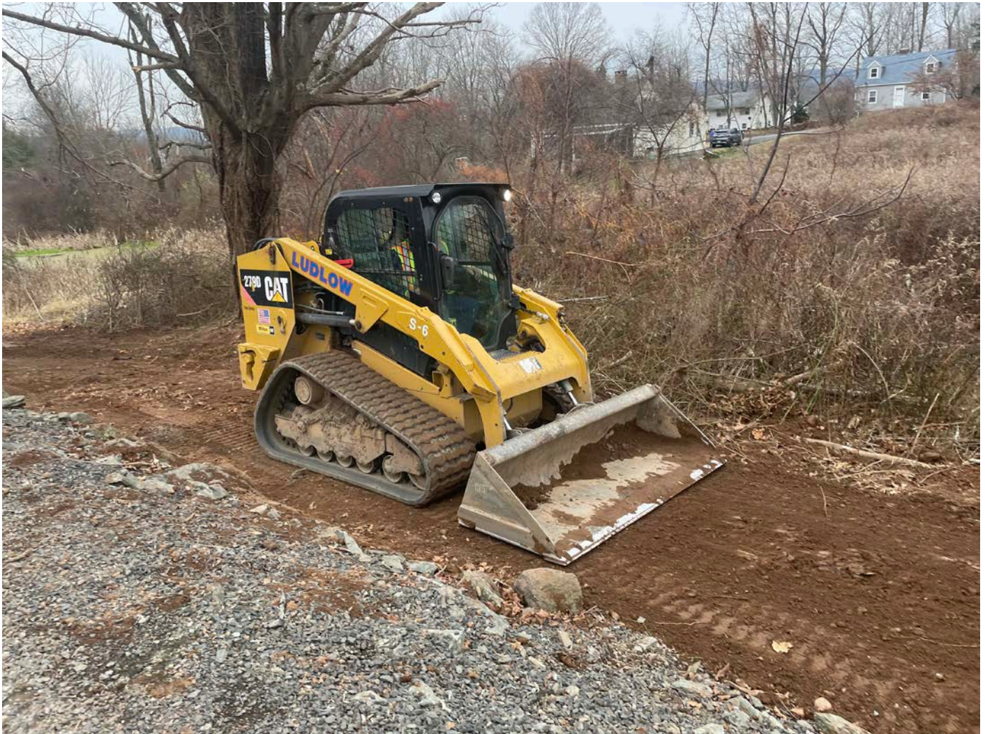
Picture 10: Ludlow grading fill that they placed over the backfilled trench on the west side of the driveway for the 14 Talcott Lane property. View to the southwest.