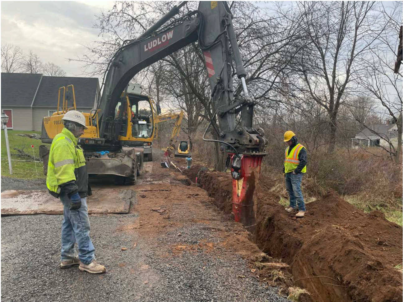
Picture 1: Ludlow hammering rock that they encountered while excavating a trench on the west side of the driveway of the 14 Talcott Lane property during the installation of a 2" copper water service line. View to the south.