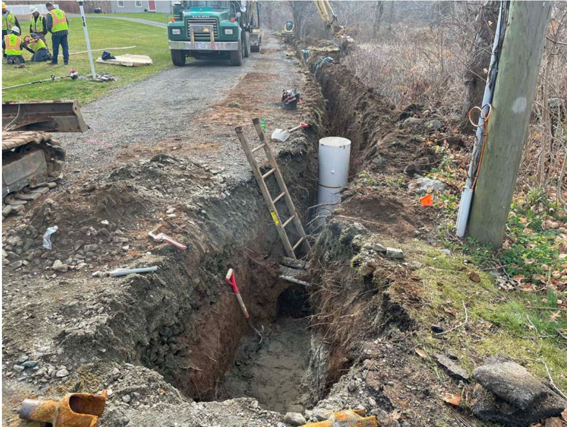
Picture 4: View of the meter pit that Ludlow excavated and several utility conduits they daylighted in the trench located on the west side of driveway at 14 Talcott Lane. View to the south.