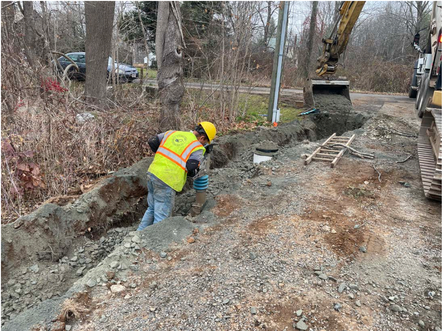
Picture 7: Ludlow compacting 1' lifts of fill that they backfilled into the trench they excavated on the west side of the driveway of the 14 Talcott Lane property for the installation of a 2" copper water service line. View to the northwest.