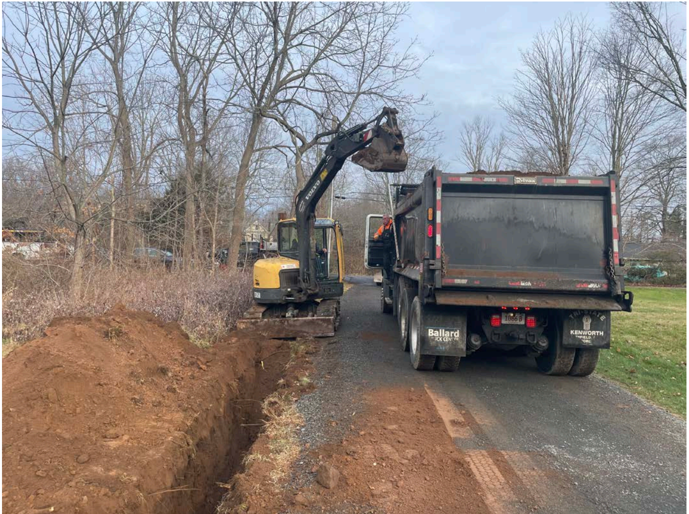
Picture 2: Ludlow excavating a trench on the west side of the driveway of the 14 Talcott Lane property during the installation of a 2" copper water service line. View to the north.