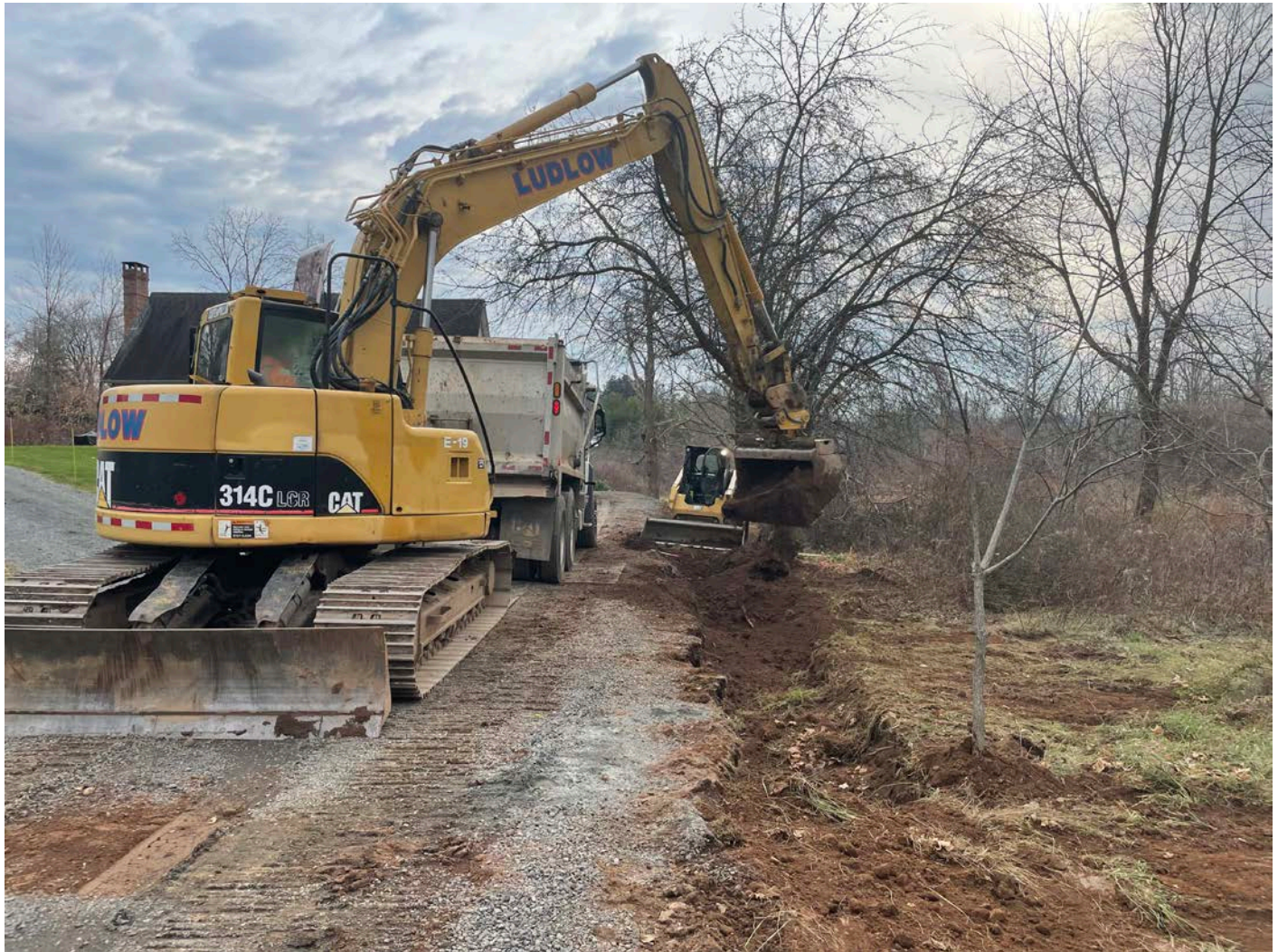
Picture 6: Ludlow backfilling the trench they excavated on the west side of the 14 Talcott Lane property for the installation of a 2" copper water service line. View to the south.