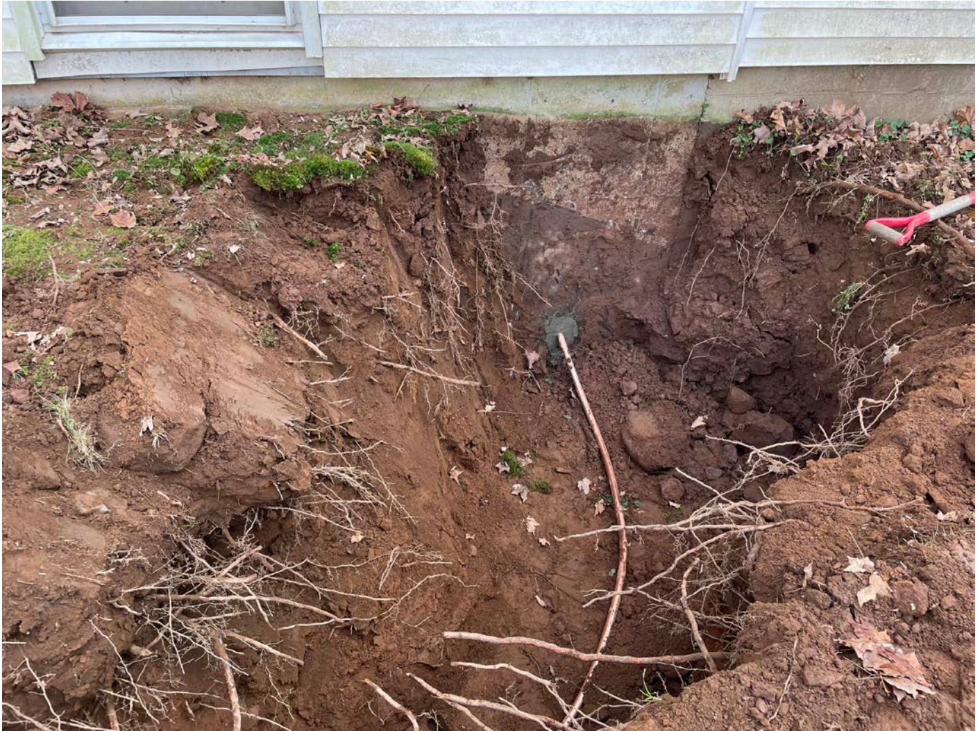
Picture 10: 1" copper water service line that Ludlow inserted through the poured-concrete foundation of the 230 Maple Avenue home and secured in place with non-shrink grout. View to the south.