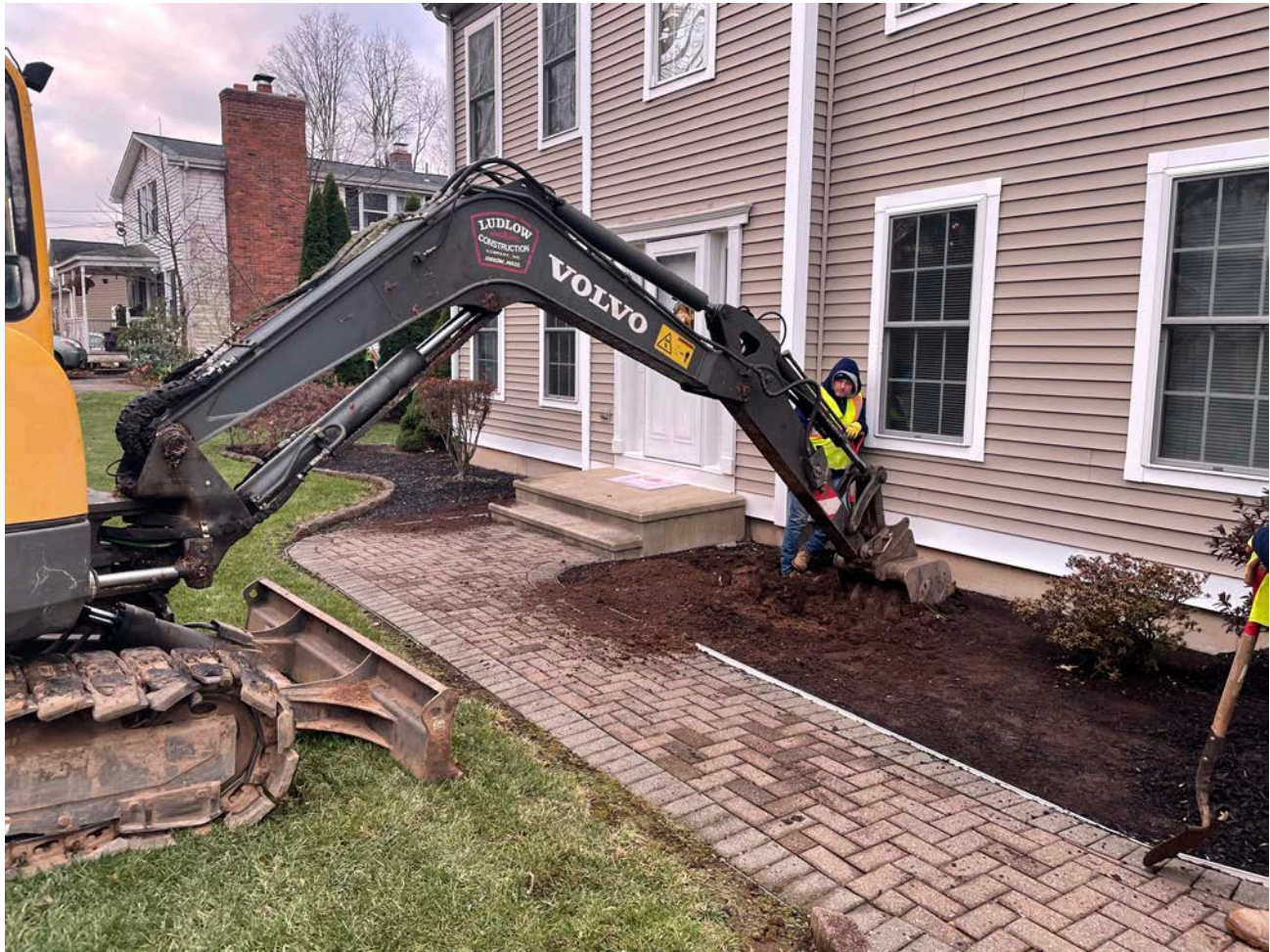
Picture 1: Ludlow excavating on the east side of the 166 Maple Avenue residence for the installation of a 1” copper water service line. View to the southwest.