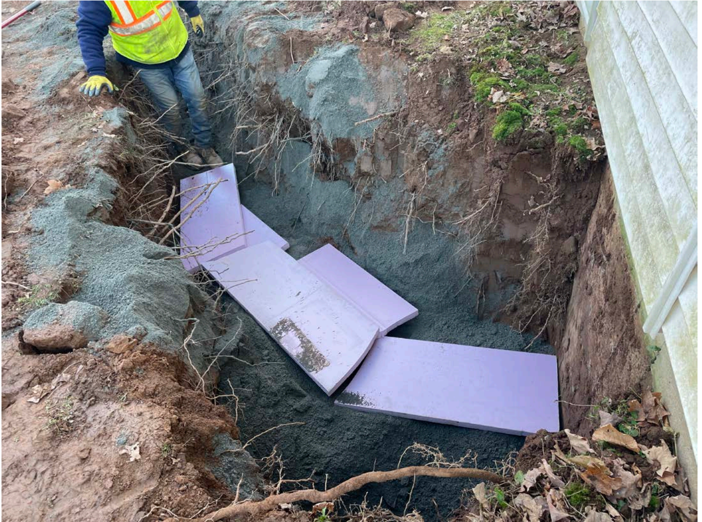
Picture 11: Foam board that Ludlow placed over 1" copper water service line just north of where it penetrates the north foundation of the 230 Maple Avenue residence. View to the east.