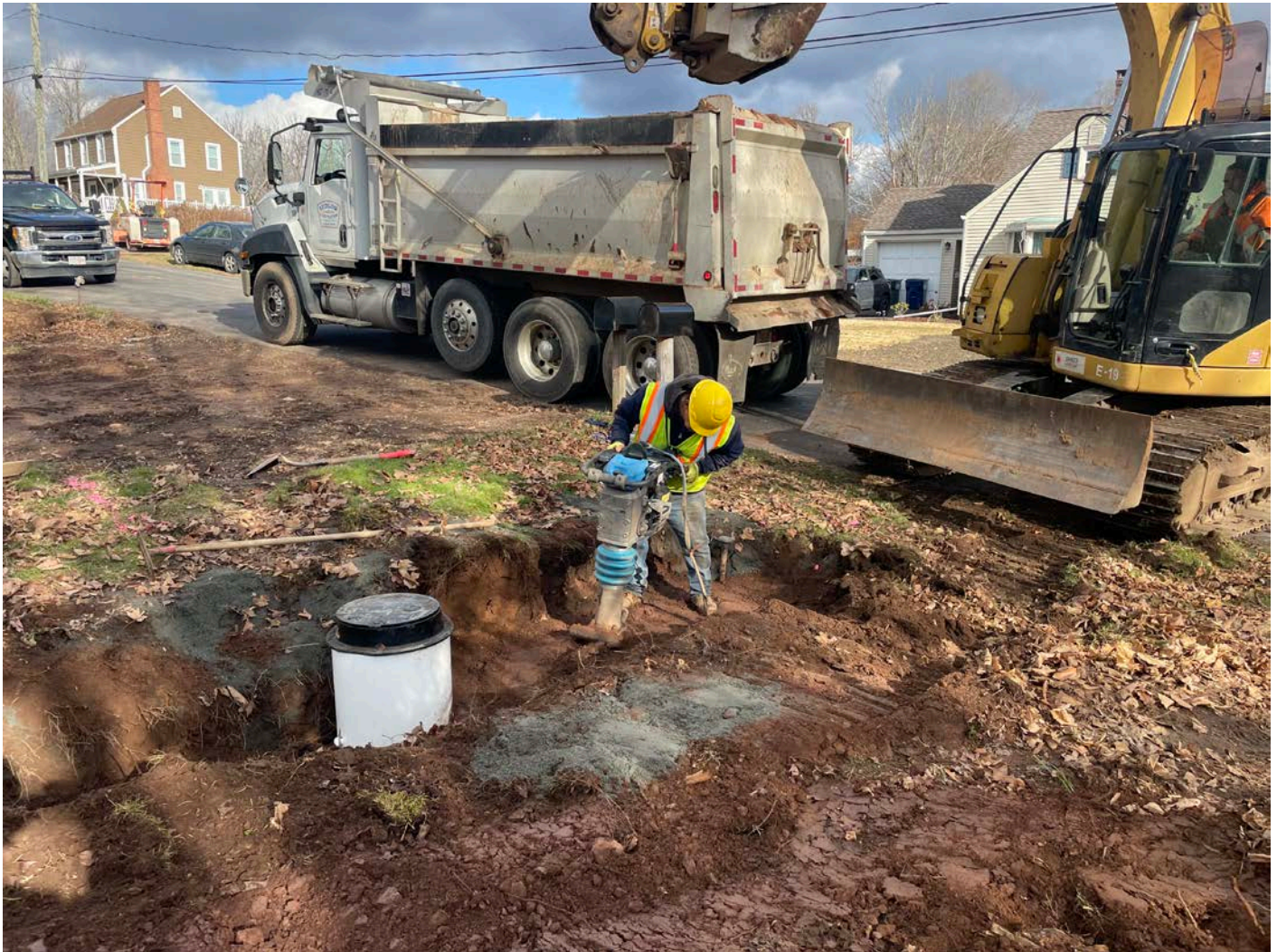
Picture 8: Ludlow compacting native fill that has been backfilled over the 1" copper water service line that they installed at the 230 Maple Avenue property. View to the east.