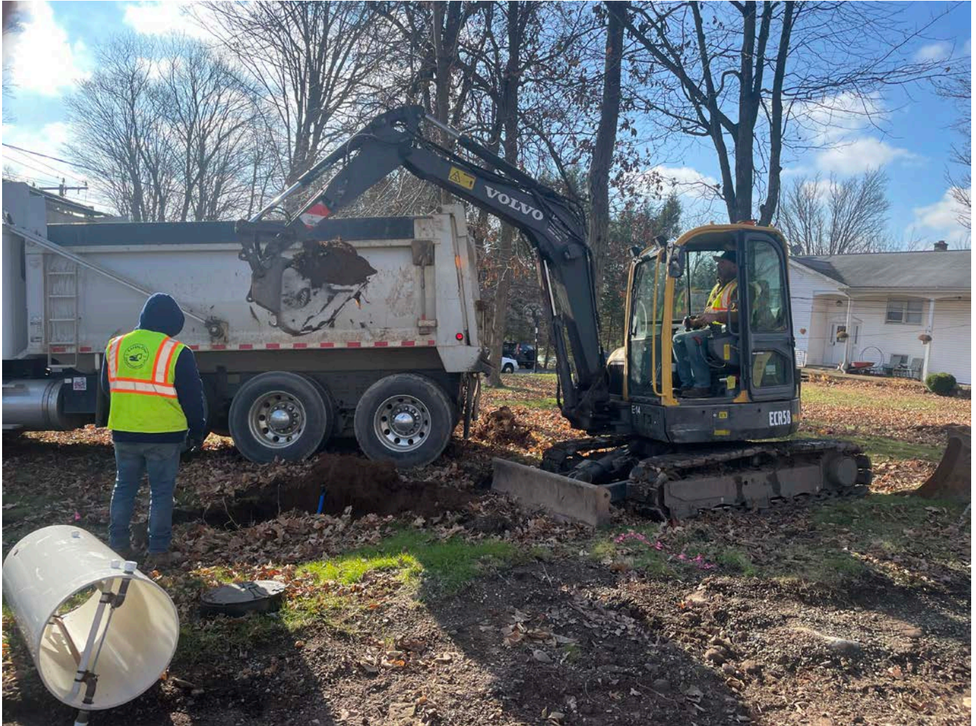
Picture 5: Ludlow excavating a trench at the 230 Maple Avenue property for the installation of a 1" copper water service line. View to the southwest.

Project: Durham Meadows Pipeline Installation Date: November 29, 2021 Location: Talcott Lane, Durham; S. Main Street and the Shared Access Driveway, Middletown Day of Week: Monday Project #: AECOM: 6061487 Report No: 371 Contractor: Ludlow Construction Page: 9 of 15