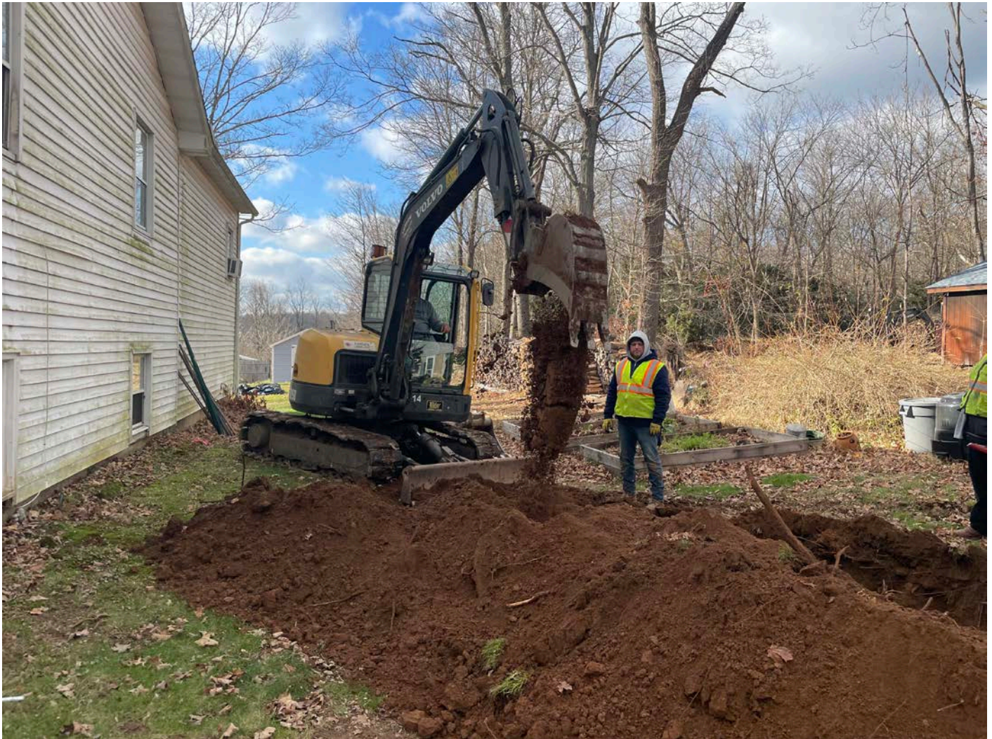
Picture 7: Ludlow excavating a trench for the 1" copper water service at 230 Maple Avenue. View to the west.