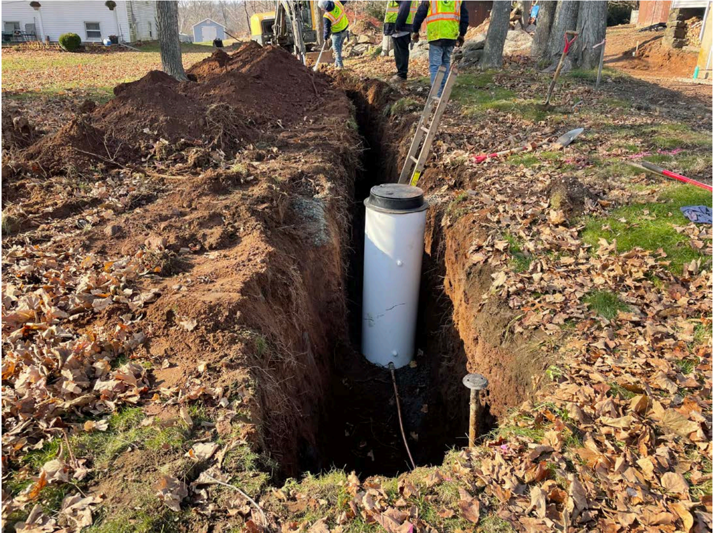
Picture 6: Meter pit that Ludlow installed approximately 8' west of the curbstop for the 230 Maple Avenue property. View to the west.