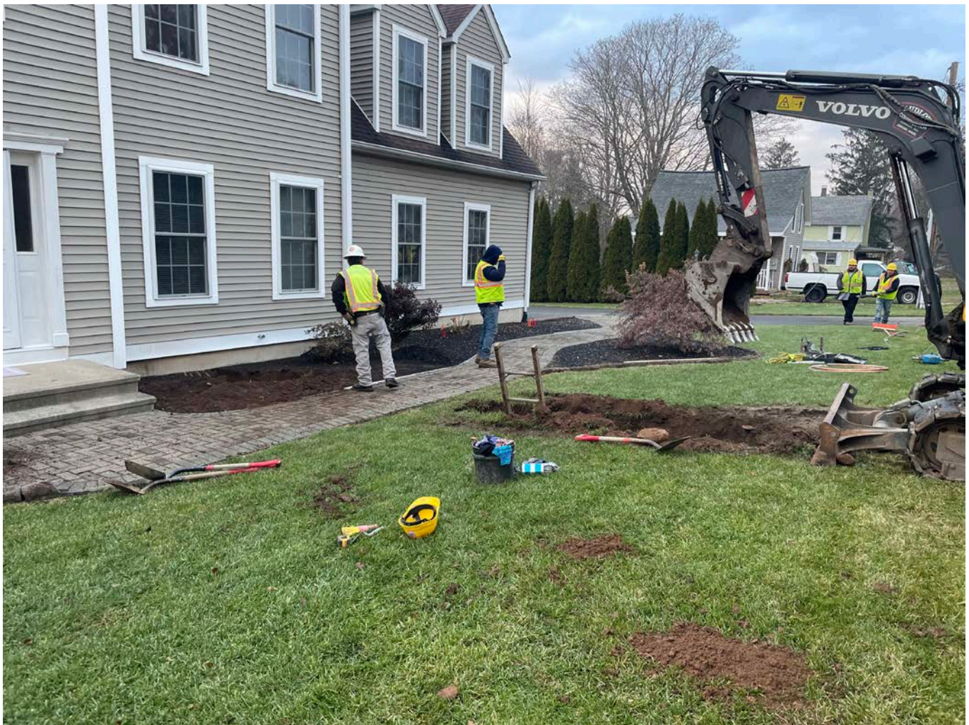
Picture 2: Ludlow excavating at the 166 Maple Avenue property for the installation of a 1" copper water service line. View to the northwest.