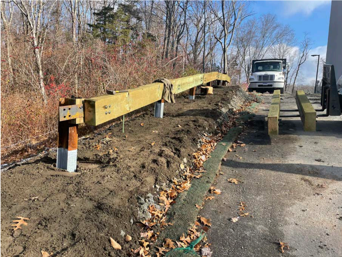
Picture 4: Eagle Fence and Guardrail installing a guard rail on the north side of the Shared Access Driveway in Middletown at Station ~11+00. View to the east.