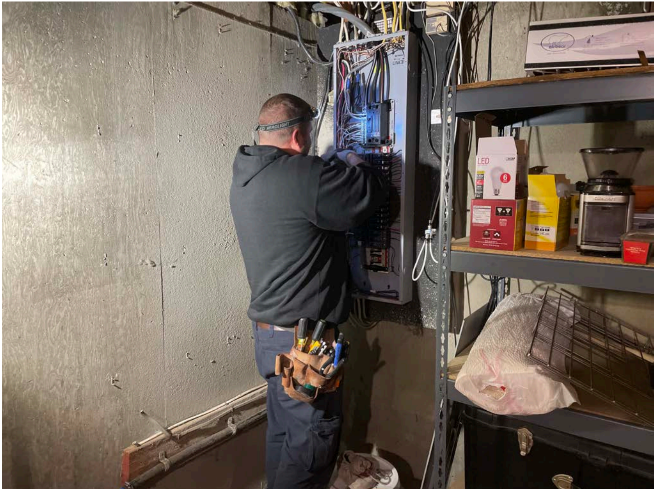
Picture 3: Apuzzo Electric working at the 95R Maple Avenue property installing bonding lines to the newly installed water system components.

Project: Durham Meadows Pipeline Installation Date: November 29, 2021 Location: Talcott Lane, Durham; S. Main Street and the Shared Access Driveway, Middletown Day of Week: Monday Project #: AECOM: 6061487 Report No: 371 Contractor: Ludlow Construction Page: 7 of 15