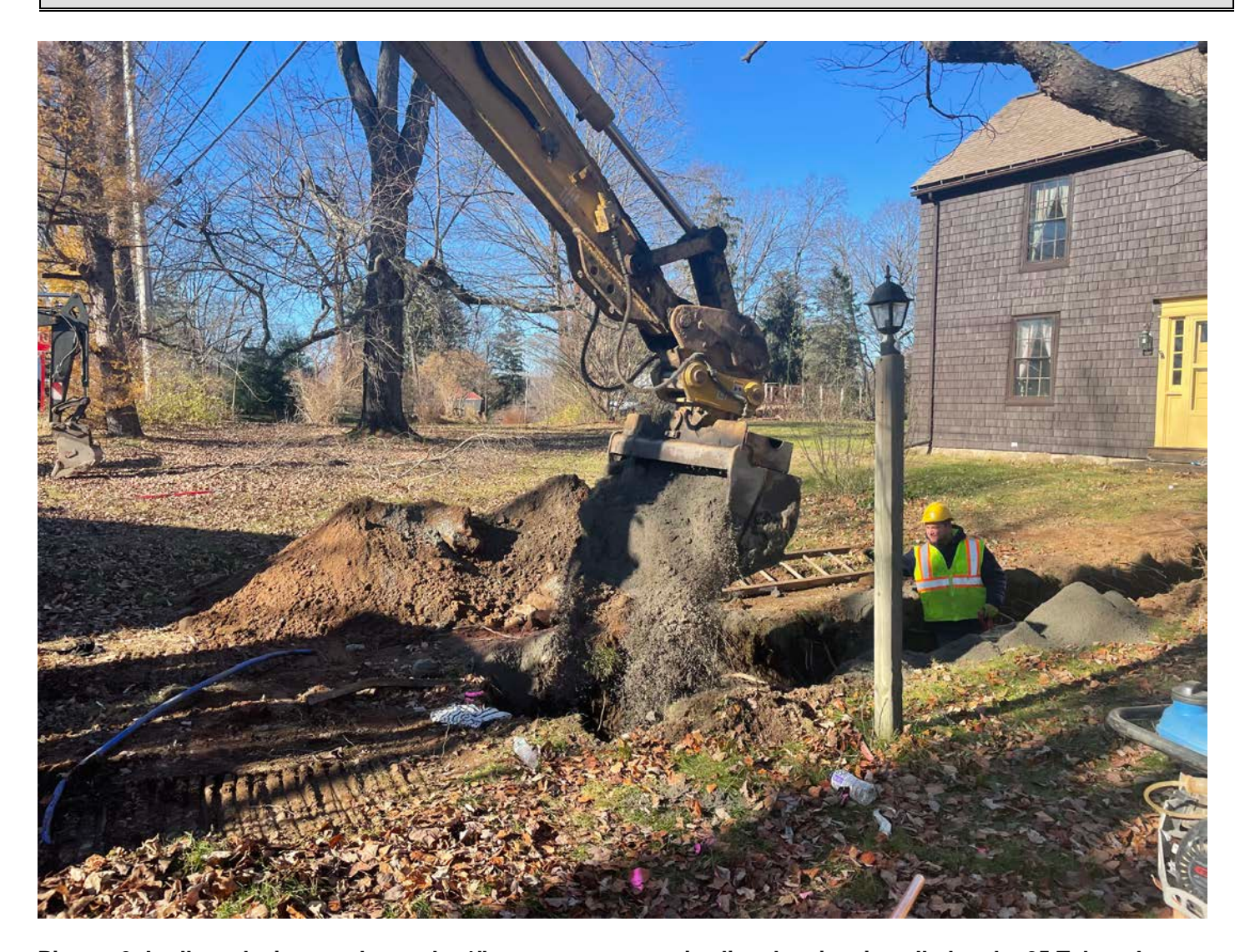
Picture 6: Ludlow placing sand over the 1" copper water service line they just installed at the 25 Talcott Lane property. View to the northwest.