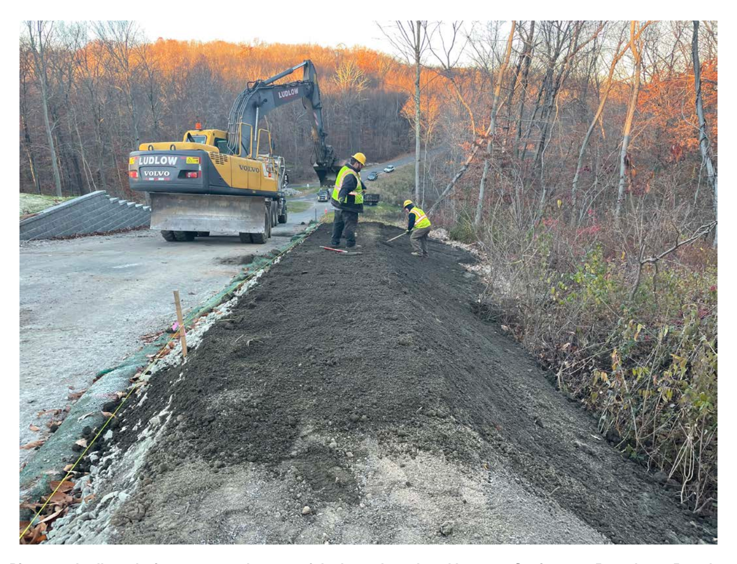
Picture 2: Ludlow placing grass seed on top of the loam they placed between Stations 10+50 and 11+75 on the north side of the Shared Access Driveway in Middletown. View to the west.