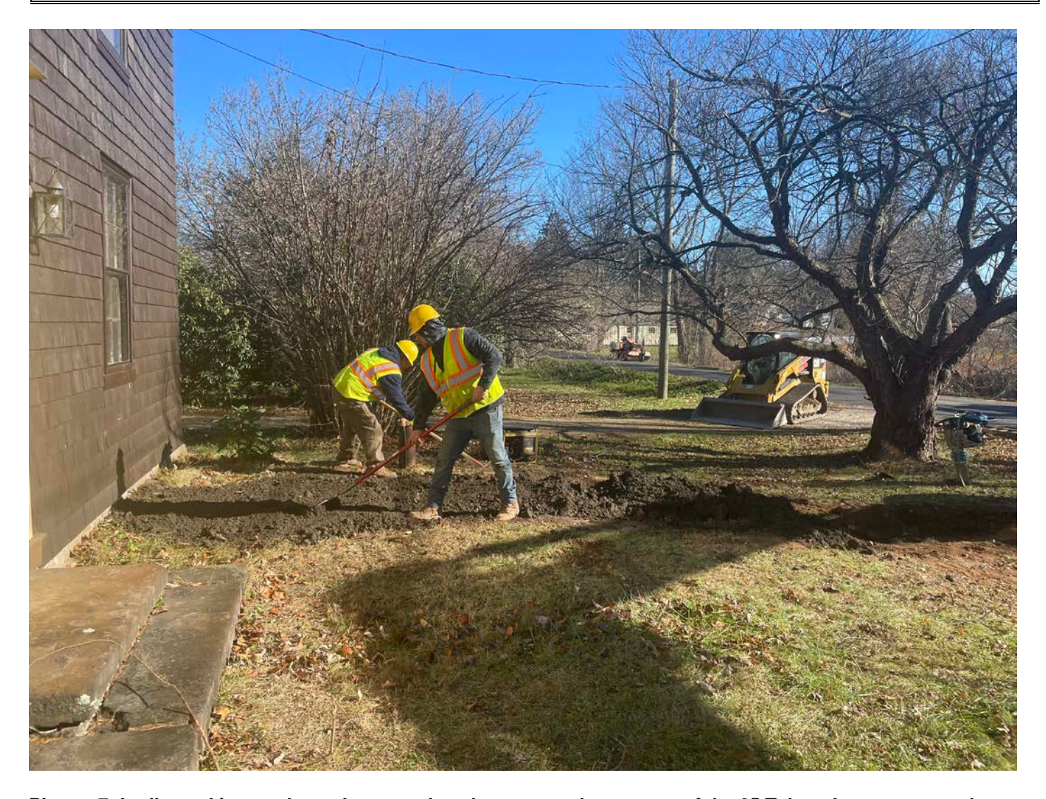
Picture 7: Ludlow raking out loam that was placed to restore those areas of the 25 Talcott Lane property that were disturbed during the installation of a 1" copper water service line. View to the east.