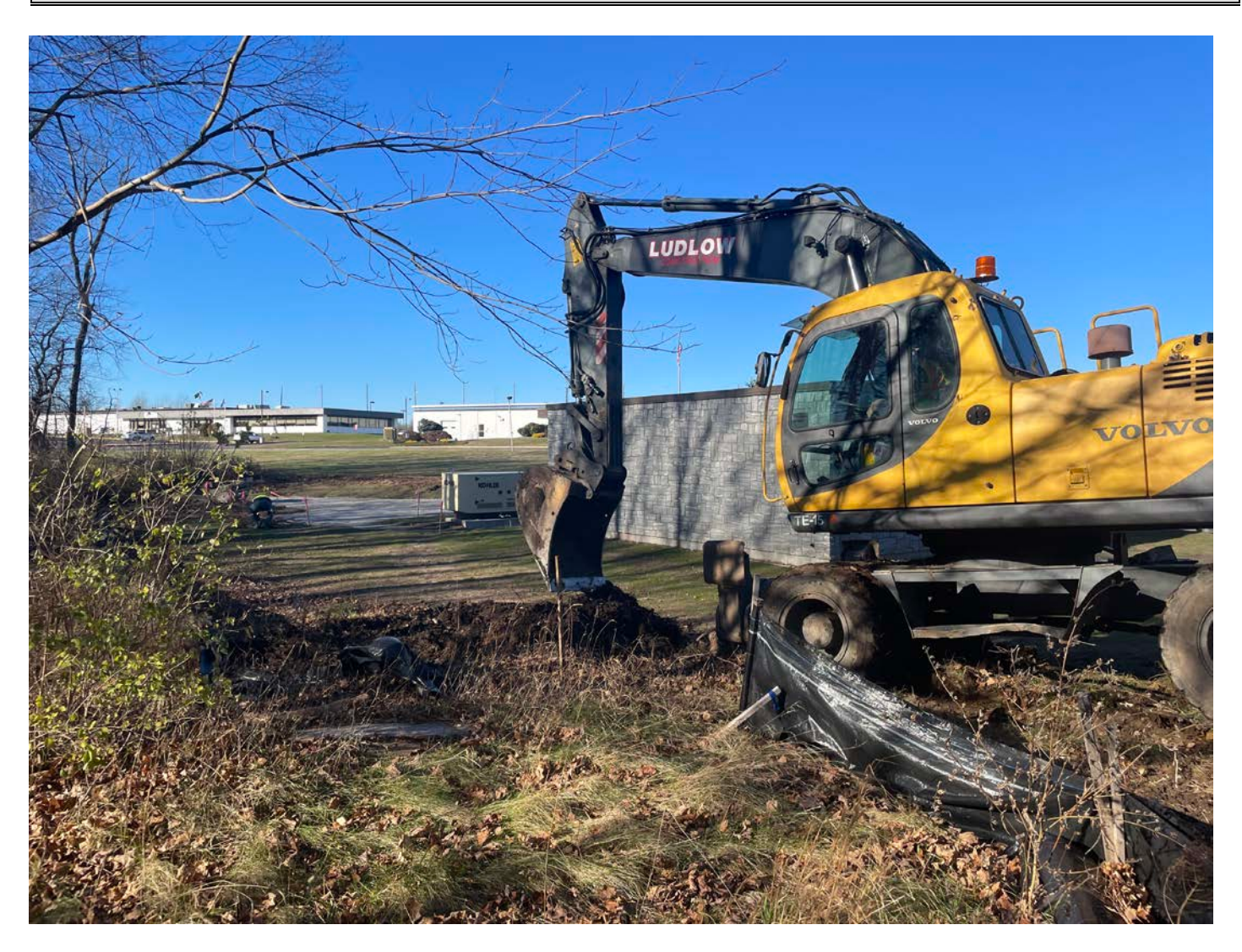
Picture 9: Ludlow excavating brush at the southeast corner of the booster station work zone located at Station 750+63 in Middletown. View to the northwest.