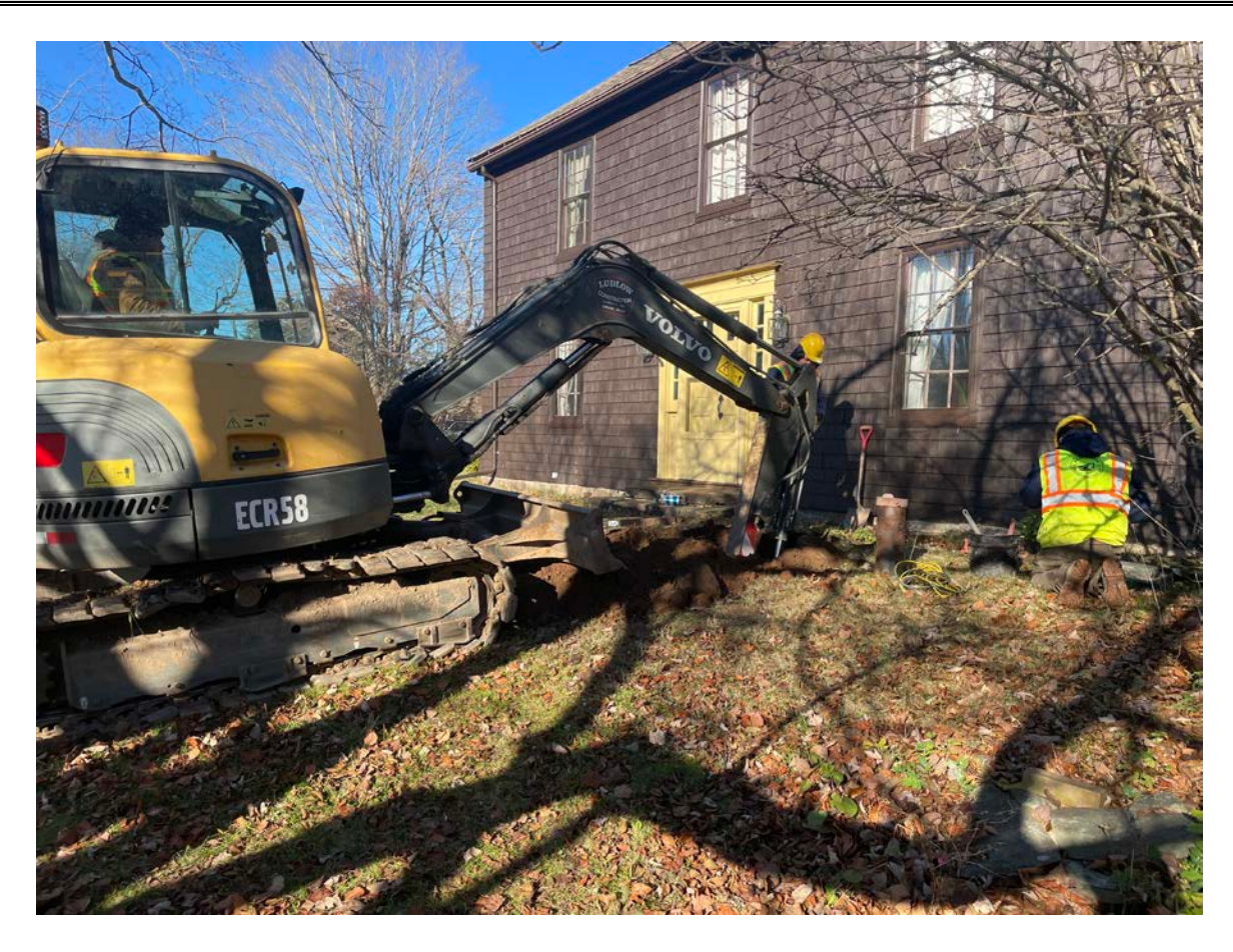
Picture 4: Ludlow excavating a trench on the south side of the 25 Talcott Lane residence for the installation of a 1" copper water service line. View to the northwest.