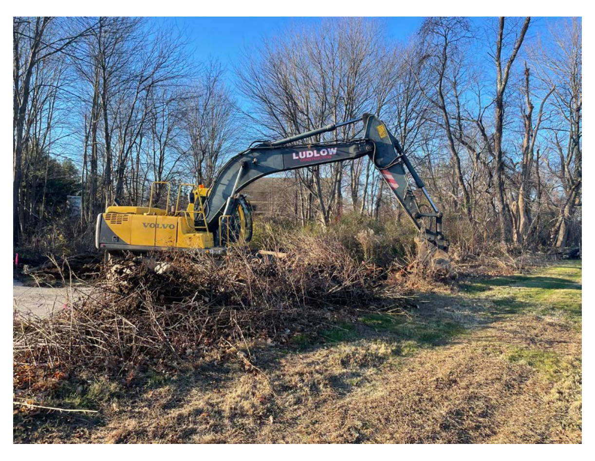
Picture 3: Ludlow excavating brush and tree stumps at the northwest corner of the booster station work zone located at Station 750+63 in Middletown. View to the west.