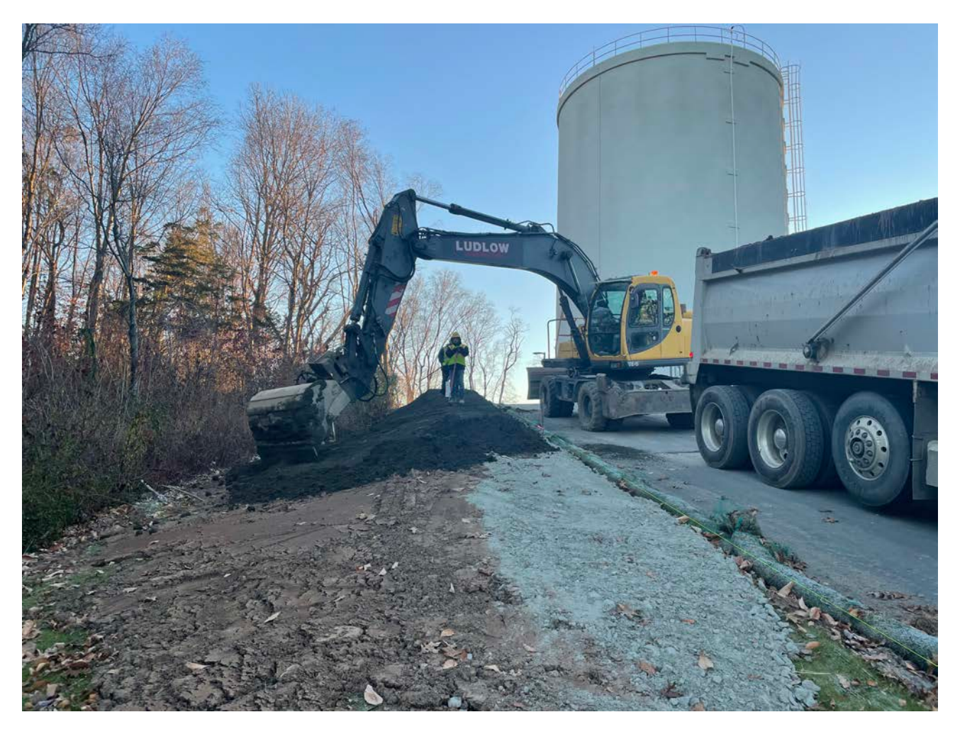
Picture 1: Ludlow placing loam on top of the 1.25"-minus gravel they placed and compacted yesterday on the north side of the water tank located east of the Shared Access Driveway in Middletown. View to the east.