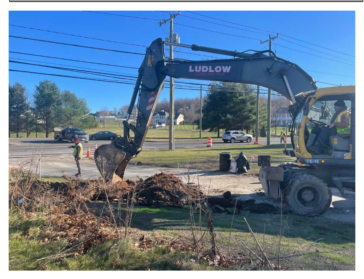
Picture 8: Ludlow excavating a tree stump from the north side of the booster station work zone located at Station 750+63 in Middletown. View to the southeast.