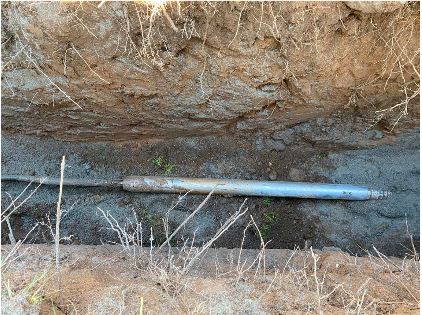
Picture 3: Ludlow places a pneumatic mole on the trench floor to create a tunnel to feed the copper service line through, eastward to another trench, underneath the stone walkway without disrupting it.