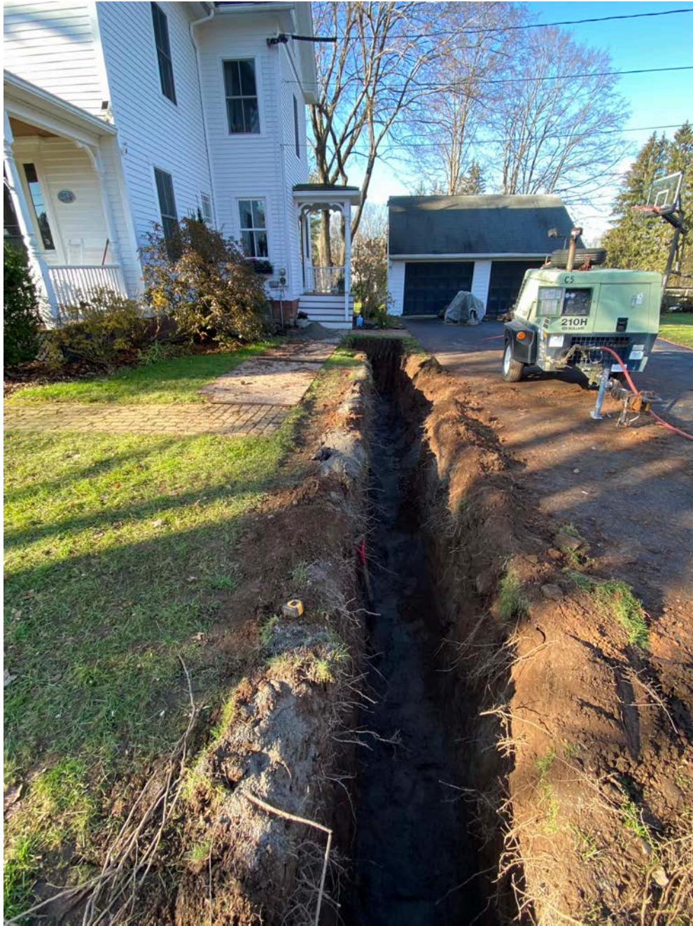
Picture 4: Ludlow excavates a trench south of the driveway of the 254 Maple Ave residence for the installation of a 1" copper water service line. Looking west.