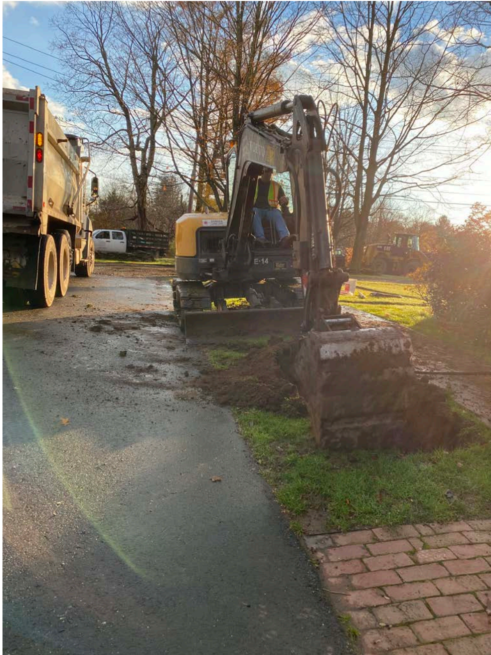
Picture 2: Ludlow Excavates the trench for the installation of a 1" copper service line just south of the driveway of the 254 Maple Ave residence. Looking east.