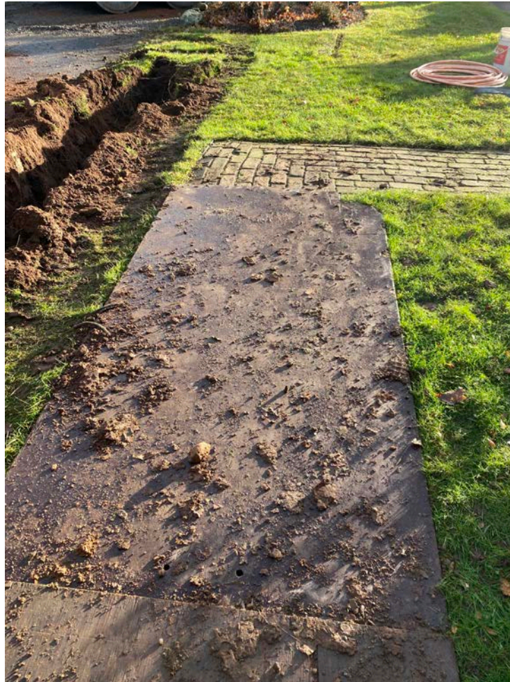
Picture 1: In preparation for excavation for the 1” copper water service line on the 254 Maple Ave residence, Ludlow placed wood plates over the stone walkway to avoid any damage. Looking east.