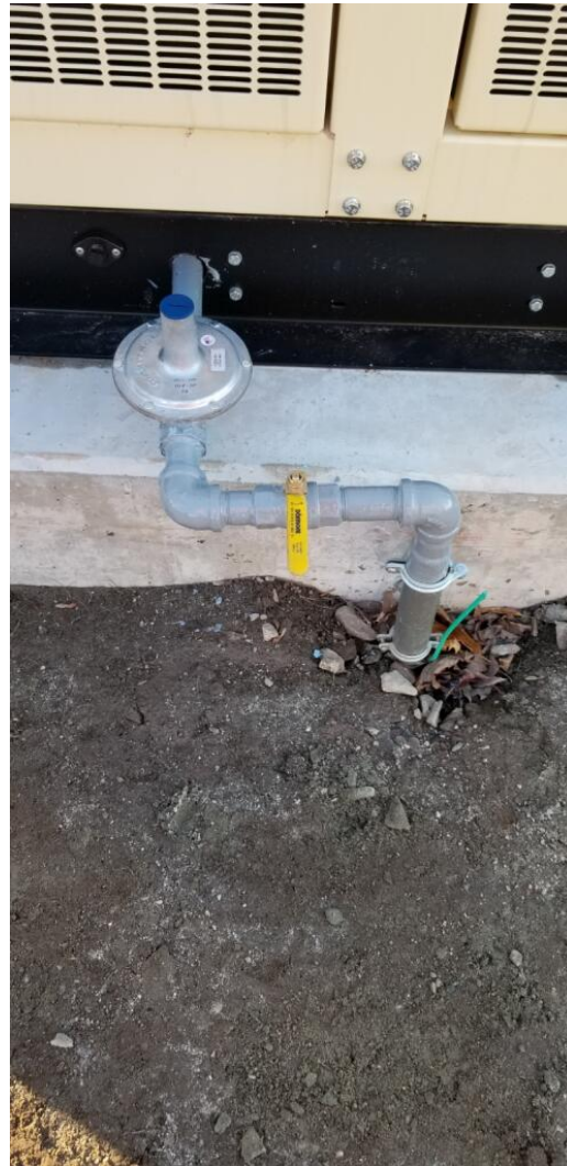
Picture 11: Fazino Plumbing returned to the Booster station and replaced all fittings with new fittings from Ward MFG.