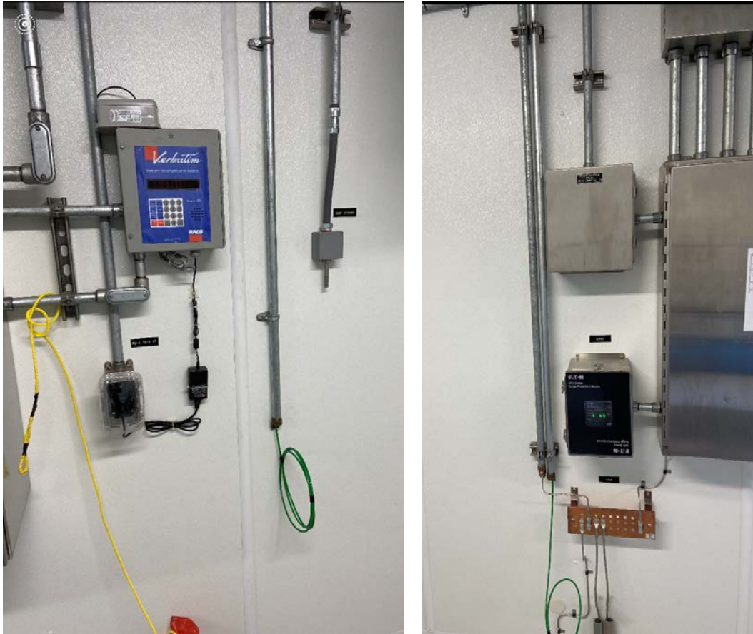
Picture 12: A & R Electric installed 3/4 rigid conduit and ran a #8 ground wire inside of the conduit at the booster station. The #8 wire will be used by the telephone utility company to ground their equipment.

Project: Durham Meadows Pipeline Installation Date: November 19, 2021 Location: Maple Avenue, Durham Day of Week: Friday Project #: AECOM: 6061487 Report No: 367 Contractor: Ludlow Construction Page: 14 of 14