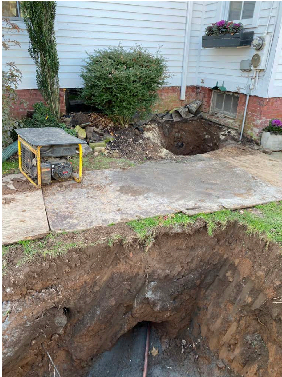
Picture 6: The segment of the 1" copper service line which follows the tunnel formed by the pneumatic mole from one trench to another, beneath the stone walkway on the 254 Maple Ave residence. Looking southwest.