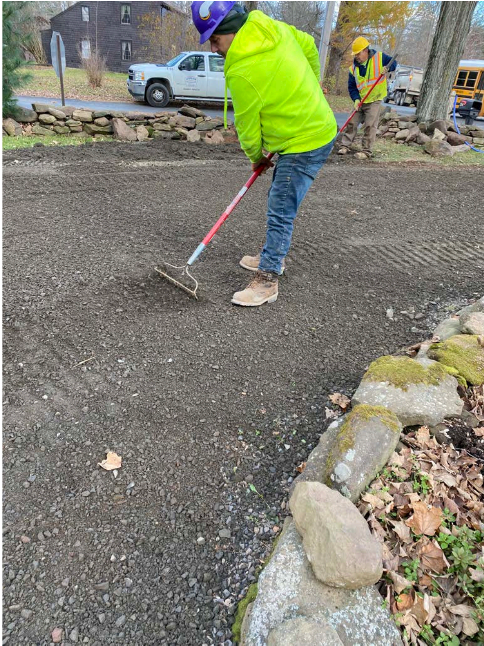
Picture 10: Ludlow levels any disturbed areas up the driveway to the 254 Maple Ave residence. Looking east.