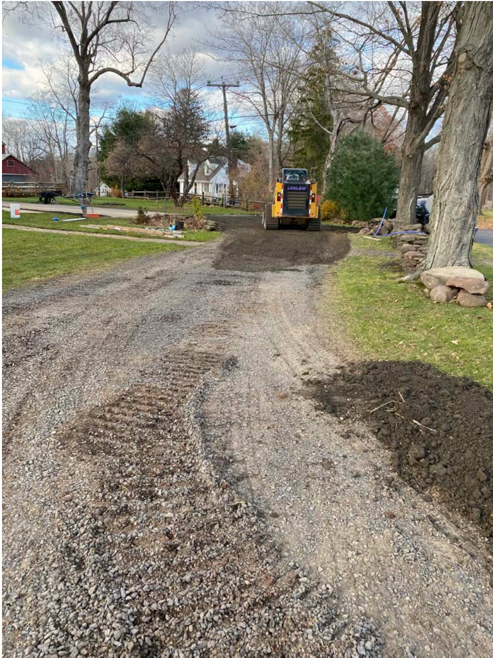
Picture 9: Ludlow levels the gravel driveway for the 254 Maple Ave residence and adds and compacts backfill to any disturbed areas. Looking east.