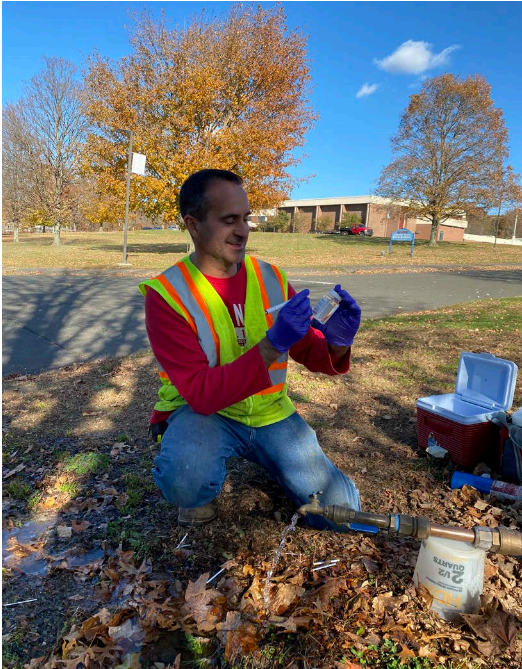
Picture 7: JMS testing for residual chlorine during the de-chlorination process.