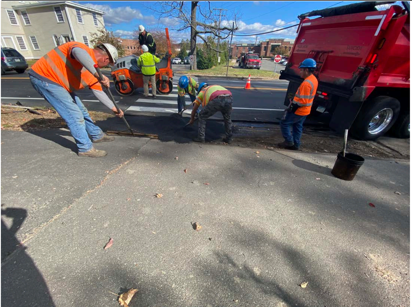
Picture 6: Laydon replacing the asphalt apron for the Southern driveway of the 280 Main Street residence