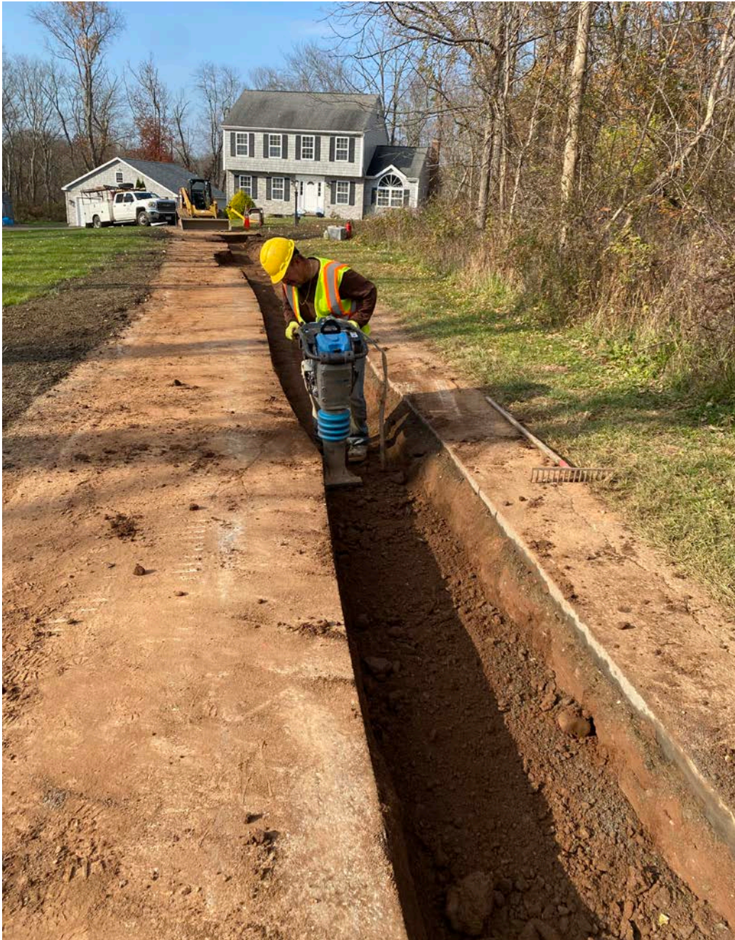
Picture 5: Ludlow compacts the previously excavated 1' deep trench surface with a compactor as the excavation continues down the trench in the driveway of the 212R Maple Ave residence. Looking West.