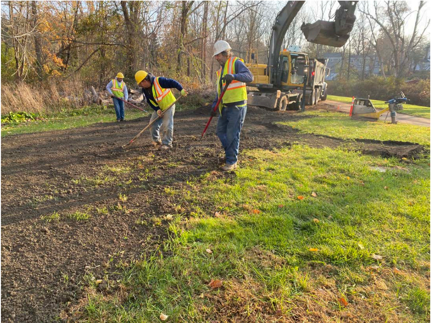
Picture 2: Ludlow grades and loams the disturbed area in the front lawn of the 212R Maple Ave residence. Looking East.