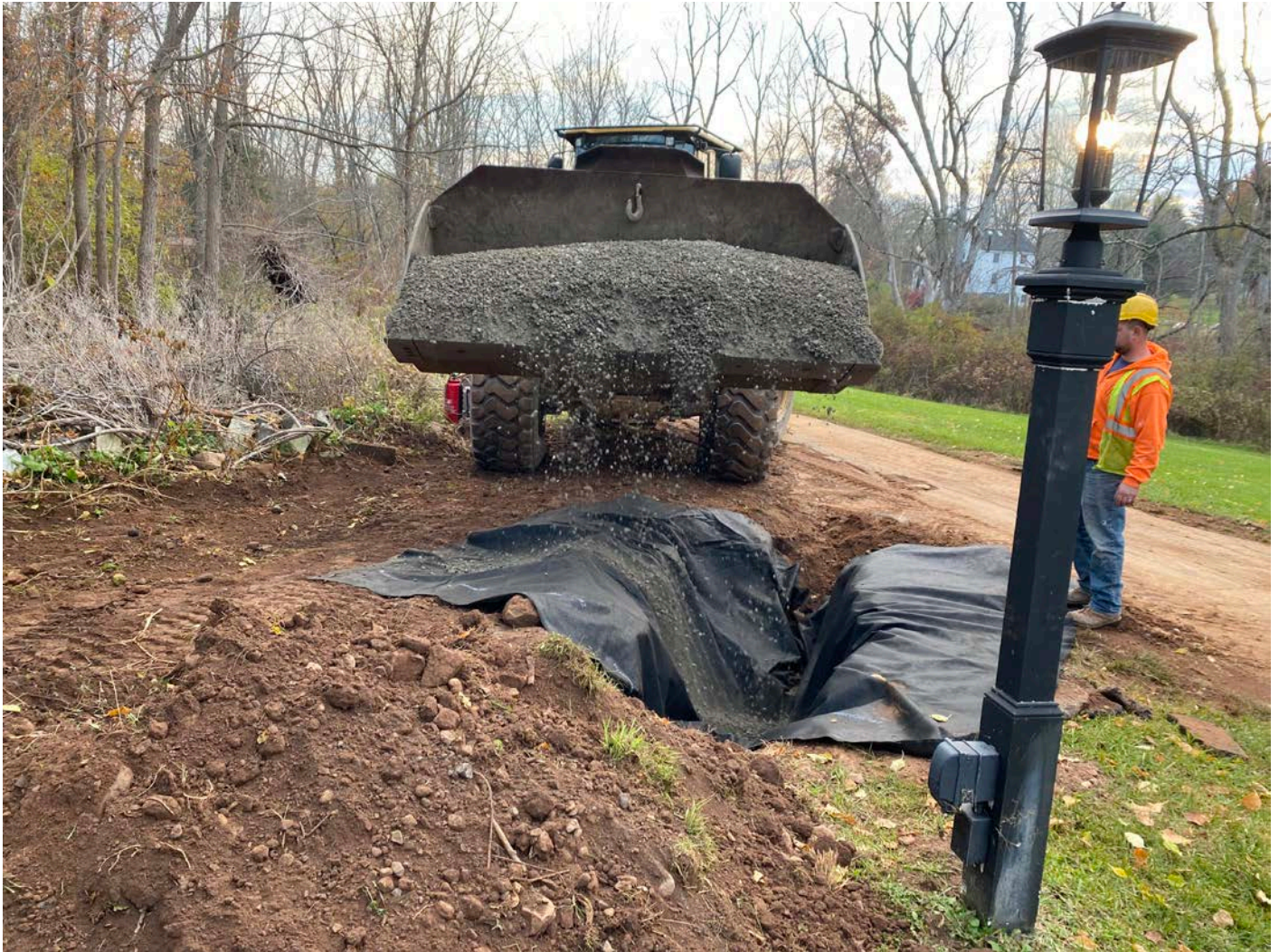
Picture 1: Ludlow backfills in the open area by the driveway from the installation of a 1.5” copper water service line which was completed yesterday. Looking East.