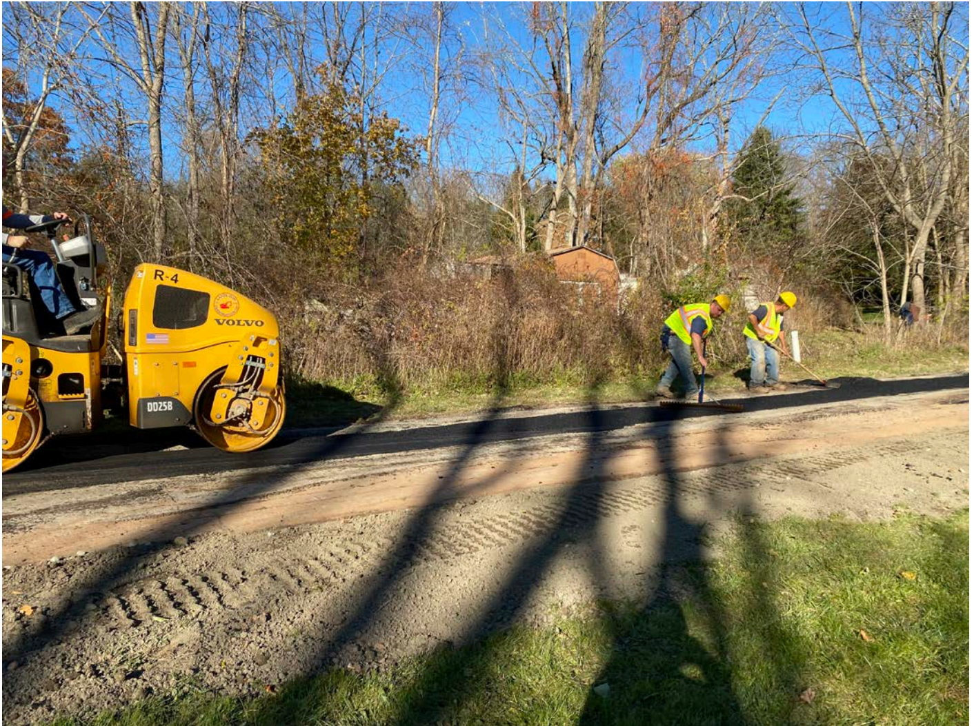
Picture 9: Ludlow grading the asphalt and compacting it with a roller in the driveway of the 212R Maple Ave residence. Looking North.