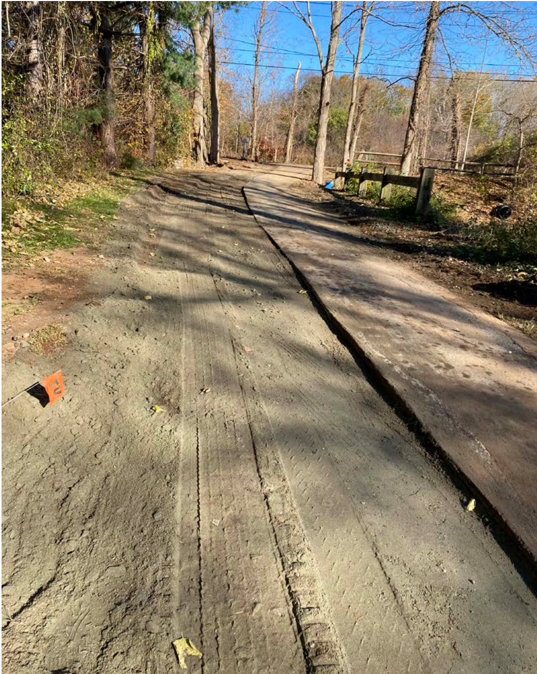
Picture 8: Ludlow compacts the length of the trench in preparation for paving in the driveway of the 212R Maple Ave residence. Looking East.