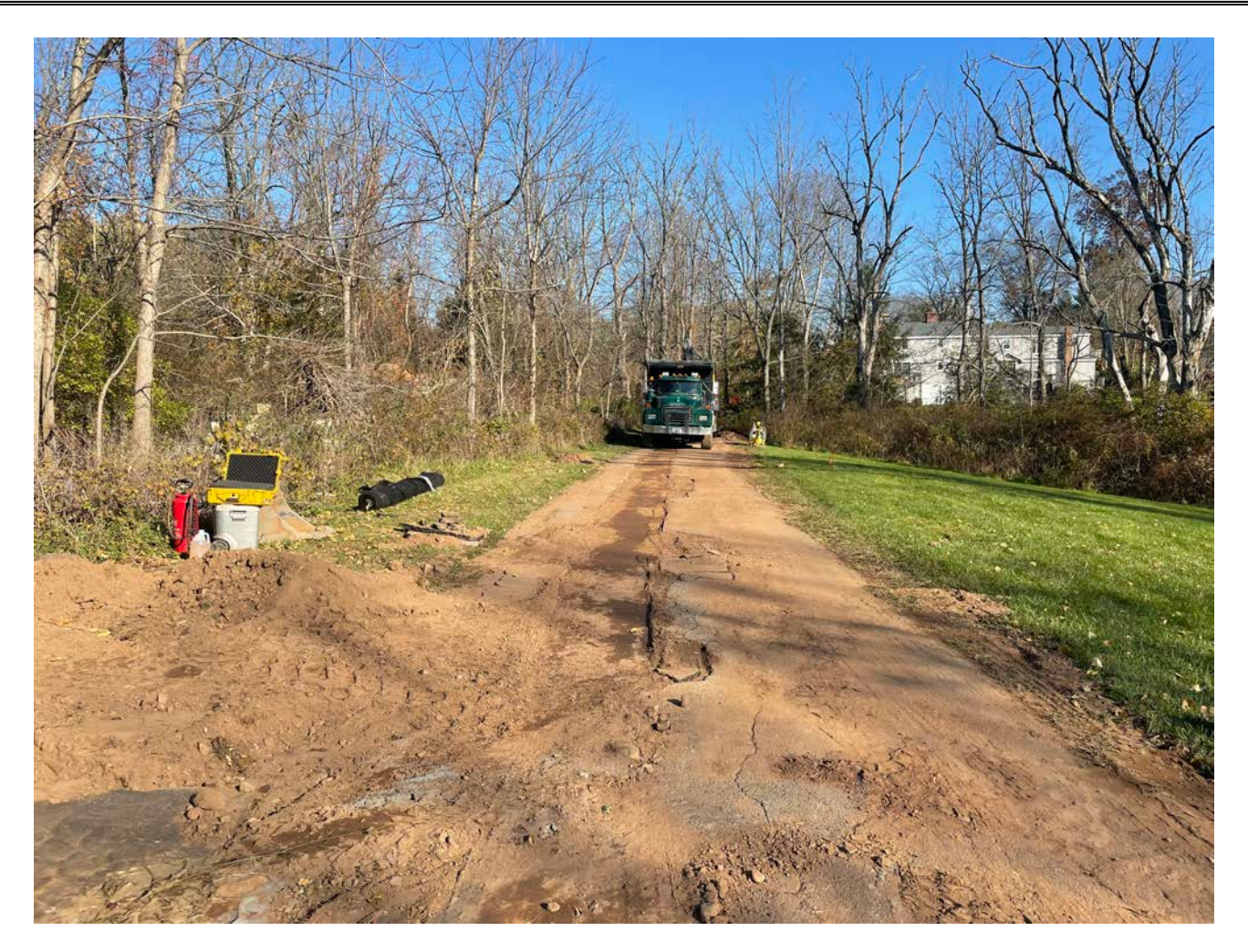
Picture 7: View of the progress at the end of the day at the 212R Maple Avenue property where Ludlow installed a 1.5" copper water service line. View to the east.