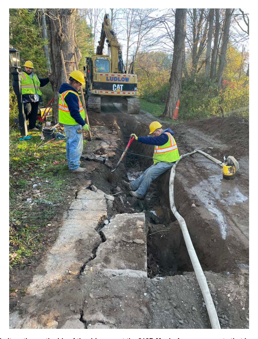
Picture 1: Asphalt on the north side of the driveway at the 212R Maple Avenue property that has been compromised by the weight of Ludlow's construction vehicles and will need to be replaced. View to the east.