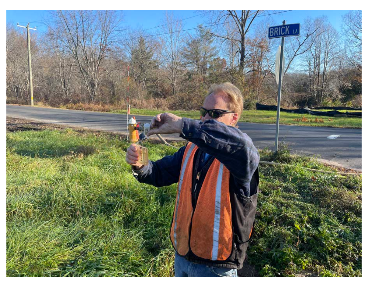
Picture 3: JMS testing for residual chlorine during the dechlorination process. View to the northeast.

Contractor: Ludlow Construction Page: 6 of 12