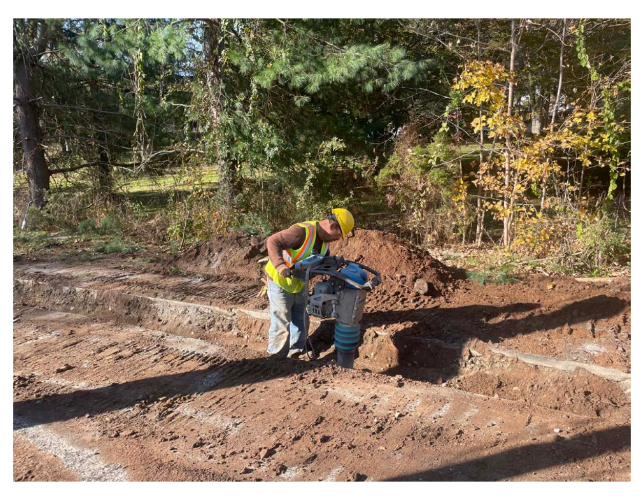
Picture 5: Ludlow compacting native fill that was placed in 1' lifts over the sand and caution tape that was placed over the 1.5" copper water service line Ludlow installed at the 212R Maple Avenue property. View to the northwest.

Contractor: Ludlow Construction Page: 8 of 12