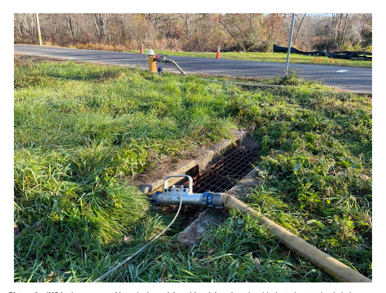
Picture 2: JMS in the process of introducing calcium thiosulphate into the chlorinated water that is being purged from the Pickett Lane and Maiden Lane water lines. The water is being discharged into a catch basin located on the northwest corner of the intersection of Brick Lane and Maiden Lane. View to the northeast.