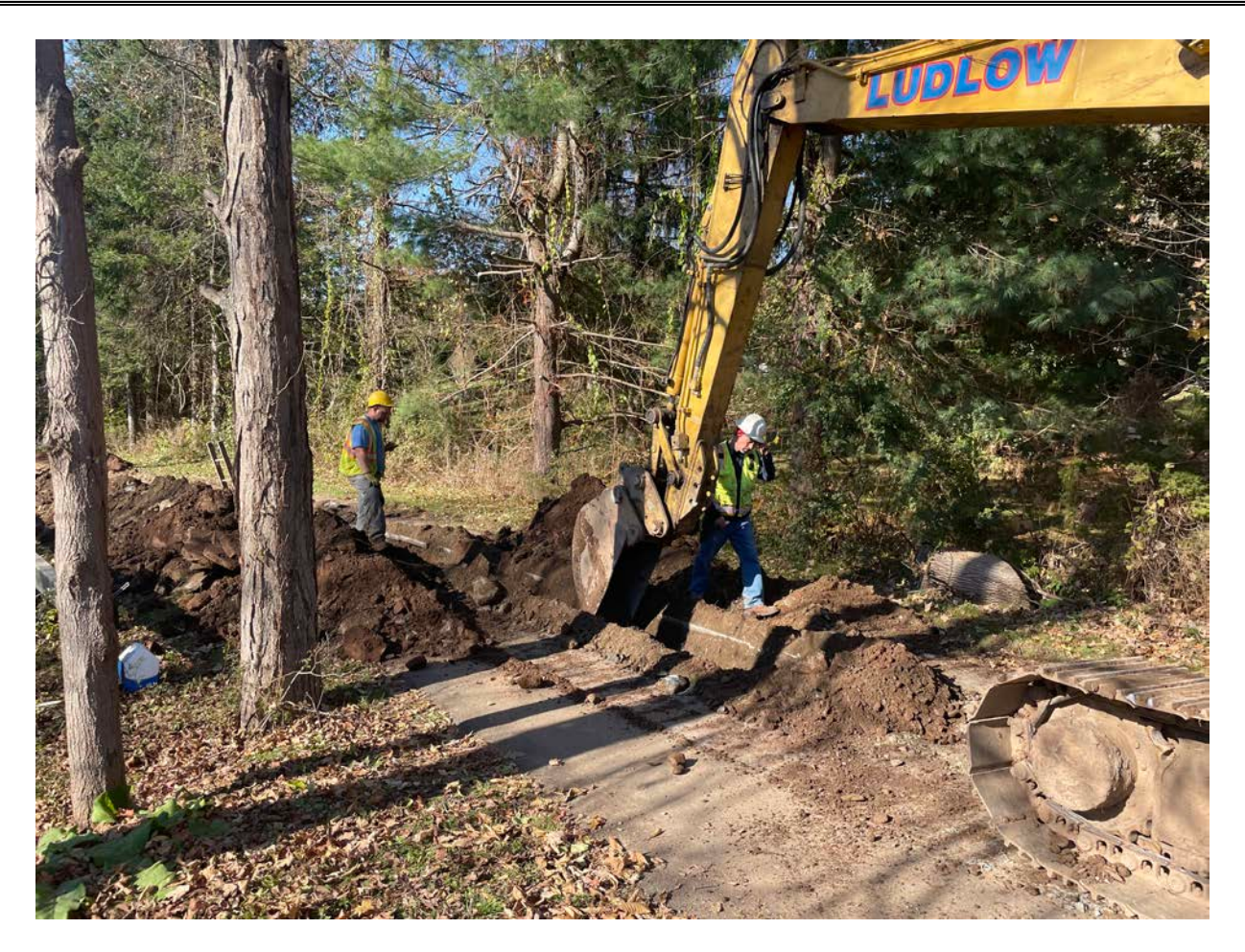
Picture 4: Ludlow excavating a trench on the driveway of the 212R Maple Avenue property for the installation of a 1.5" copper water service line. View to the west.