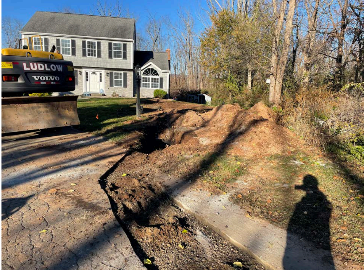
Picture 4: Location at the 212R Maple Avenue property where Ludlow resumed the installation of a 1.5” copper water service line. View to the west.