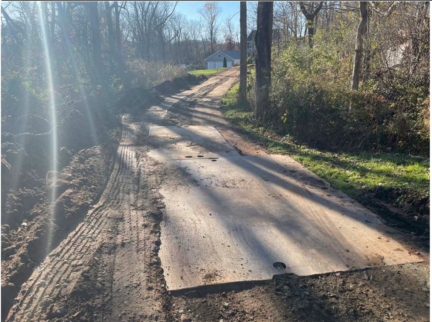
Picture 12: Steel plates that Ludlow placed over the trench at the end of the day at the 212R Maple Avenue property. View to the west.