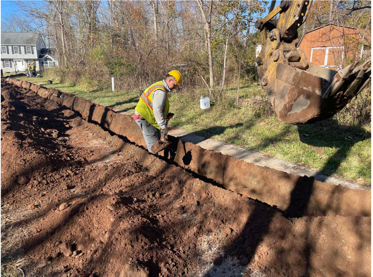
Picture 8: Ludlow hand-excavating around an electrical utility as they excavate a trench on the 212R Maple Avenue driveway for the installation of a 1.5" copper water service line. View to the northwest.