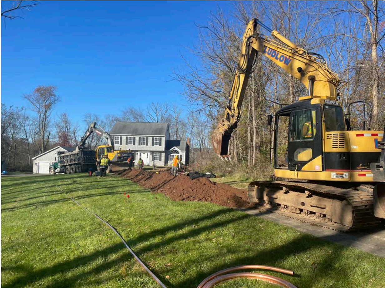
Picture 6: Ludlow excavating for the installation of a 1.5” copper water service line at the 212R Maple Avenue property. View to the west.