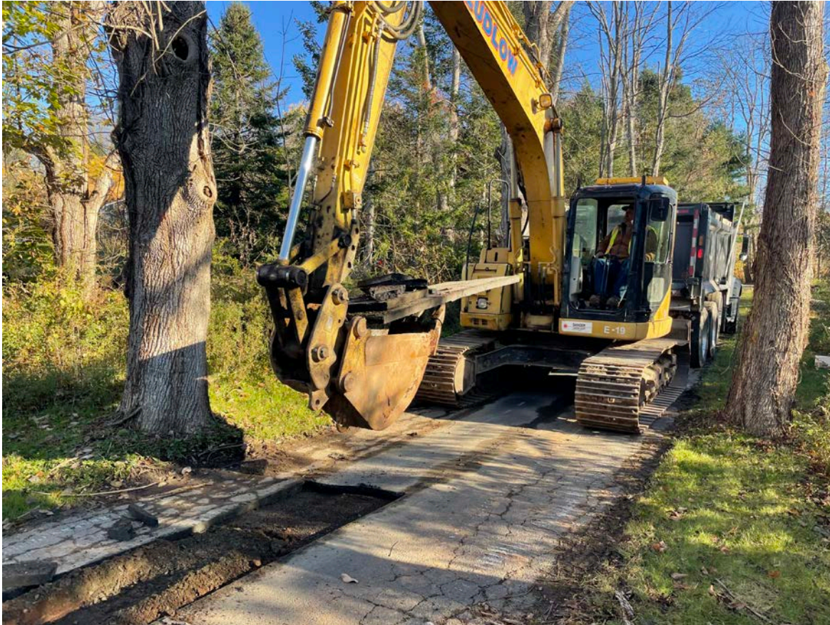
Picture 3: Ludlow removing asphalt from the footprint of a trench they are excavating on the driveway 212R Maple Avenue property for the installation of 1.5” copper water service line. View to the east.