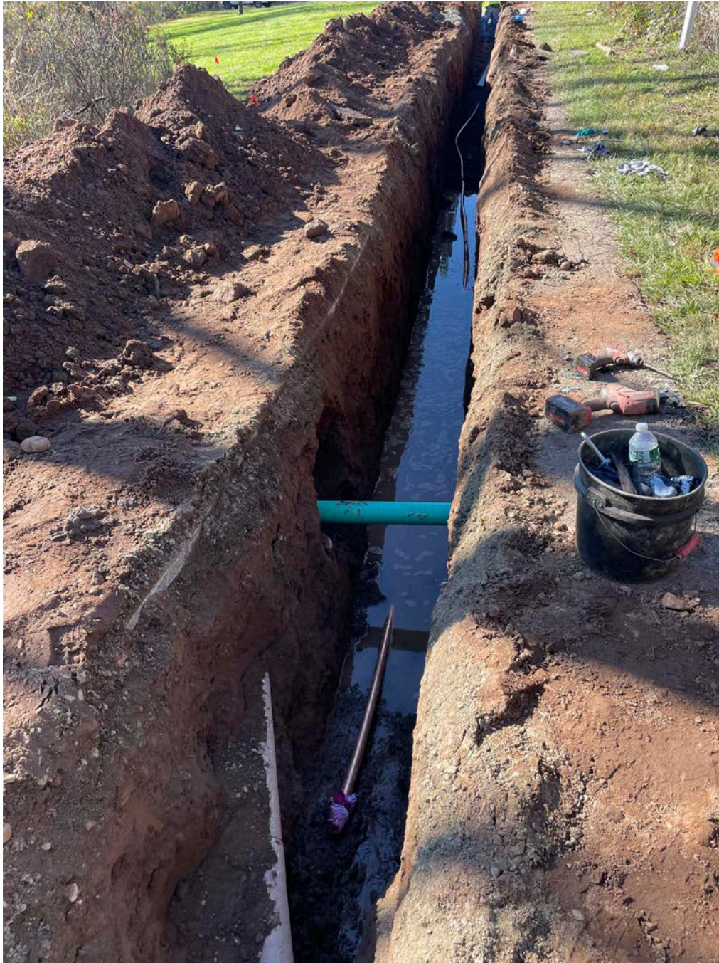
Picture 11: Water observed in the trench that Ludlow excavated at the 212R Maple Avenue property for the installation of a 1.5" copper water service line. View to the west.

Project: Durham Meadows Pipeline Installation Date: November 08, 2021 Location: Maiden Lane, Pickett Lane, Main Street and Maple Avenue, Durham Day of Week: Monday Project #: AECOM: 6061487 Report No: 359 Contractor: Ludlow Construction Page: 14 of 15