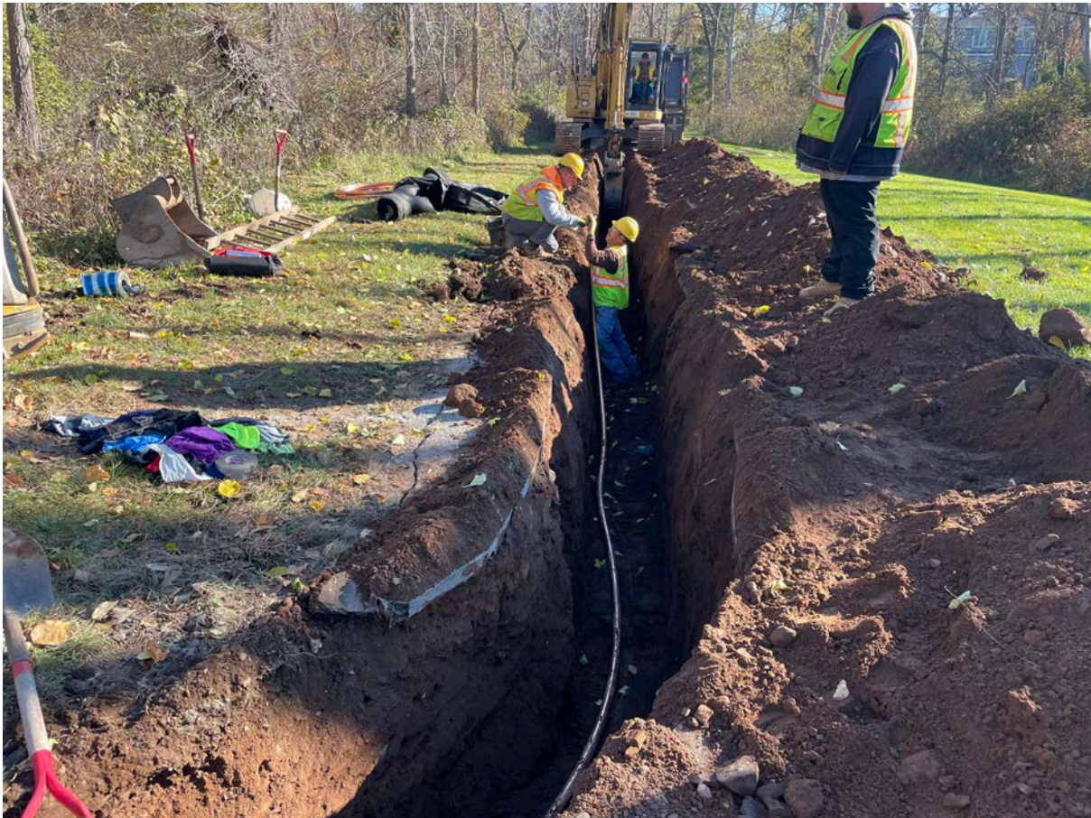
Picture 5: Ludlow installing 1.5" copper water service line at the 212R Maple Avenue property. View to the east.