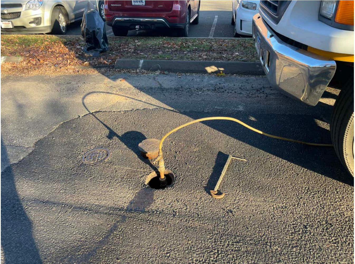
Picture 1: Sodium hypochlorite solution being introduced into the water line on Pickett Lane as JMS and Ludlow chlorinate the line.