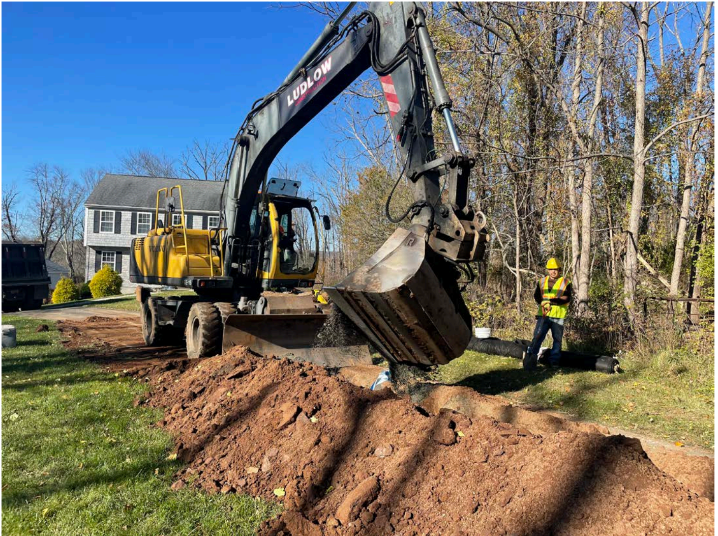
Picture 9: Ludlow placing sand over 1.5" copper water service line that they have installed at the 212R Maple Avenue property. View to the west.