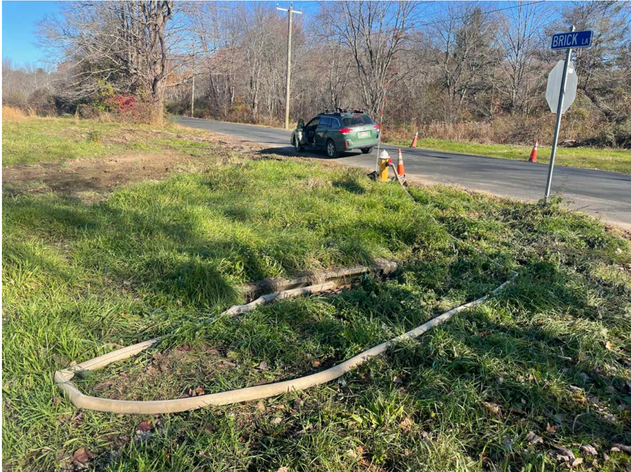
Picture 7: Ludlow draining water from the water lines on Pickett Lane and Maiden Lane from the hydrant located on Brick Lane next to where it intersects Maiden Lane. The water is being discharged to a storm drain located on the northwest corner of the intersection of Brick Lane and Maiden Lane. View to the northeast.