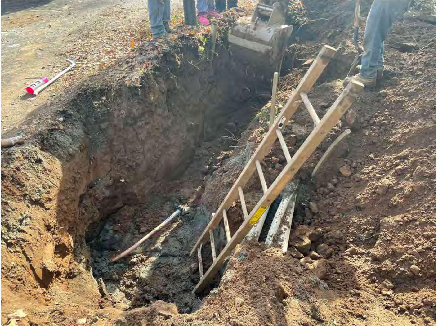
Picture 9: Ludlow excavating a trench for the reinstatement of a curb stop and the installation of a meter pit and 1.5" copper water service line for the 212R Maple Avenue property. View to the south.