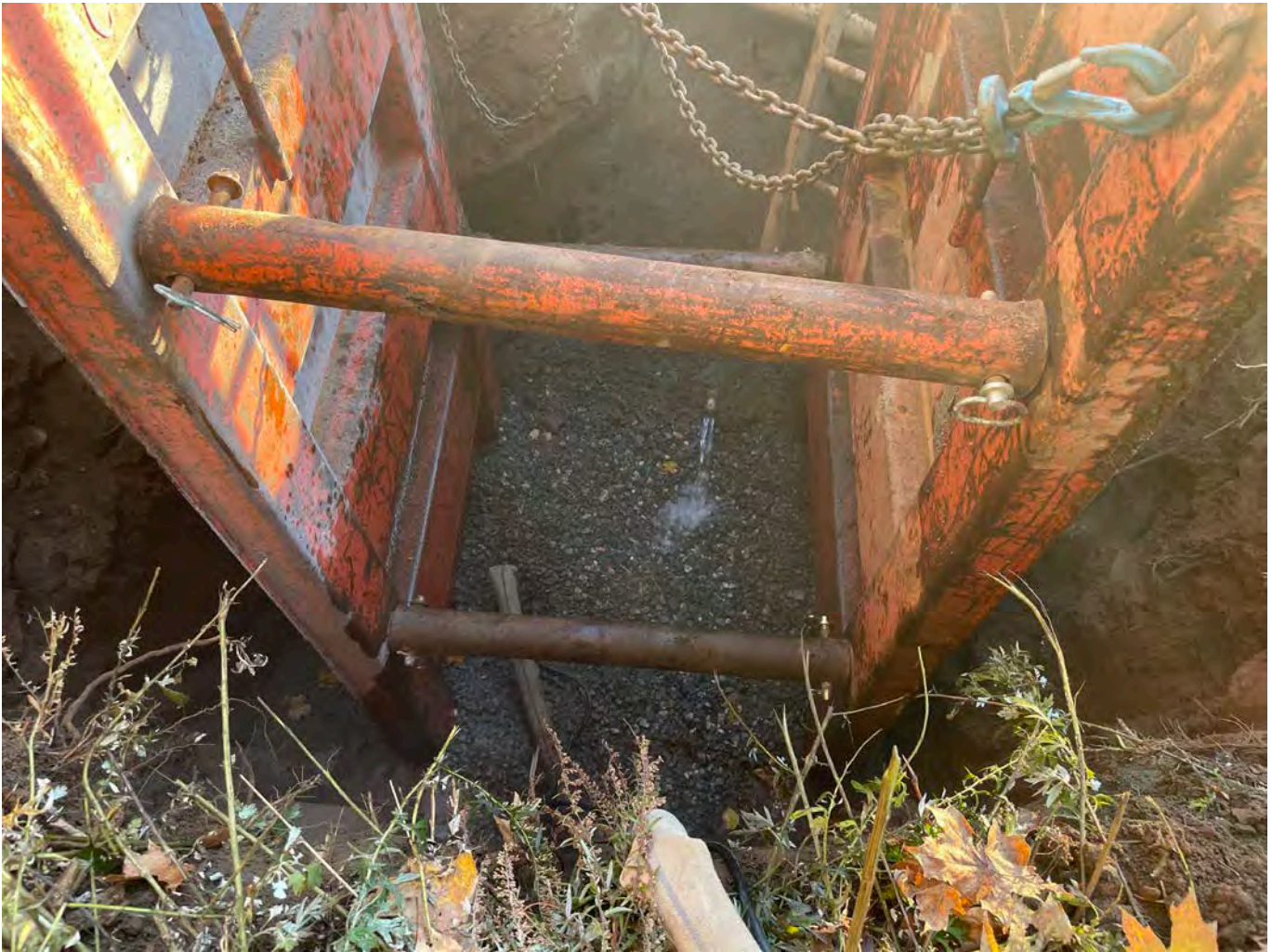
Picture 2: Water from a section of the Maple Avenue water line that is draining into the excavation where Ludlow removed the curb stop for the 212R Maple Avenue property. The water is being removed from the excavation via a pump that is set in the ¾" rock that is visible on the bottom of the excavation. View to the east.