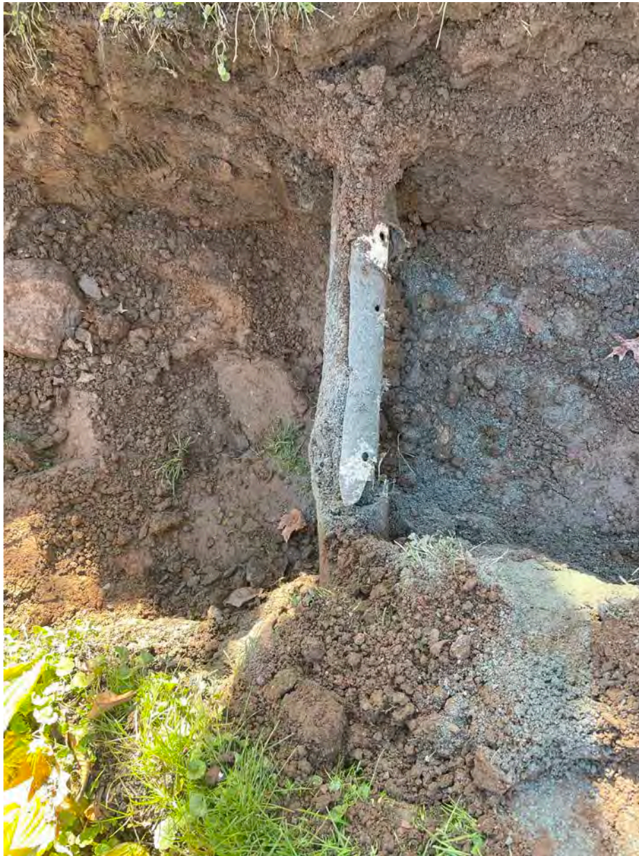
Picture 6: 4" PVC drain line that Ludlow damaged during the installation of a 1" copper water service line at the 206 Maple Avenue residence. View to the south.