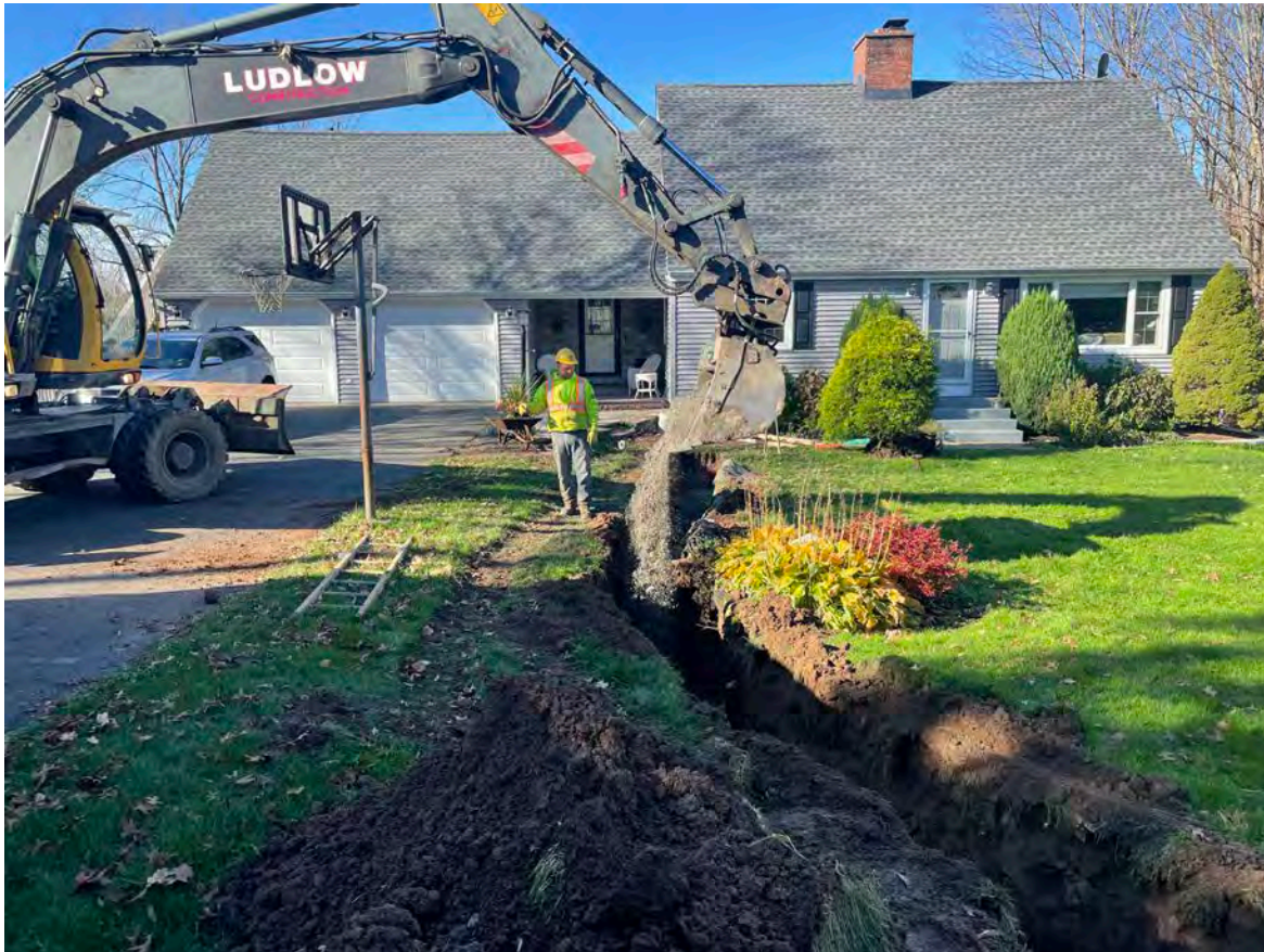
Picture 3: Ludlow placing sand over 1” copper water service line that they just installed on the east side of the 206 Maple Avenue residence. View to the west.