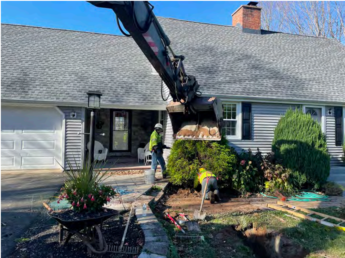
Picture 5: Ludlow setting a shrub back in place on the east side of the 206 Maple Avenue residence after they installed a 1" copper water service line. View to the west.