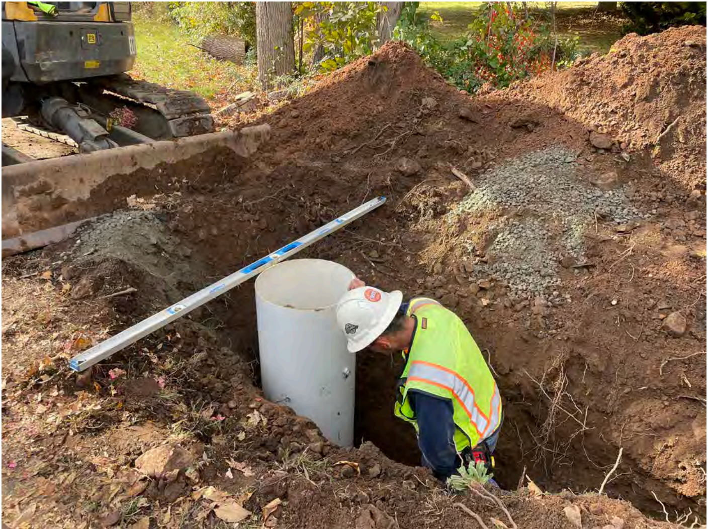
Picture 10: Ludlow leveling the meter pit that they are in the process of installing on the north edge of the 212R Maple Avenue driveway. View to the southwest.