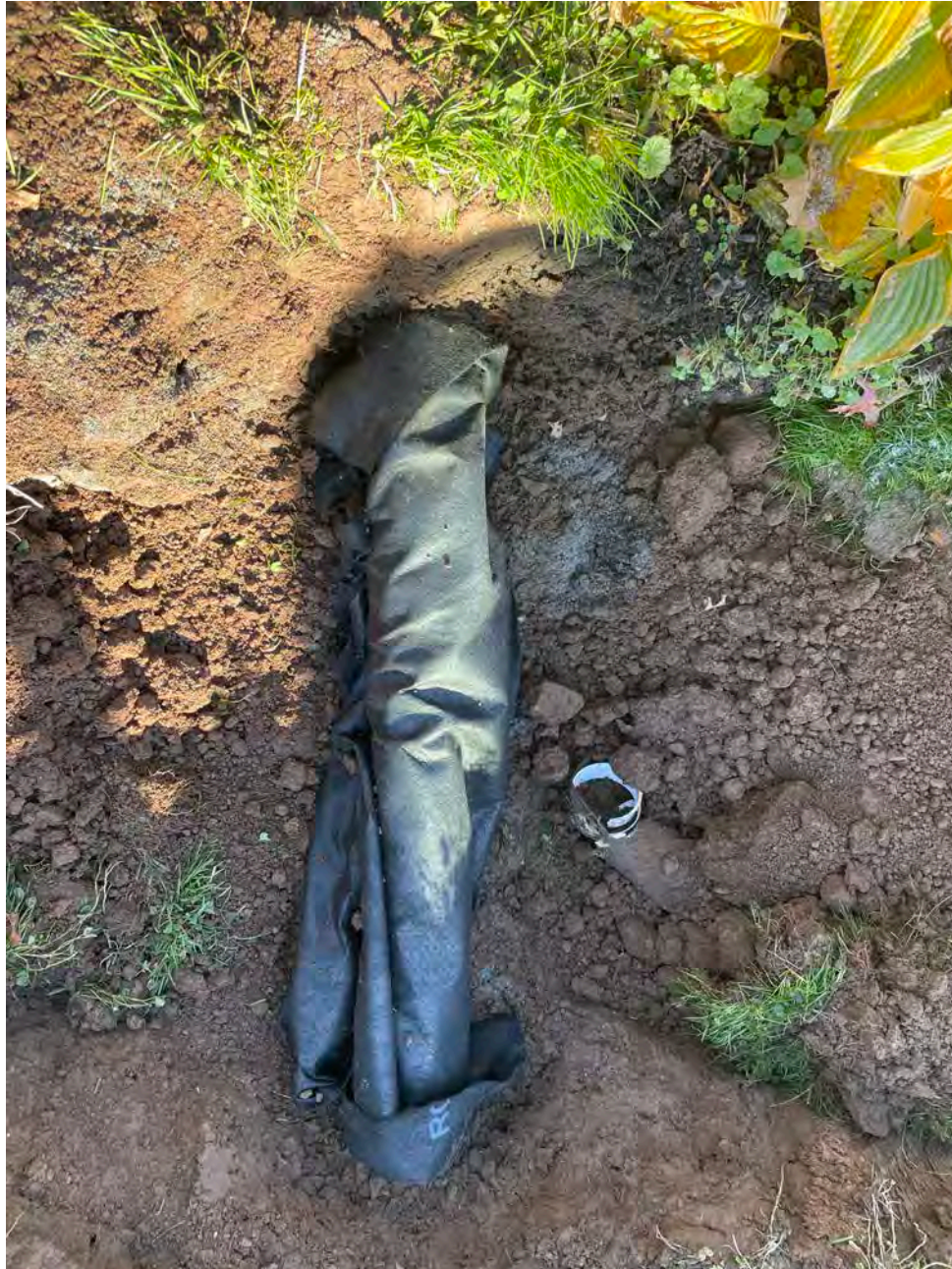
Picture 7: 4" PVC drain line that Ludlow repaired after damaging it during the installation of a 1" copper water service line at the 206 Maple Avenue residence. View to the south.