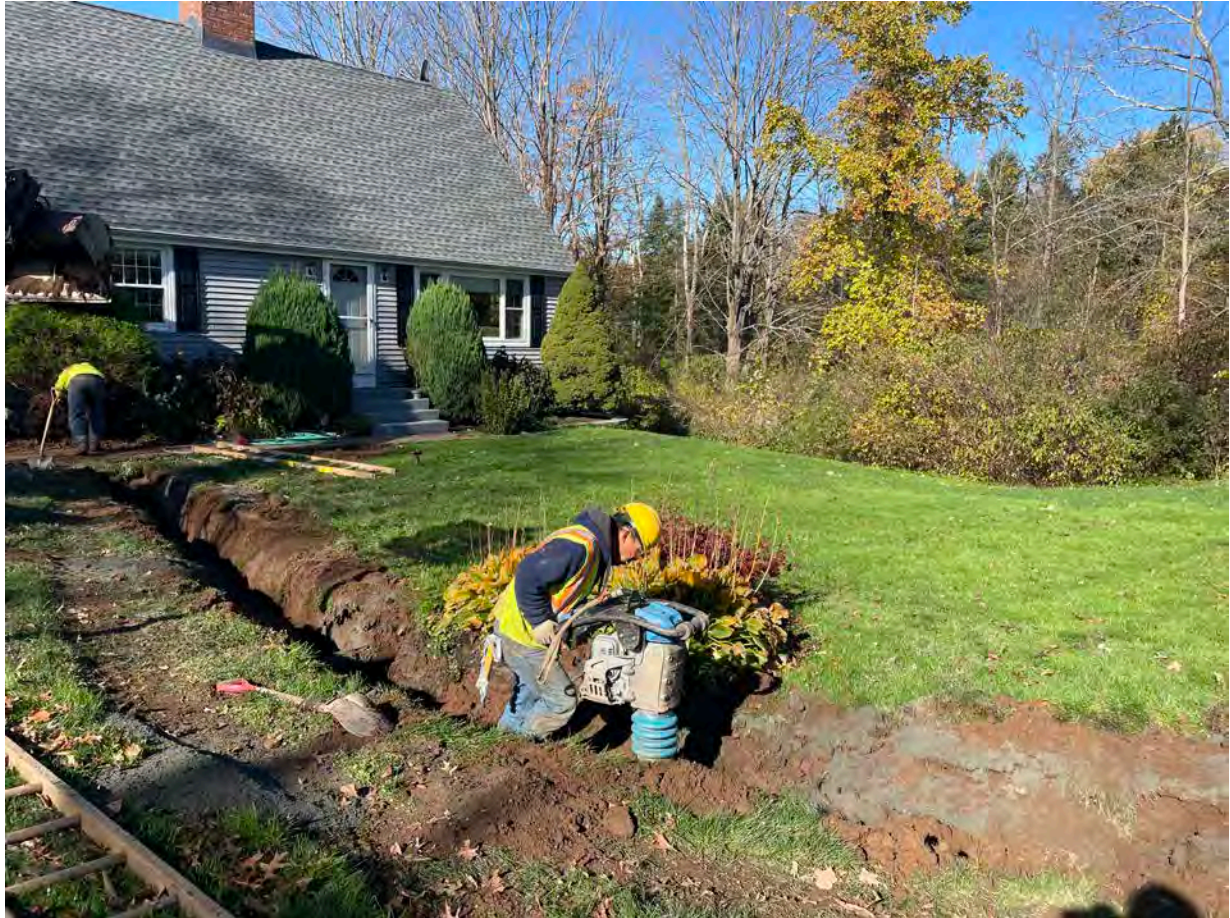
Picture 4: Ludlow compacting fill that has been placed over the sand and caution tape that was placed over the 1" copper water service line that they just installed on the east side of the 206 Maple Avenue residence. View to the northwest.