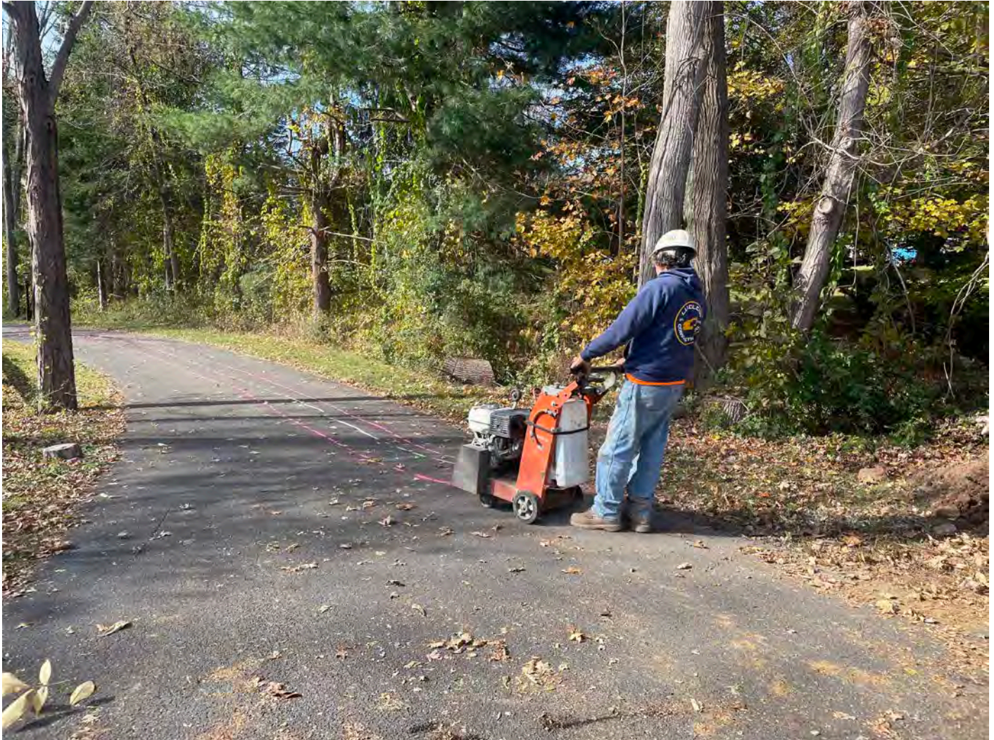
Picture 8: Ludlow saw-cutting the footprint of a trench on the 212R Maple Avenue driveway for the installation of a 1.5" copper water service line. View to the west.