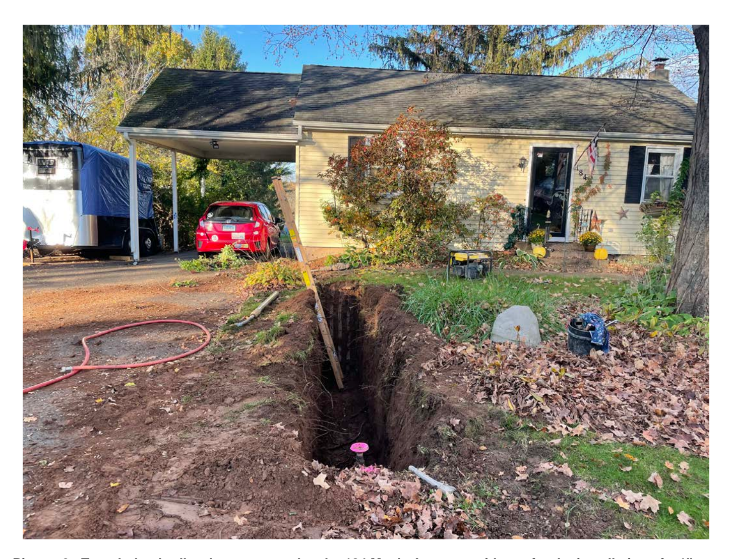
Picture 2: Trench that Ludlow has excavated at the 184 Maple Avenue residence for the installation of a 1" copper water service line. View to the west.