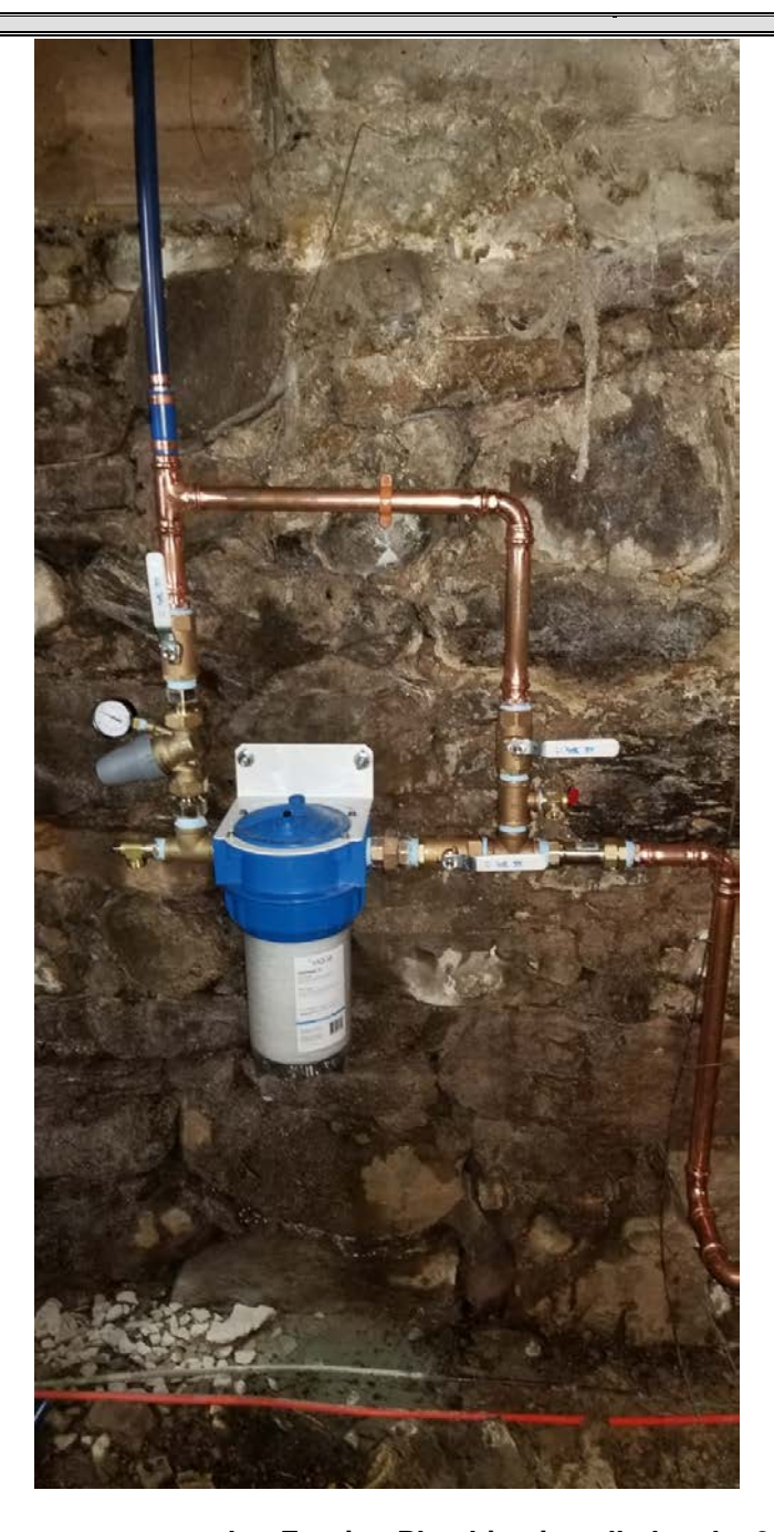
Picture 8: Final water service components that Fazzino Plumbing installed at the 208 Main Street, Durham, residence.