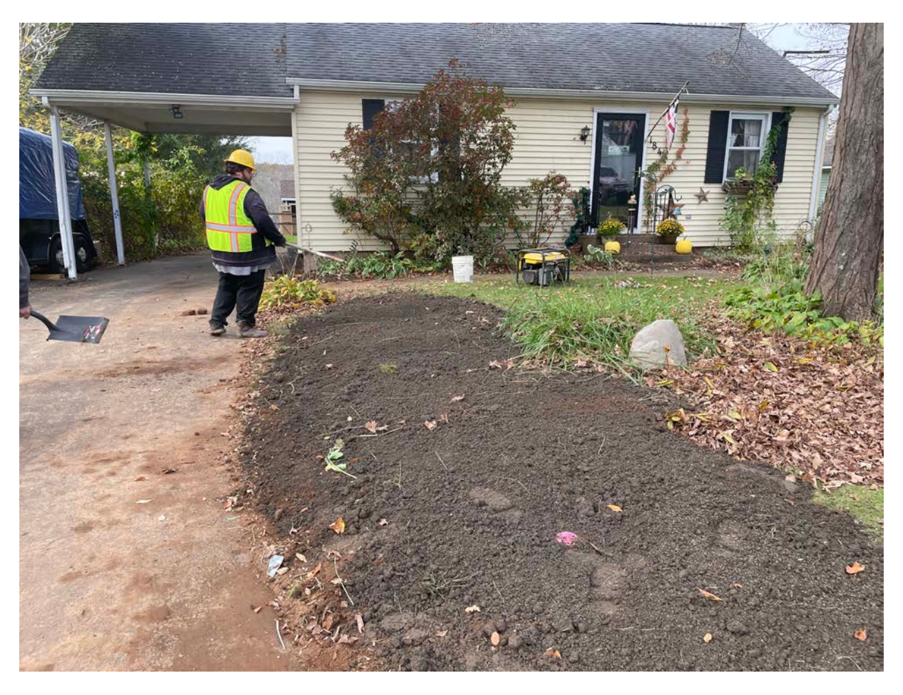
Picture 6: Ludlow raking out loam that they placed on the portions of the 184 Maple Avenue property that were disturbed during the installation of a 1" copper water service line. View to the west.