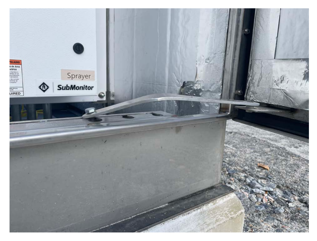
Picture 4: Bent support arm on one of the south-facing doors of the electrical cabinet located north of the altitude vault at the water tank work zone. View to the northeast.