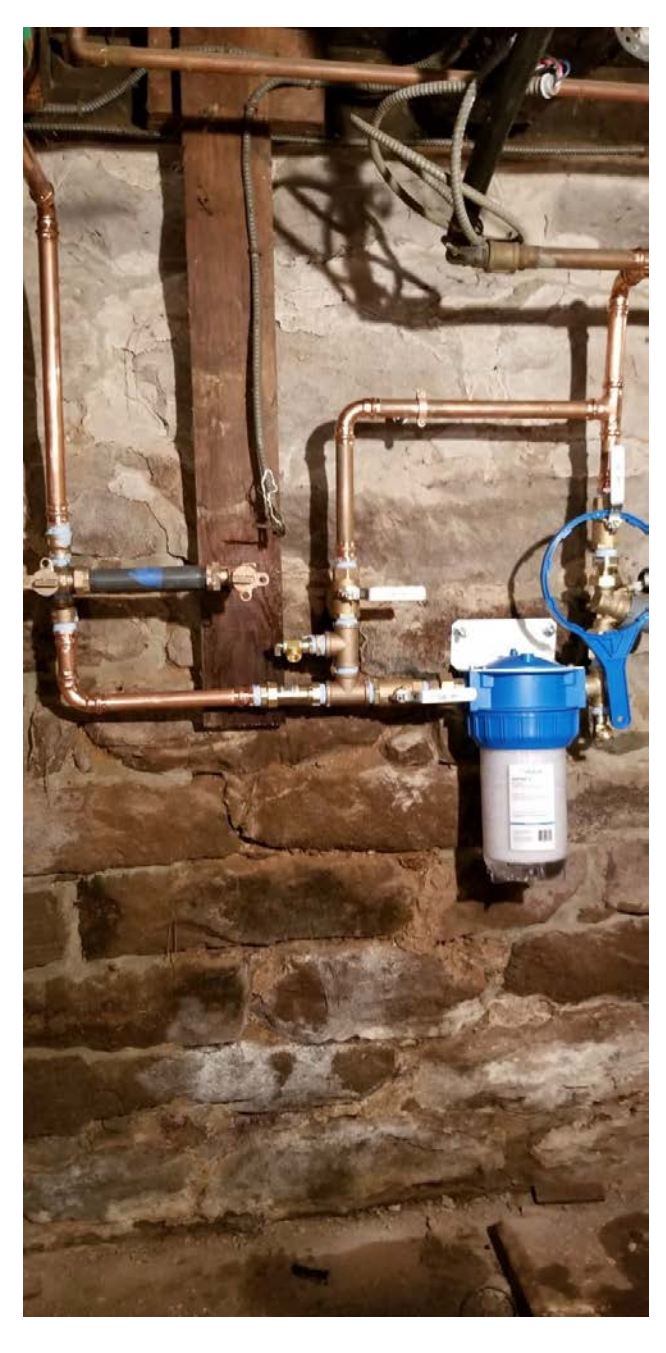
Picture 7: Final water service components that Fazzino Plumbing installed at the 110 Maple Avenue, Durham, residence.