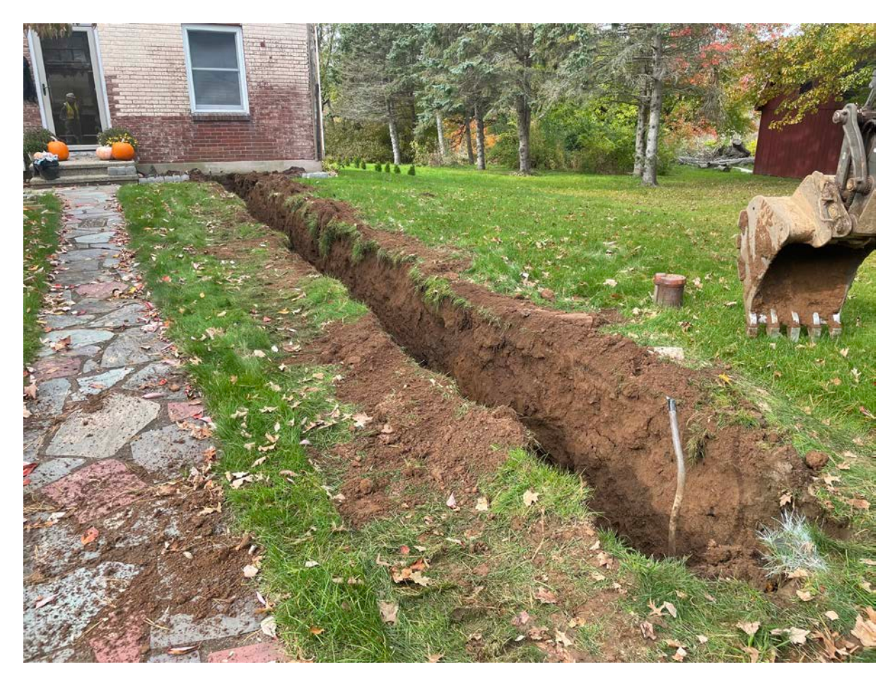
Picture 5: Trench that Ludlow has excavated at the 188 Maple Avenue residence for the installation of a 1" copper water service line. View to the west.