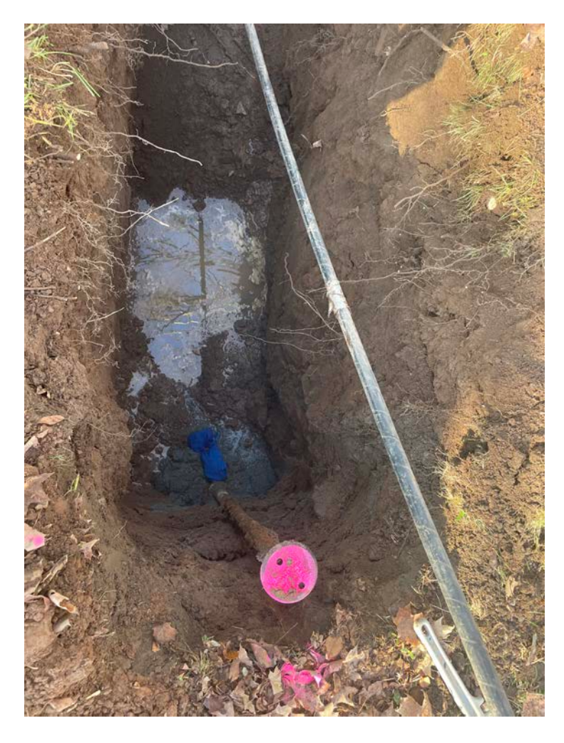
Picture 3: Water observed pooling at the east end of the trench that Ludlow has excavated at the 184 Maple Avenue residence for the installation of a 1" copper water service line.